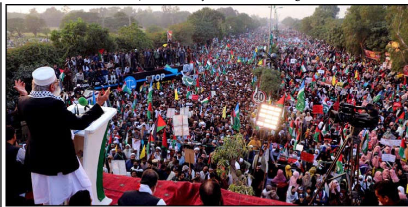
LAHORE: Ameer Jamaat-e-Islami Siraj-ul-Haq addressing the Gaza March in front of Punjab University.

However, further investigations were in progress till ours going to the press.