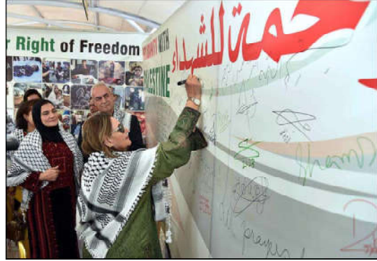
ISLAMABAD: First Lady Begum Samina Alvi visiting the Palestinian stall and expressing her condolences for the martyrs of Gaza, at Pakistan Foreign Office Women's Association's Annual Charity Bazar.

Marriyum Aurangzeb said that Pakistan Tehreek-e-Insaf (PTI) Chairman Imran Khan was imposed on the country through deliberate failure of the result transmission system (RTS) in the 2018 elections. "Today's youth must know what kind of game was played and the people had to bear the brunt of it," said the PML-N leader. She added that a game was played with the opposition and the system of the country. Pakistan, after a tumultuous five years, was approaching one of the most crucial general elections of its history, which are set to take place on February 8 next year. To a question about the recent statement of the Pakistan People's Party (PPP) Co-chairperson Asif Ali Zardari on elections, the PML-N leader said his statement about transparent elections was encouraging.