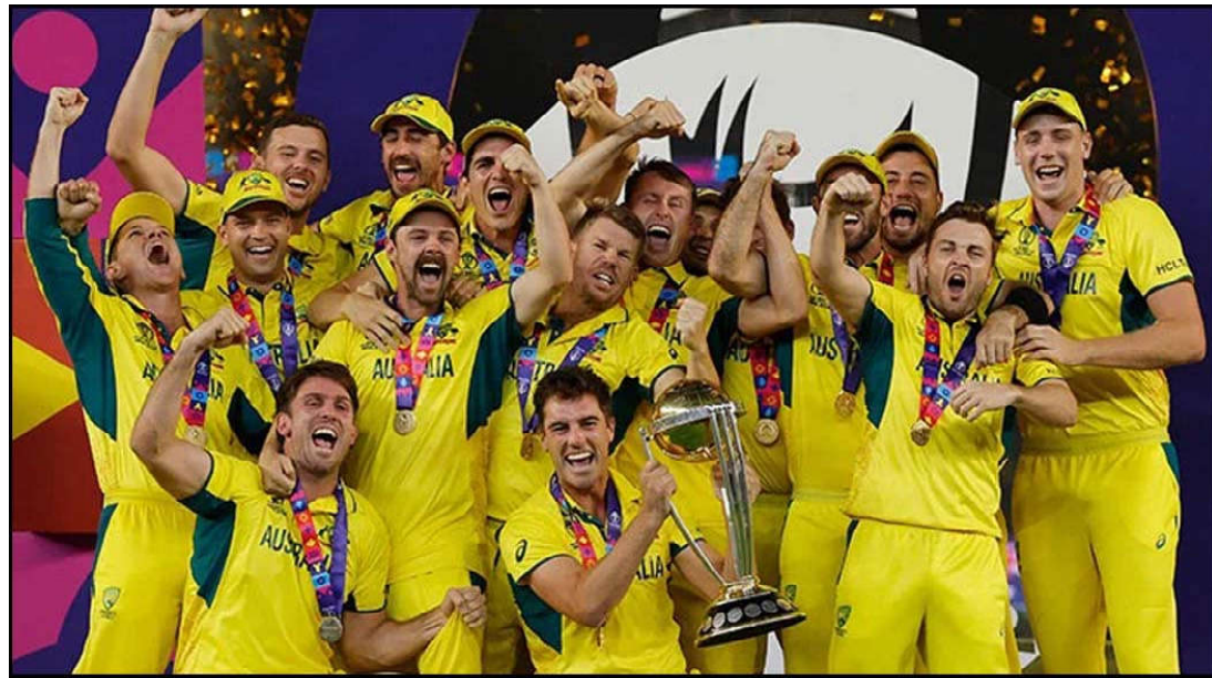
Australia's Pat Cummins celebrates with the trophy and teammates after winning the ICC Cricket World Cup.

Ph: 2841470/2841473 Vol: XVI No. 172, Jamadi-ul-Awwal 05, 1445 AH Monday November 20, 2023, Pages 08, Price Rs.15