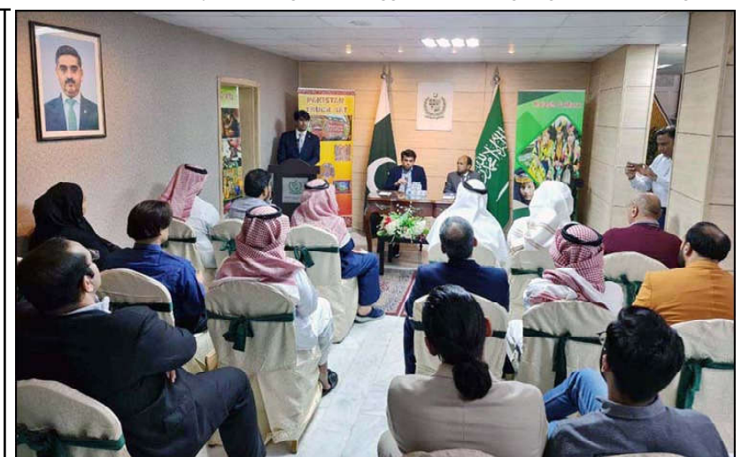
JEDDAH: Minister Overseas Pakistanis, Jawad Sohrab Malik meets with Pakistani Community, Saudi Employers and HRM Exec.