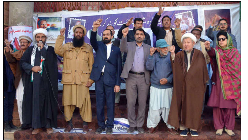
QUETTA: Former Speaker Balochistan Assembly Rahila Durrani and Allama Maqsood Ali Domki take part in a protest against Israeli aggression on Palestine organized by MWM at Quetta Press Club.

"We can create an economic market for a huge benefit for three billion people living in South Asia, China, Central Asia, and the Middle East through regional connectivity," he added. He said that therefore, programs like CPEC and BRI could help people eliminate poverty and unemployment and realize the dream of shared prosperity as well as people-to-people contact.