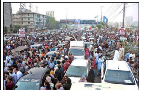
KARACHI: Parents of students waiting outside Expo Centre as the Medical and Dental College Admission Test (MDCAT) 2023-24 is being held.

He also directed the concerned high ups to set up a Centralized Monitoring Cell for the surveillance of those cameras and to put in place a mechanism for direct access of the Chief Minister, Chief Secretary and Inspector General of Police offices to those cameras via IP network. He underlined the need to initiate implementation of this project without any delay and directed the quarter concerned to immediately issue proper directives in written regarding installation of IPCs at all aforementioned offices. He was presiding over a meeting of the Board of Revenue held here at Chief Minister's House.