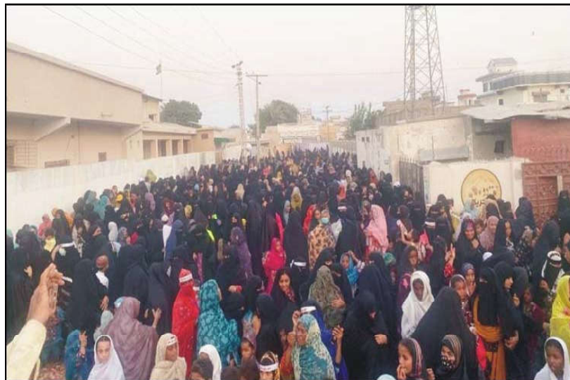
GWADAR: Women are participating in protest organized by Haq Do Theek.

Actually, the flight was a part of the British efforts to shift the Afghan refugees, again showing how propaganda works in the post-truth world with social media being the main tool for promoting lies and deception. Earlier, an old video of a dummy fighter jet set ablaze by supporters of the PTI chairman in May 2023 in Mianwali.