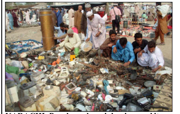
KARACHI: People are busy buying used items in a Sunday weekly bazaar at North Karachi area.