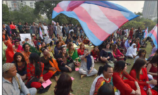
KARACHI: Member of the Trans community take part in Sindh Moorat March.

governance of the universities to solve the problems being faced by the universities. The chief minister asked to promote high standard of higher education based on the demand of market adding that priorities should also be given to quality of research work. He said the secondary and higher secondary education system should be aligned with the priorities of higher education institutions. For this purpose, the CM asked to hold consultation with the stakeholders.