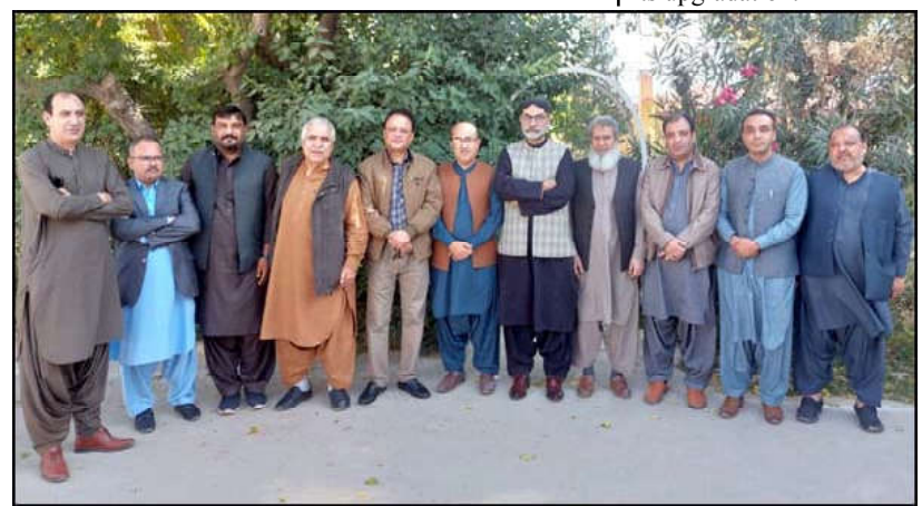
QUETTA: Renowned Politician and former Senator Nawabzada Haji Lashkari Raisani in a group photo with journalists of Balochistan.

He said that during the tenure of Bilawal Bhutto Zardari as Foreign Minister, a positive foreign policy was adopted and the positive image of Pakistan was brought before the world and to continue this process, it is necessary to make Bilawal Bhutto Zardari the Prime Minister.