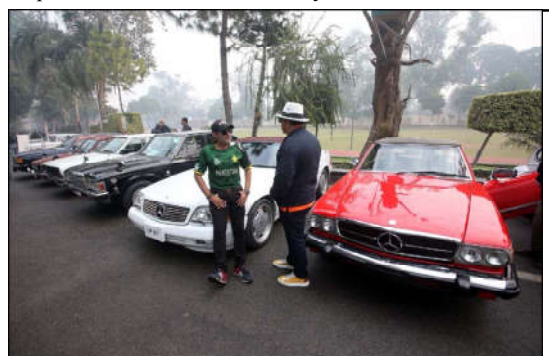
PESHAWAR: Visitors take keen interest in antique vehicles during Annual Vintage and Classic Car Show 2023 held at Services Club Pakistan in Peshawar.