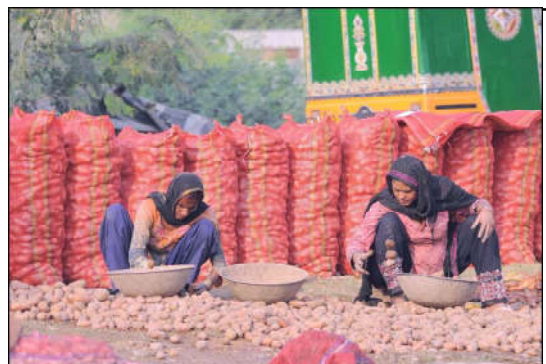
MULTAN: Women workers sorting potatoes at Vegetable Market.

Aside from strengthening power transmission, ADB's project will also enhance the project and financial management of NTDC, as well as its capacity to incorporate climate resilience in planning and operations. "To promote gender equality and women's involvement in the energy sector, ADB will develop guidelines for mentorships, conduct awareness campaigns, establish childcare centers, and provide technical training to female staff in the NTDC."