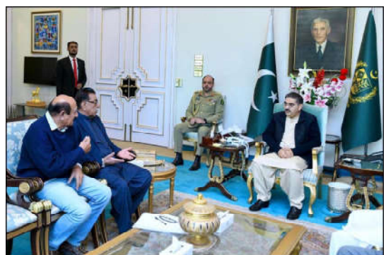
ISLAMABAD: A delegation of Gwadar Shipping Clearing Agents calls on Caretaker Prime Minister Anwaar-ul-Haq Kakar.

PM Kakar, in an interview with a private news channel (Sun News), also denied the impression that his cabinet member Fawad Hassan Fawad, had affiliation with a certain political party. "He is one of the best cabinet members and an able former bureaucrat. Due to his talent and abilities, he used to become a favorite choice of every ruling party during his service." He said Fawad was fully justifying his appointment as Minister for Privatization. The caretaker government would hope to succeed in achieving the set target of privatization of state-owned enterprises at its tenure due to his untiring efforts, he added.