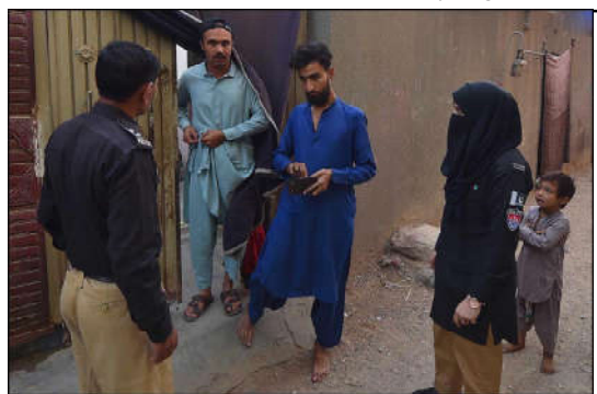
KARACHI: Police personnel knock at the door of Afghan refugees during a search operation to identify alleged illegal immigrants, on the outskirts of Karachi.