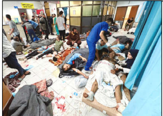
Palestinians wounded in Israeli strikes lie on the floor at the Indonesian hospital after Al Shifa hospital went out of service.

committed a war crime by housing "their headquarters, their military hidden under a hospital", he warned Israel to be "incredibly careful" of harming civilians during the operation. Israel's army claimed an initial raid in Al-Shifa had uncovered military equipment, weapons and what spokesman Daniel Hagari described as "an operational headquarters with comms equipment". A video narrated by another Israeli army spokesman showed rifles, ammunition and ammo magazines inside an area he identified as Al-Shifa's MRI scanner building.