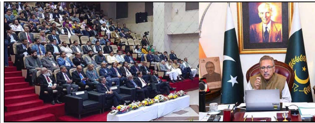
ISLAMABAD: President Dr Arif Alvi virtually addressing the 12th biennial conference of the Pakistan Society of Cardiovascular and Thoracic Surgeons held in Peshawar, from Aiwan-e-Sadr.

With the right use of vote, good and sincere leadership can be brought, while on the other hand, wrong people can also come to the assemblies with wrong use.