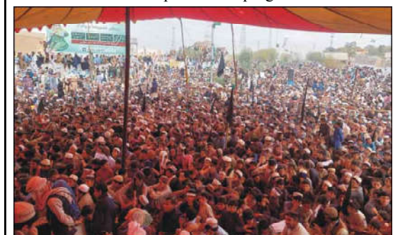
CHAMAN: Large numbers of children protesting in front of DC Complex against Passport Regime at Pak-Afghan border.