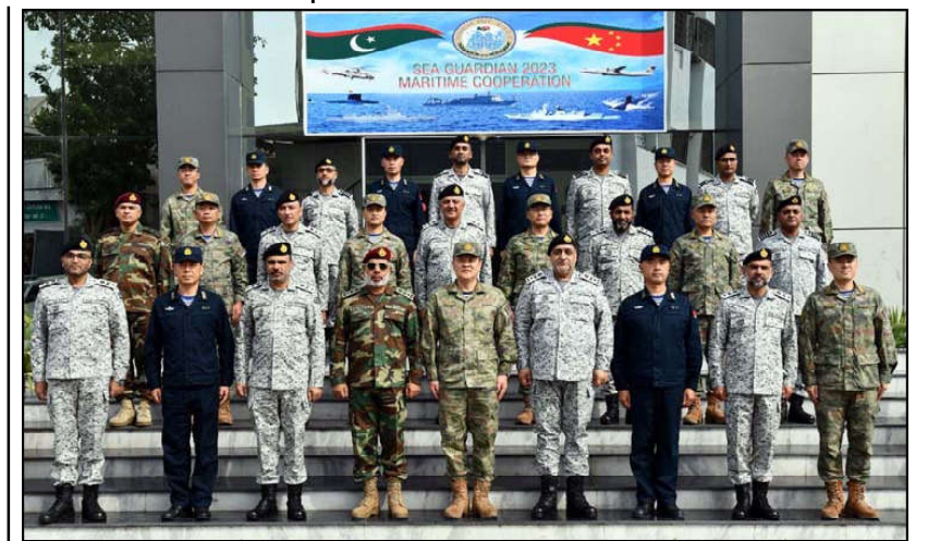
KARACHI: Group photo of Pakistan and Chinese Navy Senior Officials after closing ceremony of Bilateral Exercise Sea Guardian 2023 in Karachi.

He said that former President Asif Ali Zardari has restored the 1973 Constitution in its original form and granted identity to the people of Khyber Pakhtunkhwa through a constitutional amendment. He said the PPP Government had restored peace in Swat and resettled all TDPs in a record short time.