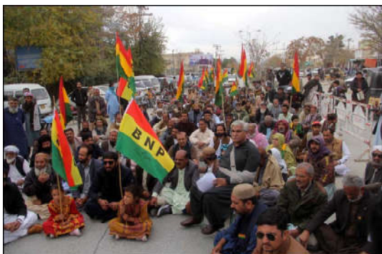
QUETTA: Activists of Balochistan National Party (BNP) are holding protest demonstration against low sui gas pressure, outside Sui Gas Office.

It may be mentioned here that the participants of dharna have also give call of Pak-Afghan road in Chaman from November 20, against the issue.