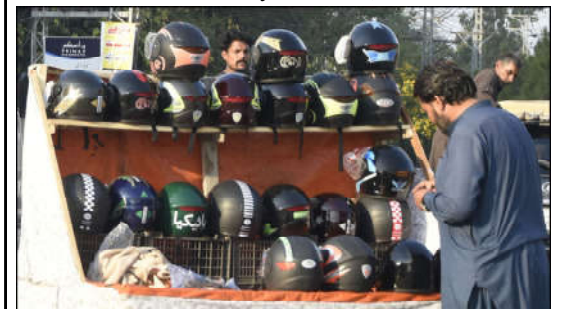
RAWALPINDI: A vendor is displayed motorcycle helmets on his pushcart along a Murree road in the city.

The BOI has also established an online database featuring 120+ projects, enabling international investors to target investment areas and projects. To foster international relations, Honorary Investment Counselors (HICs) have been appointed in different countries, aiming to encourage foreign investors to invest in Pakistan, he said.