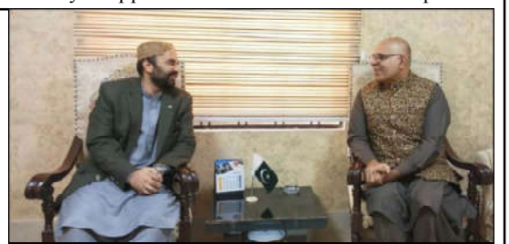
QUETTA: Caretaker Provincial Minister for Information Jan Achakzai in a meeting with Caretaker Provincial Home Minister Captain (retd) Muhammad Zuabir Khan Jamali.

QUETTA (APP): The Balochistan High Court on Friday declared the disqualification of former member of the provincial assembly Mohammad Khan Toor null and void and of no legal effects. The Election Commission of Pakistan disqualified the former MPA on 10th April 2019. The Chief Justice of Balochistan High Court Justice Naeem Akhtar Afghan and Justice Gul Hasan Tareen pronounced the verdict. The court annulled the disqualification of the petitioner under Article 62 (1) (F) of the constitution by ECP vice impugned order dated 10-04-2019 saying disqualification is null, void, and of no legal effects.