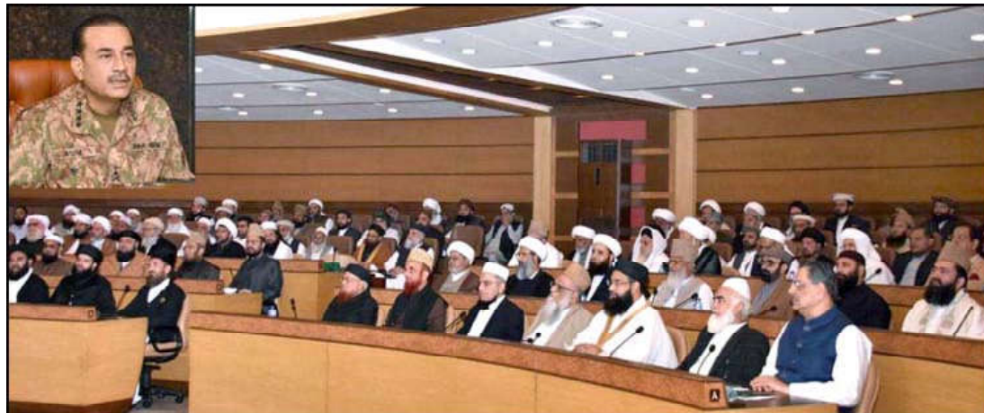
RAWALPINDI: Chief of Army Staff (COAS), General Syed Asim Munir, NI (M), addressing the leading Islamic Scholars (Ulema o Mashaikh) of all schools of thought, interacted at GHQ.