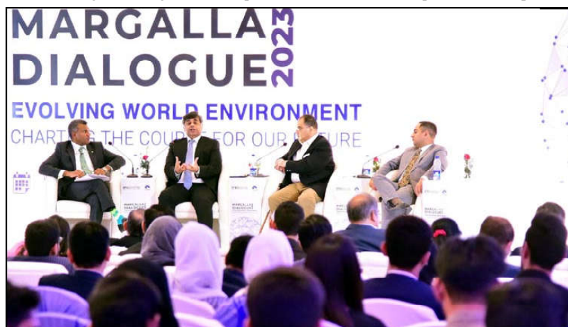
Caretaker Federal Minister for Commerce and Industry, Dr. Gohar Ejaz addressing the audience at the Margalla Dialogue 2023 in Islamabad.