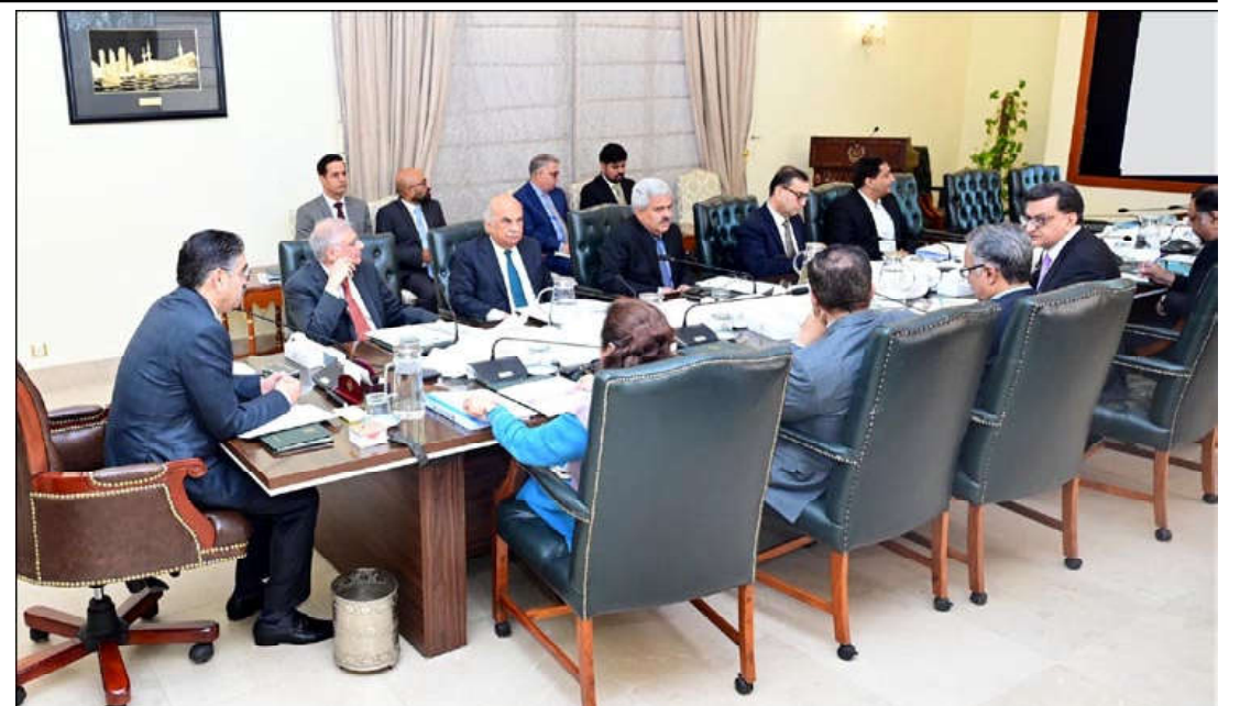
Caretaker Prime Minister Anwaar-ul-Haq Kakar chairs a meeting to discuss ML-1 Project in Islamabad.