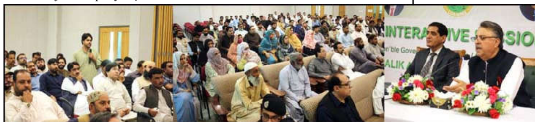
LASBELLA: Balochistan Governor Malik Abdul Wali Khan Kakar talking to participants regarding problems faced by teachers and students at Lasbela University.

"Locals of the area appreciated the operation and extended their full support to the security forces in the elimination of terrorism," it added. The terrorists' hideouts were also busted during the operation.