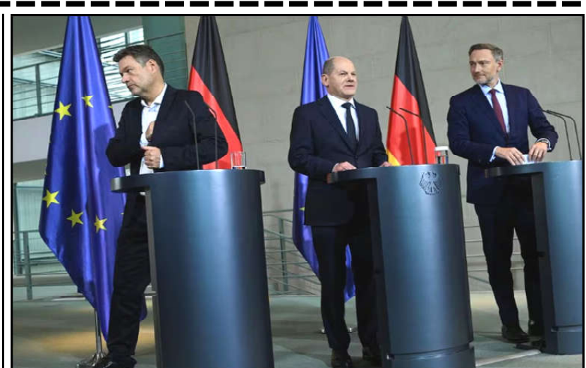
German Economy and Climate Minister Robert Habeck, Chancellor Olaf Scholz and Finance Minister Christian Lindner leave following their comments on the ruling of Germany's Constitutional court that the government's re-location of 60 billion euros ($65 billion USD) of unused debt from the pandemic era to climate fund was illegal, in Berlin, Germany.