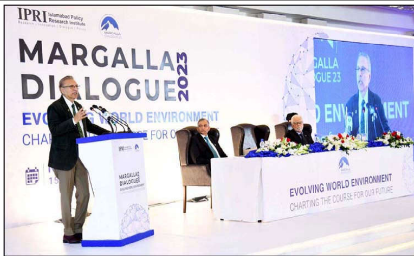
ISLAMABAD: President Dr Arif Alvi addressing the inaugural session of Margalla Dialogue.