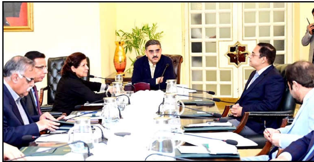
ISLAMABAD: The Caretaker Prime Minister Anwaar-ul-Haq Kakar chairs a meeting on the matters related to the Federal Board of Revenue.

Ph: 2841470/2841473 Vol: XVI No. 167, Rabi-us-Sani 29, 1445 AH Tuesday November 14, 2023, Pages 08, Price Rs.15