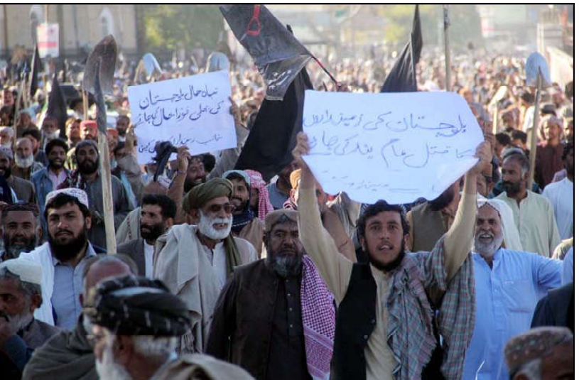
QUETTA: Members of Zamindar Action Committee are holding protest demonstration against prolong electricity load shedding and non-availability of water, held in Quetta.

Earlier, it was informed that the bid of trophy hunting for hunting of Suleman Markhor was done at Rs. 2 crore 45 lakh in the province.