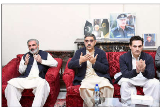
CHARSADDA: Caretaker Prime Minister Anwaar-ul-Haq Kakar offering Fatiha at the residence of late caretaker Chief Minister KP Azam Khan.

NAB took the plea Chaudhry Moonis Elahi has neither been arrested nor has he joined investigation. The court has issued non bailable arrest warrants of Chaudhry Moonis Elahi. The court should order to declare him proclaimed offender. The court declared Chaudhry Moonis Elahi proclaimed offender besides summoning record of his properties.