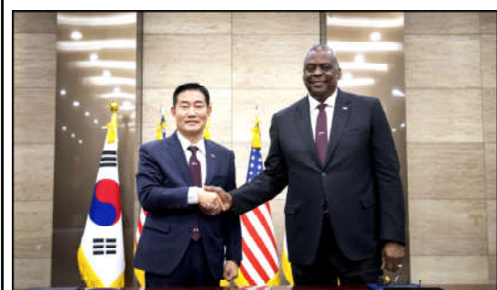
U.S. Secretary of Defense Lloyd Austin, right, and his South Korean counterpart Shin Won-sik shake hands for a photo during a signing ceremony of the 55th Security Consultative Meeting (SCM) at the defense ministry, in Seoul, South Korea.

Tensions between the Koreas are at their highest point in years as the pace of both North Korea's weapons tests and South Korea's combined military exercises with the United States have intensified in a cycle of tit-for-tat.