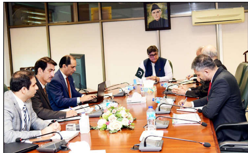
Caretaker Federal Minister for Privatisation Fawad Hassan Fawad chairs a meeting with management of HBFCCL.