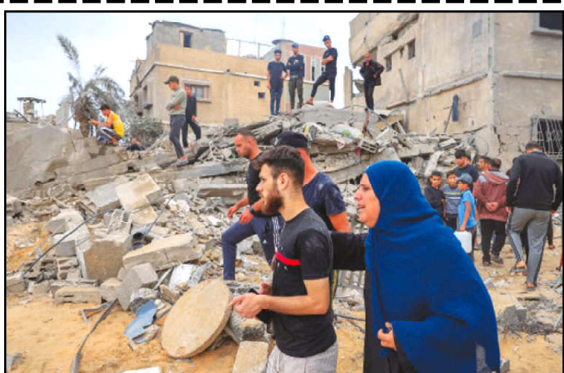
A Woman cries as she stands by the rubble of a destroyed building following Israeli bombardment in Khan Yunis in southern Gaza Strip.

"The goal here is to do what is necessary at the negotiating table to ensure that we get the safe return of all of the hostages, including the Americans," Sullivan told CNN, noting that nine Americans were missing, along with one person with permanent resident status in the United States.