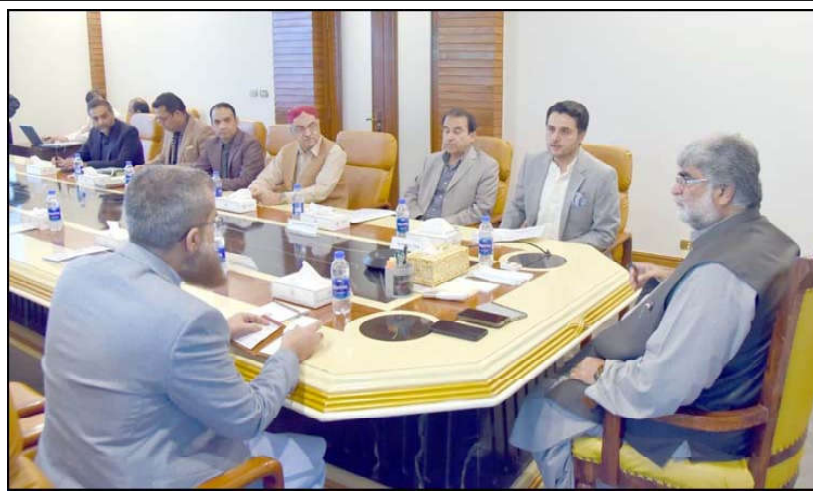
QUETTA: Caretaker Chief Minister Balochistan Mir Ali Mardan Khan Domki presiding over a high level meeting regarding environmental change and protection of forests and wildlife.

As regards the ongoing discussions on China's modernization, Ambassador Zaidong reiterated his nation's commitment to achieving the common prosperity of all Chinese citizens and improving the lives of ordinary people. Shifting focus to the China-Pakistan Economic