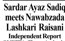
Sardar Ayaz Sadiq meets Nawabzada Lashkari Raisani

The welcoming billboards and hoardings have been placed for welcome reception of the PML-N leaders in different parts of the metropolis