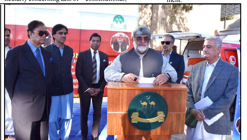
QUETTA: Caretaker Chief Minister Balochistan Mir Ali Mardan Khan Domki addressing a ceremony on eve of handing over of ambulances to Health Department from WHO