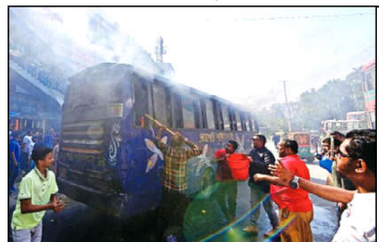
People try to douse a fire inside a bus allegedly torched by protesters during a nationwide transport blockade called by an opposition party, in Dhaka.