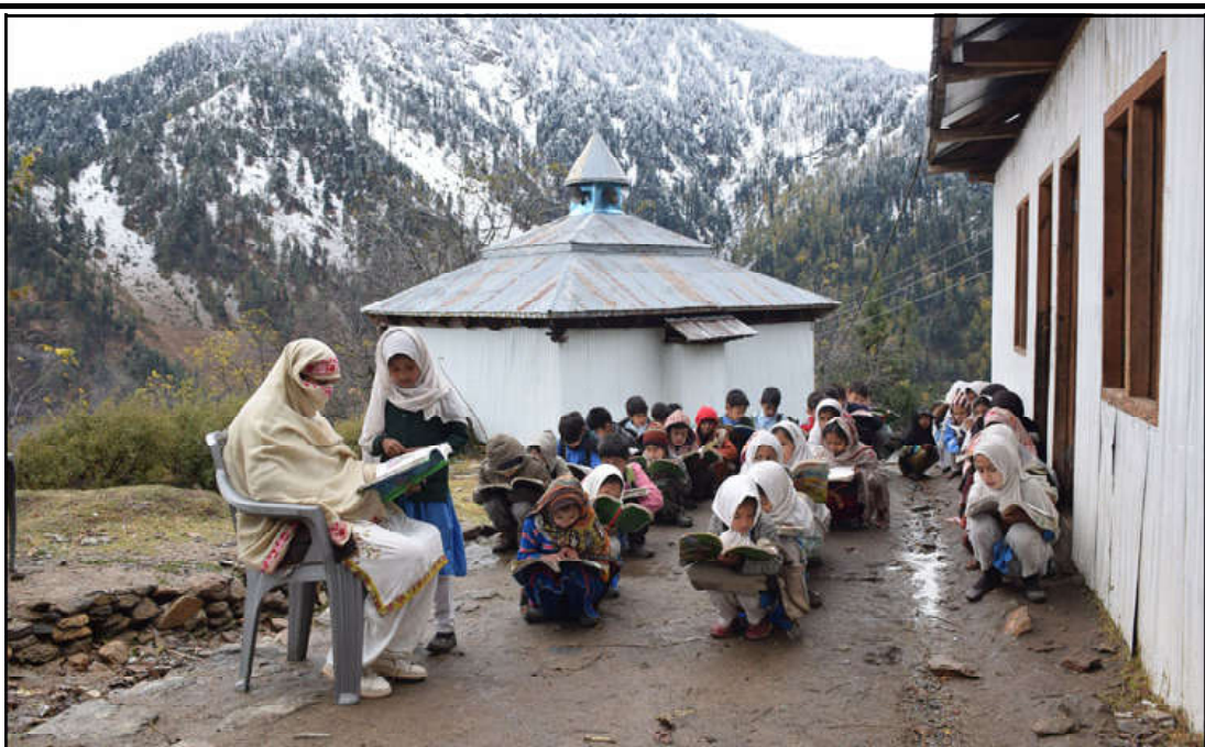
LEEPA VALLEY: Younger girls students are attending class at open air school during the extreme cold weather due to unavailability of school building of Government Girls Primary School Moji Chitya area of the Kashmir.