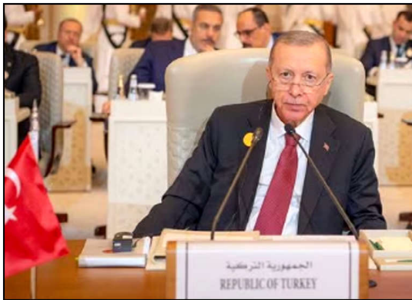
Turkey's President Tayyip Erdogan attends Organisation of Islamic Cooperation (OIC) summit in Riyadh, Saudi Arabia.