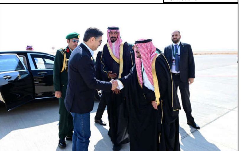
RIYADH: Caretaker Prime Minister, Anwaar-ul-Haq Kakar being seen off by high diplomatic officials of Pakistan and Saudi Arabia after completing his three day official visit of Kingdom of Saudi Arabia

During his visit, the prime minister addressed the summit besides, held meetings with the Arab and Islamic countries leaders on the sidelines of the main event.