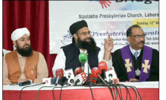
LAHORE: Chairman Pakistan Ulema Council Maulana Tahir Ashrafi addressing a press conference Naulakha Presbyterian Church in Provincial Capital.