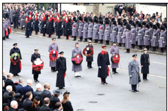
Britain's King Charles III, William, Prince of Wales, Prince Edward, Duke of Edinburgh, and Anne, Princess Royal, attend the National Service of Remembrance at The Cenotaph in Whitehall in London, Britain.

52 days," said the head of the Kyiv city military administration Sergiy Popko. AFP journalists in central Kyiv had heard two strong explosions and saw trails in the sky at dawn. Air sirens sounded soon after that. The air force said it destroyed a missile approaching Kyiv — either an Iskander ballistic missile or an S-400 anti-aircraft missile — without reporting casualties. Air defences last downed a missile in Kyiv on September 21. The falling debris wounded seven people, including a child.