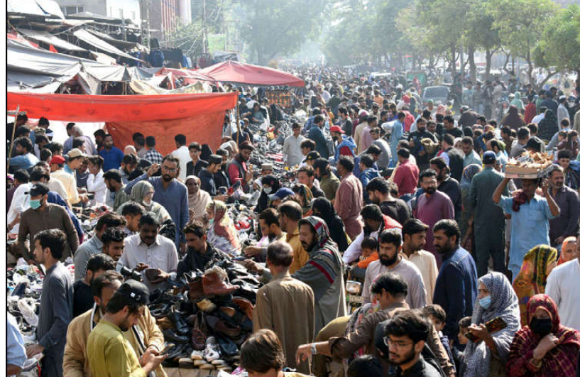
LAHORE: A large numbers of people is busy in buying shoes and warm clothes in a Landa Bazaar at Haji Camp in Provincial Capital.