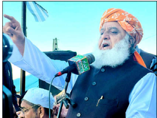
MURREE: Amir Jamiat Ulema Islam Maulana Fazlur Rehman addressing Tofan Al-Aqsa Conference