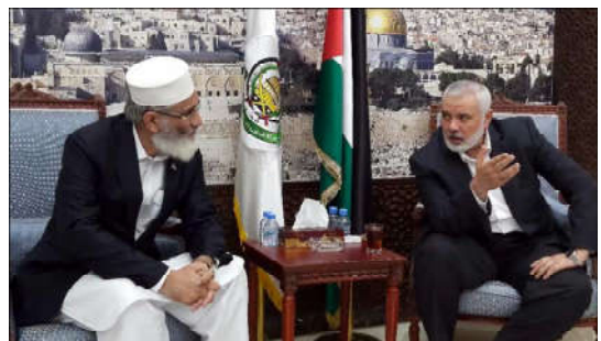
DOHA: Amir Jamaat-e-Islami Sirajul Haque meeting with Chief of Hamas Ismail Hania