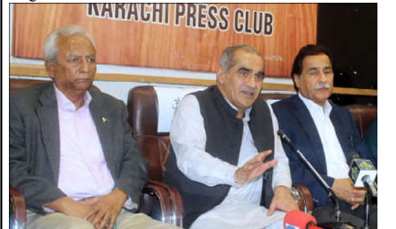
KARACHI: Former Federal Minister and PML-N leader Khawaja Saad Rafiq addressing a press conference at the Karachi Press Club.

KARACHI (APP): Former President Asif Ali Zardari and Chairman of Pakistan Peoples Party (PPP) Bilawal Bhutto Zardari have extended their heartfelt greetings to Pakistan's Hindu community on 'Diwali', the festival of lights, and expressed their best wishes for them. The former President and PPP Chairman, in their separate messages on the occasion of Diwali, said that this festival was a symbol of light and joy as well as a message of victory of light over darkness and good over evil. They said that PPP believed in inter-faith tolerance and harmony as well as brotherhood and unity. Equal rights had been given to minorities in the Constitution-1973 given by the former Prime Minister Shaheed Zulfikar Ali Bhutto.