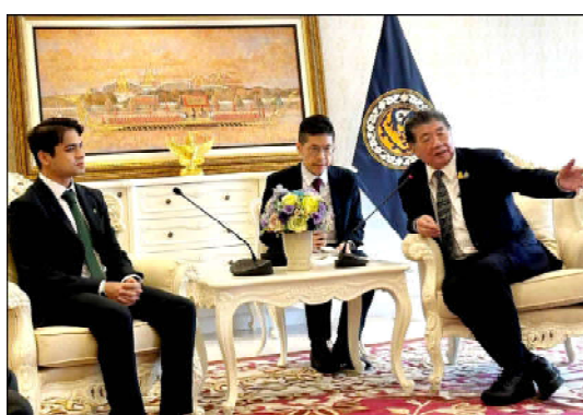
Caretaker Minister for Sports and Culture Balochistan Nawabzada Mir Jamal Khan Raisani meeting with Deputy Prime Minister and Commerce Minister of Thailand Phumtham Wechayachai

According to the schedule, provincial team would compete with the Thai League team.