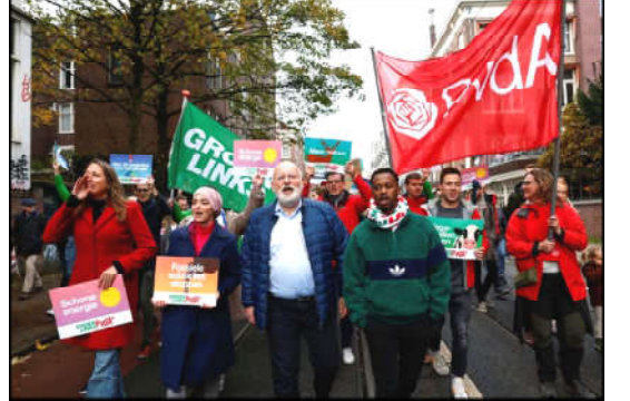
The leading candidate of the Dutch Labour Party, Frans Timmermans attends The March for Climate and Justice to demand political change before the elections in Amsterdam, Netherlands.

Monitoring Desk LONDON: British lawmakers and members of the upper house of parliament have called on the government to proscribe Iran's Revolutionary Guard Corps as a terrorist organisation, saying it would be a step towards restoring stability to the Middle East. Proscribing the IRGC as a terrorist group would mean it would become a criminal offence in Britain to belong to the group.