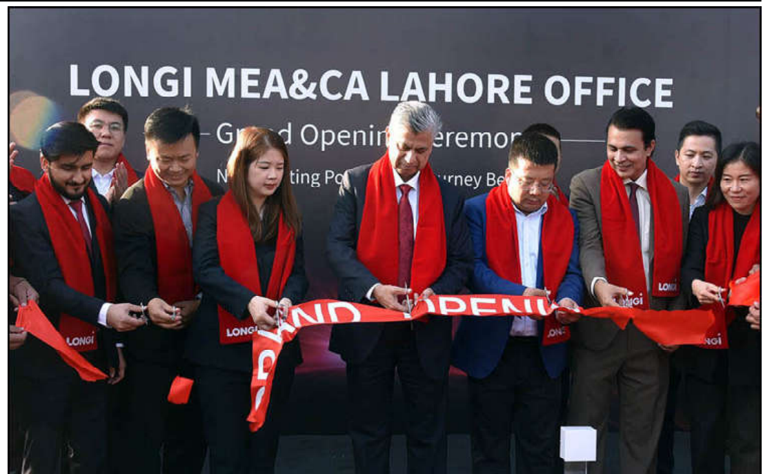
LAHORE: Caretaker Federal Minister for Information and Broadcasting Murtaza Solangi is cutting the ribbon to inaugurate Longi Solar's at Gulberg.

He said officers and staff have suffered at the hands of the little mafias and they were thrashed, injured, made hostage and fired upon.