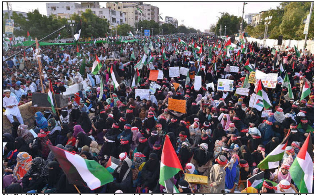
KARACHI: A large number of people participating in the solidarity conference for the people of Palestine organized by Pakistan Markazi Muslim League at Shahra e Quaid.