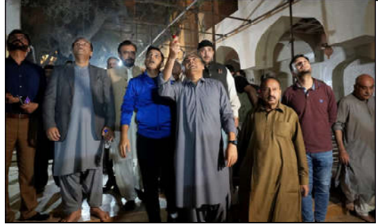
LAHORE: Punjab Caretaker Chief Minister Mohsin Naqvi reviews progress being made on the renovation and extension of the project during his visit Mazar Bibi Pak Daman.

accused in the last 10 months against whom strict legal action was taken. The App was launched to provide immediate help to women in which various links including Cyber Crime, Rescue, National Highway, Motorway and other helpline numbers had also been provided. The App also allows its users to review different public locations in terms of safety, an official said adding that green pins indicate the location was safe for women, orange means the area was partially secure.