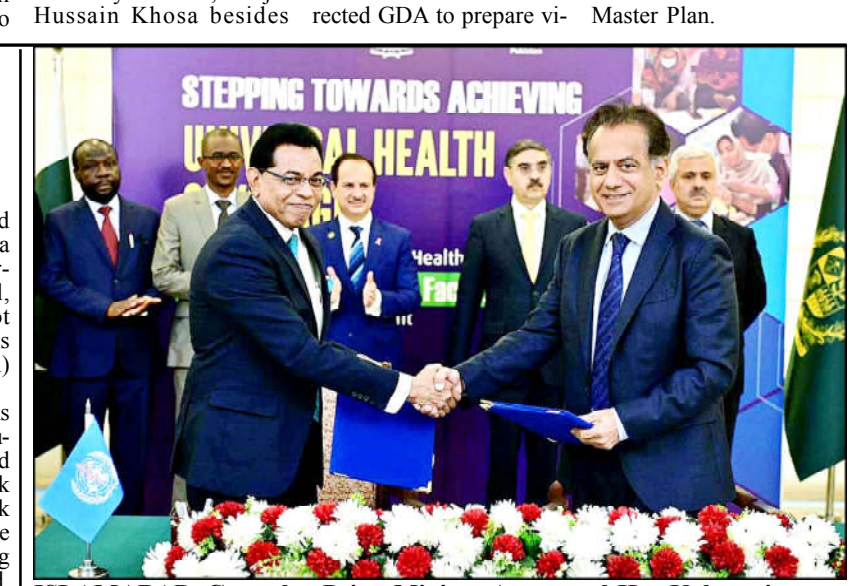
ISLAMABAD: Caretaker Prime Minister Anwaar-ul-Haq Kakar witnesses a ceremony of the signing of letters of understanding between WHO and the Government of Pakistan on Universal Healthcare

We will have to work Future of PML-N is for integrity and restoration bright. Decision about of national economy so that party tickets will be made country could regain its lost on merit. I salute those who stature. "I salute to tigers of PP-143, he added. stood with party in hard time. There is no room for INP adds: PML-N opportunists in the party, supremo and former prime he said this to possible canminister Nawaz Sharif ardidate of PML-N Khan rived at party's secretariat Jahanzeb Khan from PPP in Model Town on Mon-143 Sheikhupura who met day morning after more