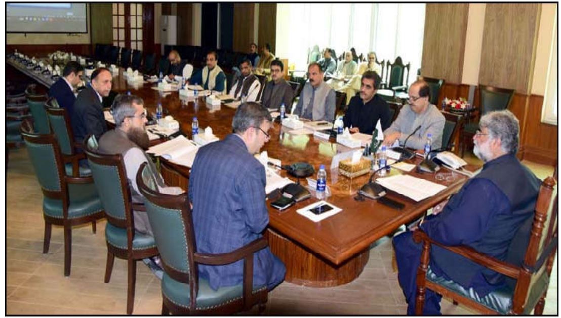
QUETTA: Caretaker Chief Minister Balochistan and Chairman Gwadar Development Authority Mir Ali Mardan Khan Domki presiding over meeting of 27<sup>th</sup> Governor Body of GDA.

Ph: 2841470/2841473 Vol: XVI No. 161, Rabi-us-Sani 22, 1445 AH Tuesday November 07, 2023, Pages 08, Price Rs.15