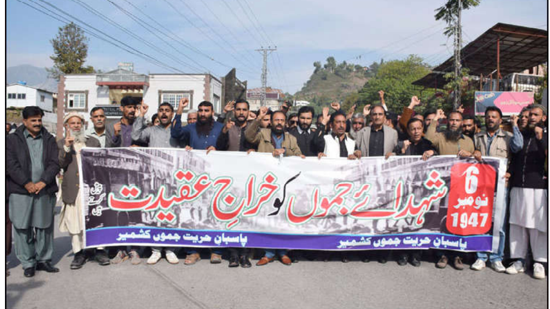
MUZAFFERABAD: Speaker Lagestaltive Assembly of AJK Chaudhry Latif Akbar participate in the rally of Pasban-e-Hurrivat to mark the "Youm-e-Suhada" in the Capital of AJK.