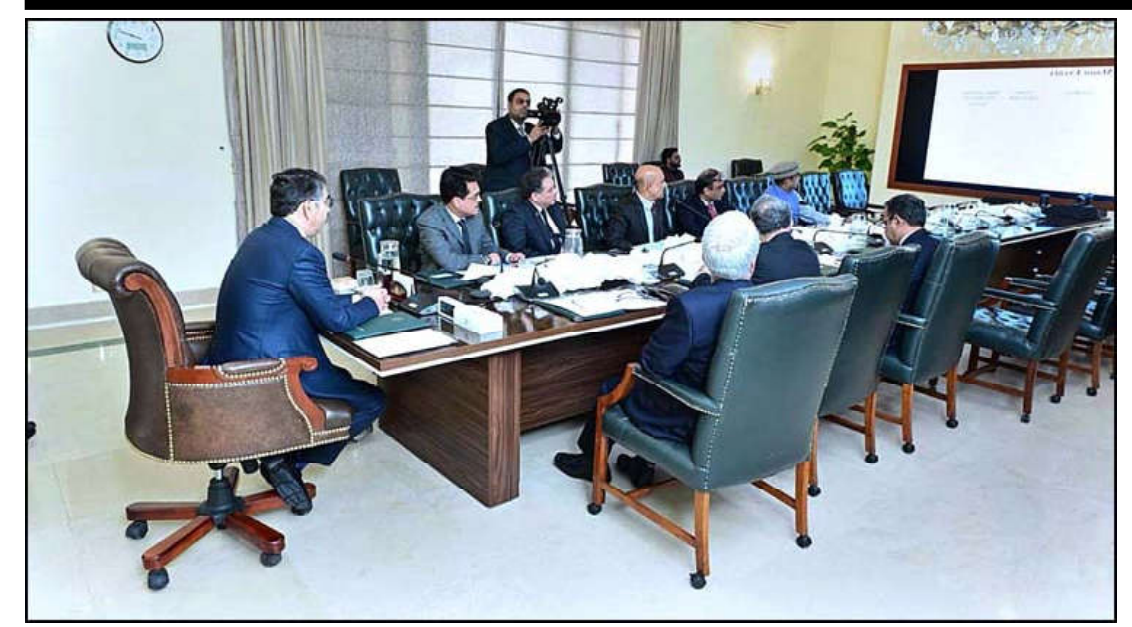
ISLAMABAD: Caretaker Prime Minister Anwaar-ul-Haq Kakar chairs a meeting to review Visa process and facilities given to Sikh Pilgrims.