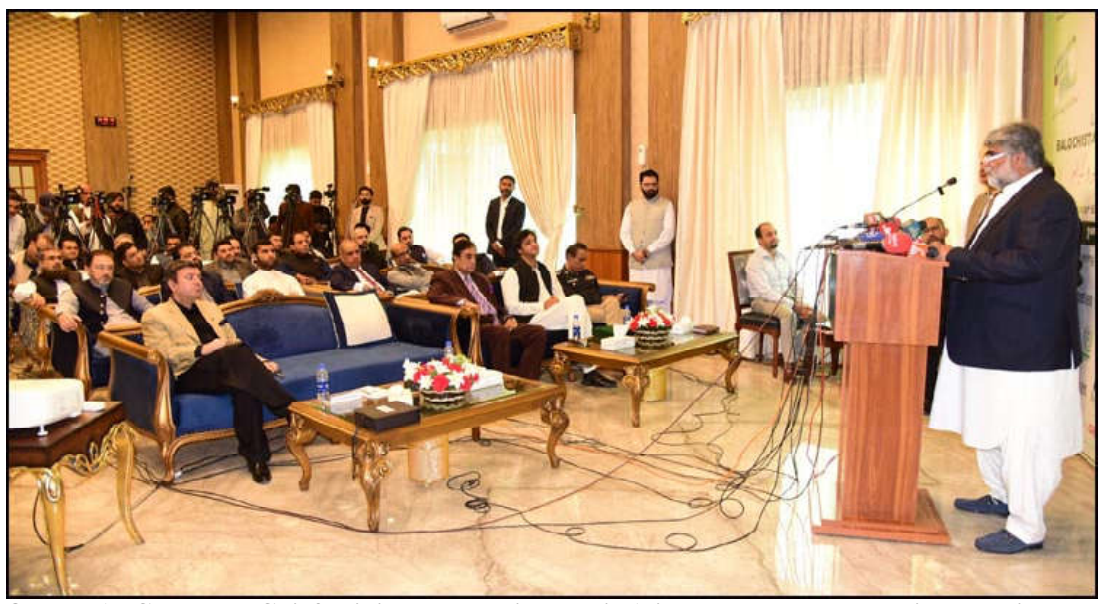
QUETTA: Caretaker Chief Minister Balochistan Mir Ali Mardan Khan Domki addressing the national identity cards Balochistan Health Card launching ceremony.

Ph: 2841470/2841473 Vol: XVI No. 159, Rabi-us-Sani 19, 1445 AH Saturday November 04, 2023, Pages 08, Price Rs.15