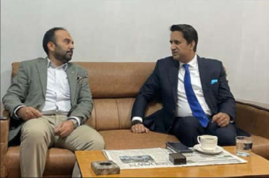
QUETTA: Commissioner Quetta Division Hamza Shafqaat meeting with Caretaker Provincial Home Minister Capt (retd) Muhammad Zubair Jamali.