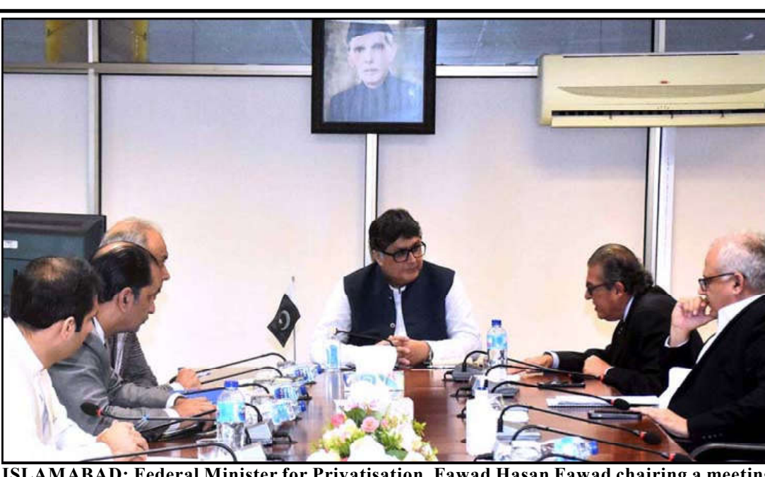
strategic ISLAMABAD: Federal Minister for Privatisation, Fawad Hasan Fawad chairing a meeting with FA on FWBL.