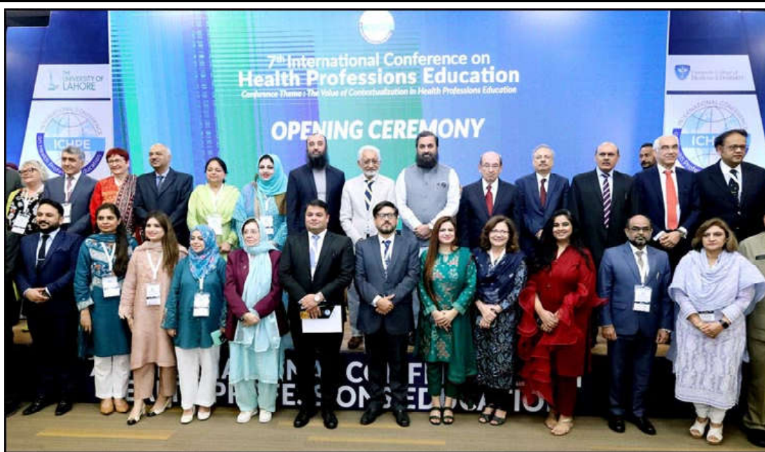
LAHORE: Governor Punjab Muhammad Balighur Rehman in a group photo with participants of 7th International Health Professions Education Conference at University of Lahore.