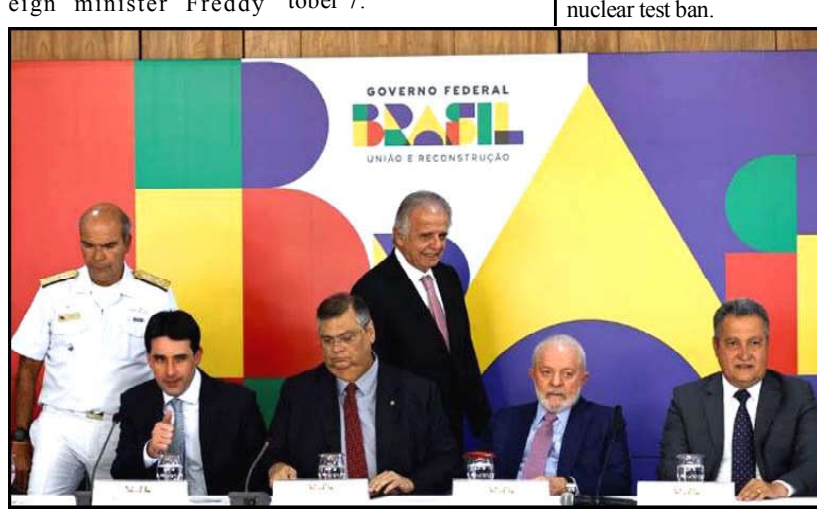
Brazil's president Luiz Inacio Lula da Silva looks on during a press conference at the Planalto Palace in Brasilia, Brazil.

Gaza's border with Egypt — the only exit point apart from the closed border crossings with Israel — has largely been shut since Oct 7, although several hundred foreign nationals and a small number of injured Palestinians, to be treated in Egyptian hospitals, have crossed into Egypt since Wednesday. Qatar brokered that deal to allow some people to leave Gaza, and a diplomatic source has said some 7,500 foreign passport holders would leave Gaza over the course of about two weeks.