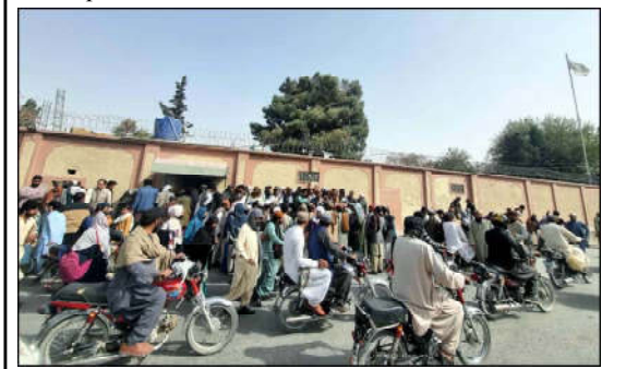
QUETTA: Afghan families gather at Afghan Consulate to register themselves for returning to their homeland, in Quetta.

He also directed them to maintain the environment of trust between police and public.