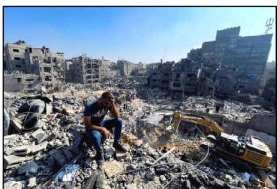
A man reacts as Palestinians search for casualties a day after Israeli strikes on houses in Jabalia refugee camp in the northern Gaza Strip.

the region's countries," Fidan said. The Iranian foreign minister "shared with us that there are strong indications that other armed elements in the region may intervene in the conflict if conditions do not change", Fidan said. "A ceasefire and peace have become more essential," Amir-Abdollahian said a peace conference involving "Muslim and Arab" countries should be held "as soon as possible". Iran's supreme leader Ayatollah Ali Khamenei urged Muslim countries to halt trade with Israel, including oil exports, in response to its bombardment of Gaza.