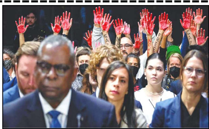
WASHINGTON: US Secretary of Defence Lloyd Austin testifies as protesters calling for a ceasefire in Gaza raise their hands, painted in red, during a Senate Appropriations Committee hearing with Secretary of State Antony Blinken and Austin.

The protesters also said they attended the hearing to denounce the Biden administration's support for "genocide" against Palestinians in Gaza. Secretary Blinken did not respond to the protesters, but when he was asked later about the possibility of a ceasefire, he said that would only help Hamas regroup. A pause, however, for humanitarian reasons can be considered, he added. Also on Tuesday, a prominent Jewish intellectual and New York Times columnist Thomas Friedman wrote in his column, "Israel, it's time to consider a ceasefire".