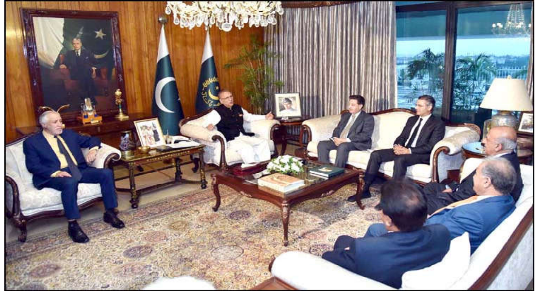
ISLAMABAD: President, Dr. Arif Alvi exchanging views with Sikandar Sultan Raja, Chief Election Commissioner of Pakistan along with the Mansoor Usman Awan, Attorney General for Pakistan and four members of the Election Commission of Pakistan during meeting held at Aiwan-e-Sadr.

general elections by Friday after the consultation with the President. The court instructed the Attorney General of Pakistan to arrange the meeting of ECP officials with the President on the same day. The court said that it expected that all issues would be addressed by this meeting. It directed the respondents to inform the bench on Friday regarding the development and adjourned the case. A three-member bench of the top court headed by Chief Justice of Pakistan Qazi Faez Isa and comprising Justice Amin Ud Din Khan and Justice Athar Minallah heard.