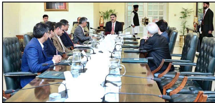
ISLAMABAD: A delegation of the Pakistan Broadcasters' Association called on caretaker Prime Minister Anwaar-ul-Haq Kakar.