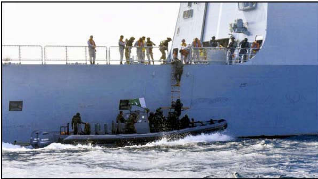
KARACHI: Pakistan Navy Special Service Group and Qatari Naval Special Forces demonstrating Counter Piracy Operation during Joint Naval Exercise MUHARIB AL-BAHR VI, held in Karachi.