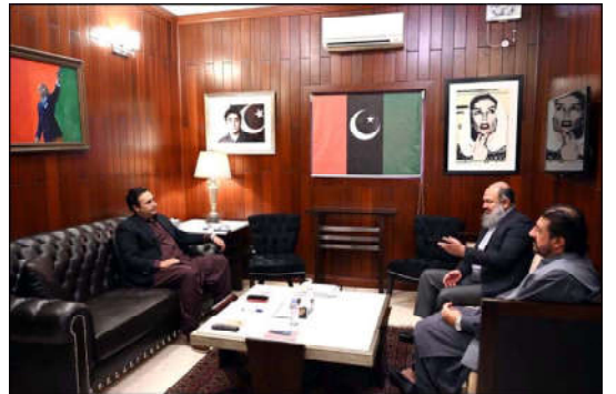
KARACHI: Peoples Party (PPP) Chairman, Bilawal Bhutto Zardari exchanges views with Former Chief Minister of Balochistan Jam Kamal Khan during meeting held at Bilawal House.

Senator Syed underscored the strong solidarity between Pakistan and Palestine, drawing attention to the deep-rooted historical connections between the two nations. Senator Syed emphasized the importance of recognizing legitimate Palestinian political organization, Hamas, and its significant role in representing the Palestinian people. Referring to Israel's recent bombardment of hospitals in Gaza, Senator Syed condemned these actions as war crimes and called for an immediate cessation of such heinous acts. He recounted the historic Lahore gathering of March 23, 1940, which saw the passing of two seminal resolutions—the first emphasizing the self-determination of Muslims.