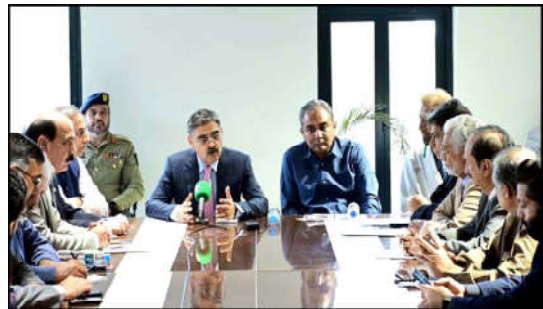
LAHORE: Caretaker Prime Minister, Anwaar-ul-Haq Kakar addresses to media persons during press conference, at Mayo Hospital in Lahore.

He stressed that the system of joint intelligence would have to be more coordinated to reach out to the elements involved in the incident and their facilitators.