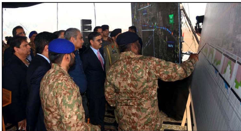
LAHORE: Caretaker Prime Minister, Anwar-ul-Haq Kakar receives briefing regarding the construction of the southern portion (SL-3) of Lahore Ring Road, in Lahore.

He appreciated the Punjab Government's program for reconstruction and rehabilitation of hospitals under Caretaker Chief Minister Mohsin Naqvi.