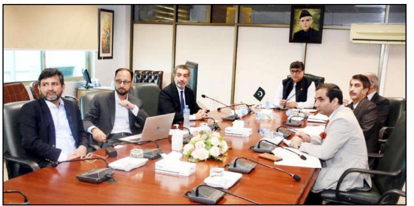
Caretaker Minister for Privatization, Fawad Hasan Fawad holds a stakeholder meeting for privatization of HBFL in Islamabad.

During Q1 FY2024, the strong revenue performance led to a primary surplus of Rs 417bn (0.4% of GDP) against the target of Rs 87bn under the IMF Standby agreement (SBA). FBR revenues clocked in at Rs 2,042bn compared to the target of Rs 1,978bn during Q1, with a strong 37% y/y increase in direct taxes.