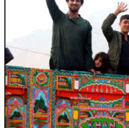
LANDIKOTAL: A large numbers of unregistered Afghan refugees families are willingly enroute their homeland with their homes necessities after the government of Pakistan decided in the apex committee meeting to return all those Afghans who are living in Pakistan unlawfully, at Machni area in Landikotal.