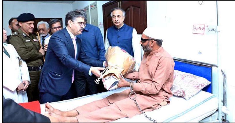
LAHORE: Caretaker Prime Minister Anwaar-ul-Haq Kakar visits patients who received free eye surgery from the government, in Mayo Hospital.