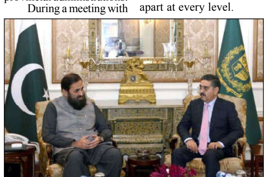
LAHORE: Caretaker Prime Minister, Anwar-ul-Haq Kakar exchanging views with Muhammad Ballegh-Ur-Rahman, Governor Punjab during meeting held in Lahore.

Under Mohsin Naqvi's leadership, progress is not only being made in Punjab, but it is also evidently visible. The chief minister's exceptional capacity to deliver results sets him apart at every level.