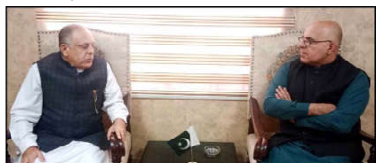
QUETTA: Provincial President Pakistan Peoples Party Mir Changez Khan Jamali meeting with Caretaker Provincial Minister for Information Jan Achakzai

Sadiq Sanjrani warmly welcomed the Rwandan delegation and expressed Pakistan's strong dedication to nurturing its bilateral relationship with Rwanda.