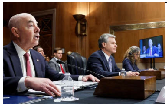
U.S. Homeland Security Secretary Alejandro Mayorkas testifies next to FBI Director Christopher Wray and National Counterterrorism Center Director Christine Abizaid during a Senate Homeland Security and Governmental Affairs hearing on threats to the United States, on Capitol Hill in Washington, U.S.

Prime Minister Anthony Albanese called the fires "devastating" in a visit to the state on Tuesday and said the federal government would provide extra support to deal with what it estimates will be at least 42,000 claims for assistance as a result of the destruction.