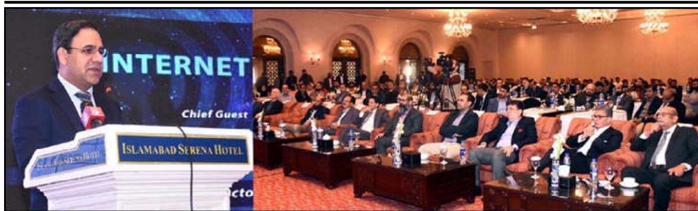
Caretaker Federal Minister for IT and Telecommunication Dr. Umar Saif addressing event titled "Internet Governance in Pakistan" in Islamabad.