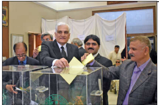
LAHORE: Former Federal Minister Zahid Hamid is casting the vote during the annual election of Supreme Court Bar Election, in Provincial Capital.