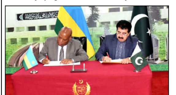
ISLAMABAD: Chairman Senate, Muhammad Sadiq Sanjrani and Dr. Kalinda Francois-Xavier, President of the Senate of Republic of Rwanda signing a memorandum of understanding (MOU), at Parliament House in Islamabad.

The prime minister assured that the interim set-up was ready to assist the ECP in the process.