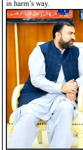
ISLAMABAD: Caretaker Federal Minister for Interior, Sarfraz Ahmed Bugti exchanging views with Jane Marriott, British High Commissioner during meeting held in Islamabad.

The Ambassador highlighted the two countries' mutual interest in ensuring the safety and security of refugees and asylum seekers, and the importance of putting in place appropriate screening mechanisms so that individuals with legitimate claims of credible fear are not placed in harm's way.