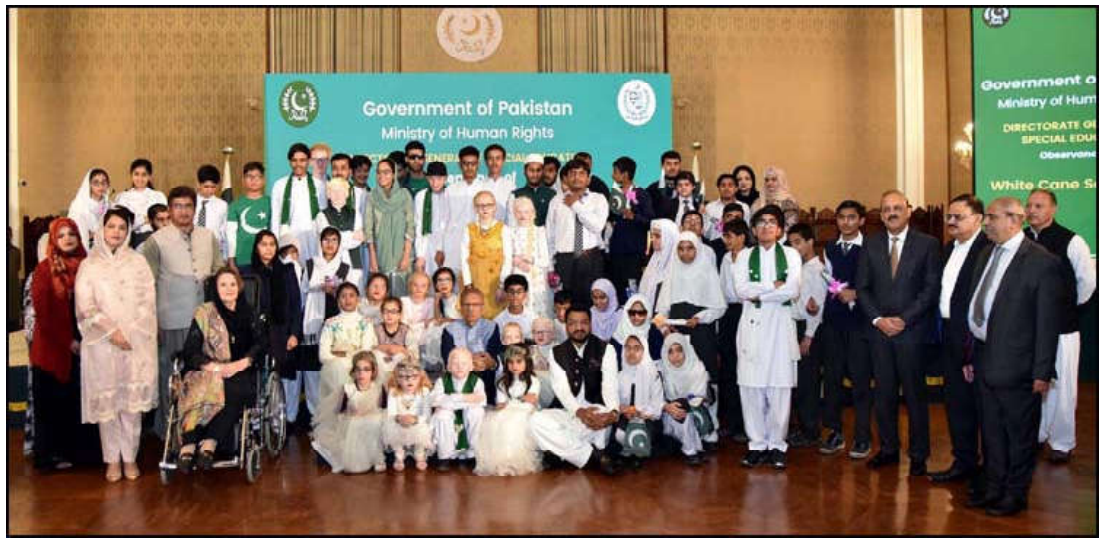
ISLAMABAD: President, Dr. Arif Alvi and Begum Samina Alvi in a group photo along with visually impaired persons during a ceremony in connection with White Cane Safety Day held at Aiwan-e-Sadr in Islamabad.

"Pakistan and China are intertwined. Though two different countries, but one nation moving in the same direction," he said.