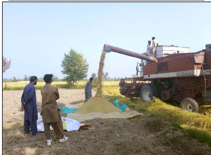
LAHORE: Heavy machinery is being used for harvesting rice crop in the field.

FESCO had also got cases registered against 3155 accused whereas the police had arrested 2636 electricity thieves so far, he added. Giving further details, he said that the FESCO teams continued checking of power pilferage round the clock and caught 28 electricity thieves during last 24 hours who were stealing electricity through various modes including direct supply. The company had imposed a fine of more than Rs.2.278 million on these electricity thieves in respect of more than 48,000 detection units. He said that in Faisalabad district, up till now, 1071 electricity thieves were caught and handed down with a fine of more than Rs.134.4 million under 2.879 million detection units.