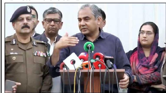
LAHORE: Caretaker Chief Minister Punjab Mohsin Naqvi talk to media person.

Shah Kakakhel, to extend heartfelt appreciation to the Khyber Pakhtunkhwa government and its people for their resolute support of the oppressed Kashmiri population. During the meeting, Minister Kakakhel delivered a poignant message, emphasizing the profound pain felt on October 27 as he stated, "Our hearts shed tears of blood for the sufferings endured by our Kashmiri brothers and sisters. The atrocities they face, one day, we believe that the government of India will have to reckon with them, and Kashmir will find its rightful place within Pakistan."