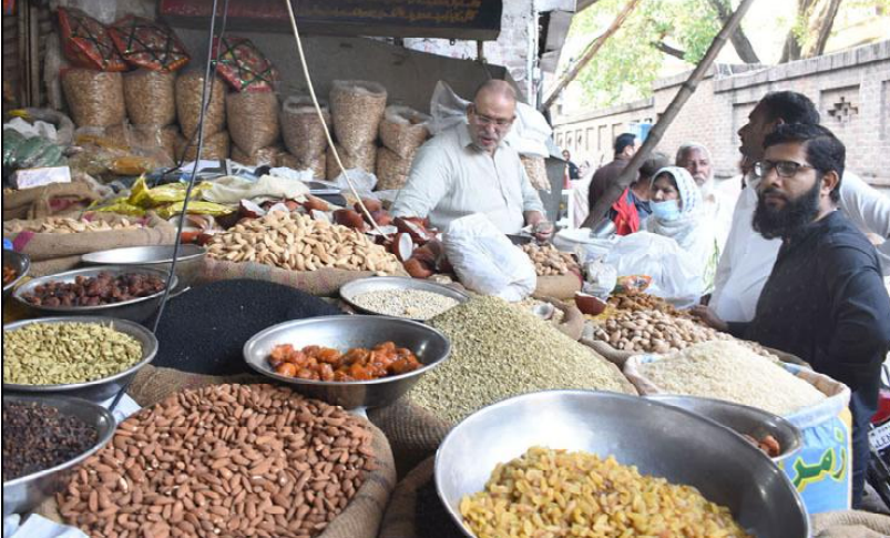
LAHORE: People are buying dry fruits from shop at Akbari mandi as people like such things especially during winters in Provincial Capital.