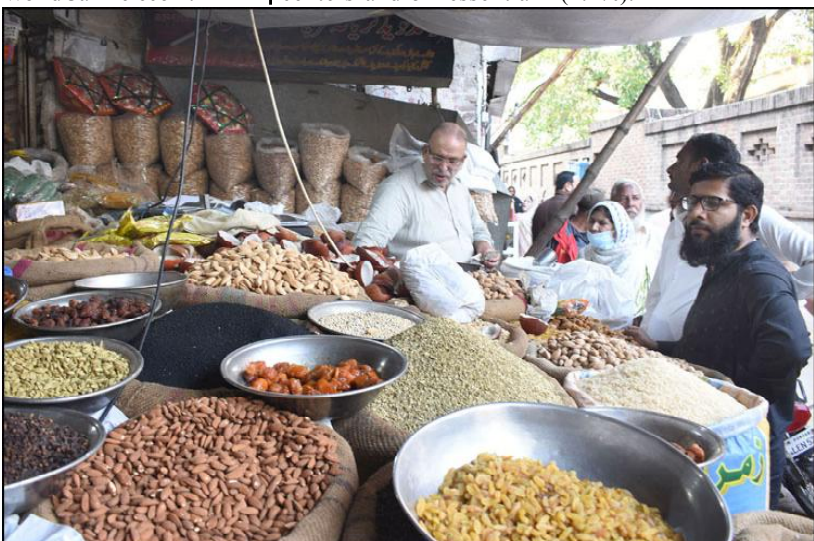
LAHORE: People are buying dry fruits from shop at Akbari mandi as people like such things especially during winters in Provincial Capital.