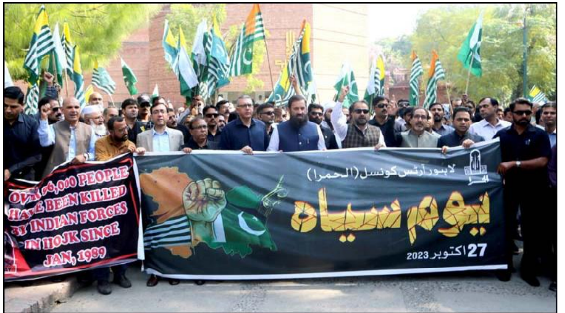
LAHORE: Governor Punjab Muhammad Balighur Rehman leading a rally on eve of Kashmir Black Day organized by Information and Culture Department.

They also reviewed the progress of the project at Union Council Trahia. In order to speed up the work on the Ring Road, CM Naqvi directed the authorities to use additional road leveling machinery at the project site. He said the Rawalpindi Ring Road was an important project of public interest and all-out efforts should be made to complete it before the stipulated time frame. He directed the authorities to ensure construction work on the project in three shifts so that the targets could be achieved as soon as possible.