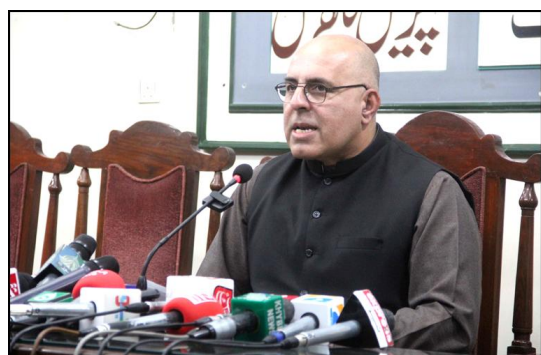
QUETTA: Caretaker Provincial Information Minister Jan Achakzai addressing a Press conference

ISLAMABAD (APP): The Senate on Friday unanimously passed a resolution strongly reaffirming Pakistan's solidarity with the Kashmiri people in their just struggle for right to self-determination. The resolution moved by Senator Kamil Ali Agha, reiterated Pakistan's moral, diplomatic and political support to the Kashmiri people. The resolution strongly condemned the Indian brutalities and killing of thousands of innocent Kashmiris in the Indian Illegally Occupied Jammu and Kashmir (IIOJK). It urged the International community for the expeditious formation of a Commission of Inquiry to investigate the gross human rights violation in IIOJK.