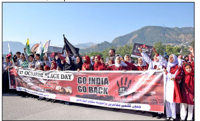
MUZAFFERABAD: Teachers and students of different schools holds placards and shouting slogans during protest at Azadi Chowk to mark the Black Day against the cruelty of Indian Army on oppressed Kashmiris of IOJK.

Water Supply and Siran Right Bank expansion will commence soon. During the visit, the minister was briefed about various ongoing projects, their status, challenges, and future impacts. Commissioner Hazara Division Syed Zaeher-ul-Islam encouraged government officials to improve their performance and work more efficiently in the transitional government. He specifically addressed the NHA officials, urging them to swiftly improve road conditions in the Hazara Division.