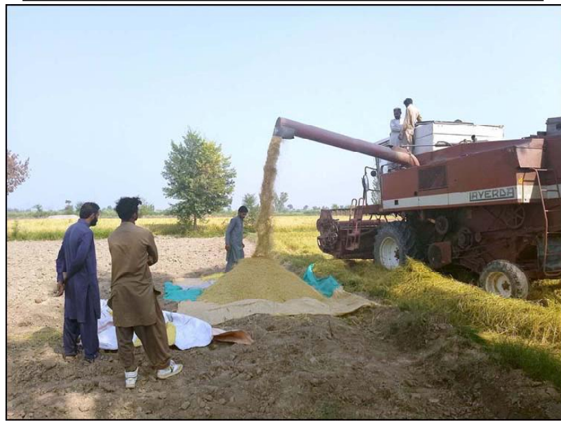
LAHORE: Heavy machinery is being used for harvesting rice crop in the field.

FESCO had also got cases registered against 3155 accused whereas the police had arrested 2636 electricity thieves so far, he added. Giving further details, he said that the FESCO teams continued checking of power pilferage round the clock and caught 28 electricity thieves during last 24 hours who were stealing electricity through various modes including direct supply. The company had imposed a fine of more than Rs.2.278 million on these electricity thieves in respect of more than 48,000 detection units. He said that in Faisalabad district, up till now, 1071 electricity thieves were caught and handed down with a fine of more than Rs.134.4 million under 2.879 million detection units.