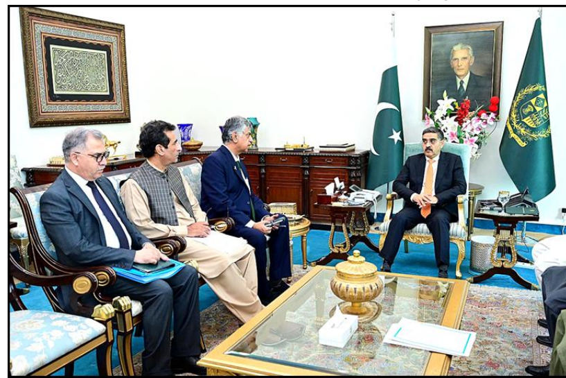
ISLAMABAD: The Caretaker Federal Minister for Information and Broadcasting Murtaza Solangi calls on the Caretaker Prime Minister Anwaar-ul-Haq Kakar.