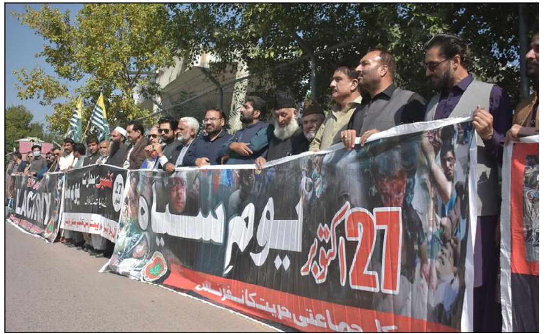
ISLAMABAD: Activists of All Party Hurriyat Conference in Islamabad under the auspices of Azad Jammu and Kashmir and Jammu and Kashmir Liberation Cell protest demonstration outside the United Nations Military Observer Group on the occasion of October 27 Black Day.

Feeling aggrieved, she approached the Wafaqi Mohtasib, who passed the order in her favour.