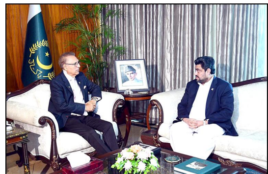
ISLAMABAD: Governor Sindh, Muhammad Kamran Khan Tessori, called on President Dr. Arif Alvi, at Aiwan-e-Sadr.

tlng non-Muslim outsiders in the Muslim majority areas in the same way the Israeli settlers have forcefully evicted Palestinians from their homes in the land grab activities sanctioned by the Tel Aviv regime," Dr Mahathir, in his video message played at an event organized by the Pakistan High Commission in Malaysia to mark the Kashmir Black Day 2023. He said India's revocation of Jammu & Kashmir's autonomy unilaterally four years ago saw the deployment of hundreds of thousands of soldiers into the illegally occupied territories of Jammu and Kashmir. "Along with that, atrocities were committed, while placing the whole population under siege."