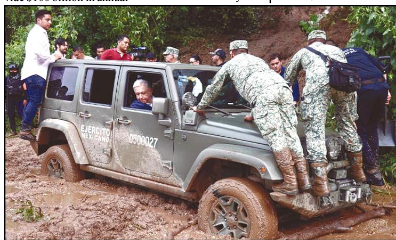
Mexican President Manuel Lopez Obrador looks out of the window as the vehicle transporting him is stuck in mud during a visit to Acapulco after the passage of Hurricane Otis.

Adeyemo said some firms in the digital asset space were not doing enough to stop the flow of illicit finance. Israel has bombarded the densely populated Gaza Strip following the Oct. 7 attack by Hamas that Israel says killed some 1,400 people. The group took more than 200 hostages, some of them infants, in the assault. The Hamas-controlled Gaza health ministry said on Thursday that 7,028 Palestinians had been killed in Israel's retaliatory air strikes. Reuters could not independently verify the tolls. Friday's action freezes any U.S. assets of the targeted groups and generally bars Americans from dealing with them.