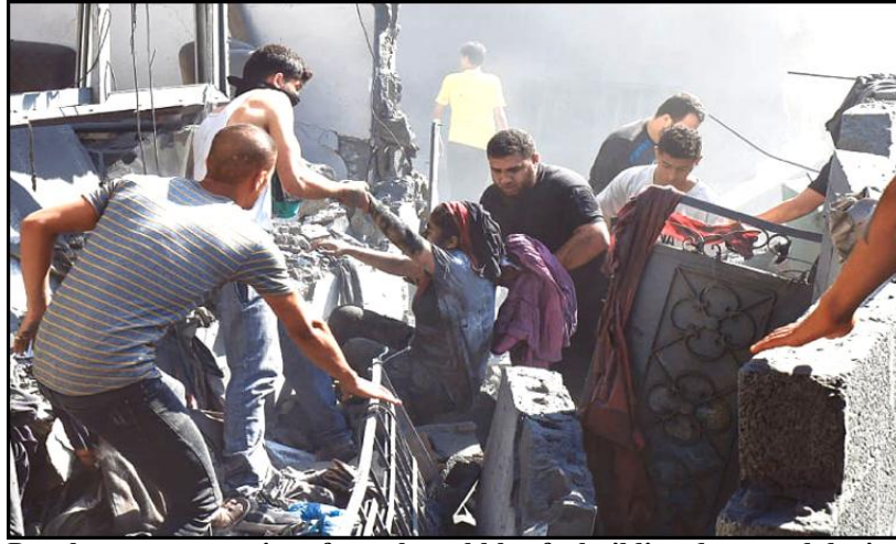
People rescue a survivor from the rubble of a building destroyed during Israeli bombardment in Khan Yunis.

In a sign of rising tensions in the region, U.S. warplanes struck targets in eastern Syria that the Pentagon said were linked to Iran's Revolutionary Guard after a string of attacks on American forces, and two mysterious objects hit towns in Egypt's Sinai Peninsula.