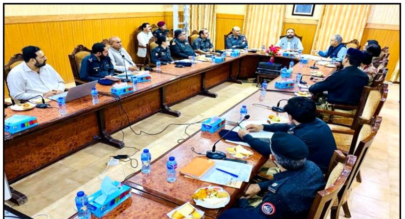
QUETTA: Provincial Home Minister Mir Zubaid Khan Jamali presiding over a meeting regarding law and order

Reiterating Pakistan's firm stance on the burning issues of Kashmir and Palestine, the governor said that Pakistan will continue its moral, political, and diplomatic support for the suppressed people of Kashmir and Palestine. The government of Pakistan has always raised its voice on every international forum, stressing the need for a resolution of the Kashmir issue in accordance with UNSC resolutions. The tyranny of the occupied forces has crossed its limits, and now it is high time for the international community and champions of human rights to come forward and play their role in the permanent resolution of the issues faced by the innocent civilians in the illegally occupied regions.