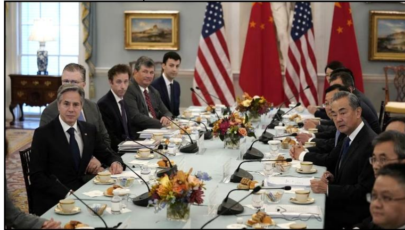
U.S. Secretary of State Antony Blinken meets with Chinese Foreign Minister Wang Yi at the State Department in Washington, U.S.

Mongolia has refrained from joining the Shanghai Cooperation Organization (SCO) for almost two decades, choosing to be an observer state since 2004 even as other nations such as India, Pakistan and Iran became full-fledged members.