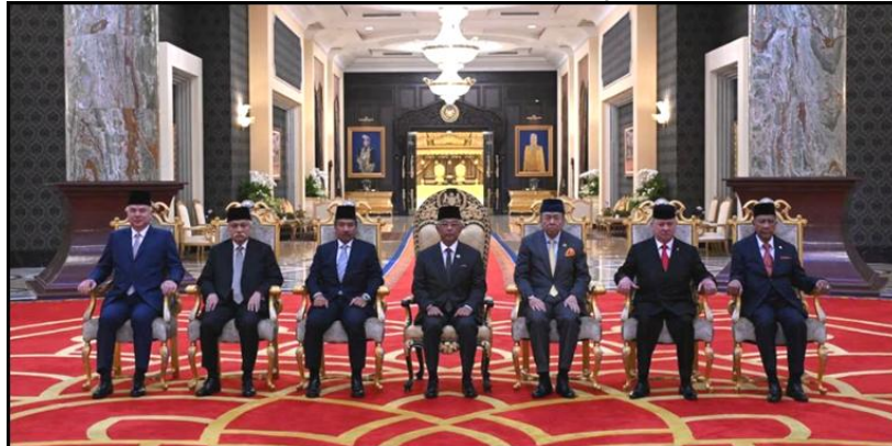
Sultan Nazrin Muizzuddin Shah of Perak, Sultan Muhriz Munawir of Negeri Sembilan, Sultan Mizan Zainal Abidin of Terengganu, Malaysia's King Sultan Abdullah Sultan Ahmad Shah, Sultan Sharafuddin Idris Shah of Selangor, Sultan Ibrahim Iskandar of Johor and Sultan Sallehuddin Badlishah pose for pictures before the election for the next Malaysian king at the National Palace in Kuala Lumpur.

Xia said the COP28 meeting needed to respect the "different starting points and national conditions of each country".