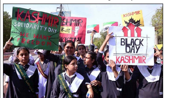
HYDERABAD: Students participated in a rally on the occasion of Kashmir Black Day at Thandi Sarak.

FAISALABAD (APP): The University of Agriculture Faisalabad (UAF) took out a rally and held a seminar here on Friday to mark Black Day against the illegal Indian occupation of Kashmir, and express solidarity and support with Kashmiri people in their struggle for their right.