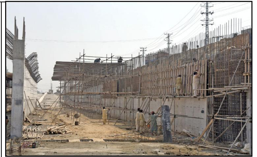
ISLAMABAD: Laborers are busy in their work during the construction of Golra Mor Underpass in Federal Capital.