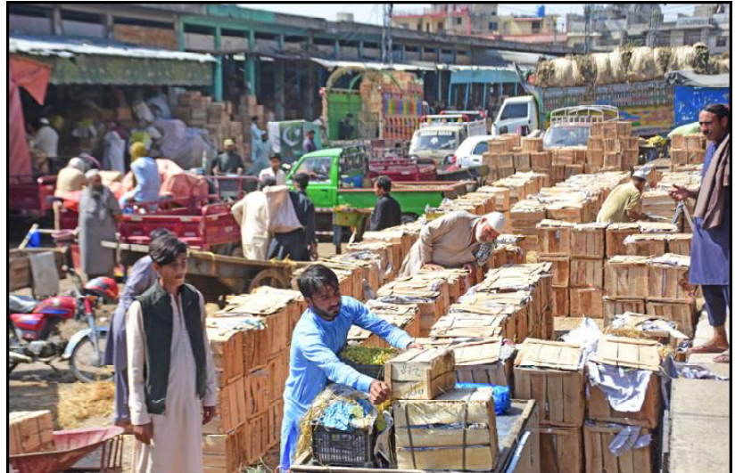
ISLAMABAD: Vendors are buying grapes from whole sale dealers at Fruit and Vegetables market in Federal Capital.

light. Per1 and Cry1 — genes that help control circadian rhythms, were more active in natural light than in artificial light. Resting energy expenditure and core body temperature followed similar 24-hour patterns in both light conditions. Serum insulin levels were similar in both light conditions but the pattern of serum glucose and plasma free acids was significantly different between conditions. "Further research is still needed to determine the extent to which artificial light affects metabolism and the amount of time that needs to be spent in natural light or outdoors to compensate for this," Habets said.