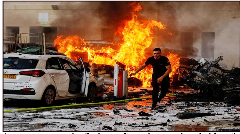
A man runs on a road as fire burns after rockets were launched from the Gaza Strip, in Ashkelon Israel

today's events. What else can one expect when Israel continues to deny Palestinians their legitimate right to self-determination and statehood? What else, after daily provocations, attacks by occupation forces and settlers, and raids on Al-Aqsa Mosque and other holy sites of Christianity and Islam? "I am not surprised by