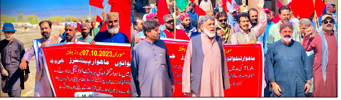
QUETTA: Activists of Rail Mazdoor Mahaz holding a protest in front DS Office against stoppage of salaries of railway employees