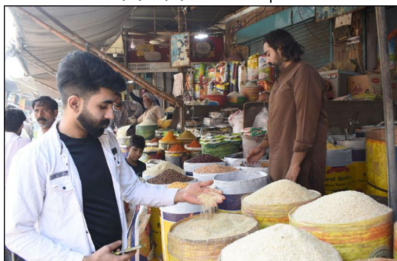
LAHORE: People are buying grocery from shops at Akbari Market as people are feels relax after decreasing of the prices of such daily usage stuff but further they are demanding decreasing of fuel prices also to manage their expenditure according to their budget, in Provincial Capital.

Provision of high quality seeds of climate resistant varieties, promotion of IPM technology, equal use of effective pesticides, water arrangement for irrigation, contact farming, availability of agri inputs on fixed rates and reasonable support price are more important for cotton farmers, he said and added that cotton played very important role in the prosperity of our farmers and the stability.