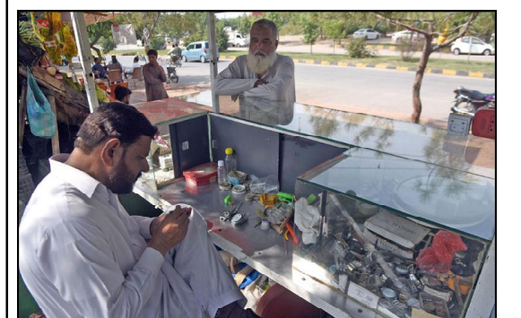
ISLAMABAD: A watchmaker is repairing the wrist watch for customer at his road side setup at Sector G-11 in Federal Capital.