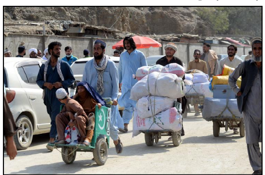
TORKHAM: Afghan refugees living in Pakistan are standing in a queue on Pak Afghan Torkham border with their families, a government decision to expel people illegally staying in the country.

PESHAWAR (APP): Afghan refugees are returning to Afghanistan through Torkham border and in the last four days around two hundred Afghan migrant families left for their country, an official of the Torkham border said here Saturday. Giving detail on the assurance of not to be named, the official disclosed that 198 families were transported to Afghanistan through 54 vehicles through Torkham border. The International Organization for Refugees (IOM) is also registering returning Afghan refugees at Torkham border, he said. The official said that 9,56,720 Afghan refugees are living in Khyber Pakhtunkhwa, another official of the Afghan Commissionerate in Peshawar said. He said 6,48,968 Afghan refugees are registered in Khyber Pakhtunkhwa and 885,000 Afghan refugees are living in settled areas and 22,390 Afghan refugees.