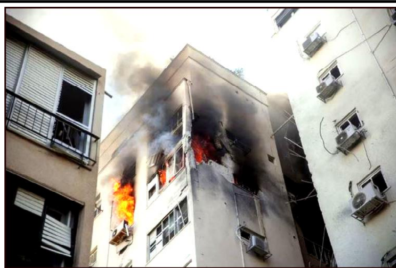
A building is ablaze following rocket attacks from the Gaza Strip, in Tel Aviv, Israel.

Monitoring Desk BOGOTA: Colombia's former President Alvaro Uribe said his long-running witness tampering case will go to trial, citing a news magazine ahead of an expected formal decision from a Bogota court on Friday. Uribe and several allies have been investigated over allegations of witness tampering carried out in an attempt to discredit accusations he had ties to right-wing paramilitaries. The former president has always maintained his innocence. Some media on Thursday reported that Uribe would face trial, citing sources. "Clearly I read this with enormous concern. I have ardently defended my reputation but I don't know anything about bribing witnesses or misleading the court."