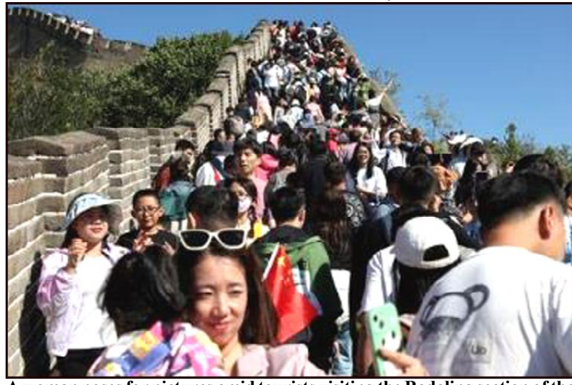
A woman poses for pictures amid tourists visiting the Badaling section of the Great Wall on the National Day holiday in Beijing, China.

the first few hundred million years after the Big Bang than it does in large galaxies like our Milky Way today. According to the study, these galaxies may have been relatively small, as expected, but might glow just as brightly as massive galaxies giving a deceptive impression of great mass because of brilliant bursts of star formation. "Astronomers can securely measure how bright those early galaxies are because photons (particles of light) are directly detectable and countable, whereas it is much more difficult to tell whether those galaxies are really big or massive. They appear to be big because they are observed to be bright," said Guochao Sun, a postdoctoral fellow in astronomy at North-western University in Illinois and lead author of the study published this week in the Astrophysical Journal Letters.