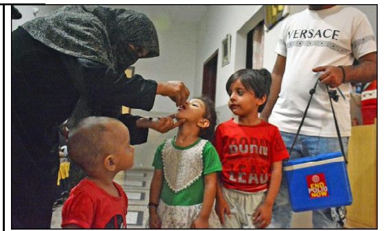
RAWALPINDI: A lady health Worker administers Polio Drops to child at Dhoke Ratta area during Polio Vaccination Campaign in City.