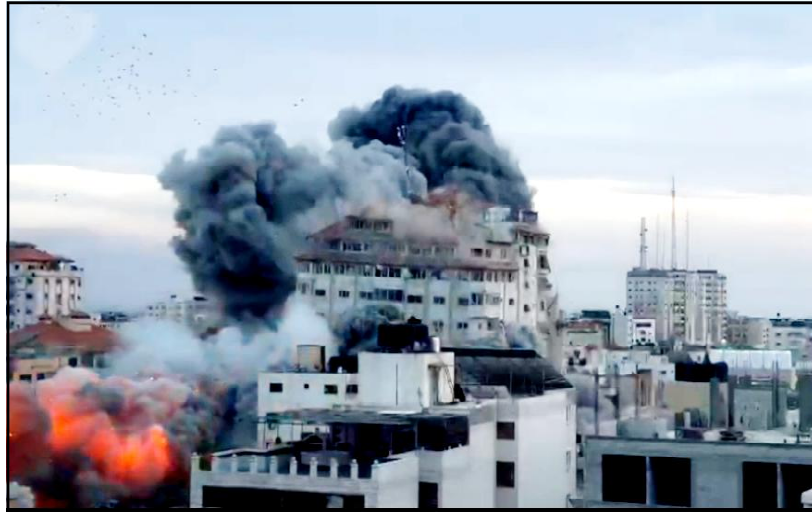
Smoke and flames billow after Israeli forces struck a high-rise tower in Gaza City

"Right to defend" Palestinian President Mahmoud Abbas in a statement said: "His people have the right to defend them-