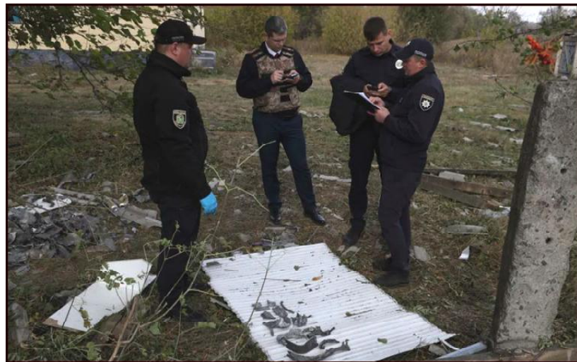
Police officers inspect the fragments of a Russian missile in the village of Hroza near Kharkiv, Ukraine.

husband side-by-side in a single grave. He told Reuters he was not in the cafe on Thursday because he worked night shifts as a security guard, and so was spared. Nearby, three brothers were readying a plot in which to bury their parents, both killed in what President Volodymyr Zelenskyy has called a deliberate Russian assault on civilians. Moscow denies targeting civilians in its full-scale invasion, a position it repeated on Friday in response to the Hroza strike. Thousands have been killed in a bombing campaign that has hit apartment blocks and restaurants as well as power stations, bridges and grain silos.