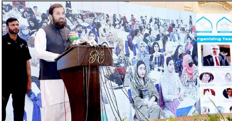
LAHORE: Punjab Governor, Muhammad Balighur Rehman addressing the opening ceremony of the 4th International Rehabilitation Sciences Conference organized by Riphah International University.

being paid towards achieving maximum per acre yield of wheat this year. The CM said that the provision of quality seed and fertiliser to farmers was necessary besides implementing a good strategy to obtain desired production targets. "It is the need of the hour to streamline research institutes," he added. To a question, he said that the price of sugar had been reduced from Rs 180 to Rs 140-150. "The situation will further improve after smuggling completely stops," he maintained. He said that an all-out effort was being made to complete development work at the earliest. He also added that relevant departments were working to control smog.