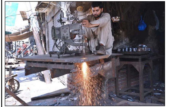
LAHORE: A laborer is busy cutting iron sheet at his work place.

He said that the journey started in April for the revival of cotton has yielded positive results.