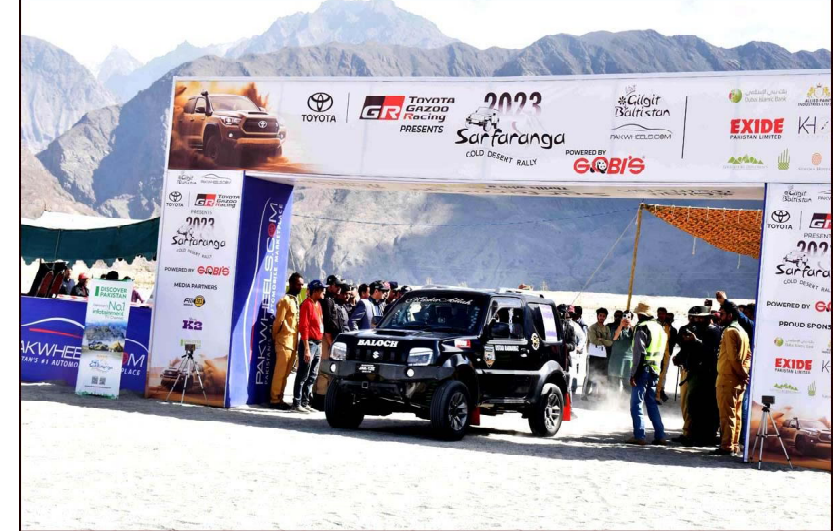
SKARDU: A participant approaching towards his target during the "Sarfaranga Cold Desert Rally 5th Edition 2023 in qualifying round at world highest desert sarfaranga.