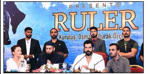
KARACHI: Turkish actor Burak Ozcivit, best known for his leading role in the renowned Turkish series 'Kurulus: Osman', addressing a press conference on launch of a new fragrance 'Ruler' by J. at a local hotel.

SPACE.com said. Eve carried Unity high into the New Mexico skies, ultimately releasing the space plane at roughly 9:24 pm (PST) at an altitude of around 45,000 feet (13,700 meters). Unity then fired up its onboard rocket motor, powering its way to suborbital space. Ms. Salim and her fellow space tourist customers—British advertising executive Trevor Beattie and American astronomy educator Ron Rosano—then experienced a few minutes of weightlessness and see Earth against the darkness of space. Their flight ended at 9:43 pm (PST), when Unity finally touched down at Spaceport America.