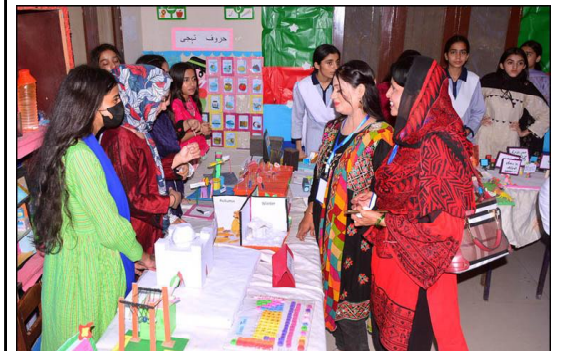
HYDERABAD: Visitors viewing the models made by students during the exhibition at Allied High School.

provincial minister on the ongoing balanced diet and nutrition projects of Nutrition International in Khyber Pakhtunkhwa and shared their performance. Khyber Pakhtunkhwa's Minister for Food, Agriculture, Livestock and Forests Asif Rafiq, while remarking that a balanced diet is the need of every individual, in this regard, more awareness should be given regarding taking care of the nutrition of newborns and lactating mothers. He said that in government hospitals of Khyber Pakhtunkhwa parents of new-born children and pregnant women are encouraged to eat a balanced diet so that a healthy society can be formed.