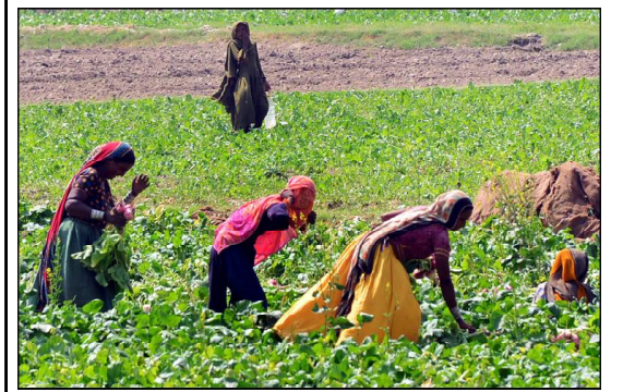
HYDERABAD: Farmer women collecting the turnips from their farm field.

During which, the police team recovered NCP items including 15 rolls of cloth, one sack of tea, two sacks of Gutka, five cartons of cosmetics items, 33 tyres of different sizes, 20 sacks of plastic bags, three sacks of dry milk, two cartons of veterinary medicines, five cartons Shampoo, 70 sacks of China Salt.