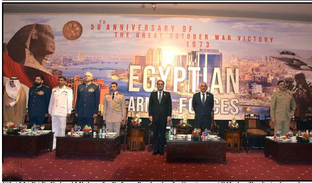
ISLAMABAD: Federal Minister for Defence Production Lt Gen Anwar Ali Hyder (Retd), Ambassador of Egypt, Egyptian Defense Attaché staff Brigadier Mohamed Saad and others standing in respect of national anthem of Pakistan and Egypt on the occasion of the Egyptian Armed Forces Day at a local hotel.