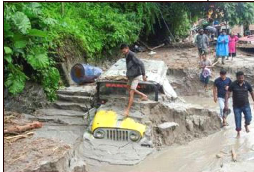
People walk along a street as a jeep is buried in the mud due to the flood at Teesta Bazaar in Kalimpong District, West Bengal, India.