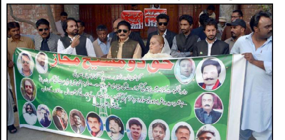
QUETTA: A protest demonstration being held by Haq Do Masih Mahaz in front of Quetta Press Club.