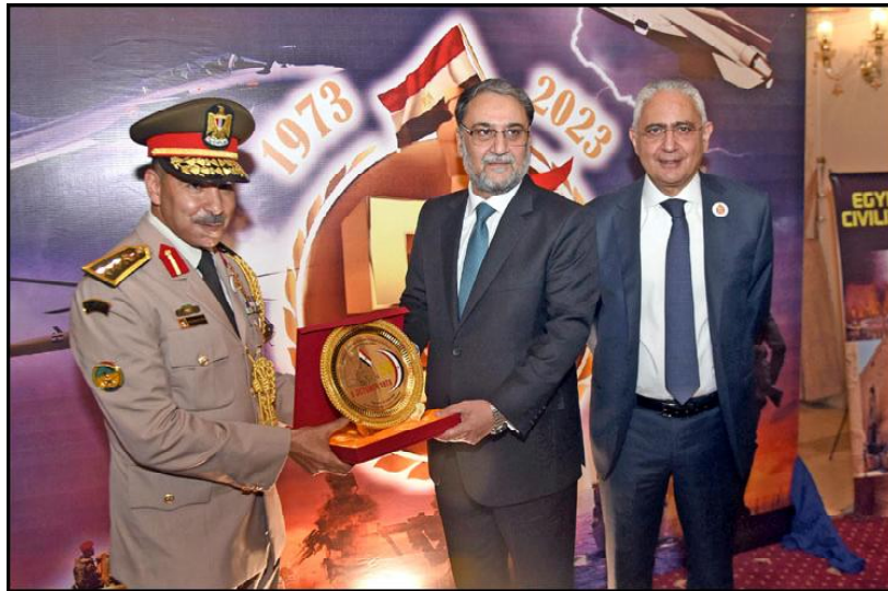
ISLAMABAD: Federal Minister for Defence Production Lt Gen Anwar Ali Hyder (Retd) receives souvenir from Egyptian Defense Attaché staff Brigadier Mohamed Saad on the occasion of the Egyptian Armed Forces Day as Ambassador of Egypt to Pakistan Tarek Dahroug were also present on the occasion on 06 October in Federal Capital.

committed to the goal of a peaceful and stable South Asia. Over the past quarter century, he said, Pakistan proposed a number of initiatives to promote peace and security and prevent the emergence of nuclear weapons in South Asia. Following the nuclear tests in South Asia, Pakistan proposed the establishment of a Strategic Restraint Regime (SRR) in the region, premised on three interlocking and mutually reinforcing elements of conflict resolution, nuclear and missile restraint and conventional arms balance. "The proposal remains on the table," Ambassador Hashmi said, pointing out that Pakistan's security policy continued to be defined by restraint, responsibility and avoidance of a mutually debilitating arms race in the region. He said that peace and stability in South Asia can be built through the resumption of negotiations to resolve the outstanding India-Pakistan disputes.