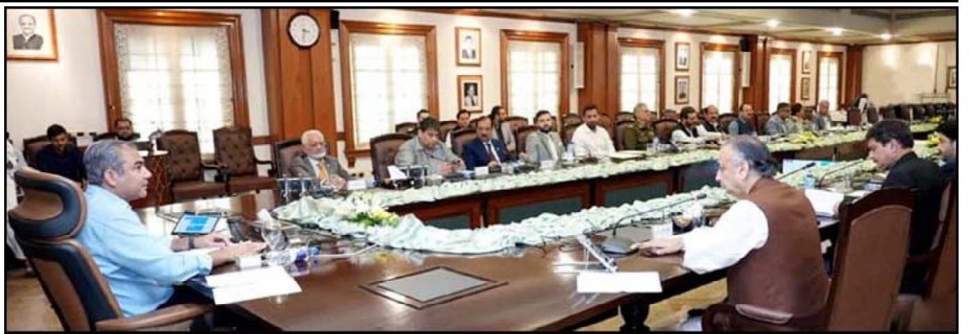
LAHORE: Caretaker Chief Minister Punjab Mohsin Naqvi presides over the 29th meeting of Provincial Cabinet.

Unauthorized commercial use of residential buildings and sealed eight properties in Civil Lines area. According to the RDA spokesman, the Enforcement Squad of RDA conducted the operation and took action against the rules violators. The properties constructed on plot number 8, plot number B-10 Dupilex, plot number 11, Kamal Homeo Cure Centre, plot number 39, plot number 17 and plot number 17-A Silver Oaks School, plot number 38 Sadeeqa's Learning System (SLS) School, plot number 24, plot number 25, Fauji Security Services, CIT, Civil Lines, were sealed. He said that the Enforcement Squad including the Deputy Director of Building Control, Assistant Director