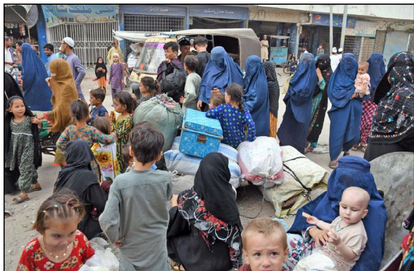
KARACHI: Afghan refugees leaves the Pakistani port city as they return to Afghanistan Pakistan's government decision to expel people illegally staying in the country as thousands of Afghans living illegally in Pakistan have been given until November 1 to leave voluntarily or face deportation.