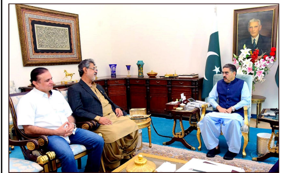
ISLAMABAD: Former member Balochistan Assembly and Provincial Minister Sardar Sarfraz Domki calls on the Caretaker Prime Minister Anwaar-ul-Haq Kakar

Pakistan's position is that a viable, sovereign, and contiguous State of Palestine should be established on the basis of pre-1967 borders, with Al Quds Al-Sharif (Jerusalem) as its capital.