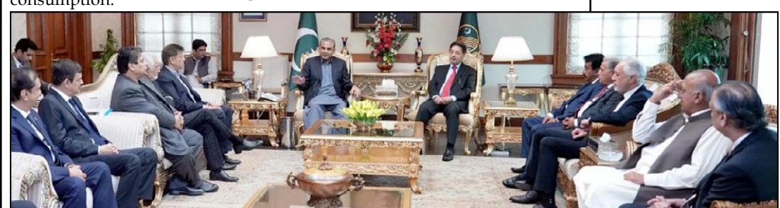
LAHORE: Caretaker Minister of Punjab Cabinet led by Chief Minister Mohsin Naqvi meeting with Chief Election Commissioner Sikandar Sultan Raja. ECP members of provinces are also present

APHC said, the morale of Kashmiris is high despite the brutal acts and military force being employed by India to suppress their freedom struggle. He said Kashmiris are martyred on a daily basis and the entire Kashmiri leadership was under arrest, hundreds of Kashmiris, including religious scholars, were detained under black laws in jails and detention centers.