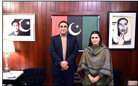
KARACHI: Peoples Party (PPP) Chairman, Bilawal Bhutto Zardari meets PPP Central Information Secretary, MNA Shazia Marri during meeting held at Bilawal House in Karachi.