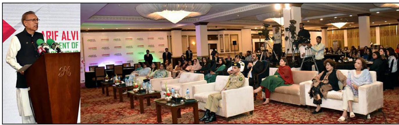
KARACHI: President Dr. Arif Alvi addressing during an event on the Spirit of female Entrepreneurship and Medical Leadership of female doctors organized by Sehat Kahani.