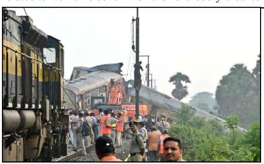
Rescue workers and police officials stand next to damaged coaches following a collision between two passenger trains in Vizianagaram district in the southern Andhra Pradesh state, India.

Advertisement Scroll to continue "We have to make sure that British systems are safe and secure from the threat of terrorism as the government always does," higher education minister Robert Halfon told Times Radio. Britain's MI5 intelligence agency currently regard the threat to the country from terrorism as substantial, meaning an attack is likely. There are two higher categories of threat level - severe, meaning an attack is highly likely, and critical, meaning an attack is highly likely in the near future.