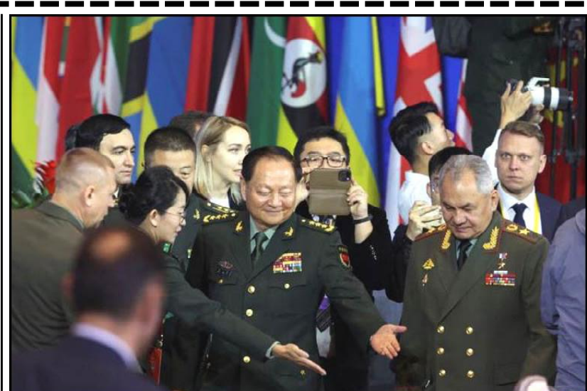
China's Central Military Commission Vice Chairman Zhang Youxia and Russian Defence Minister Sergei Shoigu arrive for the Beijing Xiangshan Forum in Beijing, China.

marriage rates because official policies make it hard for single women to have children. China's National Bureau of Statistics in January reported the first population drop in six decades and the country's population is rapidly ageing. In the last two years, authorities across China have unveiled measures to lift the country's birth rate including financial incentives and boosting childcare facilities. The state media has often linked population development to the strength and "rejuvenation" of the country.