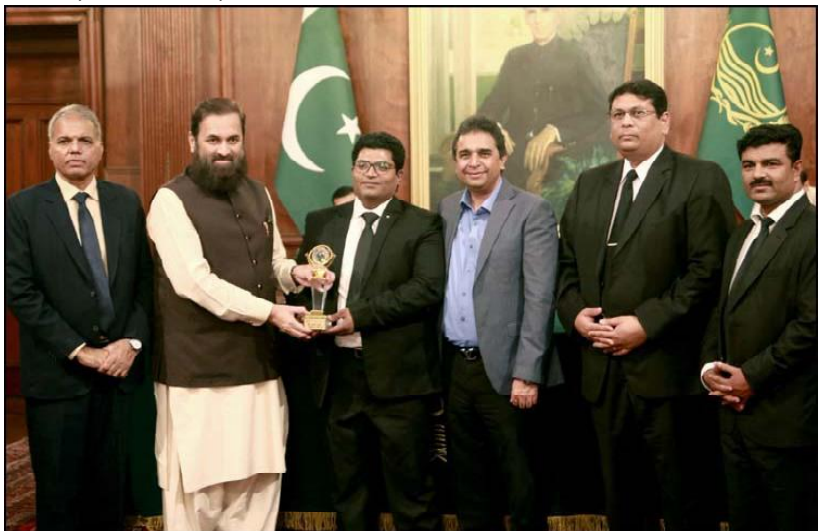
LAHORE: Punjab Governor Muhammad Baligh-ur-Rehman distributing National Christian Award amongst the participants on their best performance in various fields.

week-long ruthless genocide maneuvered and executed by the despotic ramed dogra ruler's force and gangsters besides the armed Hindu fanatics in the first and second week of November 1947. These martyrs included 2.50 Muslim inmates of Jammu city and adjoining areas who were martyred by the dogra forces and their armed gangsters 6th of November 1947 while they were moving for migrating to the adjoining Sialkot city of the newly-born separate homeland of the Muslims of the subcontinent - Pakistan.