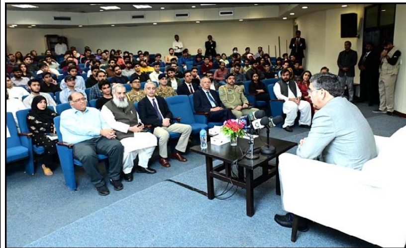
LAHORE: Caretaker Prime Minister Anwaar-ul-Haq Kakar participates in an interactive session with the students of Lahore University of Management Sciences (LUMS).