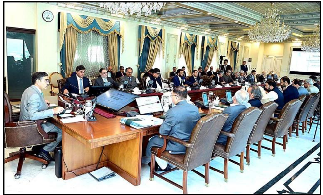
ISLAMABAD: The Caretaker Prime Minister Anwaar-ul-Haq Kakar chairs a meeting of the Caretaker Federal Cabinet.

"It is the mandate of the ECP and not of the Caretaker Prime Minister to set a date for the general elections," he said, adding if he was mandated under the constitution, he would have given the same.