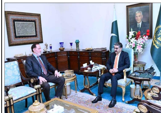
ISLAMABAD: Former Senator Saleem Saifullah calls on the Caretaker Prime Minister Anwaar-ul-Haq Kakar.

ISLAMABAD (APP): To commemorate 40 years of diplomatic relations between Pakistan and the Republic of Korea, the Department of Archeology and Museum (DOAM) in collaboration with the Embassy of the Republic of Korea organized a photographic exhibition titled "40 Years of Diplomatic Relations between the Republic of Korea and Pakistan." The exhibition, which opened on Friday, features photographs of historical sites and monuments in Pakistan and Korea, including Buddhist sites in Pakistan. It also showcases the work done during excavations, conservation, and restoration of important Buddhist sites in both countries. In his opening address, notable speakers were Park Kijun, the Korean Ambassador, the Executive Director of the Korea Cultural Heritage Foundation (KCHF), and Dr. Abdul Azeem, the Director General of DOAM.