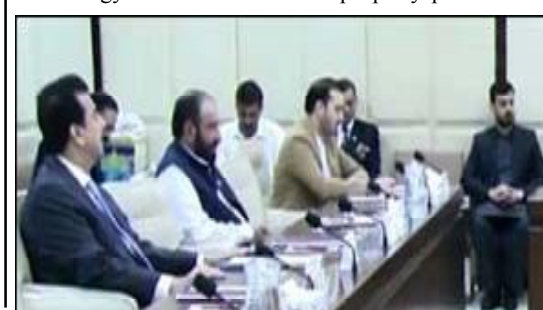
ISLAMABAD: Chairman Senate, Muhammad Sadiq Sanjrani presiding over a senate house business advisory committee meeting at Parliament House.