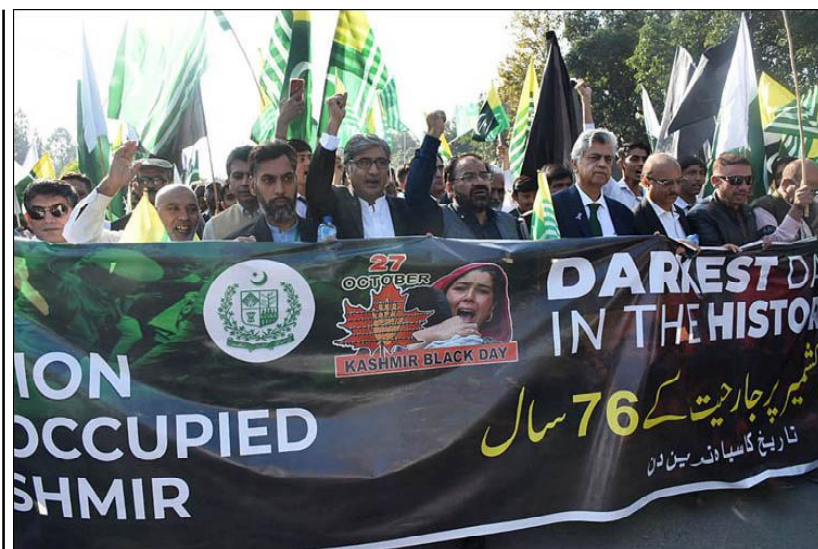
ISLAMABAD: Caretaker Federal Minister for Information & Broadcasting, Murtaza Solangi leading a walk in connection with Kashmir Black Day at Constitution Avenue.

completion of her degree but she was advised to contact HEC for grant of an additional year to complete her studies. Later, HEC advised that the competent authority of the University to reconsider her case for extension keeping in view her medical history and the provisions already available in HEC Policy and University Regulations. However, after a lapse of one year she was not given the extension. Feeling aggrieved, she approached the Wafaqi Mohtasib, who passed the order in her favour. The university then filed a representation before the President against the order of the Mohtasib. The president rejected the representation and observed that the university did not follow the recommendations of the HEC and did not put the case before the UFC, who was competent to make a decision in this regard.