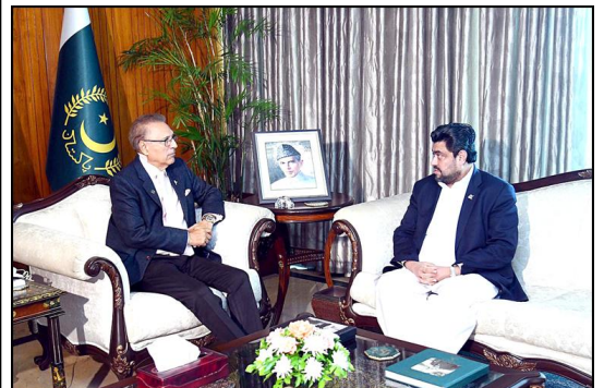
ISLAMABAD: Governor Sindh, Muhammad Kamran Khan Tessori, called on President Dr. Arif Alvi, at Aiwan-e-Sadr.

Pakistan has been facing terrorism for the last many years, he added that law enforcement agencies and Pakistan Armed Forces are making all out efforts to maintain peace in the country.