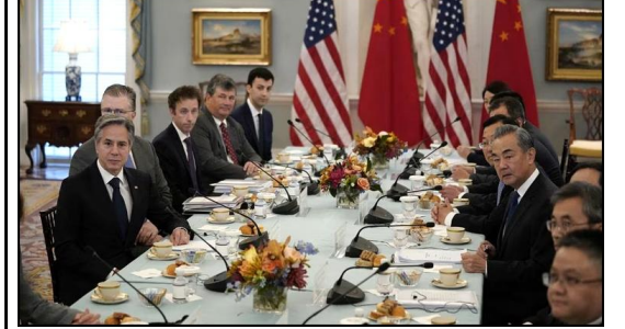
U.S. Secretary of State Antony Blinken meets with Chinese Foreign Minister Wang Yi at the State Department in Washington, U.S.

erred out of the closed-door meeting. Wang is set to head to the White House and meet with U.S. National Security Advisor Jake Sullivan later on Friday. He is also expected to speak with Biden, although it is unclear how substantial their interaction will be. Wang's three-day visit is the latest in a flurry of diplomatic engagements between China and the U.S., and the trip primarily is to prepare for an expected Xi-Biden summit in November on the sidelines of the Asia-Pacific Economic Cooperation leaders meeting in San Francisco.