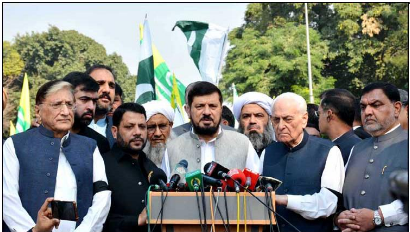
PESHAWAR: Khyber Pakhtunkhwa Governor Haji Ghulam Ali and Caretaker Chief Minister Muhammad Azam Khan talking with mediators on eve of Kashmir Black Day in front of Governor House.