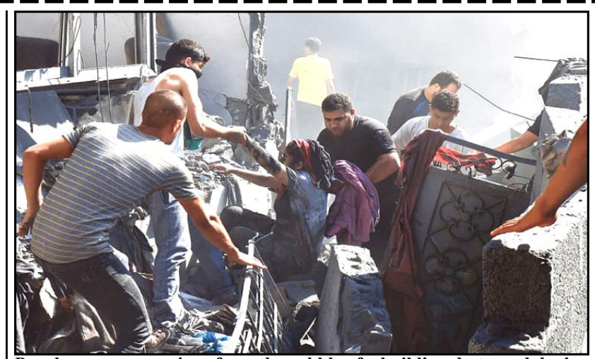
People rescue a survivor from the rubble of a building destroyed during Israeli bombardment in Khan Yunis.

ready densely populated city which has been swamped by the influx of families fleeing the north. Israel expects 'long' ground war in Gaza to destroy Hamas and its many tunnels Monitoring Desk DEIR AL-BALAH: Israel expects to launch a long and difficult ground offensive into Gaza soon to destroy Hamas, the country's defense minister said Friday, describing a campaign that will require dismantling a vast network of tunnels used by the territory's militant rulers. Defense Minister Yoav Gallant spoke to a small group of foreign reporters in Tel Aviv after Israeli forces backed by fighter jets and drones carried out a second, limited ground raid into Gaza in as many days, striking the outskirts of Gaza City. Gallant said the ground invasion that follows weeks of airstrikes "will take a long time," and that it would lead to another lengthy phase of lower-intensity fighting, as Israel destroys "pockets of resistance." In a sign of rising tensions in the region, U.S. warplanes struck targets in eastern Syria that the Pentagon said were linked to Iran's Revolutionary Guard after a string of attacks on American forces, and two mysterious objects hit towns in Egypt's Sinai Peninsula.