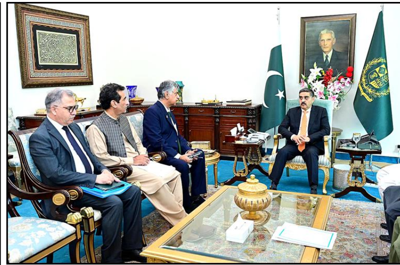
ISLAMABAD: The Caretaker Federal Minister for Information and Broadcasting Murtaza Solangi calls on the Caretaker Prime Minister Anwaar-ul-Haq Kakar.

the recently signed accords between Pakistan and China would open up new opportunities of employment and economic development for the people of Gilgit-Baltistan. The prime minister expressed these views as Chief Minister GB Gulbar Khan called on him here at the PM House. The meeting discussed the memorandum of understanding signed during the prime minister's visit to China and other measures to further increase trade relations between GB and Xinjiang.