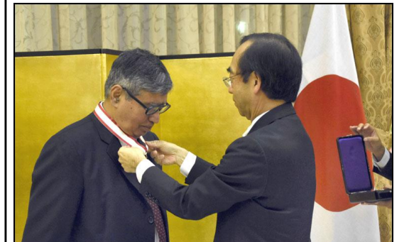
ISLAMABAD: Ambassador of Japan to Pakistan WADA Mitsuhiro conferred the Imperial decoration "The Order of the Rising Sun, Gold and Silver Star" on Imtiaz Ahmad, former Ambassador of the Islamic Republic of Pakistan to Japan on behalf of the Government of Japan following the recognition of his significant contribution towards strengthening the friendship, cultural and economic relations and mutual understanding between Japan and Pakistan, during a Conferment ceremony at the residence of the Japan Ambassador in Federal Capital.

ISLAMABAD (APP): The Government of Japan has conferred the 2023 Spring Imperial Decorations, "The Order of the Rising Sun, Gold and Silver Star" on Imtiaz Ahmad, former Ambassador of Pakistan to Japan. This distinguished honor was bestowed upon him in recognition of his significant contribution towards strengthening friendship, cultural and economic relations and mutual understanding between Japan and Pakistan said a news release of the embassy. The Order of the Rising Sun is awarded by the Emperor of Japan to Japanese and foreign individuals in recognition of their long-time contributions. On behalf of the Gov-