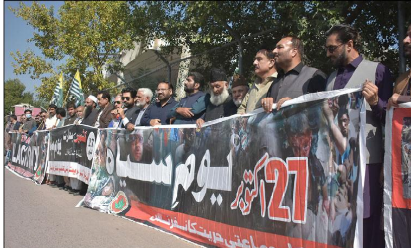
ISLAMABAD: Activists of All Party Hurriyat Conference in Islamabad under the auspices of Azad Jammu and Kashmir and Jammu and Kashmir Liberation Cell protest demonstration outside the United Nations Military Observer Group on the occasion of October 27 Black Day.

He said India's revocation of Jammu & Kashmir's autonomy unilaterally four years ago saw the deployment of hundreds of thousands of soldiers into the illegally occupied territories of Jammu and Kashmir. "Along with that, atrocities were committed, while placing the whole population under siege," He said, "We have also heard reports of how India is attempting to change the demographic composition of Jammu and Kashmir."