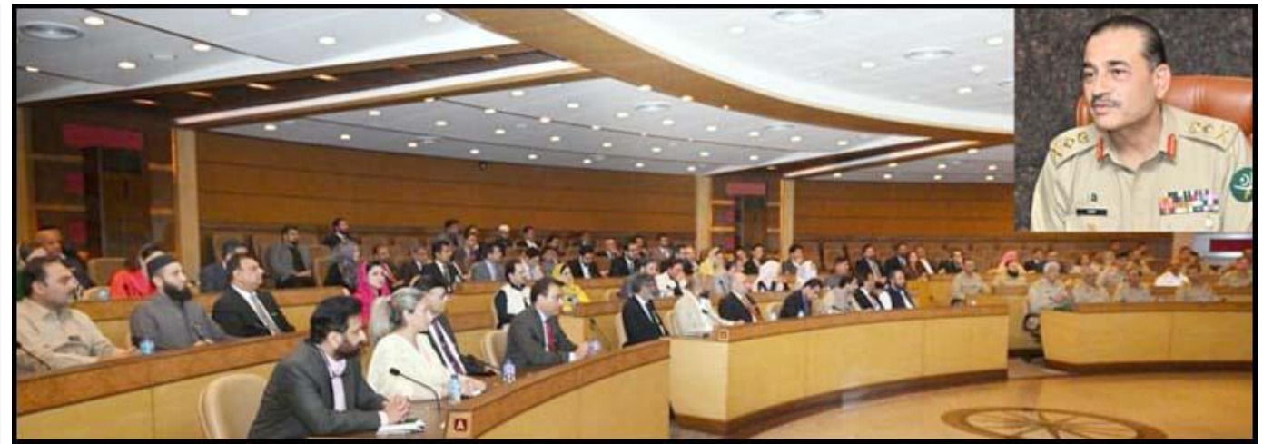
RAWALPINDI: Chief of the Army Staff General Syed Asim Munir interacting with participants of National Security Workshop-25 at General Headquarters (GHQ)

"Pakistan Army is fully engaged in enabling national and provincial responses in different domains in step with other institutions of the state for the collective good of the people of Pakistan. We are a resilient nation that has endured the tests of time on its path to achieving peace and stability," the Army Chief added. National Security Workshop is an annual event at the National Defence University, participated by representatives from all segments of the society.