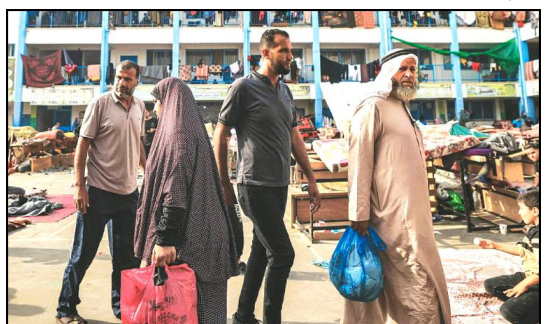
People arrive at a school in Khan Yunis that has been converted into a shelter for displaced families.