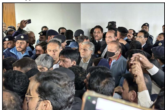
ISLAMABAD: Former Prime Minister, Nawaz Sharif arrives to appear before Islamabad High Court.

The prosecutor replied that they did not require the custody of former prime minister.