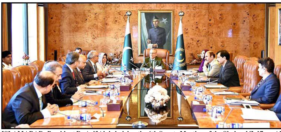
ISLAMABAD: President Dr Arif Alvi chairing the 6th Senate Meeting of the Shaheed Zulfiqar Ali Bhutto Medical University, at Aiwan-e-Sadr.

In order to maintain peace in the federal capital, the operation would continue till the last eviction of the Afghan refugees as they were involved in criminal activities and had been occupying the places in the city for a long time.