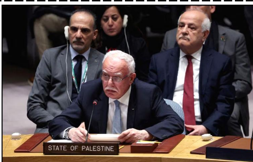
Palestinian Foreign Minister Riyad al-Maliki attends a meeting of the Security Council on the conflict between Israel and the Palestinian Islamist group Hamas at U.N. headquarters in New York, U.S.

Monitoring Desk NEW DELHI: The Indian government on Thursday vowed to explore "all legal options" after a Qatari court handed death sentences to eight Indian employees of a Qatari company on spying charges. According to Indian media reports, the eight men are retired Indian naval officers who worked for the consulting company Al Dahra, advising the Qatari government on the acquisition of submarines. India's External Affairs Ministry said in a statement it was awaiting the detailed judgment in the case. "We are in touch with the family members and the legal team, and we are exploring all legal options," it said. "We attach high importance to this case and have been following it closely. We will continue to extend all consular and legal assistance. We will also take up the verdict with Qatari authorities."