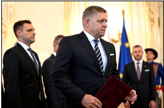
Slovakia's newly appointed Prime Minister Robert Fico attends the new cabinet's inauguration, at the Presidential Palace in Bratislava, Slovakia.