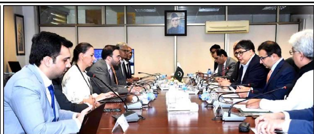
ISLAMABAD: Caretaker Federal Minister for Privatisation Fawad Hasan Fawad and Caretaker Federal Minister for Energy Muhammad Ali jointly chaired a meeting with representatives of IFC/World Bank regarding restructuring of DISCOs.