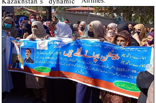
ABBOTTABAD: Members of Government Employees Coordination Council are holding protest demonstration against government policies, at Abbottabad press club.