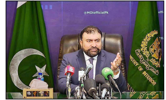
ISLAMABAD: Caretaker Federal Minister for Interior Sarfraz Ahmed Bugti addressing a Press Conference.

He said, NADRA is collecting data of those involved in theft by making fake ID cards and stern action would be taken against those officials. The government will also confiscate such properties purchased on fake ID cards, said the minister.