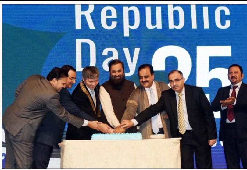
LAHORE: Governor Punjab Muhammad Balighur Rehman cutting cake during a ceremony held in connection with 31st Republic Day of Kazakhstan.