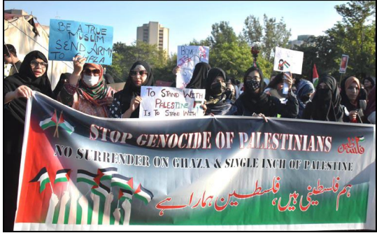
ISLAMABAD: Members of Civil Society take part in a rally against Israeli airstrikes on Gaza, to show solidarity with the Palestinian people.

Later on, the caretaker minister for water resources endorsed that irrigation departments from the provinces and Pakistan Meteorological Department would also be brought into the umbrella of IAHR for better understanding and joint collaboration.