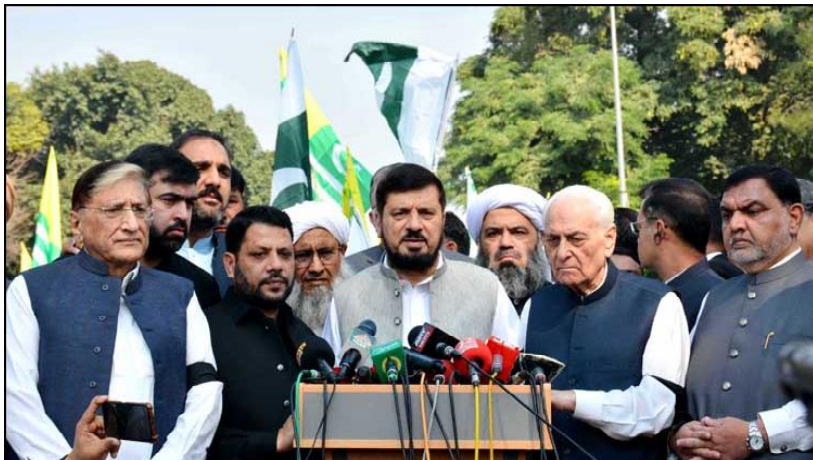
PESHAWAR: Khyber Pakhtunkhwa Governor Haji Ghulam Ali and Caretaker Chief Minister Muhammad Azam Khan talking with mediators on eve of Kashmir Black Day in front of Governor House.