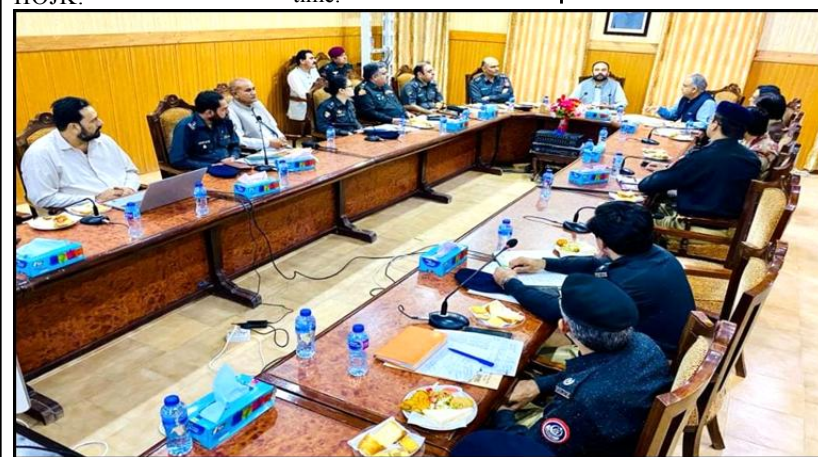
QUETTA: Provincial Home Minister Mir Zubaid Khan Jamali presiding over a meeting regarding law and order

QUETTA (APP): Dozens of events including protest rallies, seminars, speech competitions were organized across the Balochistan province on Friday to mark Kashmir Black Day. Thousands of people participated in the events to pay tribute to Kashmiris against Indian atrocities. As Indian troops had invaded Jammu and Kashmir on 27th October in 1947, the day is observed by Kashmiris as 'Black Day' to convey a strong message to the world that they reject the illegal occupation of Jammu and Kashmir by India.