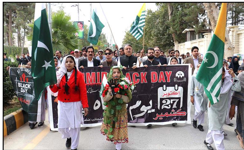
QUETTA: Balochistan Governor Abdul Wali Khan Kakar and Provincial Ministers leading a rally in connection with Kashmir Black Day.

the recently signed accords between Pakistan and China would open up new opportunities of employment and economic development for the people of Gilgit-Baltistan. The prime minister expressed these views as Chief Minister GB Gulbar Khan called on him here at the PM House. The meeting discussed the memorandum of understanding signed during the prime minister's visit to China and other measures to further increase trade relations between GB and Xinjiang.