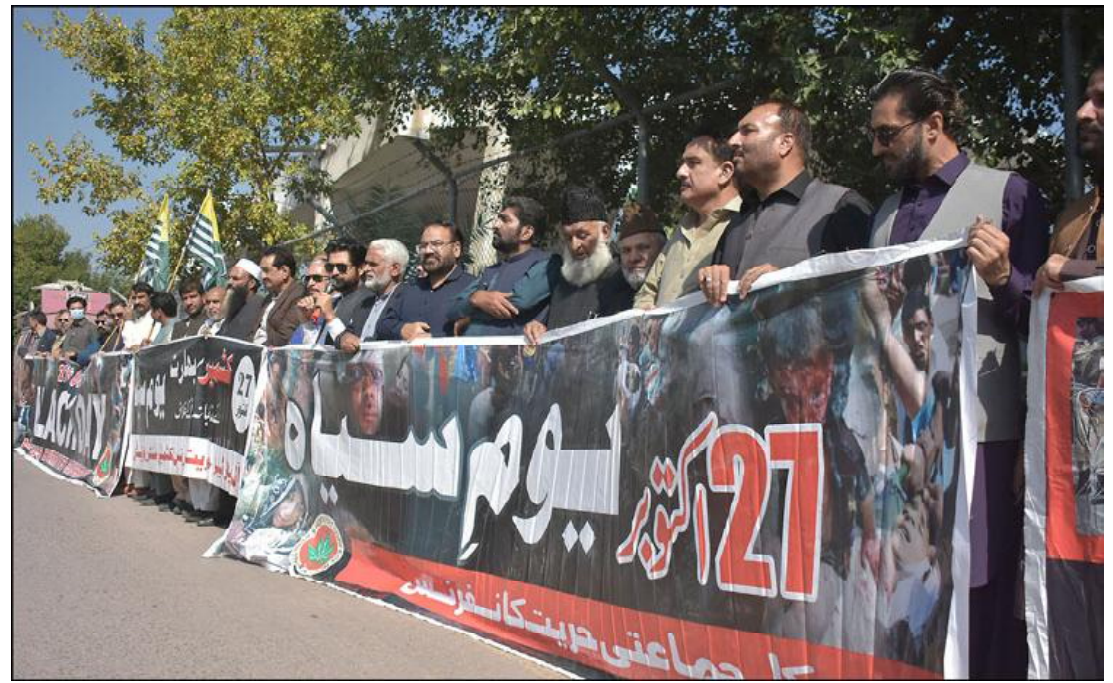
ISLAMABAD: Activists of All Party Hurriyat Conference in Islamabad under the auspices of Azad Jammu and Kashmir and Jammu and Kashmir Liberation Cell protest demonstration outside the United Nations Military Observer Group on the occasion of October 27 Black Day.

university to allow her for completion of her degree but she was advised to contact HEC for grant of an additional year to complete her studies. Later, HEC advised that the competent authority of the University to reconsider her case for extension keeping in view her medical history and the provisions already available in HEC Policy and University Regulations. However, after a lapse of one year she was not given the extension. Feeling aggrieved, she approached the Wafaqi Mohtasib, who passed the order in her favour.