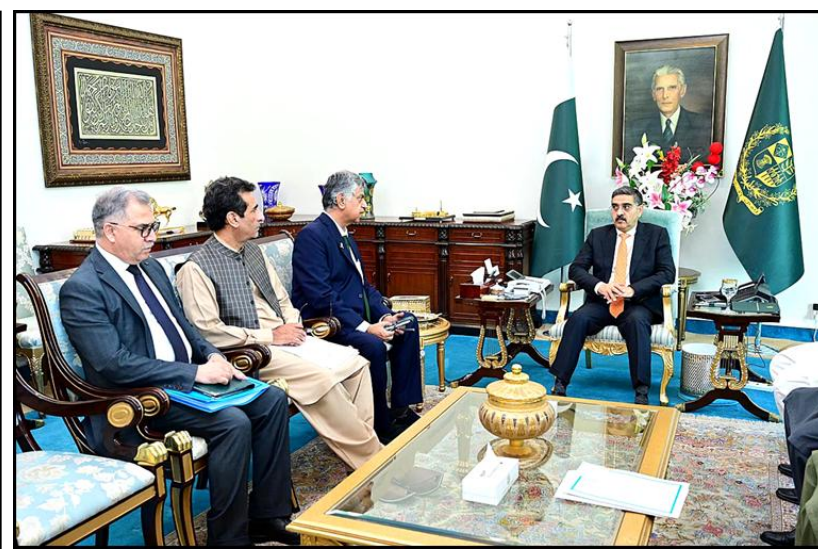
ISLAMABAD: The Caretaker Federal Minister for Information and Broadcasting Murtaza Solangi calls on the Caretaker Prime Minister Anwaar-ul-Haq Kakar.

their homes in the land grab activities sanctioned by the Tel Aviv regime," Dr Mahatir, in his video message played at an event organized by the Pakistan High Commission in Malaysia to mark the Kashmir Black Day 2023. He said India's revocation of Jammu & Kashmir's autonomy unilaterally four years ago saw the deployment of hundreds of thousands of soldiers into the illegally occupied territories of Jammu and Kashmir. "Along with that, atrocities were committed, while placing the whole population under siege," he said. "We have also heard reports of how India is attempting to change the demographic composition of Jammu and Kashmir." Dr Mahatir said the Kashmir Black Day marked the beginning of the occupation of the State of Jammu and Kashmir by India since 1947.