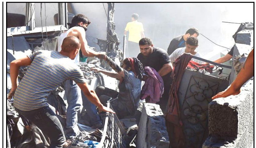
People rescue a survivor from the rubble of a building destroyed during Israeli bombardment in Khan Yunis.

ready densely populated city which has been swamped by the influx of families fleeing the north. Israel expects 'long' ground war in Gaza to destroy Hamas and its many tunnels Monitoring Desk DEIR AL-BALAH: Israel expects to launch a long and difficult ground offensive into Gaza soon to destroy Hamas, the country's defense minister said Friday, describing a campaign that will require dismantling a vast network of tunnels used by the territory's militant rulers. Defense Minister Yoav Gallant spoke to a small group of foreign reporters in Tel Aviv after Israeli forces backed by fighter jets and drones carried out a second, limited ground raid into Gaza in as many days, striking the outskirts of Gaza City. Gallant said the ground invasion that follows weeks of airstrikes "will take a long time," and that it would lead to another lengthy phase of lower-intensity fighting, as Israel destroys "pockets of resistance." In a sign of rising tensions in the region, U.S. warplanes struck targets in eastern Syria that the Pentagon said were linked to Iran's Revolutionary Guard after a string of attacks on American forces, and two mysterious objects hit towns in Egypt's Sinai Peninsula.