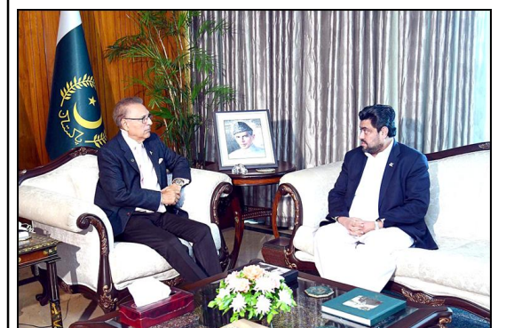
ISLAMABAD: Governor Sindh, Muhammad Kamran Khan Tessori, called on President Dr. Arif Alvi, at Aiwan-e-Sadr.

kistan, he added. About elections, he said, it is the duty of election commission of Pakistan to announce date for general elections. He said, we will provide security to ECP for holding next elections in a peaceful and transparent manner. In reply to a question about facilities extended to Nawaz Sharif on arrival, he said that Caretaker government had provided maximum security to Ex Prime Minister to avoid any untoward incident on his arrival to hometown. Pakistan has been facing terrorism for the last many years, he added that law enforcement agencies and Pakistan Armed Forces are making all out efforts to maintain peace in the country.