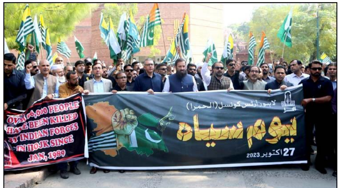
LAHORE: Governor Punjab Muhammad Balighur Rehman leading a rally on eve of Kashmir Black Day organized by Information and Culture Department.

construction work on the project in three shifts so that the targets could be achieved as soon as possible. The completion of Ring Road would permanently resolve the traffic congestion problem in Rawalpindi and Islamabad, Mohsin Naqvi added. Both the chief ministers also had an aerial view of the ongoing work on the entire road. The FWO officials, during a briefing, informed the CM that six-lane Rawalpindi Ring Road would be 38.3 kilometers long.