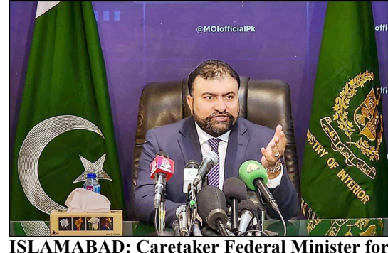
ISLAMABAD: Caretaker Federal Minister for Interior Sarfraz Ahmed Bugti addressing a Press Conference.