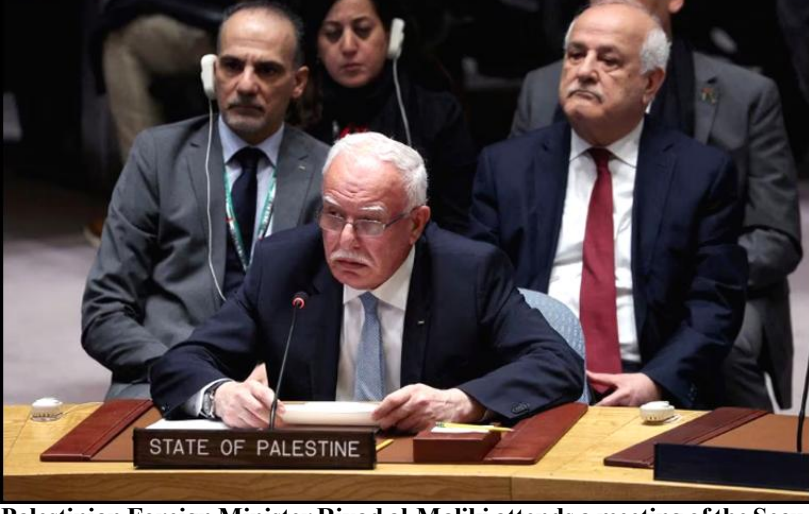
Palestinian Foreign Minister Rivad al-Maliki attends a meeting of the Security Council on the conflict between Israel and the Palestinian Islamist group

the family members and the legal team, and we are exploring all legal options," it said. "We attach high importance to this case and have been following it closely. We will continue to extend all consular and legal assistance. We will also take up the verdict with Qatari authorities.