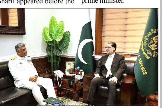
RAWALPINDI: Chief of the Naval Staff, Admiral Naveed Ashraf calls on Minister for Defence, Lt Gen Anwar Ali Hyder (Retd) in Ministry of Defence.

that they did not require the custody of former prime minister.