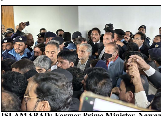
ISLAMABAD: Former Prime Minister, Nawaz Sharif arrives to appear before Islamabad High

tion forces have taken a number of steps to realize these nefarious designs, including gerrymandering of the electoral constituencies, addition of non Kashmiris to voter rolls issuance of domicile certificates to outsiders, and introduction of new laws on ownership of land and property." PM Kakar said the undemocratic and illegal measures were in direct con travention of the relevant UN Security Council resooccupation of the large lutions and the Fourth Geneva Convention.