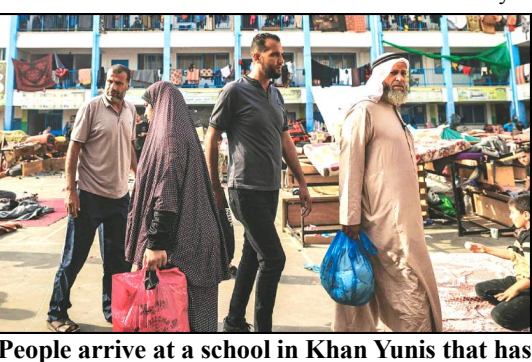
been converted into a shelter for displaced families.

and people ordered to shelter in place, as the scourge of horrifying gun violence once again ripped through Card is a certified fire- an American community.