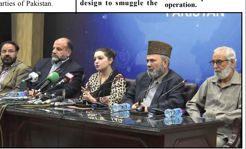
ISLAMABAD: Mushaal Hussein Muillick, SAPM on Human Rights and Women Empowerment along with APHC leaders speaks during a press conference at PID.

value of the seized narcotics is stated to be US$ 3.5 million in the international drug market. No arrest, however, has been reported in the