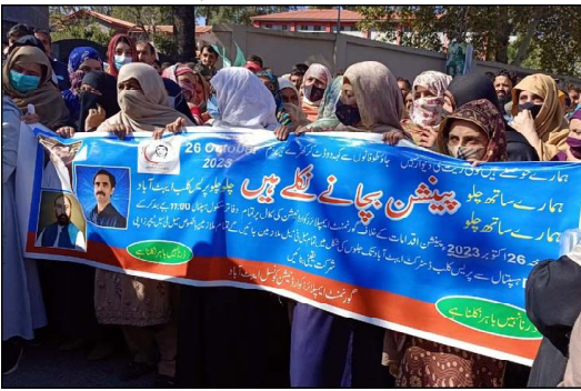
ABBOTTABAD: Members of Government Employees Coordination Council are holding protest demonstration against government policies, at Abbottabad press club.

"It is good to know that our bilateral relations are progressing at a positive pace," he said. In this context, the role of the Kazakh ambassador in Pakistan is commendable He further said that due to the efforts of the Kazakh Ambassador to Pakistan, Pakistan and Kazakhstan are now operating direct flights through the operations of SCAT Airlines.