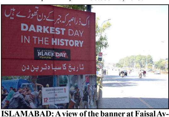
enue regarding the "Black Day of 27 October about the cruelty on oppressed Kashmir's of IOJK"

The initial phase of delimitation has concluded, and the second phase involving objection submissions will finish by Friday, hinted at the possibility of October 27, 2023.