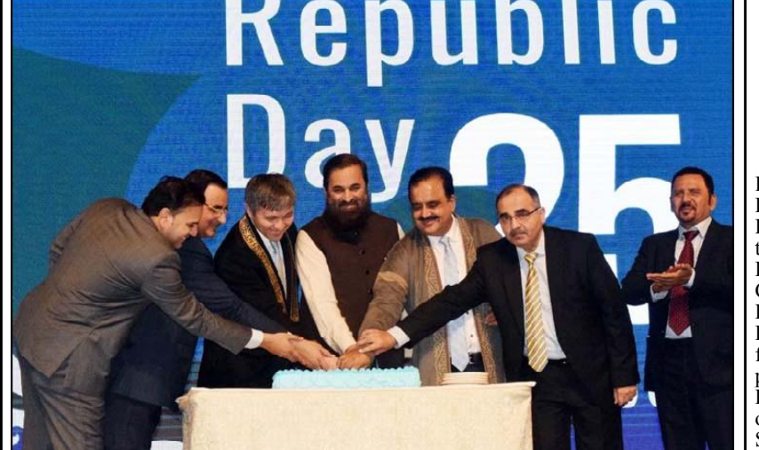
LAHORE: Governor Punjab Muhammad Balighur Rehman cutting cake during a ceremony held in connection with 31st Republic Day of Kazakhstan.