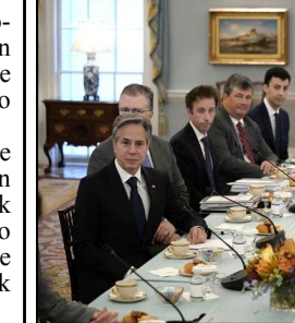
U.S. Secretary of State Antony Blinken meets with Chinese Foreign Minister Wang Yi at the State Department in Washington, U.S.

And it's not only geopolitics creeping up on Ukraine. EU politics too are no longer as kind to Zelenskyy.