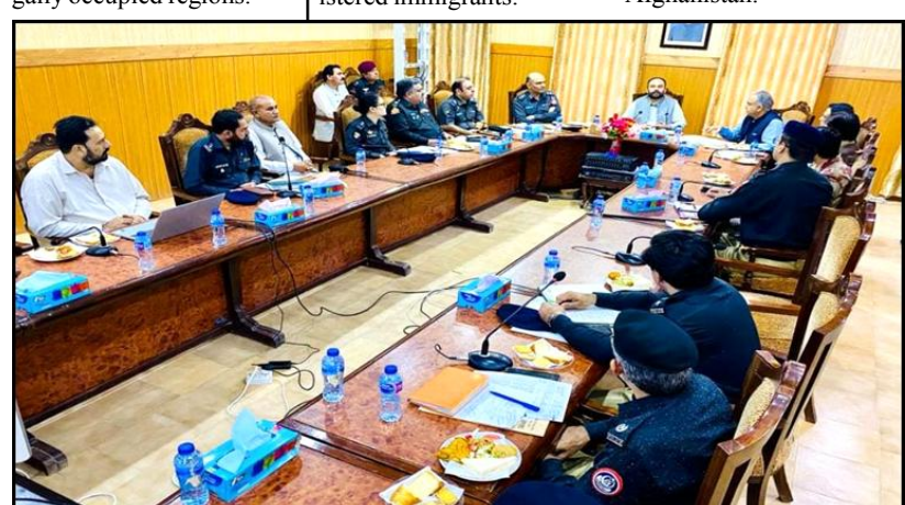
QUETTA: Provincial Home Minister Mir Zubaid Khan Jamali presiding over a meeting regarding law and order

"Acting Deputy Secretary Nuland and Foreign Minister Jilani also agreed on the need for a continuous flow of humanitarian aid to civilians in Gaza and to prevent the conflict from spreading," the statement added.