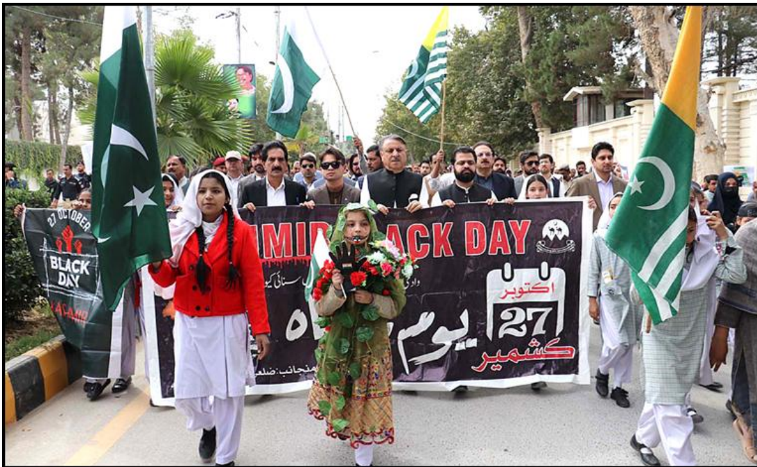
QUETTA: Balochistan Governor Abdul Wali Khan Kakar and Provincial Ministers leading a rally in connection with Kashmir Black Day.

Ph: 2841470/2841473 Vol: XVI No. 153, Rabi-us-Sani 12, 1445 AH Saturday October 28, 2023, Pages 08, Price Rs.15