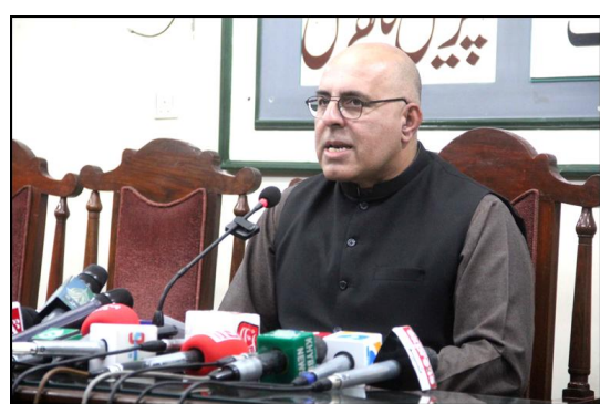
QUETTA: Caretaker Provincial Information Minister Jan Achakzai addressing a Press conference