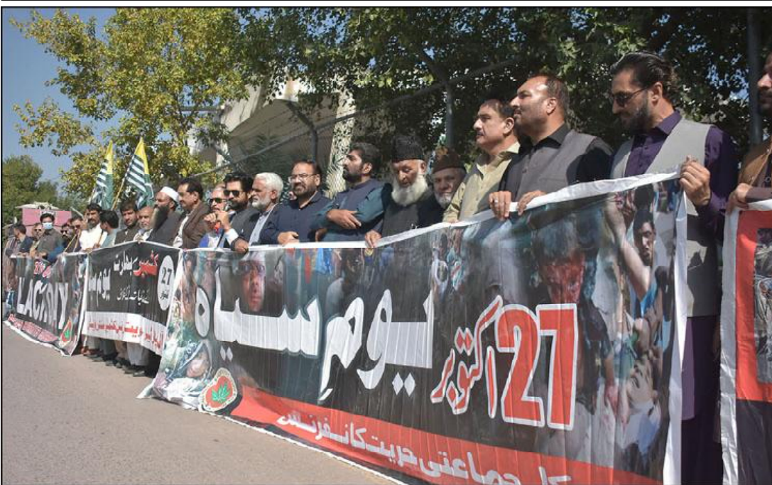
ISLAMABAD: Activists of All Party Hurriyat Conference in Islamabad under the auspices of Azad Jammu and Kashmir and Jammu and Kashmir Liberation Cell protest demonstration outside the United Nations Military Observer Group on the occasion of October 27 Black Day.