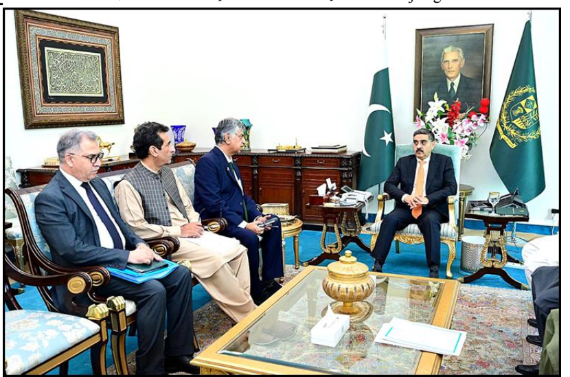
ISLAMABAD: The Caretaker Federal Minister for Information and Broadcasting Murtaza Solangi calls on the Caretaker Prime Minister Anwaar-ul-Haq Kakar.

He said a part from Chaman, crossing points are being opened in Killa Saifullah and Chagai to report illegal immigrants to Afghanistan.