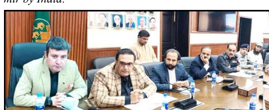
QUETTA: Balochistan Chief Secretary Shakeel Qadir Khan presiding over a meeting regarding development projects, betterment in traffic management and building code

As Indian troops had invaded Jammu and Kashmir on 27th October in 1947, the days is observed by Kashmiris as 'Black Day' to convey a strong message to the world that they reject the illegal occupation of Jammu and Kashmir by India.