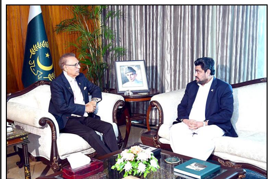
ISLAMABAD: Governor Sindh, Muhammad Kamran Khan Tessori, called on President Dr. Arif Alvi, at Aiwan-e-Sadr.

"Along with that, atrocities were committed, while placing the whole population under siege."