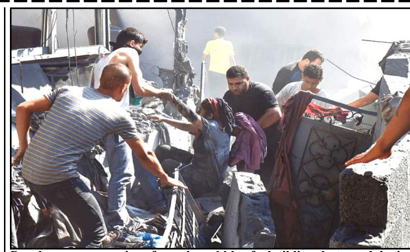
People rescue a survivor from the rubble of a building destroyed during Israeli bombardment in Khan Yunis.

Israel expects 'long' ground war in Gaza to destroy Hamas and its many tunnels