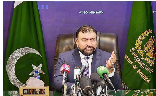
ISLAMABAD: Caretaker Federal Minister for Interior Sarfraz Ahmed Bugti addressing a Press Conference.

ISLAMABAD (APP): Caretaker Federal Minister for Interior, Sarfraz Bugti on Thursday gave an unwavering message that the government would not compromise on repatriation of illegal immigrants in Pakistan after the deadline ending on October 31st. In a stern and resolute press conference, the interior minister said that according to the repatriation plan, all provincial governments, including the government in federal capital, Gilgit Baltistan and special areas, "Holding Centers" would be established to retain all illegal immigrants. Females, children and senior citizens would be given special care in those holding centers and the government will ensure provision of food, security and medical care for all detained in those centers, said the minister. He said that no one would be sent to jail but to their holding centers and