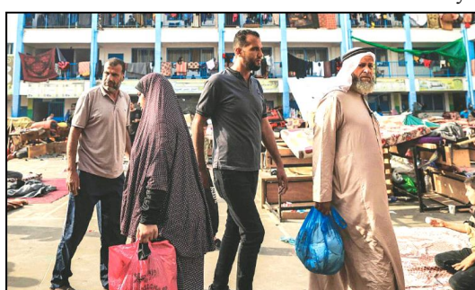
People arrive at a school in Khan Yunis that has been converted into a shelter for displaced families.