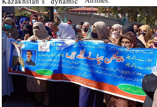
ABBOTTABAD: Members of Government Employees Coordination Council are holding protest demonstration against government policies, at Abbottabad press club.

Independent Report LAHORE: Governor Punjab Muhammad Balighur Rehman attended the 31st Republic Day of Kazakhstan function as Chief Guest at Al Hamra Hall here today. Governor Punjab extended his heartfelt felicitations to the brotherly people of the Republic of Kazakhstan on the occasion of their Republic Day. Speaking on the occasion, Punjab Governor Muhammad Balighur Rehman said that the nation of Kazakhstan is a resilient and independent nation. He referred to last year and said that the two countries celebrated the 30th anniversary of the establishment of diplomatic relations. He said that Kazakhstan's dynamic economic and regional power transformation is recognized throughout the region and beyond. He said that the people of the two countries share common historical, cultural and religious ties. He said that Kazakhstan is blessed with the largest oil reserves in the Central Asian region and can serve as an energy hub. "It is good to know that our bilateral relations are progressing at a positive pace," he said. In this context, the role of the Kazakh ambassador in Pakistan is commendable. He further said that due to the efforts of the Kazakh Ambassador to Pakistan, Pakistan and Kazakhstan are now operating direct flights through the operations of SCAT Airlines.