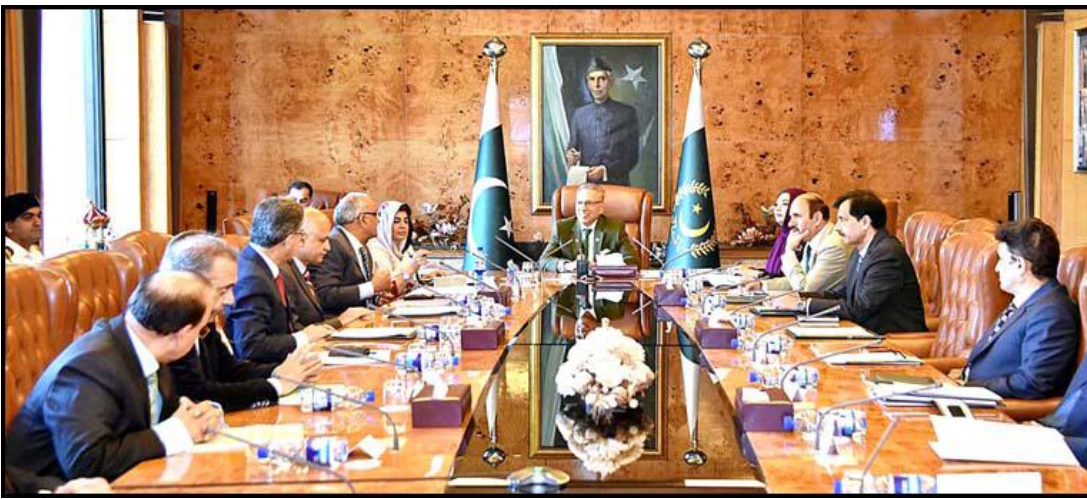
ISLAMABAD: President Dr Arif Alvi chairing the 6th Senate Meeting of the Shaheed Zulfiqar Ali Bhutto Medical University, at Aiwan-e-Sadr.