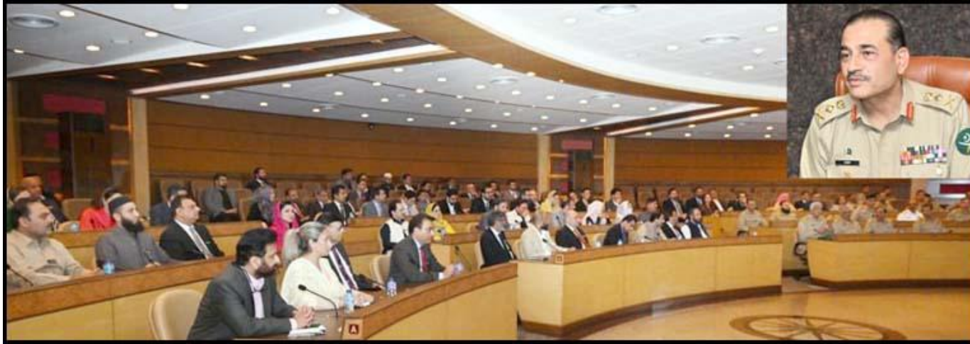
RAWALPINDI: Chief of the Army Staff General Syed Asim Munir interacting with participants of National Security Workshop-25 at General Headquarters (GHQ)

Ph: 2841470/2841473 Vol: XVI No. 152, Rabi-us-Sani 11, 1445 AH Friday October 27, 2023, Pages 08, Price Rs.15