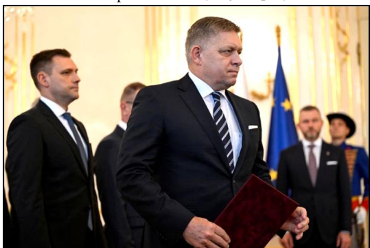
Slovakia's newly appointed Prime Minister Robert Fico attends the new cabinet's inauguration, at the Presidential Palace in Bratislava, Slovakia.

Monitoring Desk MOSCOW: Russia is training its forces for a "massive" nuclear strike in response to an "enemy nuclear strike", Moscow's defence minister Sergei Shoigu said on Wednesday as the country fired test ballistic missiles. According to the Russian press agency Interfax, Shoigu said they will also be practising "delivering a massive nuclear strike by strategic offensive forces in response to an enemy nuclear strike." President Vladimir Putin on Wednesday oversaw ballistic missile drills remotely, the Kremlin said, hours after Russia moved to revoke its ratification of a landmark nuclear test ban treaty. The drills came 20 months into Moscow's Ukraine offensive — which has raised some fears of nuclear war — and hours after Russia moved to revoke a key nuclear arms control treaty. "Under the leadership of the Supreme Commander-in-Chief of the Russian armed forces, Vladimir Putin, a training exercise was conducted with the forces and equipment of ground, sea, and air components of nuclear deterrent forces," the Kremlin said in a statement. "During the training, practical launches of ballistic and cruise missiles took place."