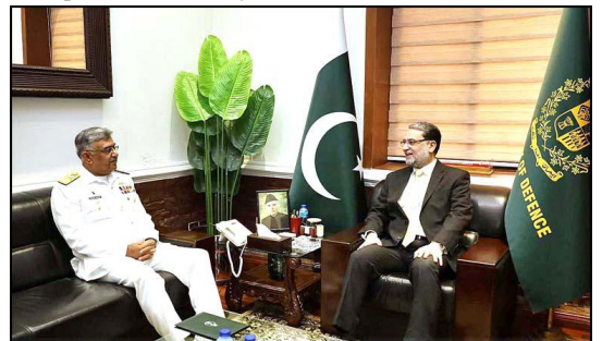
RAWALPINDI: Chief of the Naval Staff, Admiral Naveed Ashraf calls on Minister for Defence, Lt Gen Anwar Ali Hyder (Retd) in Ministry of Defence.