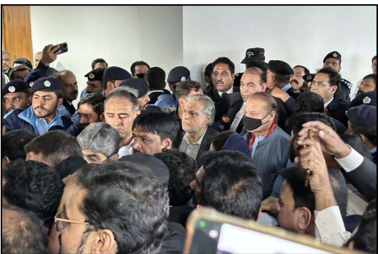
ISLAMABAD: Former Prime Minister, Nawaz Sharif arrives to appear before Islamabad High Court.

using LPG and wood as fuel," he added. Ali further explained that in terms of consumption, 57% of households primarily use 31% of the total gas and account for 11% of payments. He said that the upper class, which constituted 3% of gas connections, used 17% of the gas, leading to a 39% billing rate. He said the gas rate had not been increased for "Tandoor" across the country to facilitate the masses. The minister said gas prices for the Compressed Natural Gas (CNG) and commercial connections had also been increased. However, he said gas price for the fertilizer and power sectors had not been increased as the hike in the price for this sector directly affected the farmers of the country.