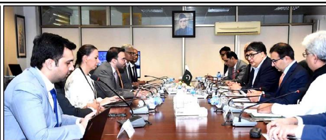
ISLAMABAD: Caretaker Federal Minister for Privatisation Fawad Hasan Fawad and Caretaker Federal Minister for Energy Muhammad Ali jointly chaired a meeting with representatives of IFC/World Bank regarding restructuring of DISCOs.

With the emergence of more bandwidth-hungry applications in recent years, PTCL Group is now preparing to introduce Pakistan's first commercial deployment of 400G per lambda on its ultra-long-haul network.