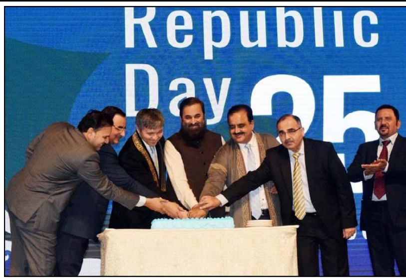
LAHORE: Governor Punjab Muhammad Balighur Rehman cutting cake during a ceremony held in connection with 31st Republic Day of Kazakhstan.