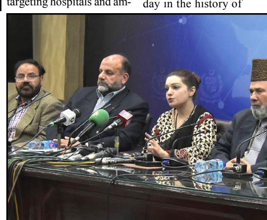
ISLAMABAD: Mushaal Hussein Mullick, SAPM on Human Rights and Women Empowerment along with APHC leaders speaks during a press conference at PID.

Independent Report ISLAMABAD: Mushaal Hussein Mullick, SAPM on Human Rights and Women Empowerment along with APHC leaders speaks during a press conference at PID.