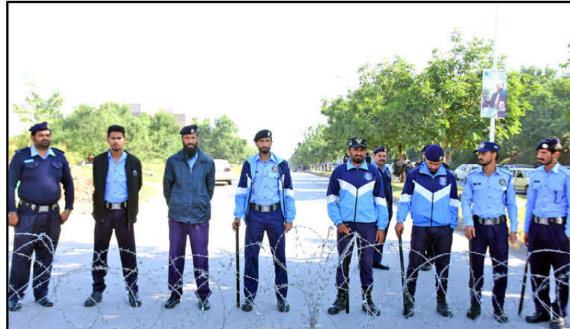
ISLAMABAD: Police Personnel take charge of the surroundings of Accountant General's Office, during the Former Prime Minister Mian Muhammad Nawaz Sharif hearing in Federal Capital.

ISLAMABAD (APP): Several passengers received minor injuries as the driver of Metro-bus had lost control and drove the bus over the boundary wall near Faiz Ahmed Faiz metro bus station here on Tuesday. According to details, eye-witnesses said that the metro bus moving towards Rawalpindi to Islamabad when accident occurred, in result several persons being injured, a private news channel reported. Sources said that the authorities have decided to register a case and initiate legal proceedings against the driver for what is being considered 'criminal negligence of driver'.