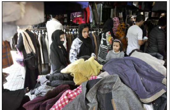
ISLAMABAD: People purchasing clothes from a vendor at H9 Bazar in the Federal Capital.

He said the SCO comprising 21 members with a mandate of enhancing economic cooperation, if fully engaged, could usher in an era of prosperity, progress and development in every sphere of life in the region.