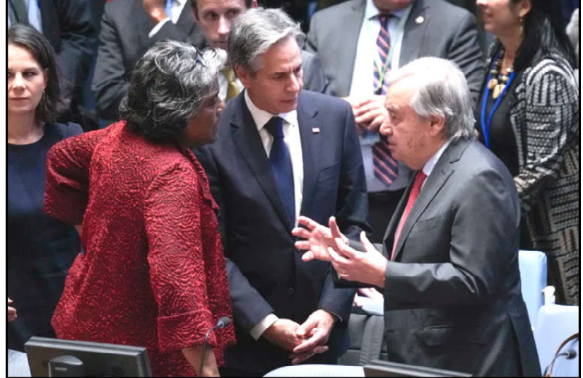
U.S. Secretary of State Antony Blinken, center, and U.S. Ambassador to the United Nations Linda Thomas-Greenfield, left, talk with UN Secretary-General Antonio Guterres before a Security Council meeting at United Nations headquarters.

Strip in relentless Israeli bombardments in retaliation for the attack, according to the territory's Hamas-run health ministry. "We are saying enough is enough," Emir Sheikh Tamim bin Hamad Al-Thani told a meeting of the Shura Council, Qatar's legislative body, according to a translation released by the royal court. "It is untenable for Israel to be given an unconditional green light and free licence to kill, nor is it tenable to continue ignoring the reality of occupation, siege and settlement." Qatar, a US ally which hosts a large US military base, also hosts an office of Hamas which doubles as the main residence of its self-exiled leader Ismail Haniyeh.