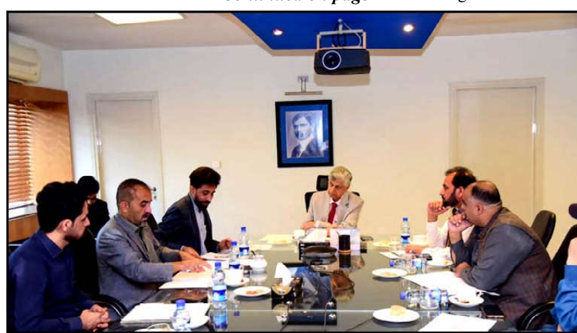
ISLAMABAD: A delegation of Afghan media meeting with Caretaker Federal Minister for Information and Broadcasting Murtaza Solangi