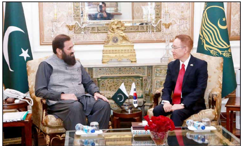
LAHORE: Ambassador of Korea Park Kijun meeting with Governor Punjab Muhammad Balighur Rehman.

infrastructure work, encompassing road networks, sewerage systems, water supply, electricity grids, and communication networks, would be concluded soon. A dedicated area for green spaces has been incorporated into the Lahore Prime CBD Punjab Quaid District, ensuring a balanced urban environment. The CBD Punjab to Walton Road stretch, spanning 4.2 kilometers, is being constructed using cutting-edge Blue Road technology. Upon completion, CBD Punjab will facilitate uninterrupted travel from Quaid District to Walton Road with three lanes and a strategically positioned flyover.