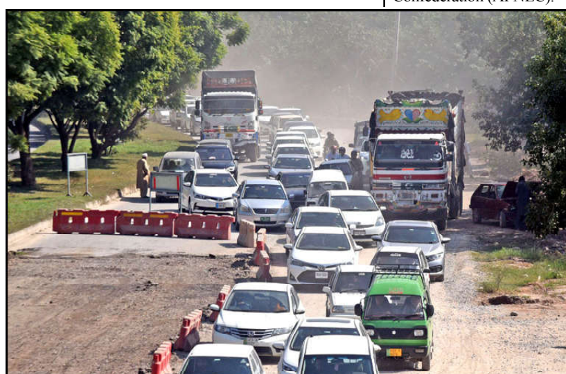
ISLAMABAD: A view of the diversion on Park road during for recarpeting of road in Federal Capital.

All officers and personnel were also directed to perform their duties with utmost dedication to uphold peace and security, with no room for negligence or complacency during duty hours. The Islamabad Capital Police is taking all possible measures to safeguard the lives and property of the citizens. Any disturbance to the public peace will not be tolerated. Citizens are urged to cooperate with the police and report any suspicious activities or objects to their respective police station or dial emergency helpline "Pucar-15".