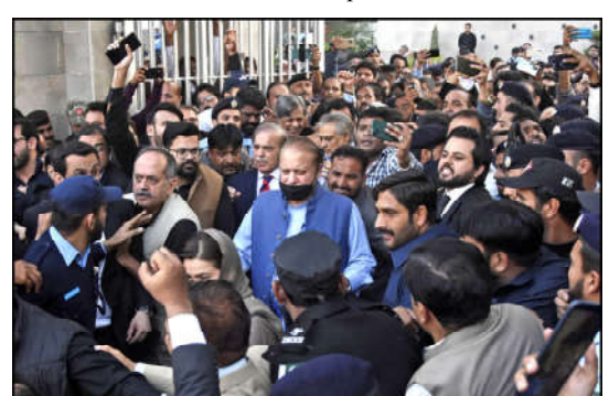
ISLAMABAD: Former Prime Minister Mian Muhammad Nawaz Sharif leaving after his hearing at Islamabad High Court in Federal Capital.

The Governor also questioned about performance of their respective departments.