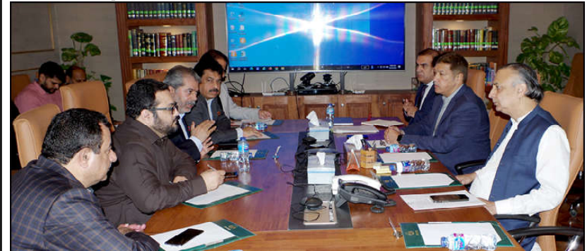
LAHORE: A delegation of Flour Mills Association meeting with Provincial Minister for Trade and Industry S. M Tanveer.

The price of 10 grams of 24 karat gold also decreased by Rs.343 to Rs.179,355 from Rs.179,698 whereas the prices of 10 gram 22 karat gold went down to Rs.164,409 from Rs.164,723, the All Sindh Sarafa Jewellers Association reported.