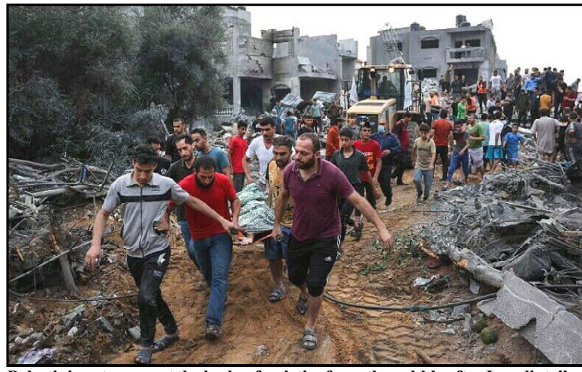
Palestinians transport the body of a victim from the rubble after Israeli strikes in Rafah in the southern Gaza Strip.