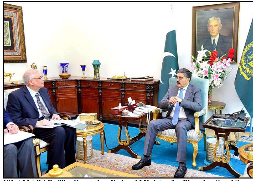
ISLAMABAD: The Caretaker Federal Minister for Planning Sami Saeed calls on the Caretaker Prime Minister Anwaar-ul-Haq Kakar.