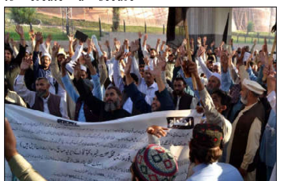
PESHAWAR: Paramedical Low Paid Employees are holding protest demonstration for acceptance of their demands, at Peshawar press club.

Independent Report LAHORE: Punjab Caretaker Minister for Transport Ibrahim Murad has said that more than 1,511 vehicles were impounded during the last two months for causing pollution. In a statement on Tuesday, he said that action was also taken against 4,682 vehicles without fitness certificates. He directed that no exception should be made for polluting transport and they should be seized immediately. The minister said that he would go to any extent to eliminate smog. Heavy fines will also be imposed on transport causing pollution and smog, he added. He directed the field staff to be proactive and take strict measures in this regard. "People have to understand their responsibility and fix their vehicle issues causing smog, otherwise the government has power to seized their vehicles and impose hefty fines. Citizens should refrain from violating smog laws and support the government in keeping the environment safe and clean."