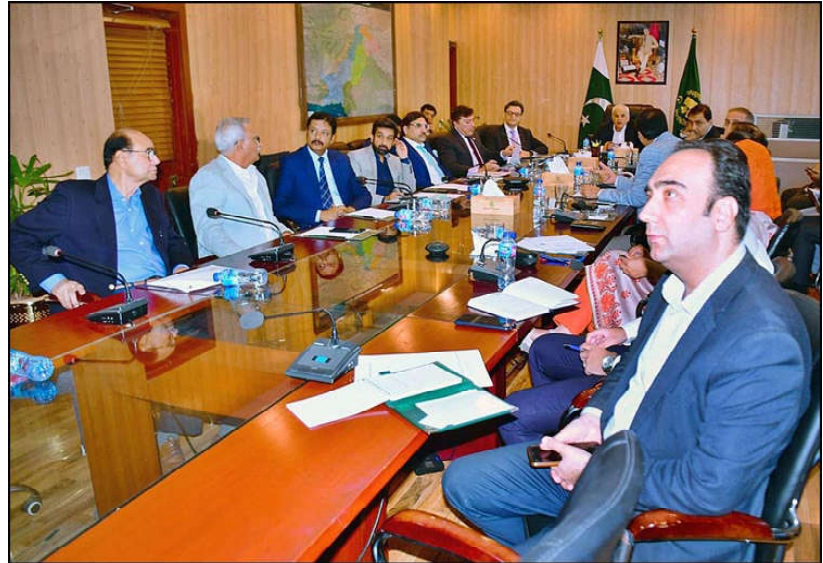
ISLAMABAD: Federal Minister for Railways, Communication and Maritime Affairs, Shahid Ashraf Tarar is chairing a review meeting at Ministry of Railways.