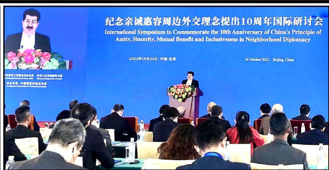
BEIJING: Chairman Senate of Pakistan, Muhammad Sadiq Sanjrani on Tuesday delivered a speech at the International Symposium held in Beijing to Commemorate the 10th Anniversary of China's.

ISLAMABAD (APP): Caretaker Federal Minister of Railways Shahid Ashraf Tarar on Tuesday commended the railway team for their successful efforts in boosting passenger and freight train revenues by 17%. Chairing a meeting to assess the operational and administrative capabilities of the railways, he said the commercialization of the railway station would be executed incrementally.