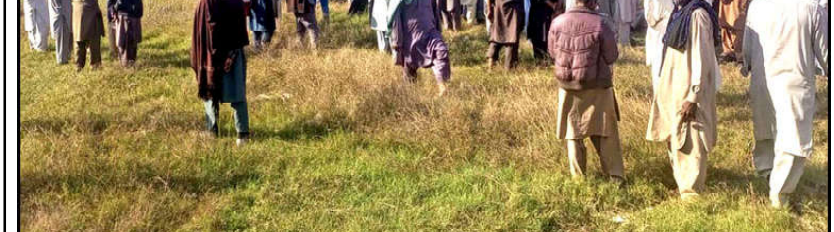
RAWALPINDI: Activists of Railway Carriage and Wagon Staff Association stop the train during protest in the favor of their demands in City.

Briefing the meeting, the CEO QESCO informed that a total of Rs. 437 billion are outstanding against agricultural consumers while Rs. 32 billion are payable against private consumers in the province.