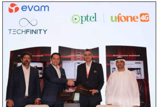
for creating real-time, cross-channel customer experience.

This will increase customer satisfaction in order to boost revenues