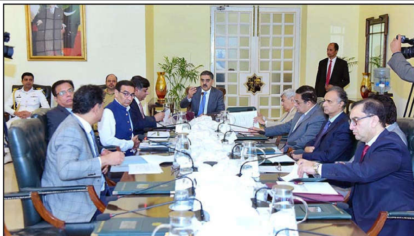
ISLAMABAD: Caretaker Prime Minister Anwaar-ul-Haq Kakar chairs a meeting regarding Urea availability for Rabi crop.

Sanofi-Aventis witnessed a maximum increase of Rs 56.44 per share, closing at Rs 808.94, whereas the runner-up was Pak Services with a Rs 47.83 rise in its per share price to Rs 749.83. Rafhan Maize witnessed a maximum decrease of Rs 100.00 per share closing.