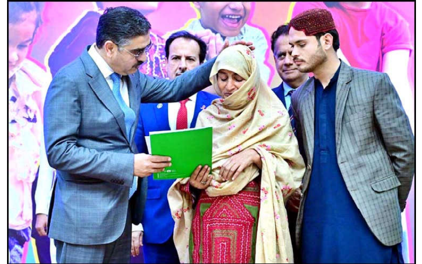
ISLAMABAD: The Caretaker Prime Minister Anwaar-ul-Haq Kakar distributes cheques among the families of martyred polio workers and polio workers who got injured in the line of duty.

Murtaza Solangi held out the assurance that the Ministry of Interior and the Ministry of Foreign Affairs would be contacted on the visa issues of Afghan journalists.