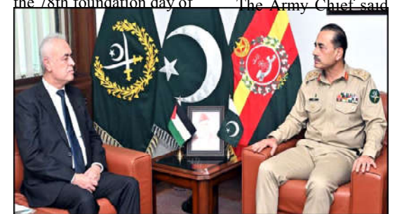
the United Nations, saying Pakistan has a unique history of serving under the UN flag for a more peaceful, prosperous and sustainable world. The Army Chief said on this day the international community must not forget the shared responsibility of the United Nations.

the Armed Forces of Pakistan adhere to the principles of the United Nations charter. The Army Chief further said "We are striving to make the world a better place for future generations as per the vision of our elders no matter what the cost."