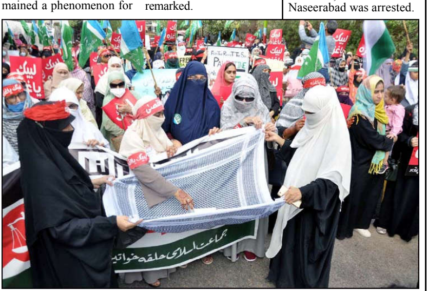
HYDERABAD: Members and supporters of Jamat-e-Islami (JI Women Wing) are holding protest demonstration against Israeli cruel and inhumane acts and express unity with the innocent people of Palestine, held at Hyderabad

Anti-Narcotics Force (ANF) while conducting five operations across the country managed to recover 108 kg drugs and arrested three accused, said an ANF Headquarters spokesman here on Monday. He informed that 24.8 kg hashish was recovered from an accused, resident of Kohat arrested on Super Highway Karachi. On the pointation of the accused, a co-accused, resident of Karachi was also arrested.In another ANF recovered 180 grams Ice drug from a parcel booked for Dubai.30 kg hashish concealed in doors of a vehicle was recovered During the operation, an accused, resident of Naseerabad was arrested.