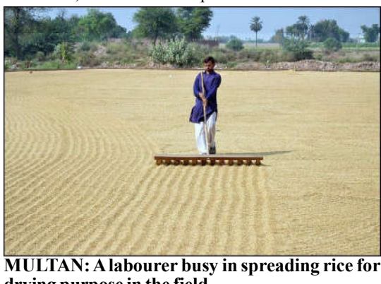
drying purpose in the field.

This will help ensure smooth supplies of Pakistan's pharmaceutical / Over-the-Counter medicine to needy