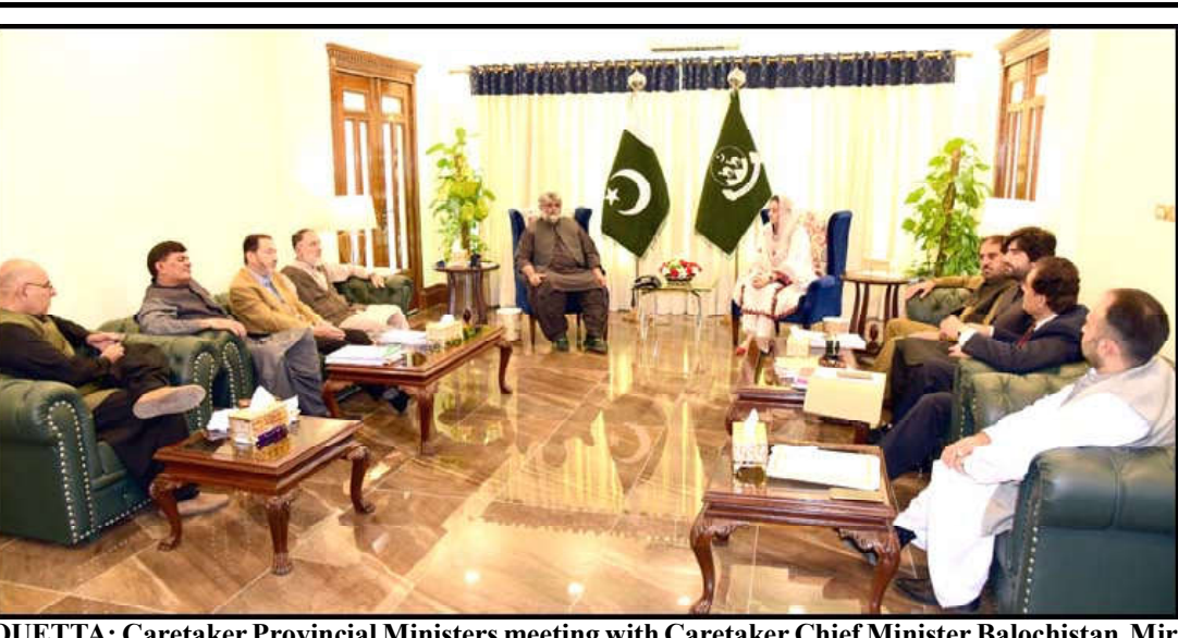
QUETTA: Caretaker Provincial Ministers meeting with Caretaker Chief Minister Balochistan Mir

He said Liaquat Ali Khan's vision for a united, democratic, and progressive Pakistan is a beacon of light and source of inspiration for all of us.