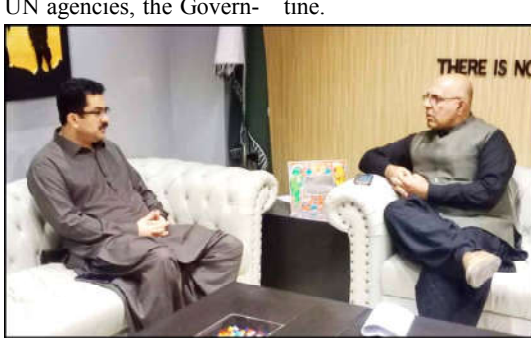
OUETTA: Director General Balochistan Levies Force Naseebullah Khan Kakar meeting with Caretaker Information Minister Jan Achakzai

Taking to X (Formerly Twitter), the caretaker prime minister expressed Pakistan's complete solidarity with the oppressed people of Pales-