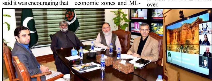
QUETTA: Caretaker Chief Minister Balochistan Mir Ali Mardan Khan Domki being briefed about Provincial Cloud Strategy and Digital Balochistan Policy

He said the caretaker dispensation in collaboration with the provincial governments and district administration was striving to ensure that transport fares were reduced after a cut in petroleum products prices. The minister said it was the commitment of the caretaker government to leave the country in a better state than it was handed