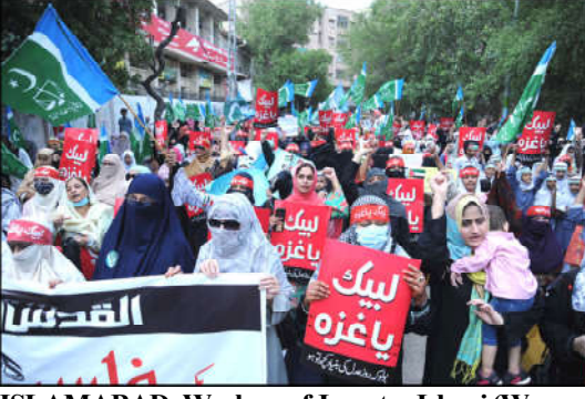
ISLAMABAD: Workers of Jamat-e-Islami (Women wing) hold banners and placards during "Free Palestine Rally" in City.

creative endeavors. The minister emphasized that promoting the national heritage and culture among the people is key to preventing societal issues such as hatred and intolerance, leading to peace and