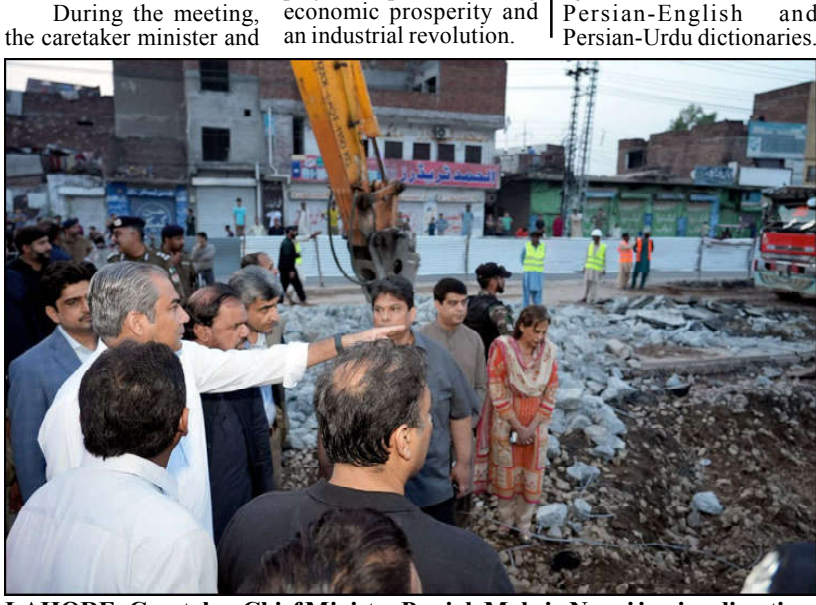
LAHORE: Caretaker Chief Minister Punjab Mohsin Naqvi issuing directives regarding construction works during his visit to under construction controlled accessed corridor project.