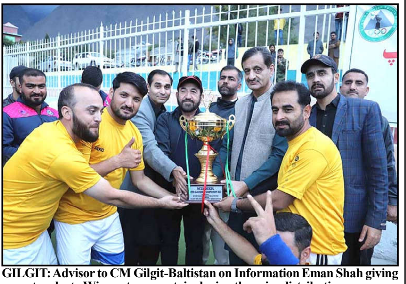
away trophy to Winner team captain during the prize distributing ceremony of Inter Club Open Hockey Championship.

He expressed gratitude to China for its support for Pakistan's sovereignty, territorial integrity, and economic security, and its principled support on the issue of Kashmir.