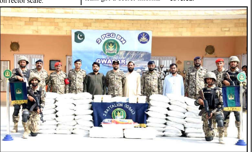
HUB: Pakistan Coast Guard Officials are showing huge apprehended drugs worth millions of rupees to media persons during press conference held at PCG Gwadar Headquarters in Hub.

Later, during search, 833 kilogram of charas and 42 kilogram of ice was re-