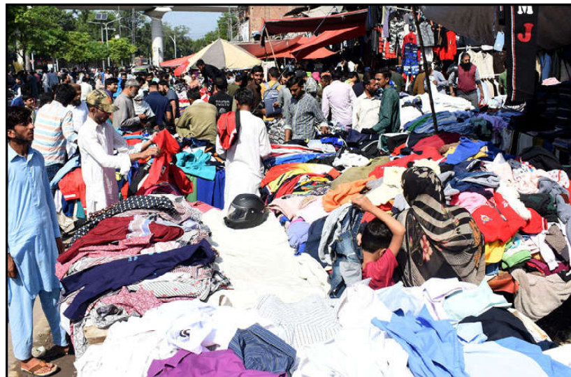
LAHORE: A large numbers of people are busy is buying warm clothes at a Landa Bazaar in Provincial Capital.