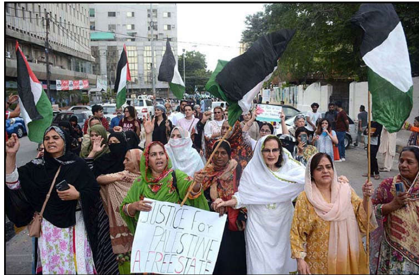
KARACHI: Activists of civil society organize a protest demonstration to show solidarity with the people of Palestine, call for an immediate ceasefire at Karachi Press Club.

ease in acquiring work visas. "We are launching a one-window operation for the promotion of investment in Punjab," he said, adding that Italian investors should visit Punjab and the government would provide them all possible facilitation. The Italian ambassador said that the Trade Commission had launched its working to enhance mutual trade, adding, "We are taking measures to provide ease in acquiring work visas." The ambassador vowed that cooperation in the cultural, tourism and trade sectors would be further promoted.