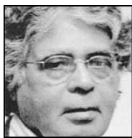
By Ghazi Salahuddin

Ideally, any judicial and legislative attempts to address these issues — as well as the public response to such efforts — should be based on a holistic, contemporary understanding of judicial independence that also includes its 'internal' aspect, instead of an outdated, knee-jerk view that is enamoured by a CJP as the paterfamilias and equates independence with complete insulation of the judiciary. — Courtesy Dawn