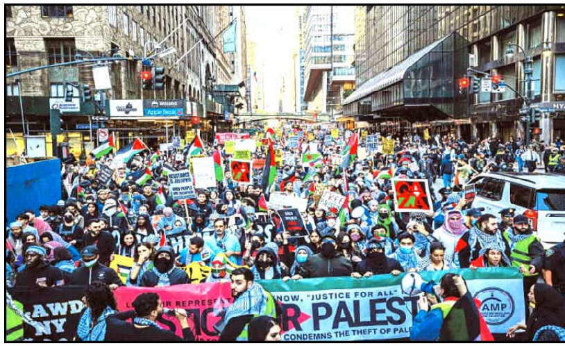
People hold a demonstration in support of Palestinians in New York City.

Monitoring Desk TOKYO: Support for the cabinet of Japanese Prime Minister Fumio Kishida has fallen to 32.3%, the lowest since it was formed in 2021, Kyodo News said on Sunday, based on its own opinion poll. The figure was down 7.5 points from September's poll and was worse than the support of 33.1% for the cabinet at the end of last year, the agency said. As many as 58.6% of respondents in the telephone poll carried out on Saturday and Sunday said they did not expect much benefit from an economic package the government plans to compile by the end of this month. The poll also showed that 63.2% of respondents see the need for a cut in income tax to enable them to cope with inflation.