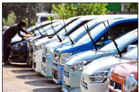
ISLAMABAD: A worker is busy in cleaning vehicles outside a car showroom at sector G-8 in Federal capital.