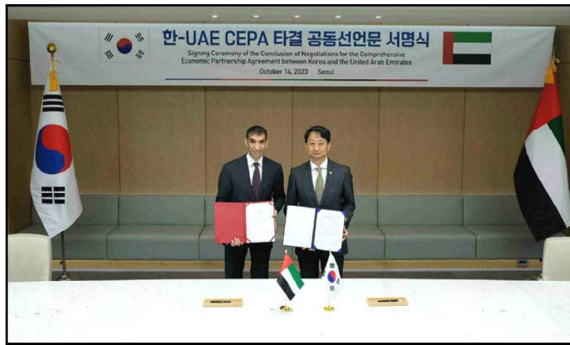
United Arab Emirates' Minister of Foreign Trade Thani Al Zeyoudi and South Korea's Trade Minister Dukgeun Ahn meet in Seoul, South Korea.

tions with three other Arab states, according to AFP. As part of a package, Saudi Arabia — which like Israel has tense relations with Iran — has been seeking security guarantees from the United States, its longtime partner and consumer of its oil. However, Prince Mohammed is deeply controversial in the United States, where intelligence linked him to the 2018 killing of Jamal Khashoggi, a US-based Saudi journalist, which Riyadh has denied, blaming rogue operatives. President Joe Biden — who once vowed to make the kingdom a pariah — drew protests at home after a visit to Saudi Arabia last year when he shared a friendly fist-bump with Prince Mohammed.