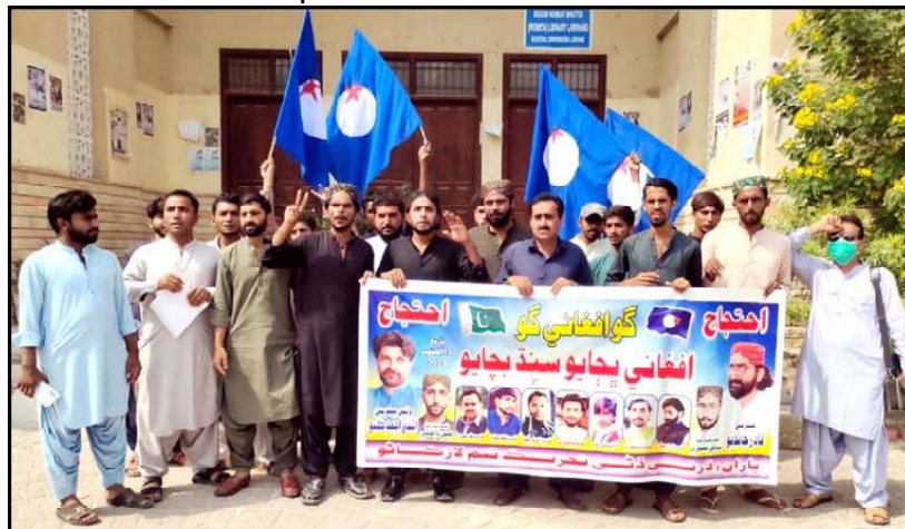
LARKANA: Activists of Dharti Dhani Tehreek are holding protest demonstration against Afghan refugees, at Jinnah Bagh in Larkana.

In the year 2022, as many as 20 cases of poliovirus were reported across the country. Pakistan was come near to eradication of disease in year 2021 when only one case was reported in the country.