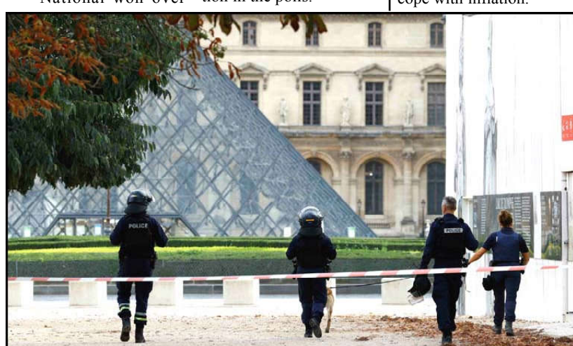
French police officers patrol in front of the Louvre museum, closed for security reasons, in Paris, as French government puts the nation on its highest state of alert after a deadly knife attack in northern France.

won 34% of the vote in the first round. She has said she would bring back the popular social spending that characterized Correa's decade in power, pledging free medicine, increased worker protections and direct aid to those in need. She also has promised to use $2.5 billion from international reserves to shore up the economy. Noboa, also an ex-lawmaker who has promised job creation - especially for young people - was a surprise entrant to the run-off, winning 23% in the first round. He is the son of multimillionaire banana magnate Alvaro Noboa, who himself ran unsuccessfully for president numerous times. Outgoing President Guillermo Lasso called the election early to avoid impeachment on charges he disregarded warnings of embezzlement related to a contract at a state company. He has denied the charges. The winner will govern only between December and May 2025, when the victor of regularly scheduled elections will take office.