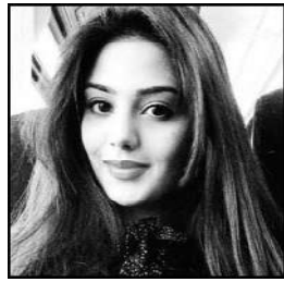
By Reema Omer

It is heartening to note that according to the 10-year Indicative Generation Capacity Expansion Plan, the country aims to produce 60pc of electricity through non-fossil fuels by 2030. However, maximising the use of coal for the remaining 40pc would nullify these very efforts. Given our potential in hydel, wind and solar energy — with hydel already contributing 37.6pc to the energy mix according to August data — these indigenous, renewable sources should be further explored and optimised. While coal might offer a temporary economic respite, the environmental repercussions are far-reaching and long-term. Pakistan must carve out an energy strategy that not only caters to its immediate needs but also ensures a green and sustainable future. Published in Dawn, October 15 th , 2023.