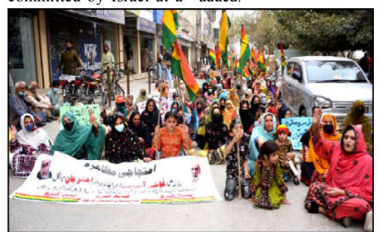
QUETTA: Activists of Balochistan National Party Women Wing hold a protest in favor of their demands outside QPC.

He said Israel had crossed all limits by killing children, women and innocent people. He regretted that the international community had failed to prevent Israel from the genocide of the Palestinian people. "Pakistan supports the establishment of an independent state for the Palestinian people that is the only solution to bring lasting peace and stability in the region," the president added.