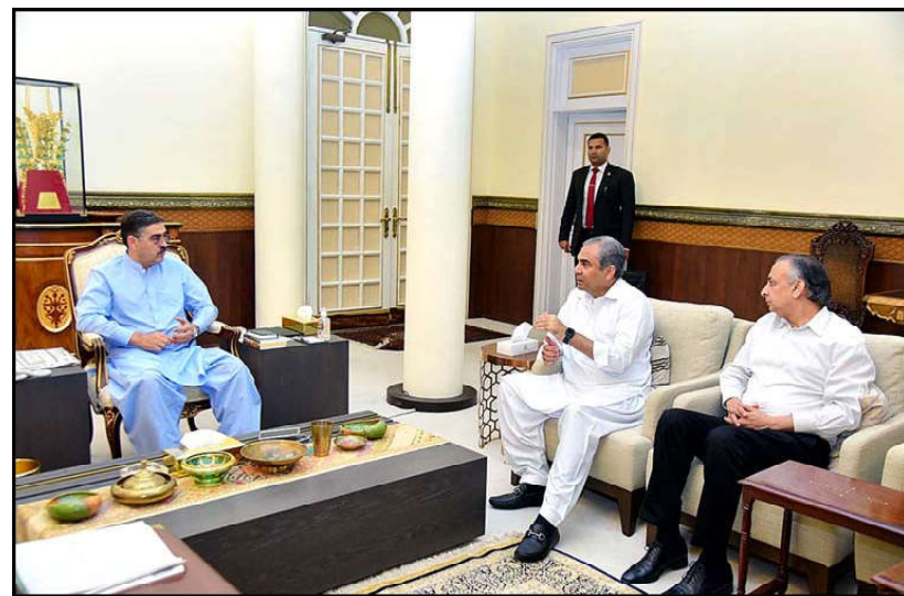
ISLAMABAD: The Caretaker Chief Minister of the Punjab Mohsin Naqvi calls on the Caretaker Prime Minister Anwaar-ul-Haq Kakar.