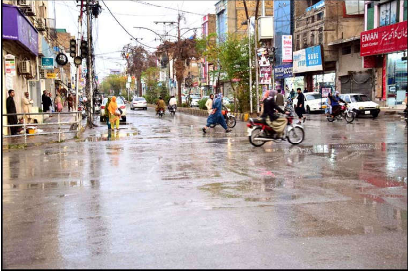
QUETTA: A view of 1 st rain of winter in the provincial metropolis

clause 39 of the Election Act 2017, was in effect since July 20 this year. Following the un-freezing of electoral lists, eligible individuals now have the opportunity to update their voter information. He urged all eligible citizens to ensure the correctness of their voter registration, modifications, and transfers, and align their particulars with their computerized national identity card details by October 25, 2023. Answering a question, he explained that the law mandates voter registration to align with an individual's permanent or current address, as indicated on their CNIC. Voting from a third address is prohibited. However, government employees posted in a different district or province can register their vote and their family's at the post office in their new location.