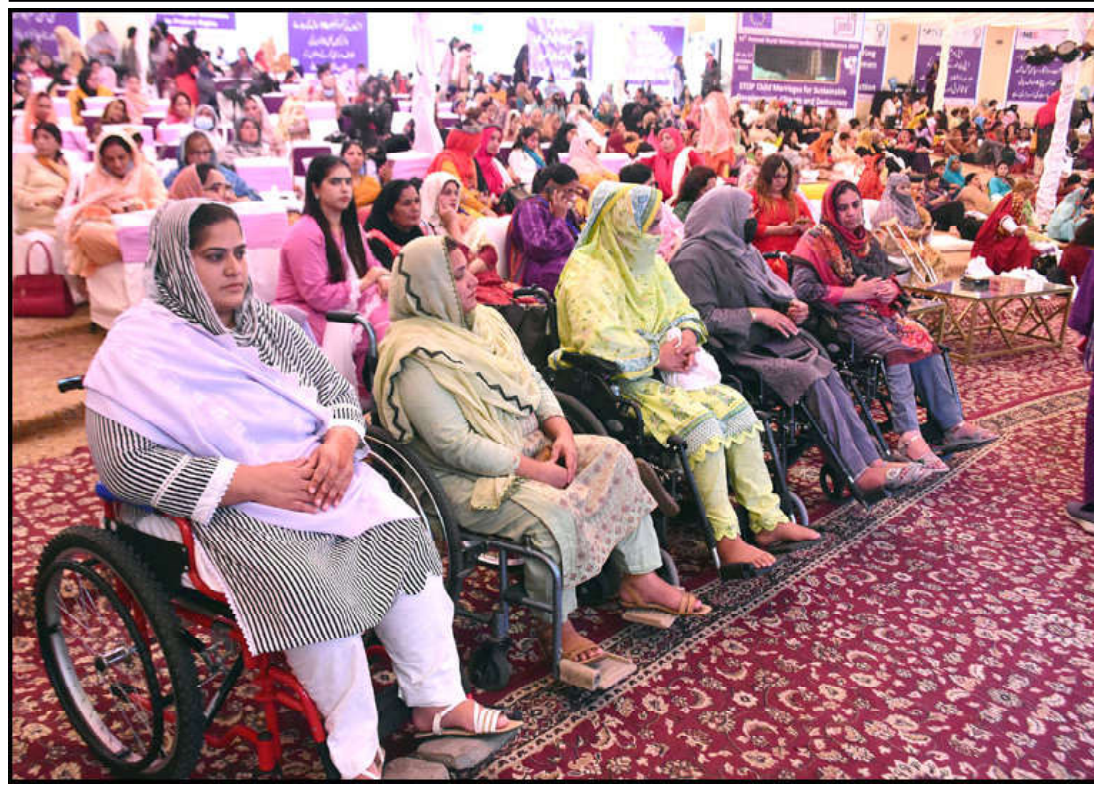
ISLAMABAD: Women participants enjoying during 16th annual Rural Women Leadership Conference, in connection with International Day of Rural Women, at Lok Virsa in Federal Capital.