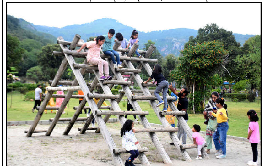
ISLAMABAD: Children are enjoying Sunday Holiday at Japanese Children Park in Federal capital.

PKM starts from Sukkur, Sindh and reaches Multan, the economic center of Punjab in the north, with a total length of 392 km and a design speed of 120 km per hour.