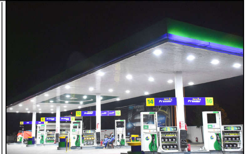
ISLAMABAD: A view of deserted petrol pump at Melody in Federal Capital, As Petrol prices are expected to drop below Rs290 per litre, in Pakistan, an anticipated move in response to global oil price fluctuations.

Similarly, taking stringent action against encroachments on Simly Dam Road, Karnal Sher Khan Avenue, Maandi Mor Margalla Town Phase-2 and Murree Road, the authorities removed additional sheds and fruit stalls on both the sides of the road while clearing public passages.