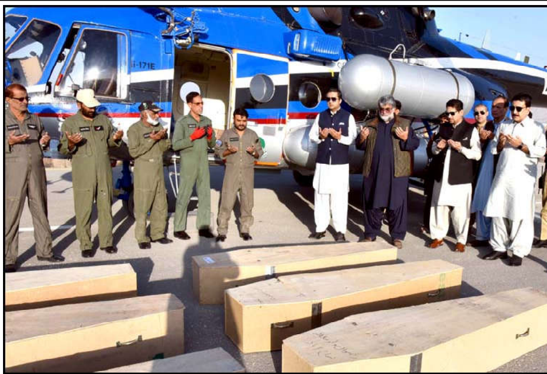
QUETTA: Caretaker Chief Minister Balochistan Mir Ali Mardan Khan Domki offering Fateha for labourers who were killed in Turbat before despatching their dead bodies to Multan