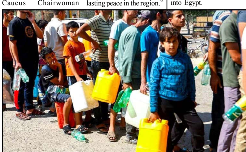
Palestinians queue as they wait to fill cans with fuel, amid shortages of fuel, as the Israeli-Palestinian conflict continues, at a petrol station in Khan Younis in the southern Gaza Strip.

Israeli bombardments on the Gaza side of the Rafah crossing into Egypt, the main crossing out of Gaza not controlled by Israel, have disrupted operations there. Aid from several countries has been building up in Egypt's Sinai peninsula due to a failure to reach a deal enabling its safe delivery to Gaza and enabling evacuations of some foreign passport holders through the Rafah crossing into Egypt.