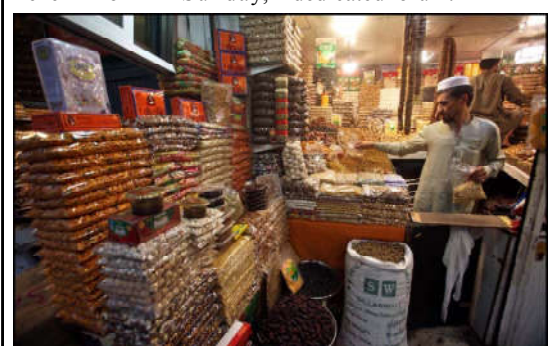
PESHAWAR: Dry fruits are being selling at a shop, at Saddar Bazar in Peshawar.

He said the thirty year dominance of the former association of industrialists (IAP) has been ended that is a good omen for industrialists who since long were in dire need of having a body that would represent their genuine concerns and problems. He said the registered association was indispensable for industrialists as their concerns were not addressed according to their wishes due to the unavailability of a dedicated forum.