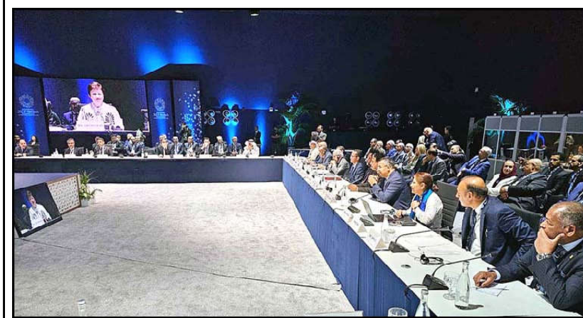
MARRAKECH: Dr. Shamshad Akhtar, Caretaker Federal Minister for Finance, Revenue, and Economic Affairs, participated in a high-profile meeting of Finance Ministers with the Managing Director of the International Monetary Fund (IMF) in Marrakech.

The interim government, led by Prime Minister Anwar-ul-Haq Kakar, is charging zero general sales tax (GST) on all petroleum products while the rate of petroleum levy (PL) on petrol is Rs60 per litre.