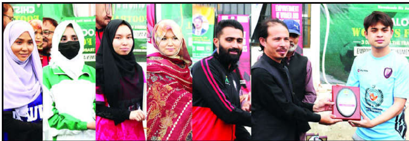
QUETTA: Provincial Caretaker Minister for Sports Nawabzada Jamal Khan Raisani giving away shields to participants of All Balochistan Women Football Trainers Workshop

Ultimately, the challenges surrounding Afghan migration to Pakistan are complex, but with thoughtful and comprehensive policies, the nation can navigate this issue while upholding its humanitarian values and maintaining its national security.