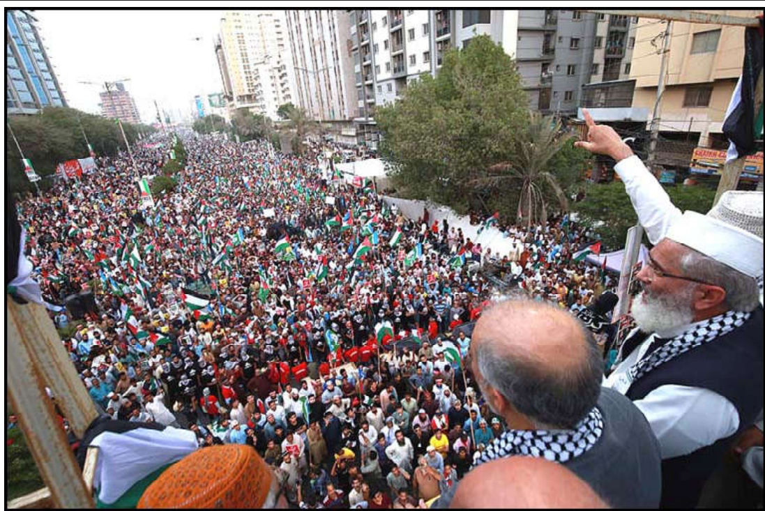
KARACHI: Ameer Jamaat-i-Islami Siraj ul Haq addresses "Al-Aqsa Palestine March" organized by JI at Shahrah-e-Faisal.

boost frequent people-to-people contacts and enhance understanding through academic linkages. The higher volume of trade and businesses would result into integrated development which would eventually promote, harmony and sustainable development, he added. "CPEC is the journey towards economic growth in the globalized world", he maintained. Chinese ambassador to Pakistan Jiang Zaidong expressed his country's readiness to further promote CPEC in partnership with Pakistan, adding "We are ready to work with our Pakistani colleagues from all walks of life to further promote the projects in the next ten years of CPEC." "What was agreed between President Xi Jinping and the Pakistani leaders for a high-quality sustainable and enhanced cooperation and support in the fields of security and development, we can implement with mutual consensus", he said. The ambassador was of the view that Pakistan and China could jointly make the CPEC, a corridor of love and peace. He said that mutual cooperation in new fields such as industry, agriculture, mining, science and technology and IT sectors could be increased.