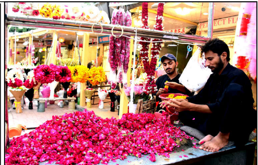
ISLAMABAD: A vendor is busy preparing red rose garland at his workplace at sector F-6 in Federal capital.