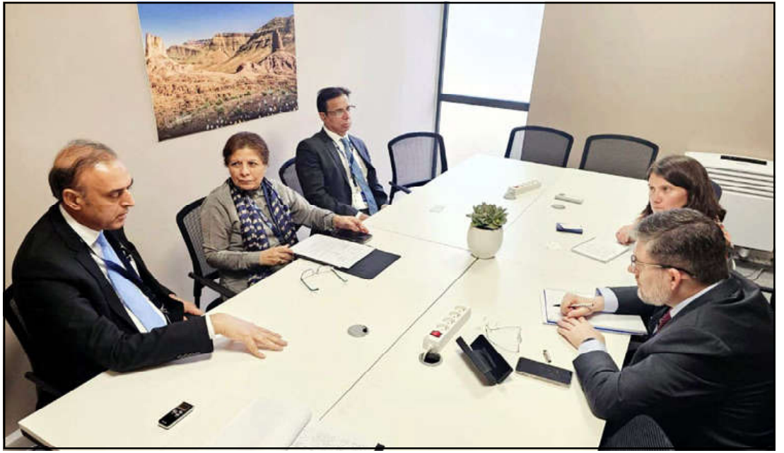
Marrakech: Federal Minister for Finance, Revenue, and Economic Affairs, Dr. Shamshad Akhtar held a meeting with a high-level delegation of Moody's, the global financial services company, during her visit to Morocco for the annual meeting of WB/IMF. During the meeting, Dr. Shamshad Akhtar reiterated the government's commitment to transparency in order to foster investor confidence and maintaining a positive credit rating of Pakistan in the global financial markets.

These efforts are essential to secure a more prosperous, equitable, and sustainable global future, he noted. Concluding his remarks, Al-Budaiwi praised the advancements resulting from the structural reforms implemented by GCC countries in response to economic challenges. These reforms have yielded favourable outcomes, including economic growth, an improved business environment, increased competitiveness, and a substantial rise in women's workforce participation. Furthermore, the non-oil sector experienced a notable increase of 4.8% in 2022.