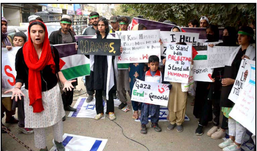
QUETTA: Activists of Quetta Foundation hold a protest to express solidarity with Palestine, while the protesters are burning the Israeli flag at the end front of the press club.

PESHAWAR (INP): The Counter Terrorism Department (CTD) Sunday published the list of 128 more wanted criminals with the head money of each of the criminals enlisted in the released list. The price on the head of wanted terrorists has also been fixed, along with the pictures, CNIC number, place, father record. The head money of the terrorists has been fixed from Rs. 300,000 to Rs. 10 million, the document issued by CTD here on Sunday. The name of the informant will be kept confidential, a CTD official said.