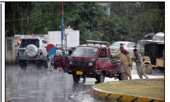
MUZAFFRABAD: People pushing an out of order loaded van at a road during rain in the city.

LAHORE (INP): The City received heavy rain, turning the weather cold and with people taking it as a harbinger of winter. The rain, hailstorm and strong winds also lashed different parts of upper Punjab which brought down temperature shapely but left several areas without electricity. With the torrential rain as usual parts of the City plunged into darkness as most of the Wpada feeders.