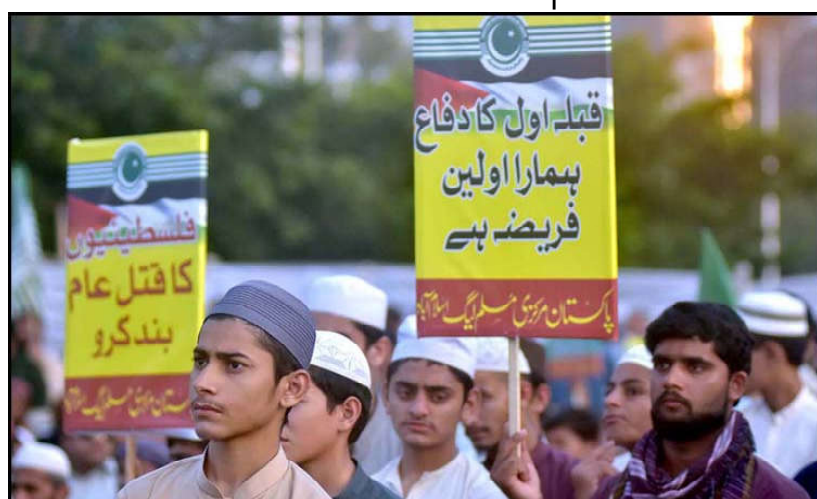
ISLAMABAD: Youngsters participating in a rally while thousands of people protested across the country after Friday prayers against Israel's siege and fierce bombing on the Gaza Strip in retaliation to Hamas attacks.

that Safe City Islamabad is playing a significant role in various sectors through modern techniques, including the Police Operations Center, Emergency Control Center, Data Hub, Dispatch Control Center, E-Challan System, and the "Pukar-15" helpline. Face recognition cameras have been installed at the entry and exit points of the city which are playing an important role in identifying suspicious elements. The delegation was also apprised of the functionality and benefits of the Safe City cameras.