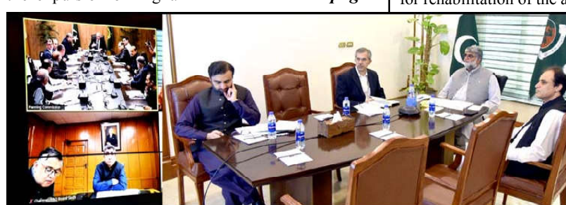
QUETTA: Caretaker Chief Minister Balochistan Mir Ali Mardan Khan Domki attending meeting of Policy & Strategy Committee formed about rehabilitation activities after last year's devastating floods between the government of Pakistan and international relief institutions through video link

The rally taken out under provincial and district leadership of JUI marched through the Jinnah road, Shahrah-e-Iqbal and Adalat