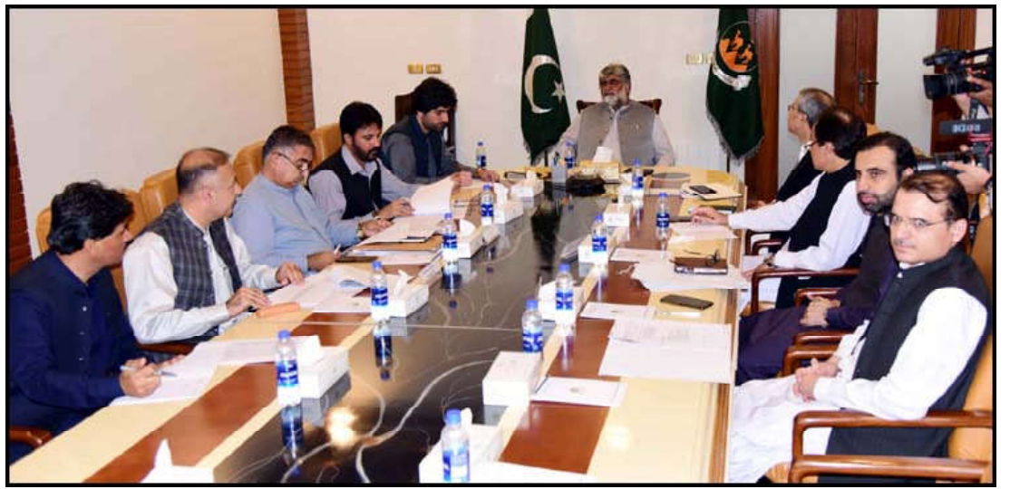
QUETTA: Caretaker Chief Minister Balochistan Mir Ali Mardan Khan Domki presiding over a meeting regarding National Program for Agriculture Development and Alternate Energy.