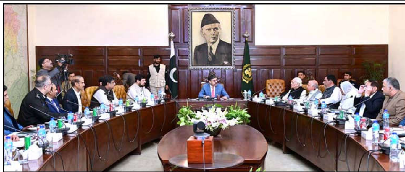
PESHAWAR: The Caretaker Prime Minister Anwaar-ul-Haq Kakar chairs a meeting on the matters related to Khyber Pakhtunkhwa.

Similarly, the Pakistan Tehreek e Insaaf, Insaaf Lawyers Forum and Pakistan Markazi Muslim League also took out rallies and held demonstrations in favour of Palestine and against Israel's cruelty on the Palestinians.