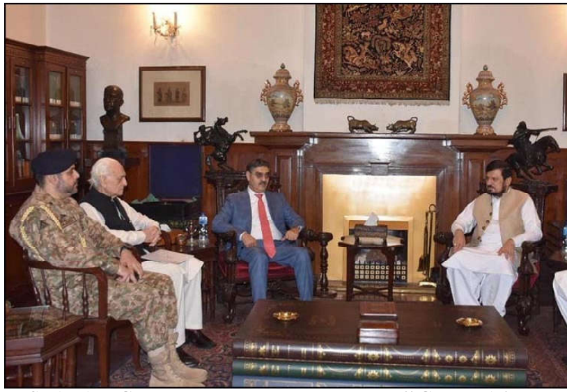
PESHAWAR: Governor Khyber Pakhtunkhwa Haji Ghulam Ali and the Caretaker Chief Minister Khyber Pakhtunkhwa Azam Khan call on the Caretaker Prime Minister Anwaar-ul-Haq Kakar.

The chief secretary said that the federal government has already directed the NADRA.