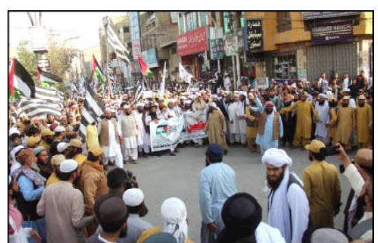
QUETTA: Activists of Jamiat Ulema-e-Islam (JUI-F) are holding protest rally against Israeli cruel and inhumane acts and express unity with the innocent people of Palestine, at Mannan Chowk