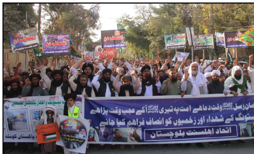
QUETTA: Members of Ittehad Ahlesunnat Balochistan are holding protest demonstration against Mastung tragedy, at Quetta press club.