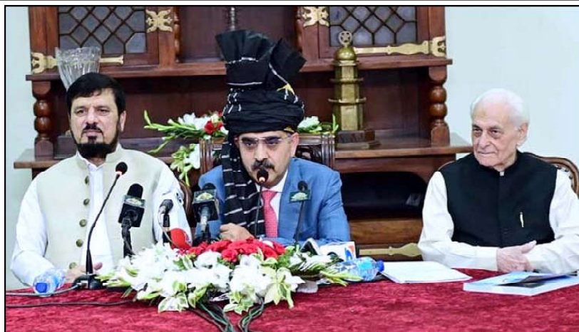
PESHAWAR: The Caretaker Prime Minister Anwaar-ul-Haq Kakar talks to a delegation of Sarhad Chamber of Commerce and Industry.

He directed PITB (Punjab Information Technology Board) to prepare an app for all heads of revenue collection and issued instructions to include Abiyana Agricultural Income Tax municipal fees and chowkidara charges in the app.