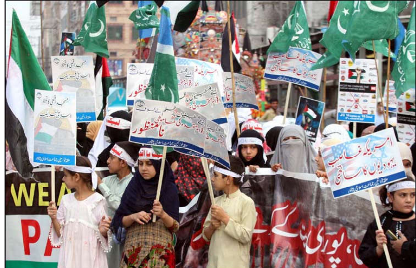
PESHAWAR: Activists of Jamaat-e-Islami (JI) Women Wing are holding protest rally against Israeli cruel and inhumane acts and express unity with the innocent people of Palestine, at GT road in Peshawar.