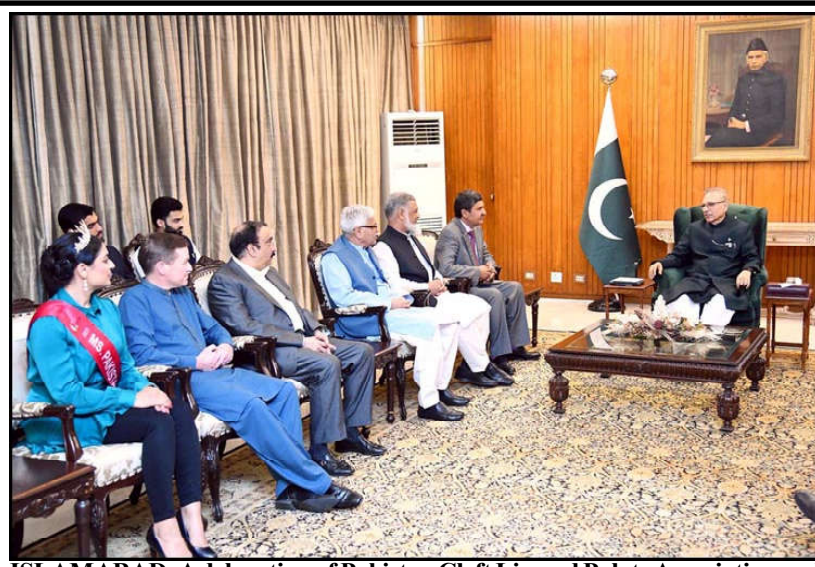
ISLAMABAD: A delegation of Pakistan Cleft Lip and Palate Association and British Plastic Surgery Team, called on President Dr Arif Alvi, at Aiwan-e-Sadr.

According to the Civil Aviation Authority (CAA), a fire pit simulator was used to mimic a plane crash inferno that was attacked and doused off by the emergency responders. The objective of the exercise was to ensure the efficiency and preparedness of airport stakeholders in case of emergencies. An emergency response time of less than two minutes, as targeted, was achieved during the exercise. Rescue and Fire Fighting Services, Civil Aviation, Sheikh Zayed Hospital and PAF participated in this exercise.