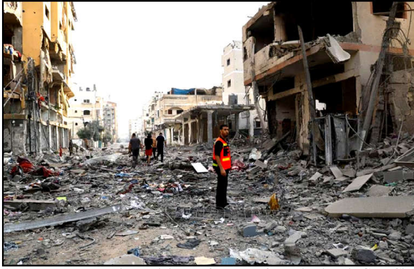
A rescuer looks on amid debris in the aftermath of Israeli strikes, in Gaza City.