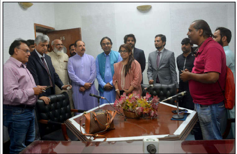
LAHORE: Caretaker Federal Minister for Information and Broadcasting, Murtaza Solangi visit Radio Pakistan.

It may be mentioned here that the interim government has already announced to launch Health Cards in the province by end of this month.