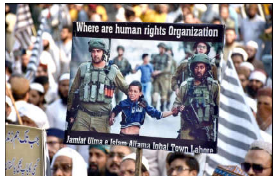
LAHORE: Pakistan's political party Jamiat Ulama-e-Islam and activists participating in a rally outside press club while thousands of people protested across the country after Friday prayers against Israel's siege and fierce bombing on the Gaza Strip in retaliation to Hamas attacks.

individuals in Pakistan have lost their sight due to this insidious disease. He stressed that to combat eye diseases effectively, it is imperative to control diabetes, blood pressure, and air pollution, as these factors have a detrimental impact on vision. Dr. Nasir highlighted that individuals with diabetes and high blood pressure are more susceptible to developing glaucoma. The minister also shared a ray of hope, noting that early diagnosis and treatment can control a staggering 80 percent of glaucoma cases. He pointed out that individuals aged 40 and above, as well as those with weak eyesight, are at higher risk of developing glaucoma.