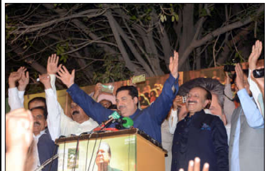
FAISALABAD: Former Federal Minister Khuram Dastgir addressing during corner meeting on 12 October, for the preparation of the reception gathering of Muslim League (N) on the arrival of Former Prime Minister Nawaz Sharif.

In fourth operation, ANF conducted a raid in Jamrud Khyber area.