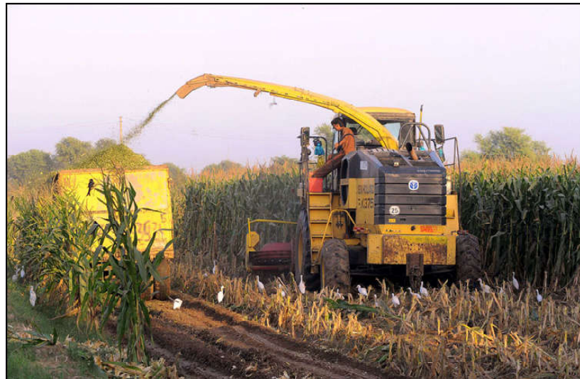
MULTAN: Farmers harvesting corn plants through a harvester machine in their fields to be used as fodder for their animals.