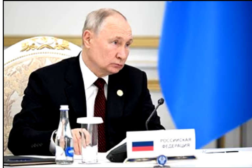
Russian President Vladimir Putin attends the Commonwealth of Independent States (CIS) leaders' summit in Bishkek, Kyrgyzstan.

der", but that Washington would not second guess its ally's decision to tell civilians to get out of the way. "We understand what they're trying to do and why they're trying to do this—to try to isolate the civilian population from Hamas, which is their real target," he said on MSNBC. The northern half of the Gaza Strip includes the enclave's biggest settlement Gaza City. The U.N. said it had been told that Israel wanted the entire population to move across the wetlands that bisect the enclave. "Civilians of Gaza City, evacuate south for your own safety and the safety of your families and distance yourself from Hamas terrorists who are using you as human shields."