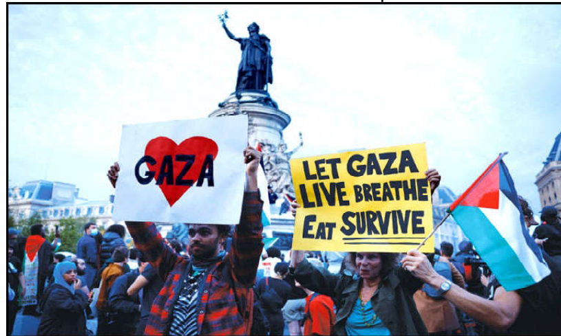
Protesters hold Palestinian flags during a demonstration in Paris.

Monitoring Desk PARIS: France has decided to ban pro-Palestinian protests as they are "likely to generate disturbances to public order". Interior Minister Gerald Darmanin said on Thursday in a letter to prefects across the country. Earlier this week, Hamas called for protests across the Muslim world on Friday to support Palestinians. Two pro-Palestinian demonstrations in Paris had already been banned on Thursday for fear of outbreaks. France is home to some of Europe's largest Muslim and Jewish populations and conflicts in the Middle East can stoke tensions there—which the interior minister said the government aimed to avert.