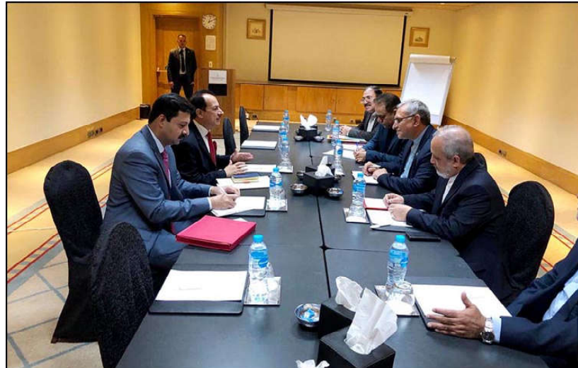
CAIRO: Federal Minister for National Health Services, Regulations and Coordination Dr. Nadeem Jan met Minister of Health Iran Dr. Bahram Eynollahi on the sidelines of 70th Session of the WHO's Regional Committee for Eastern Mediterranean.