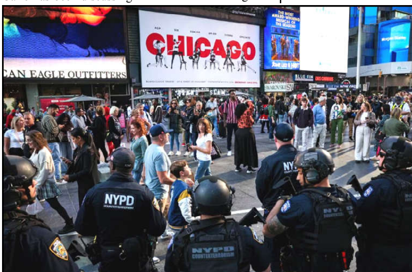
Members of the New York City Police Department (NYPD) Counterterrorism unit patrol in Times Square, as the city takes security precautions ahead of planned demonstrations, in New York City, U.S.

city concerns, particularly over a possible flare-up of antisemitic and Islamophobic violence, have followed an attack last Saturday by Hamas gunmen from parts of southern Israel. In the deadliest Palestinian attack in Israel's history, more than 1,300 Israelis were killed and scores were taken captive. Heavy aerial bombardment of Gaza by Israeli armed forces in response has killed at least 1,500 people and injured 6,600 others in the crowded Palestinian coastal enclave, according to health officials there. Former Hamas chief Khaled Meshal called for protests across the Muslim world on Friday in support of Palestinians, a message amplified on social media by calls for a day of resistance on behalf of the people of Gaza. New York City officials said they were bracing for at least one major demonstration planned for Times Square on Friday. "Every member of the New York Police Department will be ready and be in uniform tomorrow," NYPD Chief of Patrol John Chell told reporters.