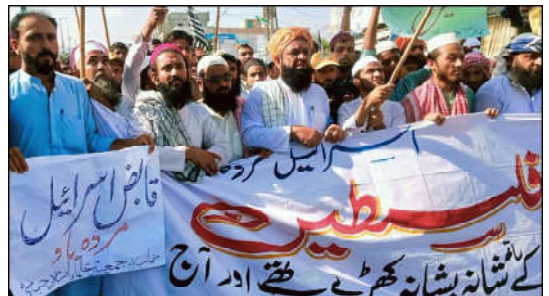
HUB: Activists of Jamiat Ulama-e-Islam (JUI-F) are holding protest rally against Israeli cruel and inhumane acts and express unity with the innocent people of Palestine, at RCD road in Hub.

Moreover, the recovery of amount against the dues of QESCO is also continued as over Rs. 83 crore were collected from the defaulters. Similarly, over Rs. 12 crore were also recovered from the pilferers on charges of electricity theft in the province.