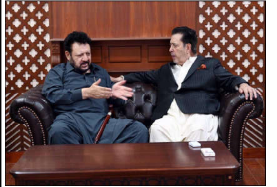
ISLAMABAD: Chief Minister Gilgit Baltistan Haji Gulbar Khan in a meeting with Governor Gilgit Baltistan Syed Mehdi Shah at his office.

The Chief Minister said that it was the top priority of the caretaker provincial government to keep uninterrupted healthcare facilities continued for the public, and added that despite financial crunches, the provincial government would make no compromise on the provision of treatment facilities to the masses. He stated that the health sector would be given top priority in the allocation of available financial resources.