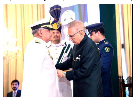
ISLAMABAD: President Dr Arif Alvi conferring the award of Nishan-e-Imtiaz (Military) upon the Chief of Naval Staff, Admiral Naveed Ashraf, at a special investiture ceremony held at Aiwan-e-Sadr.