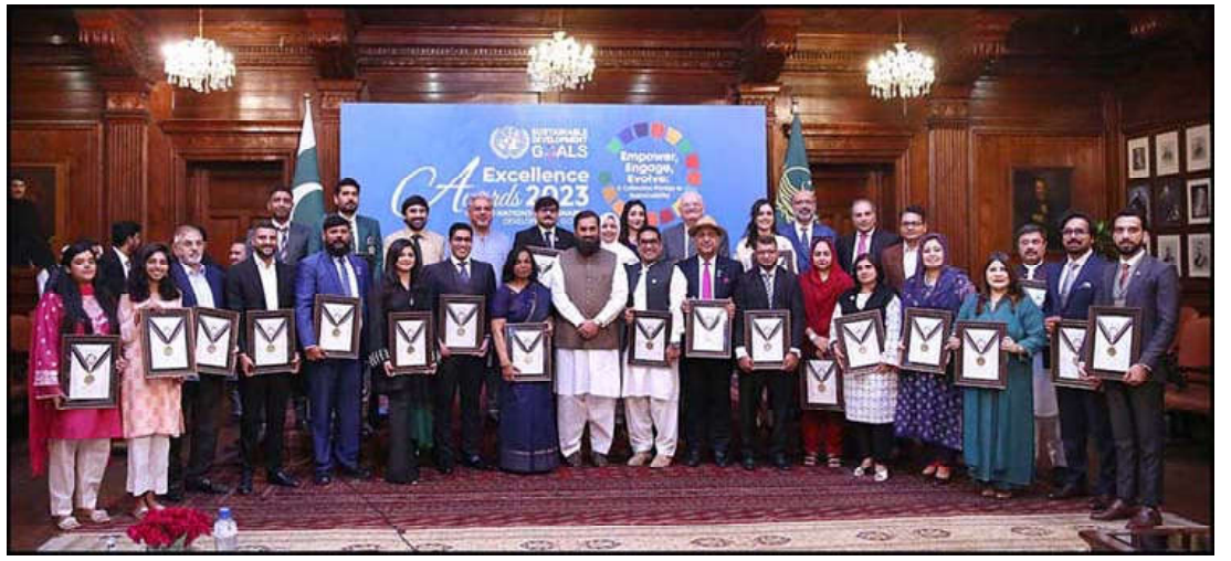
LAHORE: Governor Punjab Muhammad Balighur Rahman posing for a group photo with participants at the Sustainable Development Goals Excellence Awards 2023 ceremony of the United Nations Sustainable Development Goals.

The provincial cabinet rejected both the payment of the provincial government's portion of the 155 million dollar loan for the future and the at-source deduction of the 88.673 million dollar debt owed by Khyber Pakhtunkhwa.