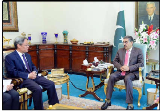
ISLAMABAD: H.E. Mr. Jiang Zaidong, Ambassador of the People's Republic of China calls on the Caretaker Prime Minister Anwaar-ul-Haq Kakar.