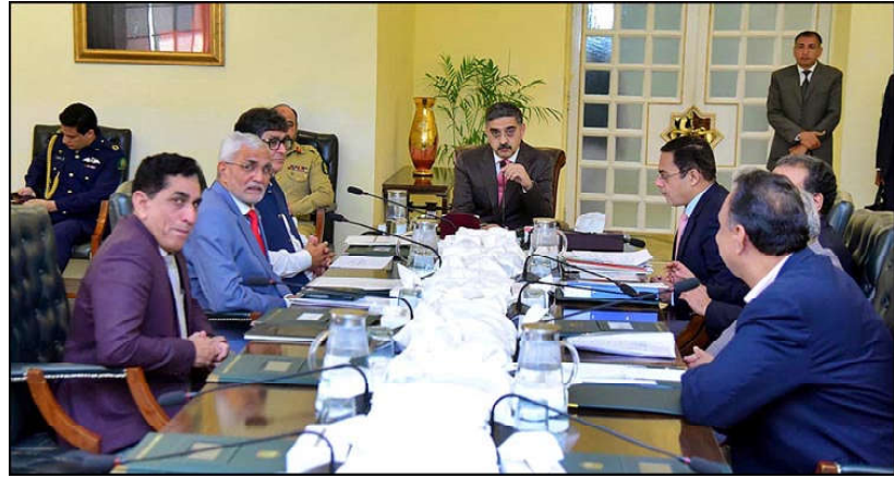
ISLAMABAD: Caretaker Prime Minister Anwaar-ul-Haq Kakar chairs a meeting regarding Pakistan International Airlines.