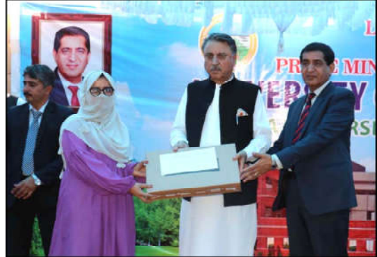
NASEERABAD: Governor Balochistan, Malik Abdul Wali Khan Kakar distribute laptop among participant during the Laptop distribution ceremony of PM Youth Laptop Scheme Phase-III held at University College of Dera Murad Jamali, in Naseerabad.