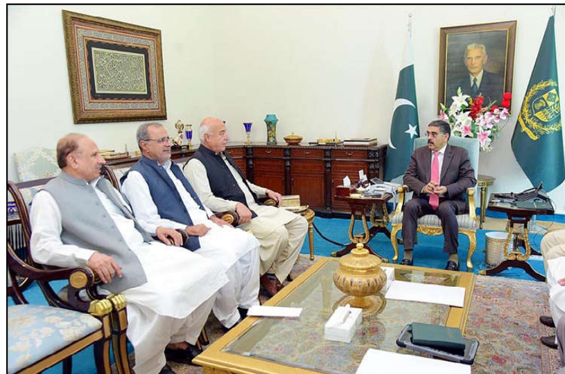
ISLAMABAD: A delegation of politicians from Balochistan led by former Chief Minister Dr. Abdul Malik called on Caretaker Prime Minister Anwaar-ul-Haq Kakar.

called that the OIC Contact Group on Jammu and Kashmir that met on the sidelines of the 78th session of the United Nations General Assembly in New York in September reaffirmed the inalienable right to self-determination of the people of J&K. He said the meeting also expressed deep concern over the persistent curbs on the fundamental rights and freedom of the people in Indian Illegally Occupied Jammu and Kashmir (IIOJK). The OIC envoy appreciated the government of Pakistan in highlighting the issue of Jammu and Kashmir at the international fora and expressed the OIC's resolve of its continued support to the cause.