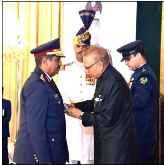
ISLAMABAD: President Dr. Arif Alvi conferring the award of Nishan-i-Imtiaz (Military) upon the Chief of Staff of Qatar Armed Forces, Lt. General (Pilot) Salem Hamad Eqaal Al-Nabet, at a special investiture ceremony, at Aiwan-e-Sadr.