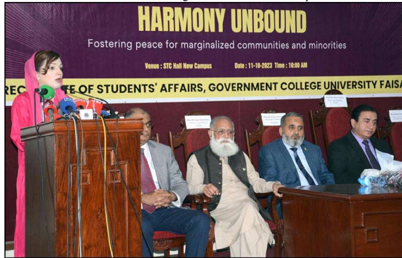
FAISALABAD: Special Assistant to the Prime Minister (SAPM) Mushaal Hussein Mullick addressing a seminar on "Harmony Unbound Fostering Peace for Marginalized Communities and Minorities" at Government College University Faisalabad (GCUF).

It said that MEF would provide grants to bear the initial start-up cost at the rate of 100,000 each as one time grant to cover school supplies and teaching, learning material for students and teachers while the foundation would also pay minimal tuition fees of Rs 1,000 for KG students, Rs 1,500 for first to fifth-grade students and Rs 2,000 for eighth to seventh-grade students.