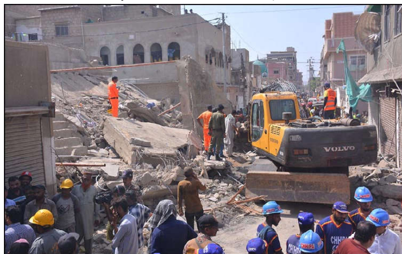
KARACHI: Rescue workers searching at site where an under-construction building collapsed. 5 dead, 4 injured as under-construction building collapses in Karachi's Shah Faisal Colony.