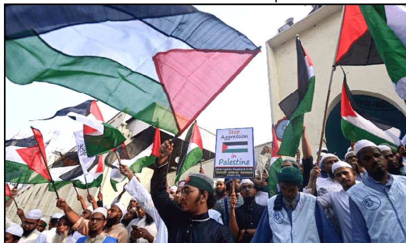
Protestors wave the national flag of Palestine as they shout slogans during an anti-Israel demonstration in Dhaka, Bangladesh.

"I remind you that following the opening of a potential investigation and a finding of non-compliance, penalties can be imposed," it said. Musk, responding later on X to a user who had posted the letter, invited Breton to "please list the violations you allude to". "Our policy is that everything is open source and transparent, an approach that I know the EU supports," Musk wrote.