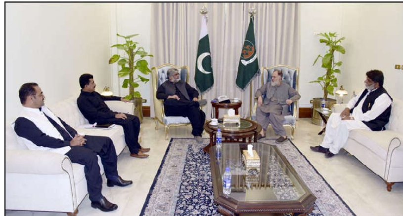
QUETTA: A delegation of district Lasbella led by Caretaker Provincial Minister Prince Ahmed Ali Baloch meeting with Caretaker Chief Minister Balochistan Mir Ali Mardan Khan Domki.

Cooperation signed in November 2021, Solangi said the two sides agreed to celebrate the Pakistan-China Year of Tourism Exchanges in 2023 and to establish strong linkages between the tourism promotion agencies and private enterprises of the two countries. The minister said in May 2023, the Pakistan-China joint exhibition at the Palace Museum featured 173 Gandhara artifacts from Pakistani museums, promoting shared heritage and cultural exchange between the two nations, fostering cultural cooperation and offering insights into Pakistan's heritage for the general public and Chinese scholars. "These exchanges are not new. In fact, from 138 B.C. until our modern age, the Silk Road has managed to represent one of the longest-established and permanent hubs for exchange.