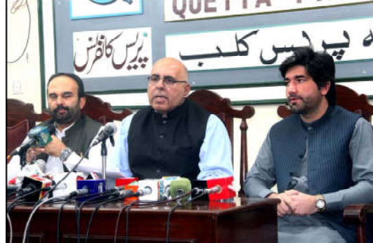
QUETTA: Balochistan Caretaker Minister for Information, Jan Achakzai addresses to media persons during press conference, at Quetta press club.