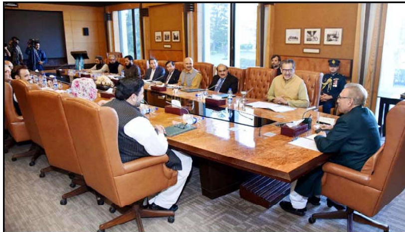
ISLAMABAD: President, Dr. Arif Alvi chairing a meeting on the role of the mosques and the pulpits in social development held at Aiwan-e-Sadr in Islamabad.

During the meeting, the participants also presented different proposals regarding role of ulema on various important national and social subjects.