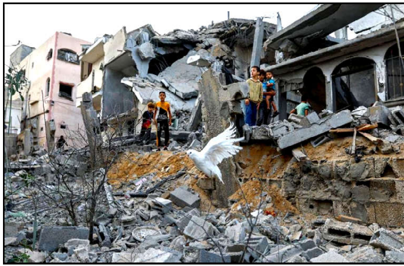
A dove flies over the debris of houses destroyed in Israeli strikes, in Khan Younis in the southern Gaza Strip.

But as the Israeli military went neighborhood to neighborhood with rapid and intensifying airstrikes, the heavy bombardments reached the heart of Gaza City, transforming the affluent neighborhood into an uninhabitable desert of craters.