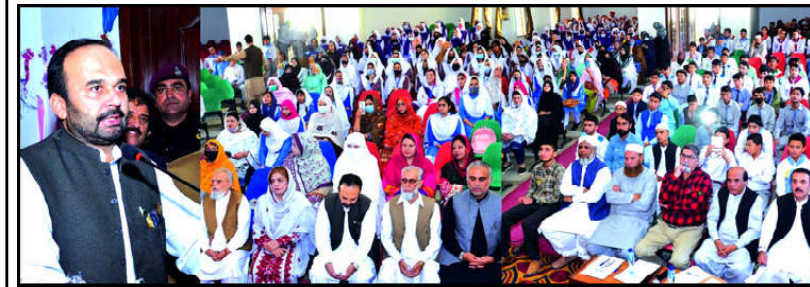
QUETTA: Caretaker Home Minister Mir Zubair Ahmad Jamali addressing participants of a ceremony at Children Academy

The dignitaries also discussed the potential for joint military exercises and exchange programs with an aim to facilitate the exchange of expertise, enhancing interoperability and fostering closer ties between the Air Forces of both brotherly countries.