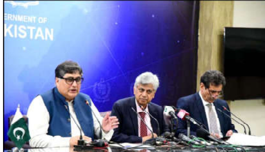
ISLAMABAD: Caretaker Federal Minister for Information and Broadcasting, Murtaza Solangi along with Fawad Hassan Fawad, Caretaker Federal Minister for Privatization briefing the media on Federal Cabinet decisions in Islamabad.

He also congratulated the Chief of Staff of Qatar Armed Forces on the conferment of the award of Nishan-e-Imtiaz (Military) upon him in recognition of his role in promoting cooperation between the Armed Forces of the two brotherly countries.