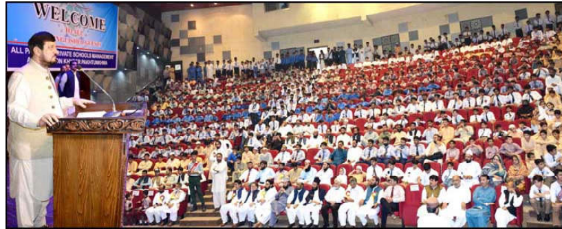
PESHAWAR: Khyber Pakhtunkhwa Governor Haji Ghulam Ali addressing the ceremony of All Pakistan Private Schools Management Association.