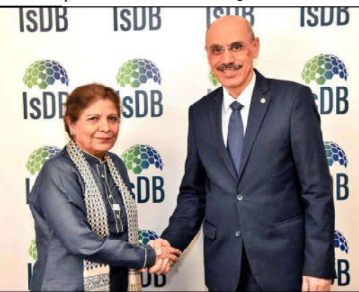
MOROCCO: Caretaker Federal Minister for Finance, Revenue, and Economic Affairs, Dr. Shamshad Akhtar met with Chairman of the Islamic Development Bank (IsDB) Group, Dr. Muhammad Sulaiman Al Jasser.

KARACHI (APP): Five ships namely, MSC Jemima, Maersk Kensington, MSC Vilda-X, TRF Kobe and Limra carrying Containers, Palm oil and LPG, berthed at Container Terminal, Liquid Terminal and Sui Southern Gas Terminal respectively on Tuesday. Meanwhile three more ships, Livar Den, Seaway Huron and Al-Rayyan carrying Palm oil, Gas oil and LNG also arrived at outer anchorage of the port during last 24 hours. A total of six ships were engaged at PQA berths during the last 24 hours, out of them four ships, Maersk Kensington, MSC Vilda-X, TRF Kobe and Mei Lin Wan are expected to sail on today afternoon. A cargo volume of 113,650 tonnes, comprising 79,310 tonnes imports cargo and 34,340 tonnes export cargo, including containerized cargo carried in 5,310 Containers (3,290 TEUs Imports).