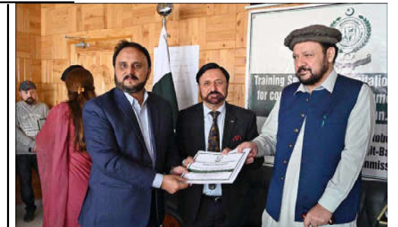
GILGIT: Chief Minister Gilgit-Baltistan Haji Gulbar Khan giving away certificate among the participant of workshop for the local Bodies Election.

The administration had already imposed a ban under Section-144 on sale and purchase and flying of pigeons in the surrounding areas of the airport and confiscated dozens of pigeons from the shops the other day. Additional Assistant Commissioner, Samira Saba during a crackdown arrested over 12 people for flying pigeons in surrounding areas of the airport. The administration had also made announcements over loudspeakers.