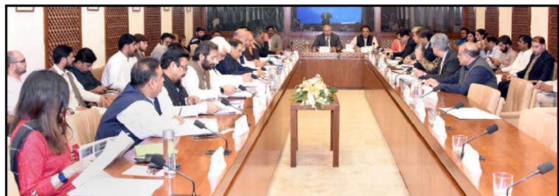
Senator Mohsin Aziz, Chairman Senate standing committee on interior presiding over a meeting of the committee at Parliament House Islamabad.