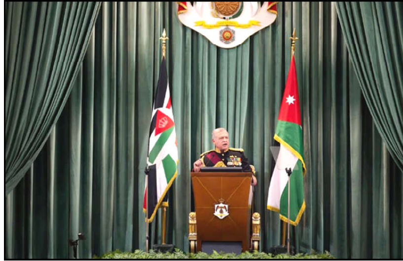
Jordan's King Abdullah II speaks at the opening of a new parliamentary session in Amman, Jordan.