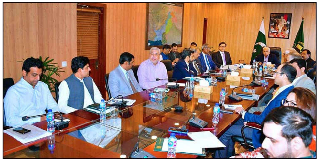
ISLAMABAD: Caretaker Federal Minister for Railways, Communications & Maritime Affairs, Shahid Ashraf Tarar chairing a meeting at Ministry of Railways.

He said Pakistan's coal reserves worth $6.3 could be utilized but it would incur environmental impacts, whereas the country should create its strategic position like the Middle East managing.