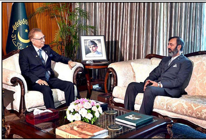
ISLAMABAD: Pakistan's Ambassador-designate to Libya, Major General (R) Anjum Enayat, calls on President Dr. Arif Alvi, at Awan-e-Sadr.

the region's climate but are also highly adaptable as they are designed to float, transform, submerge, or block in response to flood disasters, ensuring safety and security for their inhabitants. The partnership exemplifies how industry and academia can unite to address pressing real-world challenges using the wisdom of local materials and construction whilst making use of the next generation of architects and designers. Similarly, Engro Foundation - the social investment arm of Engro Corporation - in partnership with the Sindh Rural Support Organization (SRSO) supported the construction of 146 climate-resilient residential units in two hard-hit villages of District Kambar Shahdadkot.