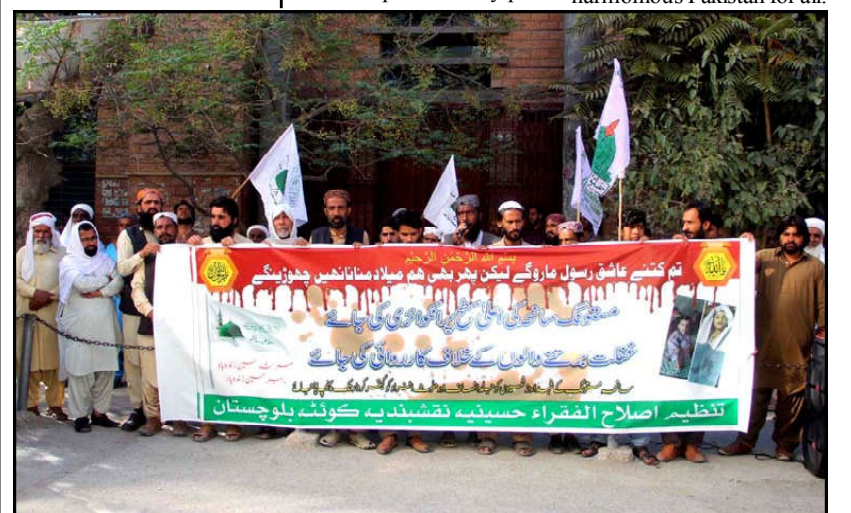
QUETTA: Members of Ianzeem-e-Islah Al Fuqra Hussainia Naqshbandia are holding protest demonstration against Mastung tragedy, at Quetta press club.