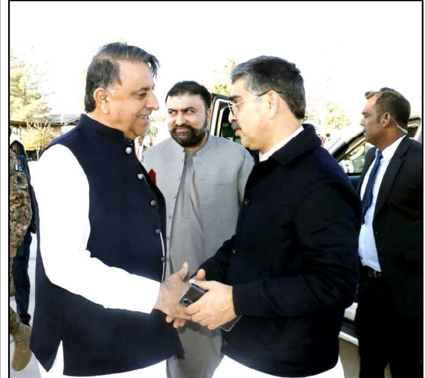
QUETTA: Governor Balochistan Malik Abdul Wali Khan Kakar seeing off caretaker Prime Minister Anwaarul Haq Kakar at Quetta airport

Pakistan: Abdullah Shafique, Imam-ul-Haq, Babar Azam ©, Mohammad Rizwan (wk), Saud Shakeel, Iftikhar Ahmed, Mohammad Nawaz, Shadab Khan, Hasan Ali, Shaheen Shah Afridi, Haris Rauf