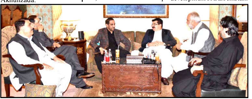
Chairman Senate, Muhammad Sadiq Sanjrani exchanging views with former Chief Minister of Balochistan, Mir Abdul Qudous Bizenjo in Islamabad.