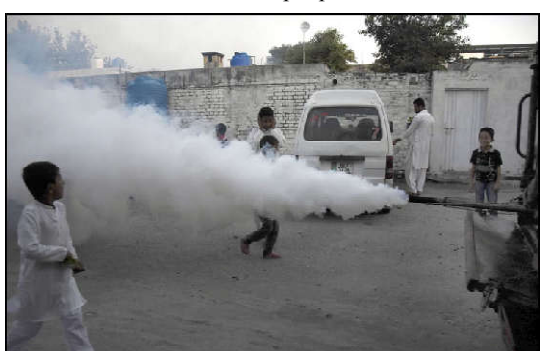
ISLAMABAD: Workers of Capital Development Authority (CDA) spraying anti dengue spray in streets of sector G-6 in Federal Capital.

lions of people across the country are cheering for his return. Rawalpindi and Islamabad will also leave no stone unturned to welcome Nawaz Sharif. Only from Rawalpindi, thousands of workers consisting of hundreds of buses and vehicles will leave in the form of a convoy on October 21st at ten o'clock in the morning via the Lahore Motorway. He said that the entire Murree Road is being decorated with Nawaz Sharif's welcome posters and placards. Answering a question, he said that Nawaz Sharif is not only returning to the country, but he is bringing with him the vision of development, prosperity and the welfare of the people.