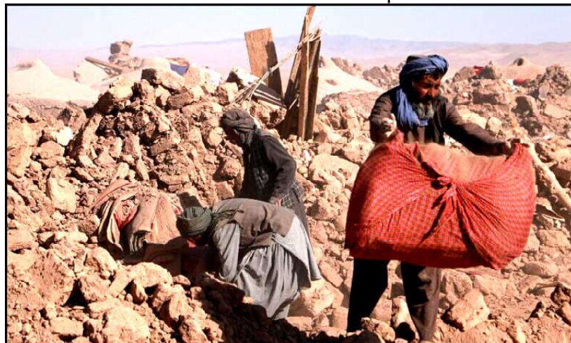
Afghan residents clear debris of damaged houses after earthquake in Nayeb Rafi village, Zendej Jan district of Herat province.

When a swarm of Chinese boats converged in a Philippines-claimed reef in 2021, the then-foreign secretary demanded in a tweet that the Chinese get out, using an explosive-laced critique. "What are you doing to our friendship? You. Not us. We're trying. You. You're like an ugly oaf forcing your attentions on a handsome guy who wants to be a friend; not to father a Chinese province."