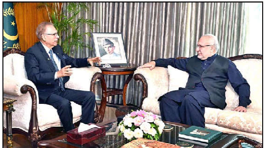
ISLAMABAD (APP): President Dr Arif Alvi on Tuesday stressed to give opportunity to all mainstream political parties to run for the upcoming general elections.

He emphasized that all political parties and their leadership should be given equal opportunities to par-