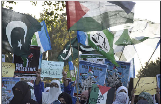
ISLAMABAD: Women activists of Jamaat-e-Islami hold placards during protest against Israel attack on Palestine, at Aabpara Chowk in Federal Capital.

Additionally, the electricity connections of individuals found using electricity directly or tampering with meters were also disconnected.