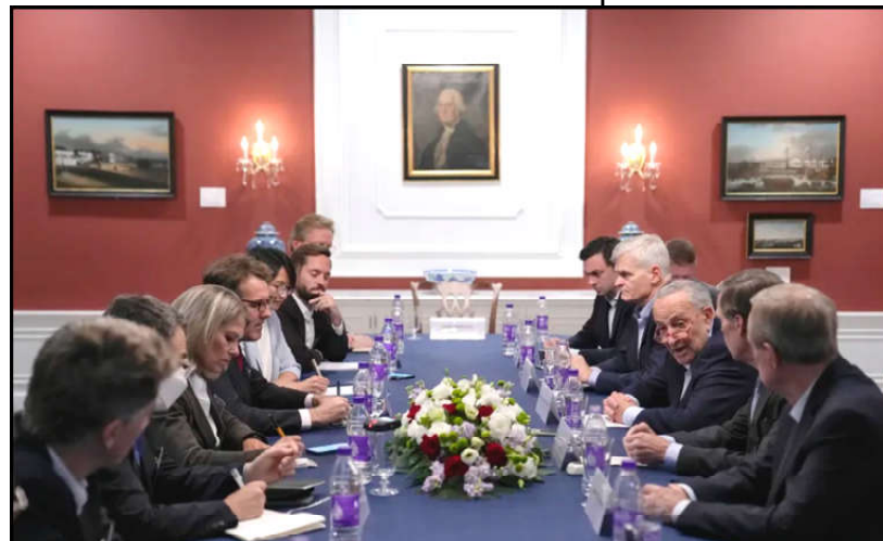
U.S. Senate Majority Leader Chuck Schumer, D-N.Y., speaks during a press roundtable with Schumer and his delegation at the residence of U.S. Ambassador to China, in Beijing.

He said Gallant's wording amounted to "hate speech" which, if allowed to continue.