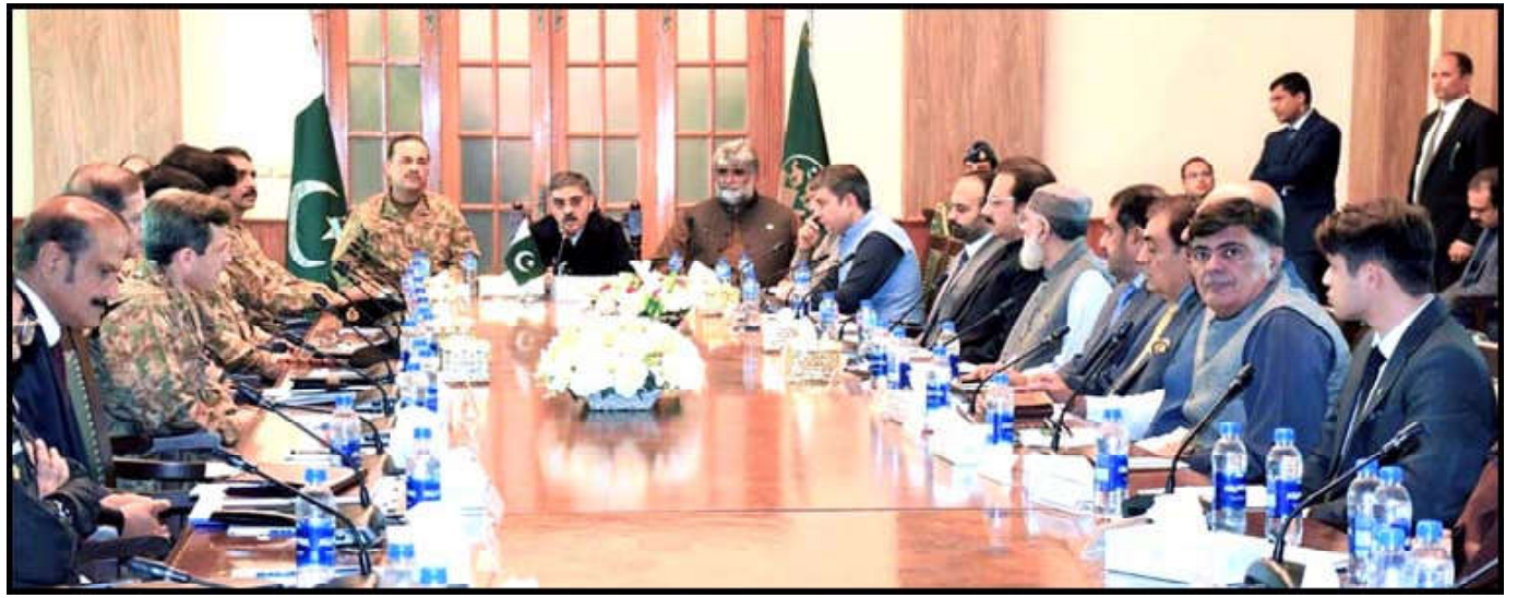
QUETTA: The Caretaker Prime Minister Anwaar-ul-Haq Kakar chairs a meeting of the Provincial Apex Committee.