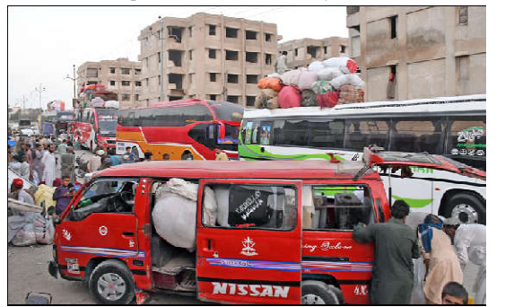
KARACHI: Afghan refugees wait to board into a bus to depart for their homeland, Pakistan's government announced a major crackdown migrants in the country illegally, saying it would expel them starting next month and raising alarm among foreigners without documentation who include an estimated 1.7 million Afghans.