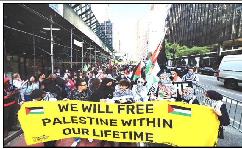
NEW YORK: Demonstrators gather in support of the Palestinian people during a rally for Gaza outside the Consulate of Israel.

The Romanian port of Constanța has become Ukraine's main export route for grain via Ukrainian ports on the Danube River since Russia quit a deal in mid-July that had guaranteed safe shipments via three Ukrainian Black Sea ports.