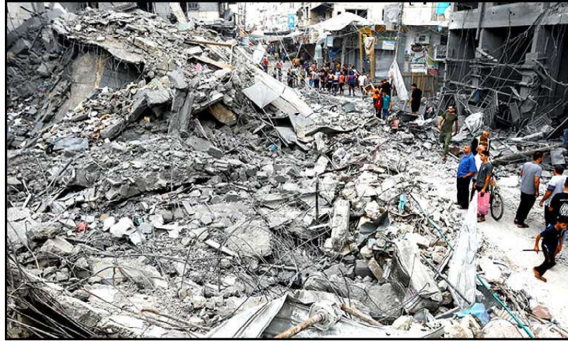
Palestinians inspect the damage in the aftermath of Israeli strikes, in Khan Younis, southern Gaza Strip.

The source also went on to say that if Israeli Prime Minister Benjamin Netanyahu expands the front, Hamas will too and their allies "will not leave Hamas in this battle alone".