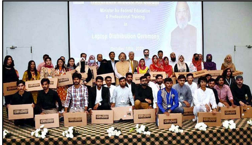
ISLAMABAD: Caretaker Minister for Federal Education and Professional Training, Madad Ali Sindh attended the 'Laptop Distribution Ceremony' as the chief guest, organized by National Skills University.