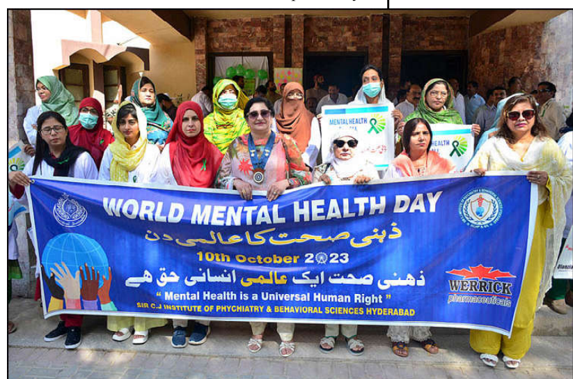
HYFERABAD: Doctors participating in a rally to mark the World Mantel Health Day at Sir C.J Institute of Psychiatry & Behavioral Sciences.