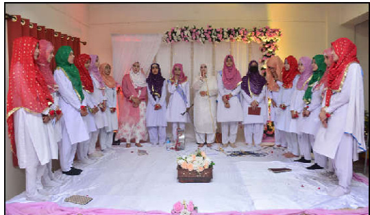
ISLAMABAD: Students are reciting Naat-e-Rasool-e-Maqbool during Milad ceremony at Islamabad College for Girls in Federal Capital.

The members said that self-reliance in defense production is essential so that we can save our foreign exchange. For this, all defense production organizations must increase their production, especially foreign defense production organizations.