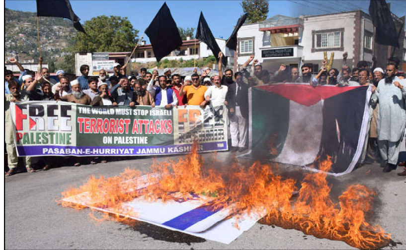
MUZAFFERABAD: Activists of Pasban-e-Hurriyat holds protest and burns Israiclan flag at Azadi Chowk to show solidarity with Palestinian People.