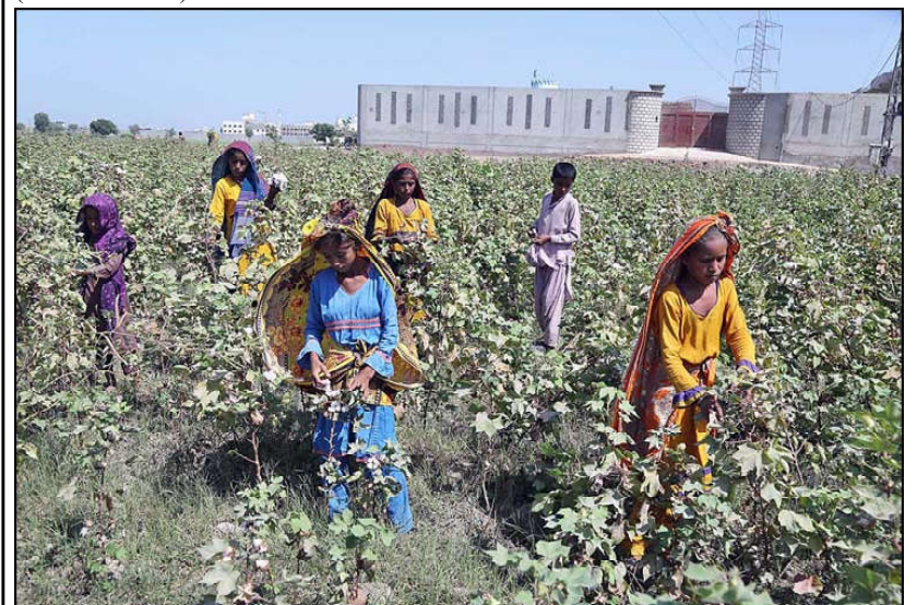
HYFERABAD: Farmer girls picking cotton in the cotton field.

Tariq Mehmood said that the Expo Centre would make the federal capital a hub of business and investment activities and stressed the value addition of products to boost exports and revive the economy. He said that Gulberg Green was situated at an ideal location and many new development projects would be completed here.