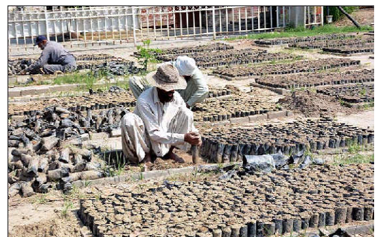
FAISALABAD: Nursery worker sowing seeds for seasonal flowers in pots at local nursery.

The PSX Top 25 Companies Awards recognize companies achieving certain key prerequisites for this prestigious award, which include having a minimum dividend distribution of 30 percent and shares of the company having been traded at least 75 percent of the total trading days in a year, among other prerequisites. Subject to achieving these prerequisites, the companies are further weighed based on certain quantitative and qualitative criteria. In terms of quantitative criteria, PSX selects listed companies which have performed exceptionally in the context of profitability ratios.