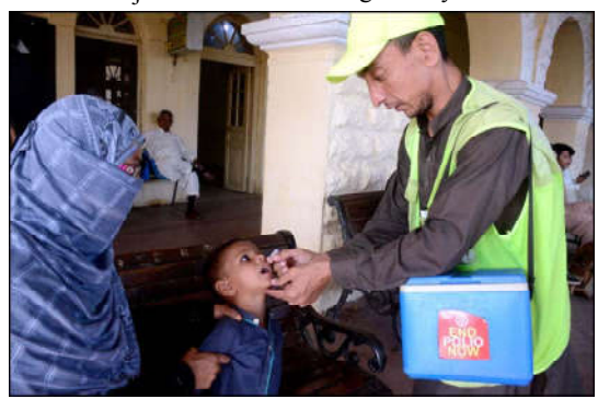
KARACHI: Health worker administering polio drops to a child at Cantt Station.