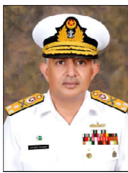
Chief of Staff at the Naval Headquarters.