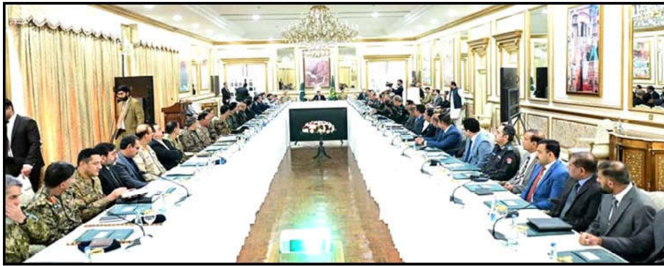
ISLAMABAD: Caretaker Prime Minister Anwaar-ul-Haq Kakar chairs a meeting of the Apex Committee on National Action Plan.