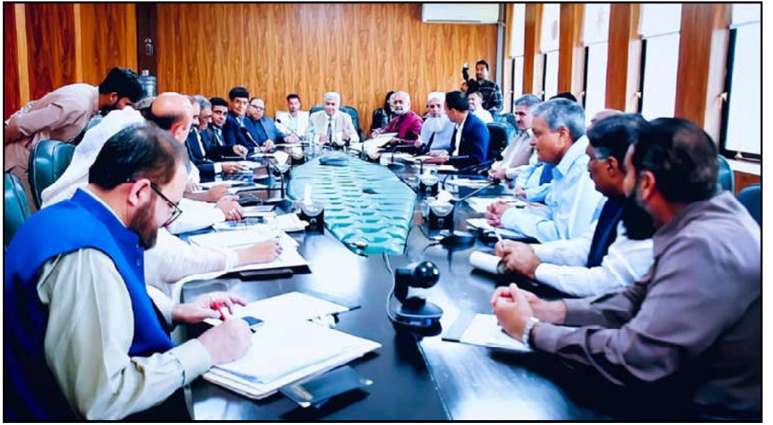
Caretaker Federal Minister for National Food Security and Research, Dr. Kausar Abdullah Malik chaired a meeting on Seed System of Pakistan and reviewed its challenges and future prospects at Islamabad.

the other hand, implementation of the economic adjustment program and a likely smooth general election should boost confidence, while the easing of import controls should support investment as fiscal tightening restrains public consumption. On the output side, better weather conditions will enable an increase in the area under cultivation and in yields, supporting recovery in agriculture. The government's relief package of free seeds, subsidized credit,