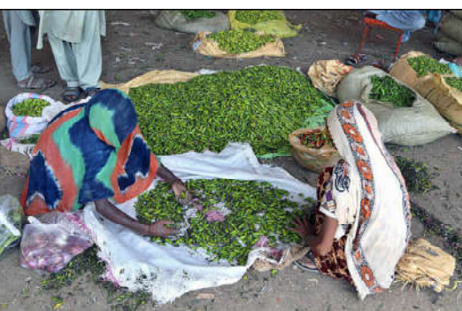
HYDERABAD: Women labourers busy sorting out green chili at vegetable market.

Among the sea transport services, the exports of freight services dipped by 70.32 percent from $13.510 million last year to $4.010 million whereas the exports of other sea transport services also decreased by 10.39 percent from $6.450 million to $5.780 million current year, the PBS data revealed. The exports of air transport rose by 7.43 percent going up from $53.120 million last year to $57.069 million during July 2023. Among the air transport services, the exports of passenger services increased by 2.97 percent, from $34.990 million to $36.030 million, whereas the exports of freight services dipped by 36.47 percent, from $3.290 million to $2.090 million.