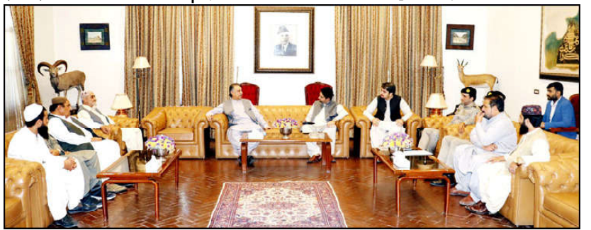
QUETTA: A delegation of traders of Abdul Sattar Road in presence of Deputy Commissioner Quetta meeting with Balochistan Governor Malik Abdul Wali Khan Kakar.

Currently, vigorous work was being carried out at all key sites including powerhouse, tail race tunnel and downstream coffer dam etc, official sources told APP here. Excavation of the powerhouse and the tail race tunnel as well as slope stabilization for the switch yard were also in progress besides modification in the existing Tunnel No. 5, they said. Tarbela 5th Extension Hydropower Project is a component of green, clean and least-cost energy generation plan, WAPDA is implementing on priority.