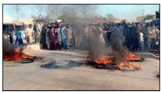
NASERABAD: Traders and residents of Dera Murad Jamali blocked road and burn tyres as they are holding protest demonstration against the behavior of the district administration and Assistant Commissioners, held at Sind Balochistan National Highway road in Naserabad.

Corridor (CPEC), and construction of motorways. CPEC is a game changer, he said adding that Pakistan's geographical situation demands to work with regional nations to bring prosperity for the people of this country. We have a high ratio of young talented men and women, he said adding there is an urgent need to utilize the potential of these educated and skilled genders for achieving fast growth for Pakistan.