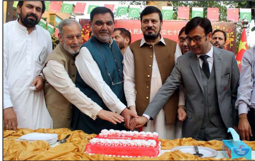
PESHAWAR: Governor Khyber Pakhtunkhwa, Ghulam Ali along with others cutting cake during a ceremony on the eve of National Day of China, at China Window in Peshawar.

Departments and relevant stakeholders. Mr. Afridi stated that the plan, expected to be finalized by mid-November, involves data collection tools sharing information on district-specific hazards, vulnerability profiles, hazard impacts, damages, compensation details, resource mapping, needs assessments, and coordination efforts. The Winter Contingency Plan will categorize districts based on Vulnerability and Risk Assessment, tailored to address unique weather patterns and geographical challenges faced by Khyber Pakhtunkhwa. This proactive approach is in alignment with guidelines from the National Disaster Management Authority.