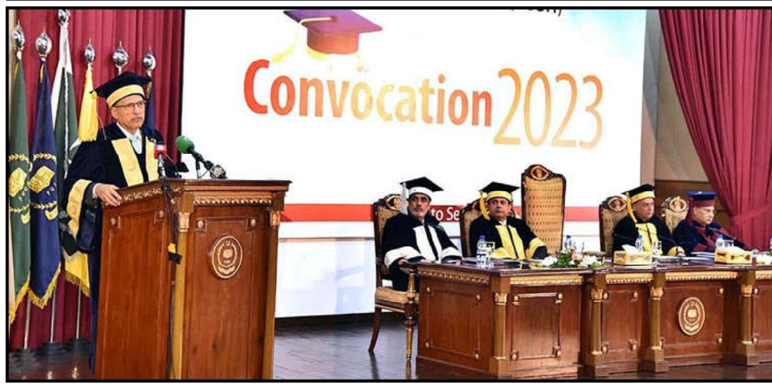
ISLAMABAD: President Dr. Arif Alvi addressing the convocation ceremony of the dentistry and nursing departments of the Foundation University School of Health Science (FUSH).