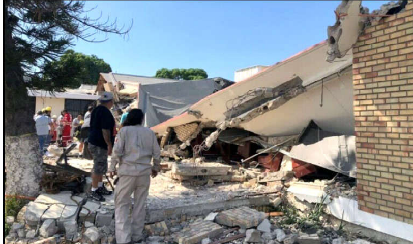
Members of a rescue team and people work at a site where a church roof collapsed during Sunday mass in Ciudad Madero, in Tamaulipas state, Mexico in this handout picture distributed.

Working under floodlights, military personnel supported emergency services using rescue dogs and earth moving equipment to identify and dig out survivors from the ruins of the church in Ciudad Madero, a city on the Gulf coast near the port of Tampico.