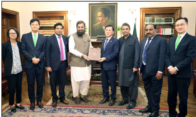
LAHORE: A delegation of an International Peace Organization, Heavenly Culture World Peace Restoration Light (HWPL) working for global peace, led by Senator Kamran Michael in a group photo with Punjab Governor, Muhammad Balighur Rehman at Governor House Lahore.

The purpose of establishing these offices is to develop strong connection between the universities with their alumni, to keep the records of their alumni, to facilitate connections between the alumni and current students so that the alumni can guide the current students in career and various educational issues.