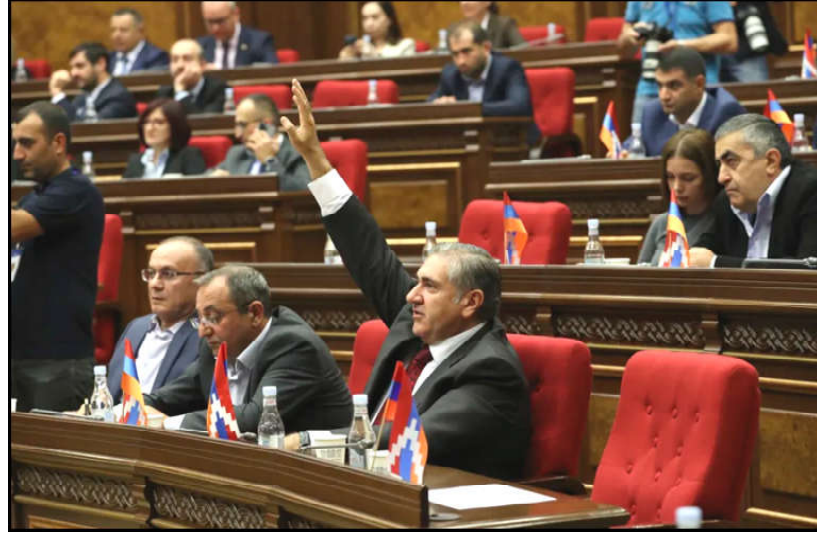
Armenian lawmakers attend the session of the National Assembly of the Republic of Armenia in Yerevan, Armenia.

Republican. "I think we need to rip off the Band-Aid," said Gaetz while attacking the speaker and other Republican members who voted for the aversion. "I think we need to move on with new leadership that can be trustworthy," he added. Gaetz belongs to a conservative lobby within the Republican Party, which favors former president Donald Trump and some of its members support Trump's claim that President Joe Biden rigged the 2020 elections. Speaker McCarthy thwarted their move by presenting a new bill which allows the government to stay open for 45 days, giving the House and Senate more time to finish their funding legislation. The Senate, where Democrats are a majority, passed the bill but only 3 hours before a 12:01am shutdown of the federal government would have taken effect. The measure was signed into law by President Biden late Saturday night. More than four million US military personnel and government workers would have been forced to stay at home if the speaker's counter measure had not passed.