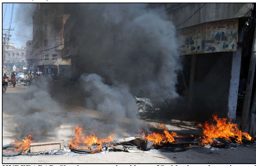
HYDERABAD: Shopkeepers and residents of Saddar bazar burn tires and crates on Jama Masjid road during a protest against non-supply of electricity from 5 days by HESCO in their locality.