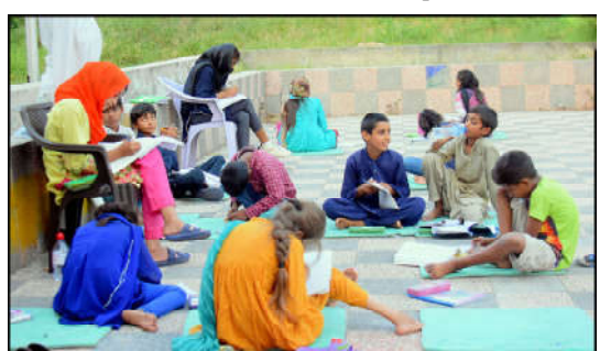
ISLAMABAD: Children of Kachi abadi busy in study at open to sky park school in F-6 area.

The forum provided an insight into the latest Pearson Edexcel news, an exciting preview of onscreen mocks service,