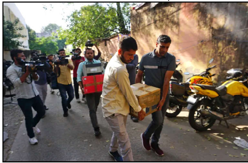
Security officers carry boxes of material confiscated after a raid at the office of NewsClick in New Delhi, India.

Monitoring Desk NEW DELHI: Indian police raided the office of a news portal and the homes of journalists and writers linked to it on Tuesday as part of an investigation into suspected illegal foreign funding of the media company, two government officials said. Laptops and mobile phones were taken away as part of the investigation into the media company NewsClick, the officials and some of the journalists said. "A special investigations team launched a search operation to identify all those individuals who were possibly getting funds from overseas to run a media group with the main agenda of spreading foreign propaganda," said an official in the interior ministry overseeing the raids by the Delhi Police.