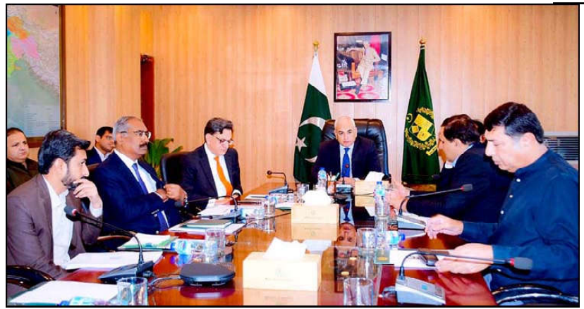
ISLAMABAD: Caretaker Federal Minister for Railways, Shahid Ashraf Tarar chairing a meeting at Ministry of Railways.