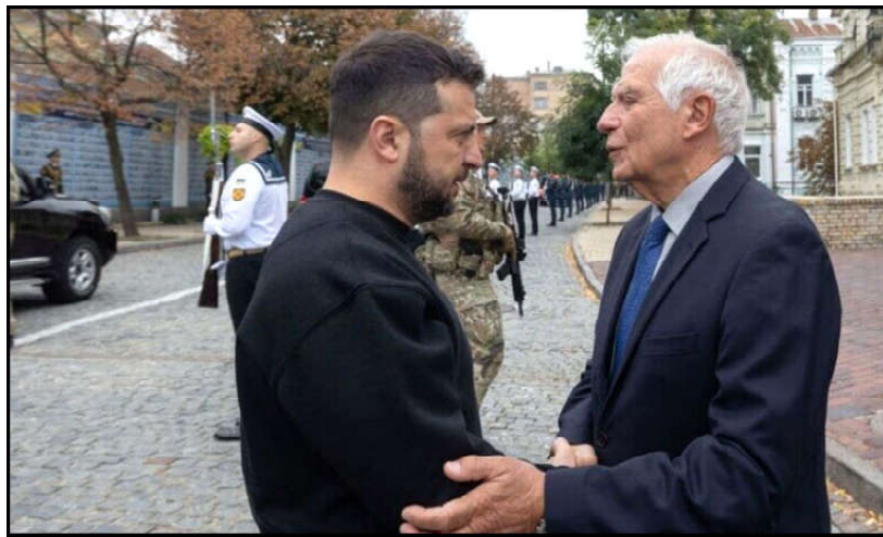
Ukraine's President Volodymyr Zelenskyy speaks with European Union Foreign Policy Chief Josep Borrell as they visit the Memory Wall of Fallen Defenders of Ukraine, amid Russia's attack on Ukraine, during the marking of Defenders of Ukraine Day in Kyiv.

of key backer the United States. Hungary, Russia's closest ally in the EU, could now be joined by Slovakia as a potential block to more backing as populist Robert Fico pushes for power in Bratislava after winning elections this weekend. There have also been tensions between Kyiv and some of its most strident backers on the EU's eastern edge — most notably Poland — over the influx of Ukrainian grain onto their markets. France's top diplomat Catherine Colonna appeared to address the concerns, saying the meeting was a signal to Moscow of the bloc's determination to support Ukraine over the long term.