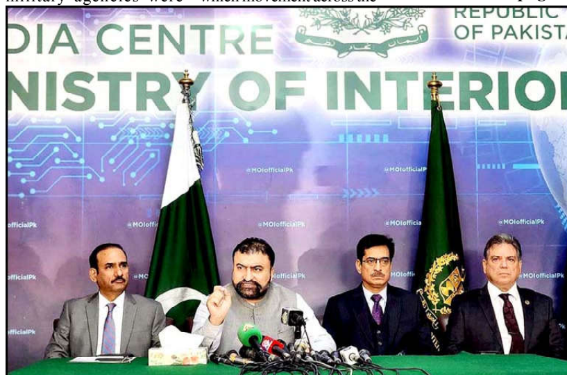
ISLAMABAD: Caretaker Federal Minister for Interior, Sarfraz Ahmed Bugti addressing a Press Conference.