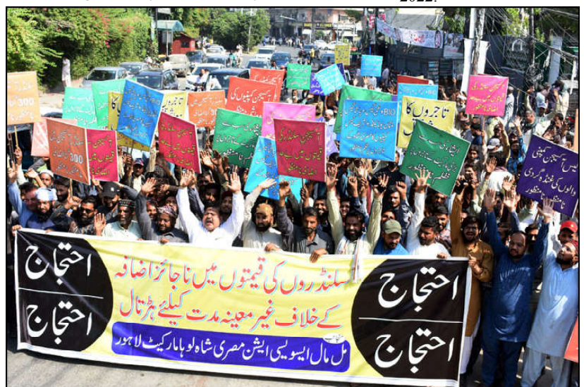
LAHORE: Workers of Mills Association holds protest outside press club against price hike in LPG and cylinder mafia, in Provincial Capital.

on-year surge. To recall, the cotton production sector faced a substantial setback last year, experiencing a 34% year-on-year decline due to the massive flooding that affected the country. However, this year's outstanding performance has not only surpassed the previous year's figures but also exceeded expectations. Dr. Gohar Ejaz, Minister for Commerce, expressed his optimism for the cotton sector, stating, "Cotton arrivals crossing the 5 million bales mark on October 1, 2023, is a momentous achievement for Pakistan. Last year, our total crop was 5 million bales, and this year, we are anticipating a bumper crop of 12 million bales. This remarkable growth showcases the dedication and hard work of our farmers and the resilience of our cotton industry."