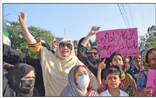
MUZAFFERABAD: Women from across the City holds protest against the unjust hike of electricity and inflation at Azadi Chowk to show their solidarity with arrested members of Awami Rabta Committee in the Capital of AJK.

The provincial minister said that the irrigation department has a key role in the development and stability of the province, therefore all the officials of the department should realize their duties and they should play an active role in the development of this province by using their technical skills. In the meeting, the caretaker minister was informed about the ongoing major projects related to irrigation in the province, while he was briefed about the efforts of the department to protect the system of canals and other sources of irrigation and precautionary measures regarding flood protection. Similarly, they provided details regarding the progress of major irrigation projects across the province. On this occasion, the caretaker minister said that he would make every possible effort to further improve the irrigation system in Khyber Pakhtunkhwa.