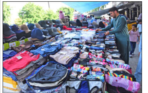
ISLAMABAD: A vendor is arranging socks on his stall at Karachi Company area to attract customers in Federal Capital.

Monday. Present at the gong ceremony were representatives from the SECP, leading academic institutions, professional bodies, and securities brokers, amongst others. The week-long activities in World Investor Week are planned to promote the importance of financial literacy and to raise awareness about investor education and protection. The objective is to encourage financial inclusion and foster learning opportunities for investors. The gong was struck by the Chief Guests.