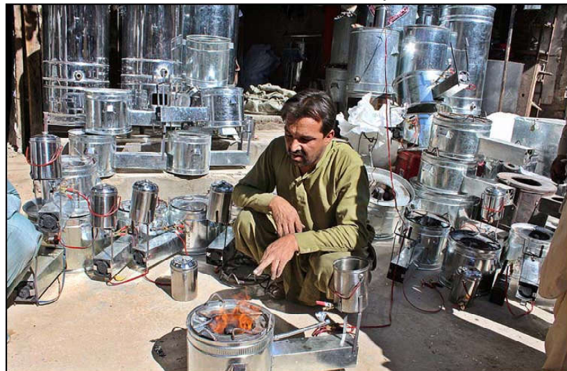
QUETTA: A vendor demonstrates igniting of locally made heater. This newly launched heater is low in cost and could be used with the used oil.