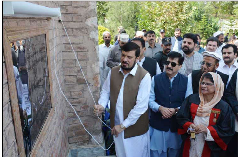
PESHAWAR: Khyber Pakhtunkhwa Governor Haji Ghulam Ali inaugurates project completed under Peshawar Uplift program at Jinnah Women College Peshawar.

strengthened. The IG Police said 221 cases of kidnapping for ransom have been registered this year compared to 81 in 2022. The Larkana Range has 128 cases while Sukkur Range has 46. At this, the CM said that a comprehensive operation against the dacoits was being planned in Sindh and in the Punjab simultaneously. The CM said that the operation was being supported by the Pak Army/Rangers and drones most probably used to hit their hideout in the thick forest located in the center of the Riverbed. The operation has been started against the dacoits but it will be intensified shortly. He added that dacoits have started surrendering. Seven dacoits had surrendered last week.