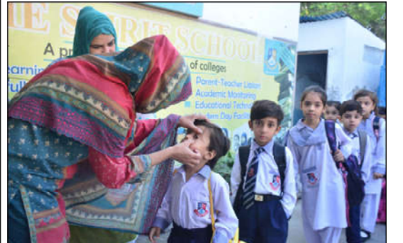
RAWALPINDI: A teacher examine the eye of pupils at school to prevent the spread of eye infection to other students and in City.