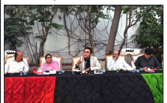
KARACHI: Peoples Party (PPP) Chairman, Bilawal Bhutto Zardari addresses the PPP candidates who won the local elections of Sindh, during meeting held at Bilawal House in Karachi.

The ministers said that the caretaker government will provide all possible assistance to the ECP in fulfilling its constitutional responsibility of conducting general elections in the country.