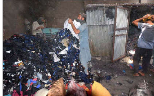
PESHAWAR: Workers busy in reprocessing the clothes for preparing quilts at their workplace.

and a decrease of 2.1% in September 2022. On the other hand, the rural CPI increased to 33.9% on year-on-year basis in September 2023 as compared to an increase of 30.9% in the previous month and 26.1% in September 2022. On month-on-month basis, it increased to 2.5% in September 2023 as compared to an increase of 1.9% in the previous month and an increase of 0.2% in September 2022. The Sensitive Price Indicator (SPI) based inflation on YoY increased to 32.0%.