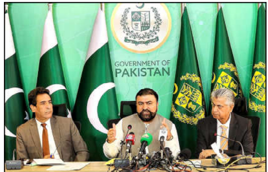
ISLAMABAD: Chairman Federal Minister for Interior Sarfraz Ahmed Bugti and Caretaker Federal Minister for Information and Broadcasting Murtaza Solangi addressing a press Conference.

However, steps are being taken for prevention of the virus and stopping its spread to other areas.