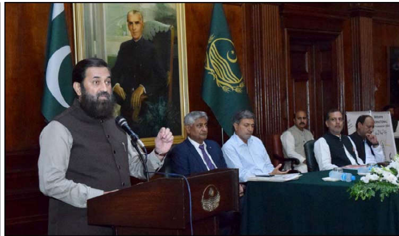
LAHORE: Governor Punjab Muhammad Balighur Rehman addressing 'Right to Information Day' function as a special guest at Governor House.