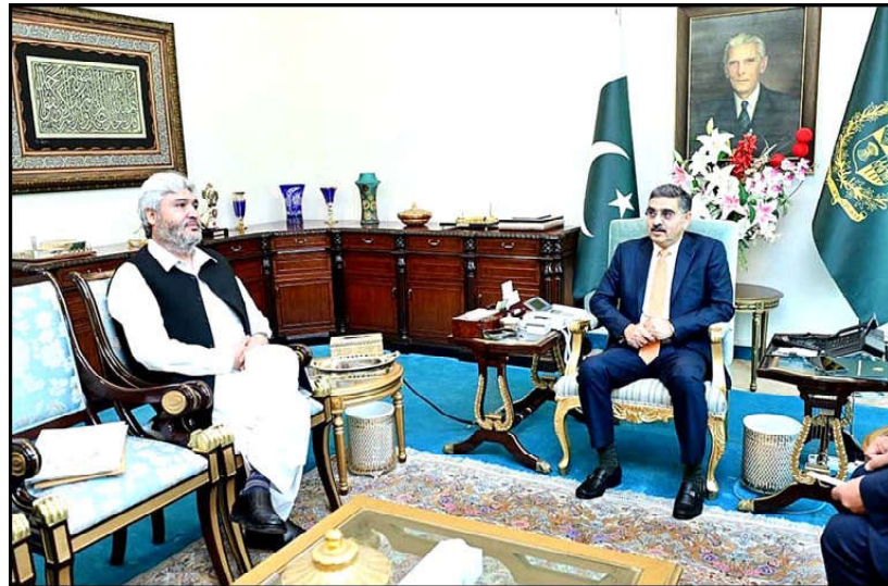
ISLAMABAD: Former Speaker Balochistan Assembly Jamal Shah Kakar called on Caretaker Prime Minister Anwaar-ul-Haq Kakar.

On the sidelines, the foreign minister will meet with several regional dignitaries including the Deputy Prime Minister of Mongolia, the Foreign Minister of China and the Interim Foreign Minister of Afghanistan.