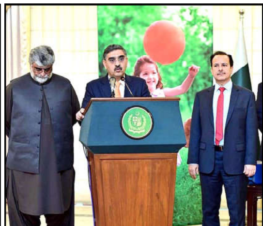
ISLAMABAD: The Caretaker Prime Minister Anwar-ul-Haq Kakar addresses the launching ceremony of National Polio Eradication Campaign. Caretaker Chief Minister Balochistan Mir Ali Mardaan Khan Domki is also present