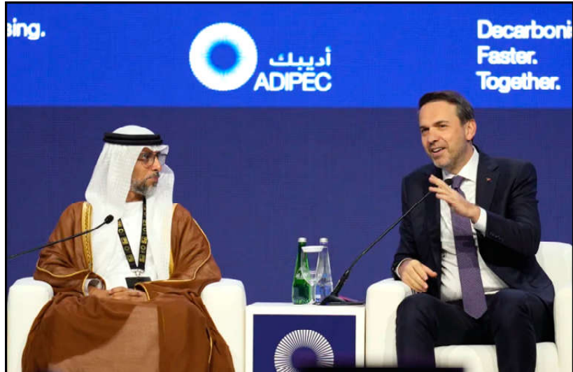
Turkish Energy Minister Alparslan Bayraktar, right, and United Arab Emirates Energy Minister Suhail al-Mazrouei attend the ADIPEC, Oil and Energy exhibition and conference in Abu Dhabi, United Arab Emirates.