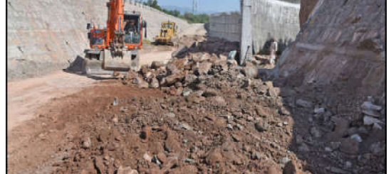
ISLAMABAD: Laborers are busy in their work during the construction of Margala Town Underpass, as the construction work is resume, which was halted due to improvements in the design.

The CJP directed him to make preparation for case and give arguments within half an hour.