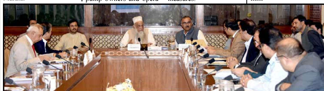
Senator Professor Sajid Mir, Chairman Senate Standing Committee on Kashmir Affairs and Gilgit-Baltistan presiding over a Meeting of the Committee at Parliament House Islamabad.

Meanwhile 9 kg hashish was recovered from a local resident near Ghazar Taos Bala Bazaar in a joint operation with FC Balochistan at Luck Pass Check Post. During the operation, 40 kg of ice was recovered from 5 parcels in the bus.