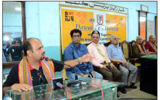
HYDERABAD: Pakistan Federal Union of Journalists (PFUJ) President, GM Jamali addresses during Health Insurance Card distribution ceremony held at Hyderabad press club.

and conducted real-time tests on milk and water, covering fresh milk (chemical and composition checks) and processed milk (composition check), as well as water tests. An overall briefing on the mobile test laboratory was also conducted. The Secretary of Food gave on-the-spot instructions to the mobile test laboratory, including displaying a standard chart showcasing the composition of milk, water, and other food items for public awareness, conducting daily visits to markets, and making efforts to halt adulteration while taking strict actions against violators. The Secretary emphasized the importance of not discriminating and maintaining a polite and professional demeanour during field activities to avoid discouraging businesses.