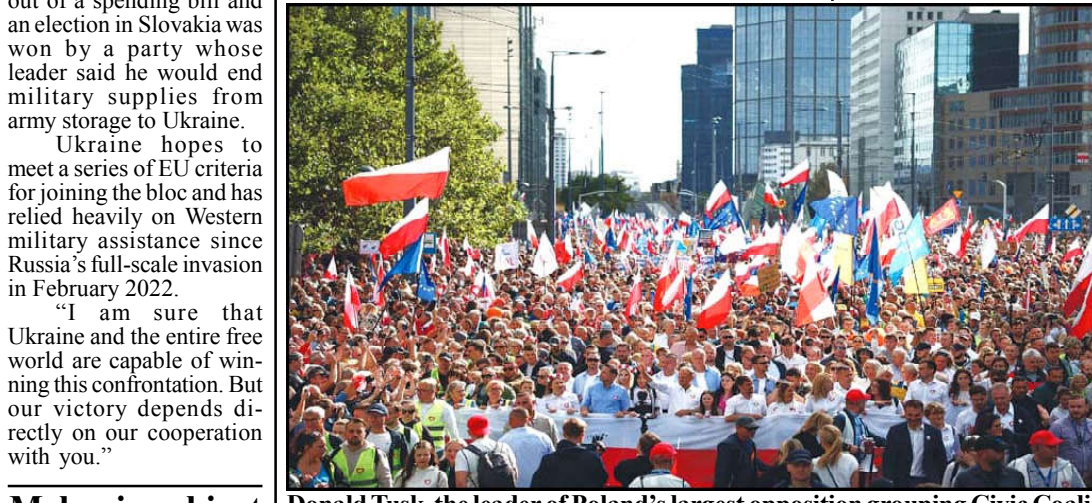
Donald Tusk, the leader of Poland's largest opposition grouping Civic Coalition, and Rafal Trzaskowski, the mayor of Warsaw, walk in front of the national flag during the rally.

Monitoring Desk ALGIERS: Algeria has accepted Algeria's offer of mediation to help resolve its political crisis, Algerian state TV reported on Monday. Algeria, which shares a border with Niger, has proposed an initiative involving a six-month transition period in Niger led by a civilian. Members of Niger's presidential guard seized power there in July and established a junta. Algeria received Niger's official notification of its acceptance of President Abdelmadjid Tebboune's mediation initiative, the foreign ministry said in a statement read out on state television.