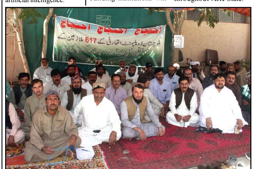
QUETTA: Members of Balochistan Development Authority (BDA) are holding protest demonstration for acceptance of their demands, in Quetta.

The day will dawn with special prayers in the mosques at Fajr across AJK for the departed souls of the earthquake victims. It will be a gazetted holiday throughout AJK State.