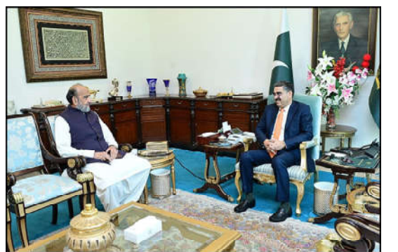
ISLAMABAD: Chairman Council of Islamic Ideology Qible Ayaz called on Caretaker Prime Minister Anwaar-ul-Haq Kakar.

This plan is aimed at equipping educators with the skills and knowledge required to identify and tackle drug-related issues among students.