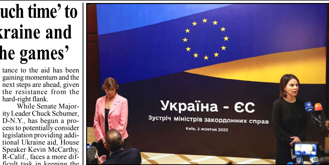
French Minister for Europe and Foreign Affairs Catherine Colonna and German Foreign Minister Annalena Baerbock speak to the media before EU-Ukraine foreign ministers meeting, amid Russia's attack on Ukraine, in Kyiv, Ukraine.