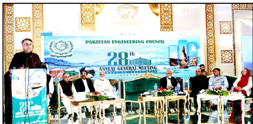
QUETTA: Governor Balochistan, Malik Abdul Wali Khan Kakar addressing the annual meeting of Pakistan Engineering Council (PEC)