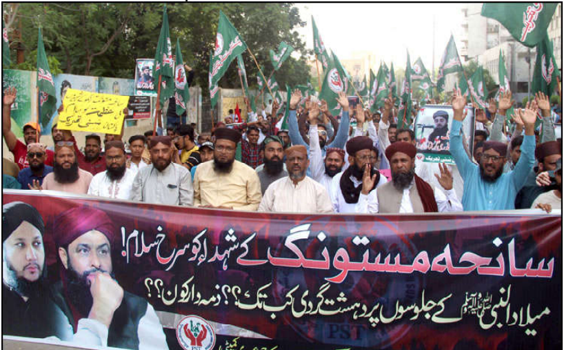
KARACHI: Workers of Sunni Tehreek Pakistan shouting slogans against terrorists, who were involved in the Mastung bomb blast during a protest rally outside press club, in Provincial Capital.