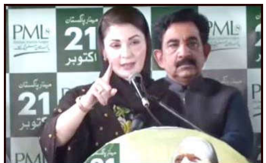
LAHORE: Senior Vice President and Chief Organizer of PML (N) Maryam Nawaz presiding over meeting of youth volunteers.