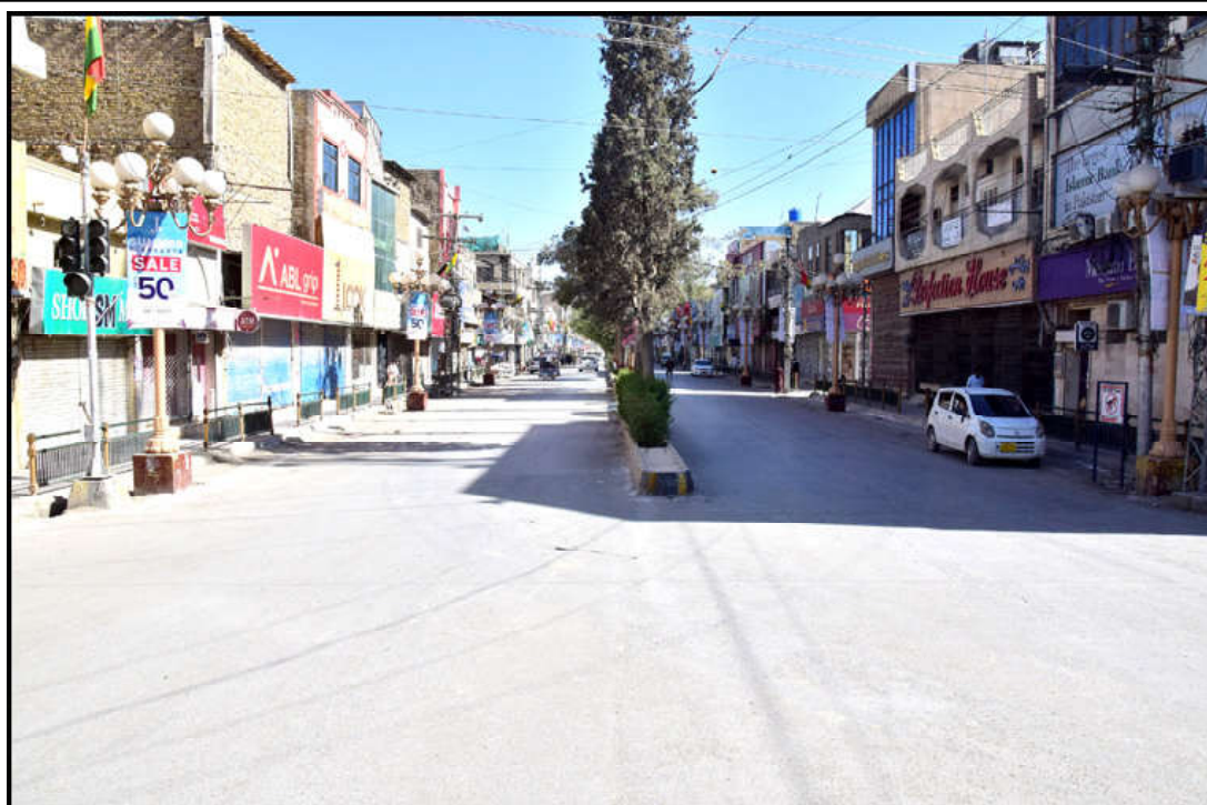
QUETTA: Business activities seen closed while markets gives deserted look during the shutter down strike called by Ittehad Ahle Sunnat Balochistan against Mastung bomb blast