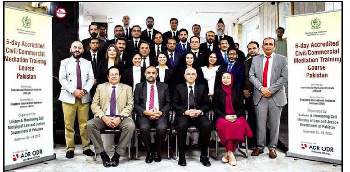
ISLAMABAD: Ministry of Law and Justice organized a 6-day Accredited Civil/Commercial Mediation Training Course.

young vloggers and adventure lovers have recorded much about Pakistan's beauty, natural environment, sustainable tourism, eco tourism and adventure tourism which has increased the movement of domestic tourists for recreational purposes but besides that the young generation in their tourist guide material must create sense of responsibility to save environment, discourage pollution and attract international audience to this piece of land, he suggested.