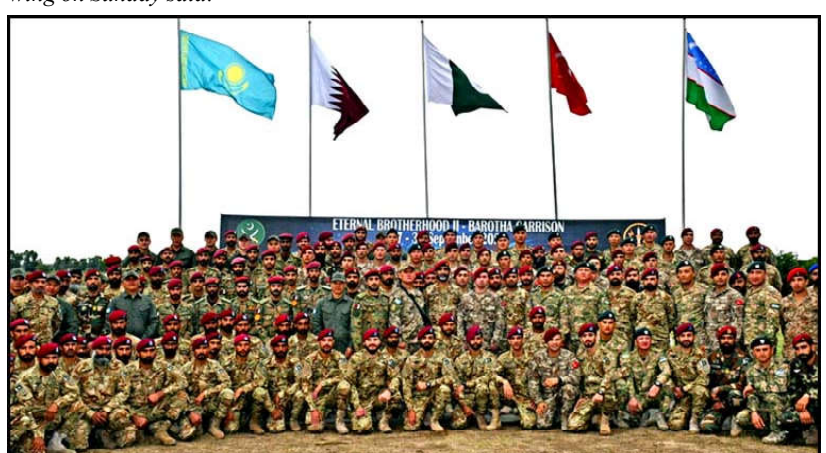
The two-week-long Exercise Eternal Brotherhood-II commenced on September 17 in Barotha, the Inter-Services Public Relations (ISPR) news release said. The Corps Commander 11 Corps attended the Closing Ceremony as Chief Guest along with the Director General Military Training and General Officer Commanding Special Service Group.

RAWALPINDI (APP): The Multinational Joint Special Forces Exercise Eternal Brotherhood-II conducted among Special Forces of Pakistan, Kazakhstan, Qatar, Turkey and Uzbekistan in Counter Terrorism domain has concluded, the Military's media wing on Sunday said.