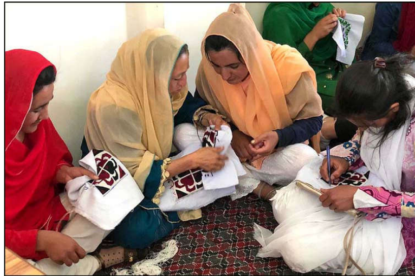
GILGIT: Skilled women are embroidering bed sheets and pillows for sale at the Women's Market.