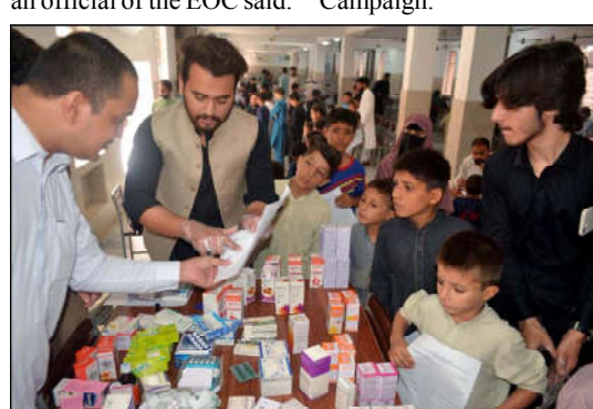
PESHAWAR: Patients are being examined by doctor and providing free medicines during the free medical camp held at Government of Khyber Pakhtunkhwa Model Institute for State Children Zamung Kor in Peshawar.

"In the second phase of the campaign, which will continue from October 9-13, all children up to five years of age in Bannu and DI Khan divisions will be vaccinated against Polio," an official of the EOC said.