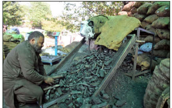
ISLAMABAD: A Labourer is busy in packing sacks of charcoal at his workplace at Khanna Pull area in Federal Capital.

due to high inflation, rising debt, and balance of payments pressures, said a news release here. These challenges mounted during the pandemic and were further intensified by Russia-Ukraine conflict. He said slower growth and constrained capacity to support their most vulnerable people expose some of these countries to substantial social instability risks and the same time, these economies face the conundrum of participating in global efforts to reduce their carbon emissions and help combat climate change without sacrificing growth and jobs.