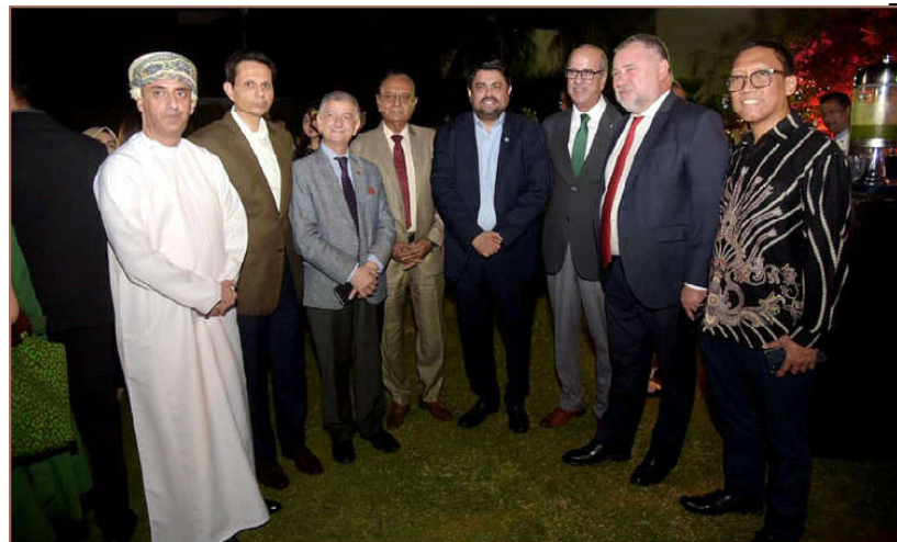
KARACHI: Sindh Governor Kamran Khan Tessori in a group photo with Consul General France and diplomats of other countries during Piano Concert at French Culture Centre.