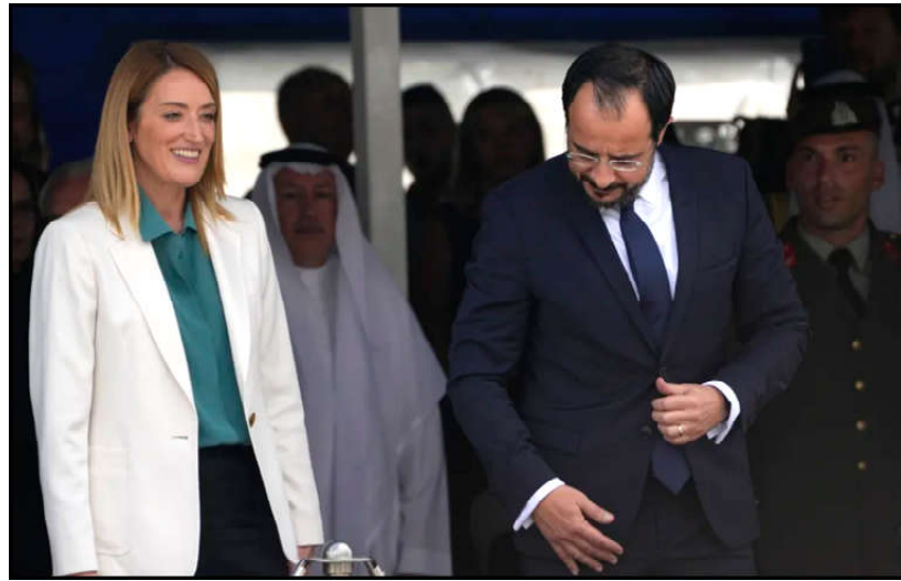
MALE: Officials count votes at a polling station during the second round of Maldives' presidential election.

pied and then annexed east Jerusalem, which the Palestinians see as the future capital of their proposed state. An agreement between Israel and Saudi Arabia would follow the US-brokered Abraham Accords which saw Israel establish diplomatic relations in 2020 with three Arab countries. Last month, on the sidelines of the United Nations General Assembly, Raisi said any "relationships between regional countries and the Zionist regime would be a stab in the back of the Palestinians." Iran and Saudi Arabia, two regional powers, resumed relations, severed since 2016, under a China-brokered deal announced in March.