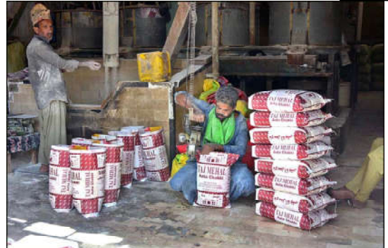
HYDERABAD: A worker busy in packing flour in bags at flour mill.