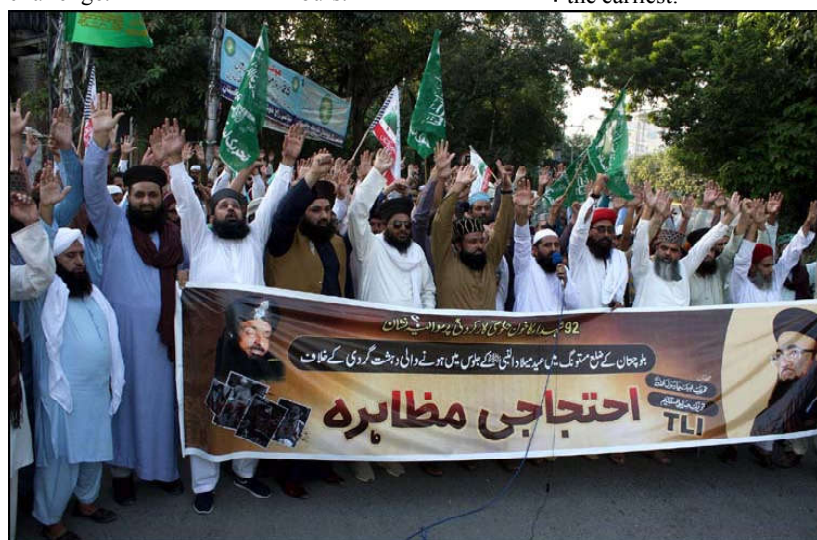
LAHORE: Members of various Sunni organizations are holding protest demonstration against the bomb attack on religious procession of 12th Rabi-ul-Awwal Eid Milad-un-Nabi in Mastung District, held at Lahore press club.

Bahawalpur has experienced the highest concentration of conjunctivitis cases in 2023, with a staggering 77,672 cases recorded. Shockingly, 34 new eye infection cases were reported within the last 24 hours.