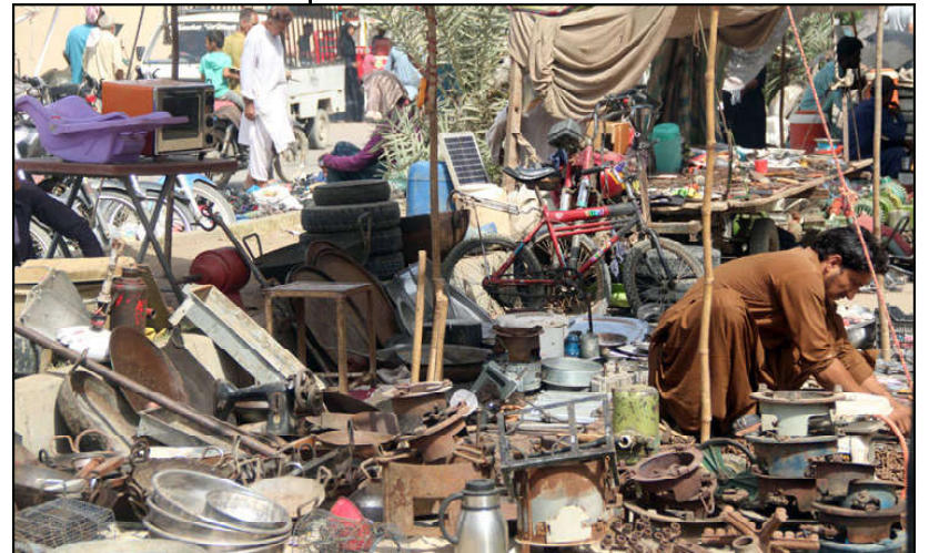
KARACHI: A view of vendors displayed scrap for selling purpose alongside a road at U,p Moor, in Provincial Capital.

deficient SOEs inflicted overall huge losses of around Rs500 billion to the national exchequer during last year (2022). He said however privatization of the banking industry was one of the biggest success stories in Pakistan which transformed from loss-making to profitable entity. The overall performance of SOEs was not very healthy what is called "contrary to the expectations" adding that some of these were marred by gross bad governance. He said other targeted companies in the pipeline for sale in the next phase between 2023-24 must also be placed on top priority for transparent privatization. He said it's an established fact worldwide that business activities are always carried out by the private sector.