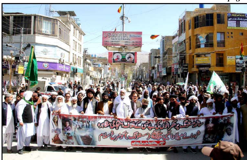
QUETTA: Business activities seen closed while markets gives deserted look during the shutter down strike called by Ittehad Ahle Sunnat Balochistan against Mastung bomb blast