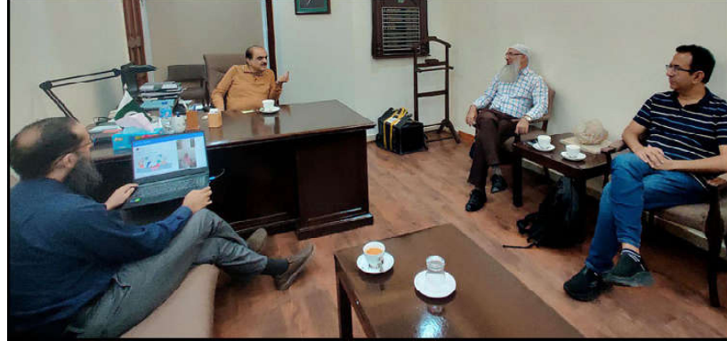
ISLAMABAD: Faculty Members National University of Science and Technology are meeting with Chief Secretary of Gilgit Baltistan.