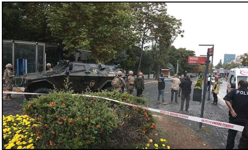
Members of Turkish Police Special Forces secure an area following an explosion near the Interior Ministry in Ankara, Turkey.