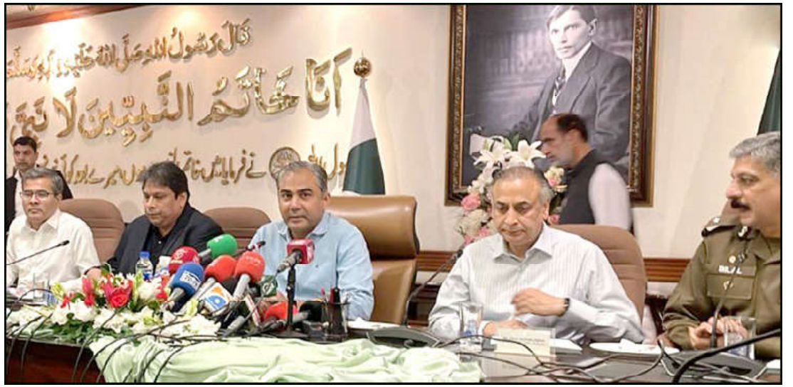
LAHORE: Caretaker Chief Minister Punjab Mohsin Naqvi addressing a Press conference.

He said now the reading room had become of an international standard. He hoped that the Mayo Hospital would be upgraded by January 31 next year. The hospital administration would take over ownership of the up-gradation work and the work would be completed soon, he added. "I visit every floor and review the pace of ongoing work."