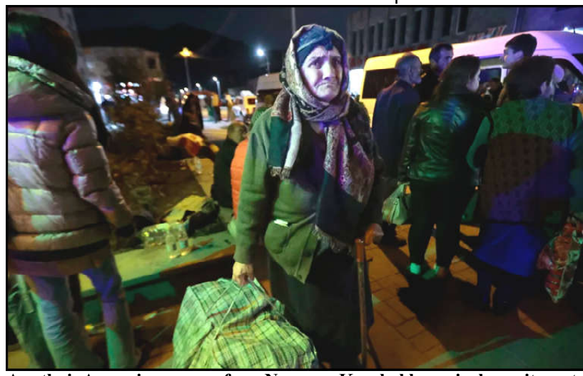
An ethnic Armenian woman from Nagorno-Karabakh carries her suitcase to a tent camp after arriving to Armenia's Goris in Syunik region, Armenia.