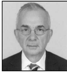
Ashraf Jehangir Qazi

To achieve that, the government would have to shrink its budget deficit to 2-3pc by increasing tax revenues to 25-20pc of GDP and cutting its wasteful expenditures.