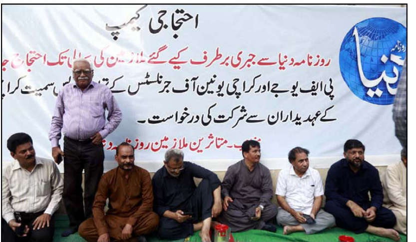
KARACHI: Employees of private news channel are holding protest demonstration against forced dismissals, at Karachi press club.