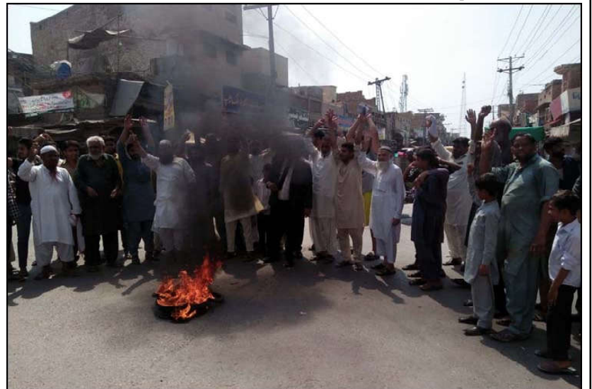
MULTAN: Citizens are holding protest demonstration against price hike of electricity bills, in Multan