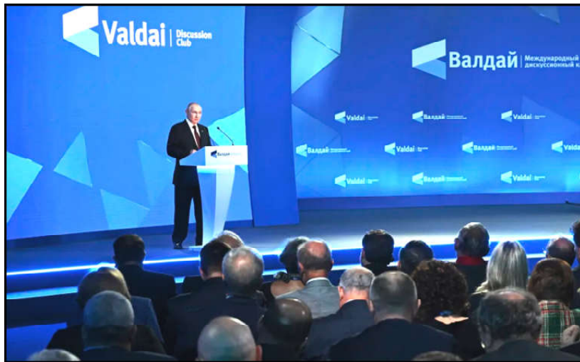
Russian President Vladimir Putin addresses the annual meeting of the Valdai Discussion Club in the Black Sea resort of Sochi, Russia.

"I'm not ready to say yet whether it's necessary for us to conduct tests or not," he said.