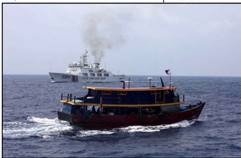
A Philippine supply boat sails near a Chinese Coast Guard ship during a resupply mission for Filipino troops stationed at a grounded warship in the South China Sea.

Limpo was on working visit to Italy and Spain when the KPK searched his official residence in Jakarta last week.