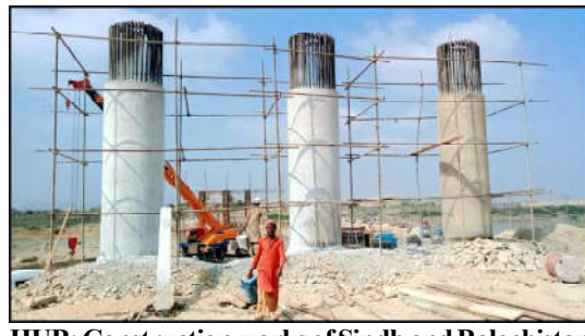
HUB: Construction works of Sindh and Balochistan connecting Bridge is underway, in Hub.

sons after attending the ceremony of the scholarship cheque distribution under National Endowment Scholarship for Talent Scheme among the students at University of Sindh Jamshoro on Friday. He informed that all out efforts are being made to provide scholarships to make male and female students of Sindh on priority basis adding that merit is being ensured while selecting the candidates for scholarships.