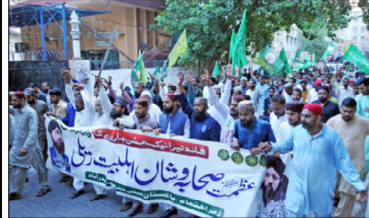
HYDERABAD: Workers of Pakistan Sunni Tehreek hold "Azmat-e-Sahaba and Shan-e-Ahle Bait rally in City.