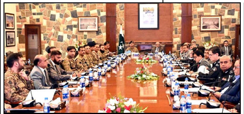
KARACHI: Caretaker Chief Minister Sindh, Justice (Retd) Maqbool Baqar chairs Provincial Apex Committee meeting held at CM House in Karachi. Chief of Army Staff (COAS), General Asim Munir is also present.