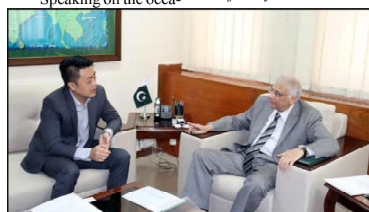
ISLAMABAD: The Minister for Planning, Development and Special Initiatives, Sami Saeed, has reaffirmed the Government of Pakistan's commitment to fast-tracking the ongoing projects of the China Pakistan Economic Corridor (CPEC).

Wang said that China stands ready to work with Pakistan to promote high-quality development of the CPEC. For his part, Jilani spoke highly of the fruitful results of bilateral cooperation and the CPEC, stressing that the Pakistan-China relationship has always been the cornerstone of Pakistan's foreign policy. The CPEC has helped Pakistan transform its economic landscape and brought tangible benefits to the country, the foreign minister added. He also extended congratulations on the 74th anniversary of the founding of the People's Republic of China. According to Pakistan Ambassador to China, Mo'in ul Haque, at the invitation of the Chinese government, Foreign Minister, Jalil Abbas Jilani attended 3rd China Tibet Trans-Himalayan Forum in Tibet, China. In his speech, he emphasized the importance of regional cooperation for green development, ecological preservation and connectivity for inclusive and sustainable development.