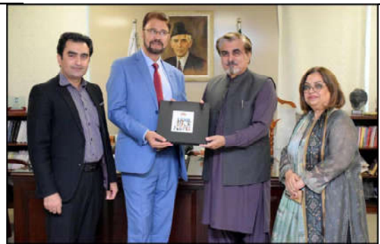
ISLAMABAD: Federal Minister for National Heritage and Culture Jamal Shah presenting a book to British MP Afzal Khan.

ISLAMABAD (APP): Iqra University's H-9 Campus in Islamabad proudly organized a comprehensive four-day training workshop aimed at Faculty Professional Development. Engaging faculty members from all six prominent departments - Business, Computer Sciences, Social Sciences, Art and Fashion Design, Media Studies, and Pharmacy - the workshop offered invaluable insights into teaching.