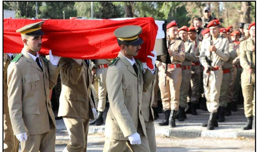
An soldiers carry a casket during the funeral of the victims of a drone attack targeting a Syrian military academy, outside a hospital in government-controlled Homs.

"It's pure publicity," Lopez Obrador said in a regular morning press conference after the Biden administration announced it would build additional sections of border wall, carrying forward a signature policy of the Trump administration.