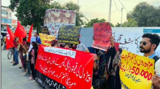
KARACHI: Members of Home Based Women Workers Federation (HBWWF) are holding protest demonstration against massive unemployment, increasing price of daily use products and inflation price hiking, at Shah Faisal Colony in Karachi

CHICAGO (Xinhua/APP): Gold futures on the COMEX division of the New York Mercantile Exchange fell on Thursday as U.S. jobless claims data were better than expected. The most active gold contract for December delivery fell 3.00 U.S. dollars, or 0.16 percent, to close at 1,831.80 dollars per ounce. The U.S. Labor Department reported Thursday that U.S. initial jobless claims ticked up slightly to 207,000 in the week ending Sept. 30. The median estimate by economists called for an increase to 210,000. In remarks prepared for an event hosted by The Economic Club of New York on Thursday, San Francisco Fed President Mary Daly said U.S. policymakers can hold interest rates steady if the labor market and inflation continue to cool or financial conditions remain tight. "If we continue to see a cooling labor market and inflation heading back to our target, we can hold interest rates steady and let the effects of policy.