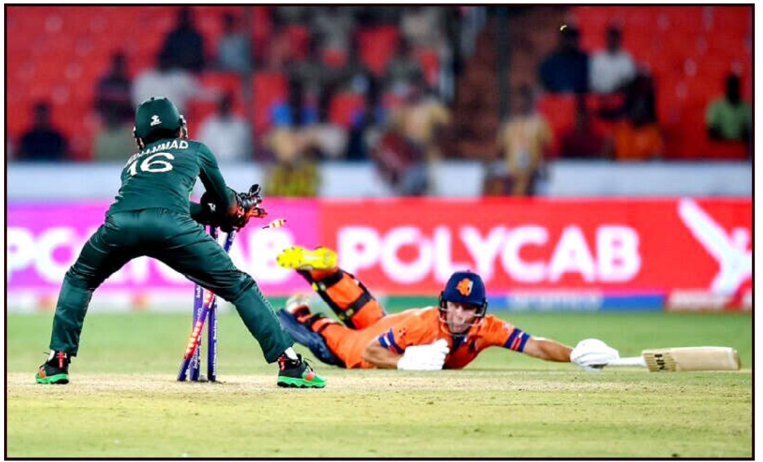
Mohammad Rizwan runs out Netherlands' Roelof van der Merwe during the 2023 ICC Men's Cricket World Cup one-day international (ODI) match between Pakistan and Netherlands at the Rajiv Gandhi International Stadium in Hyderabad

Meanwhile, Mohammad Nawaz played a valuable knock of 39 off 43 balls. Asked to take the first strike, Pakistan rode on half-centuries from Mohammed Rizwan (68) and Saud Shakeel (68) to post a solid total on the board. Bas de Leede returned with four wickets for Netherlands, while Colin Ackermann snapped two dismissals.