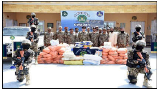
UTHAL: Pakistan Coast Guards seize huge quantity of narcotics from a vehicle.