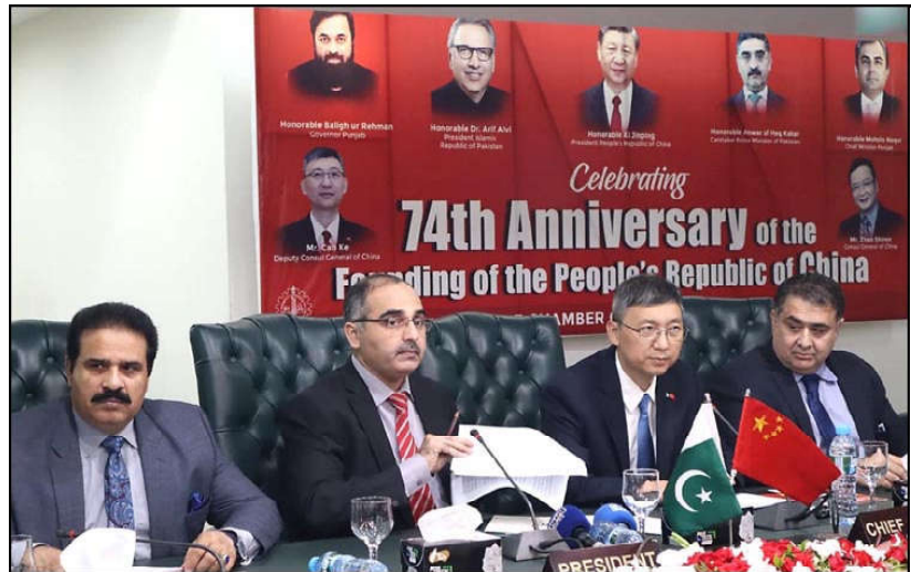
LAHORE: China's Acting Chinese Consul General in Lahore, Cao Ke addressing a function held on occasion of the 74th founding anniversary celebration of the People's Republic of China. The event was organised by the Lahore Chamber of Commerce and Industry (LCCI).