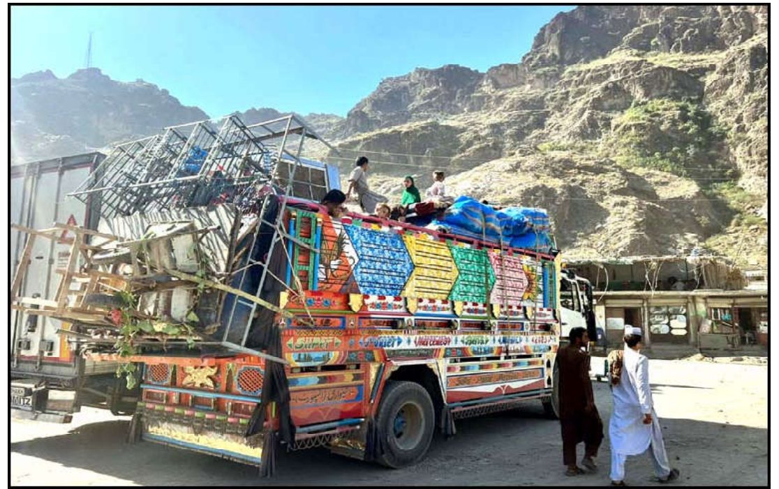
LANDIKOTAL: Unregistered Afghan families are willingly enroute their home land passing through Khyber Pass with their homes necessities after the government decided in the apex committee meeting to expel all those Afghans who are living in Pakistan unlawfully

He also directed all the administrative officers to improve public service delivery, and in this regard, no negligence would be tolerated at all, Chief Minister maintained.