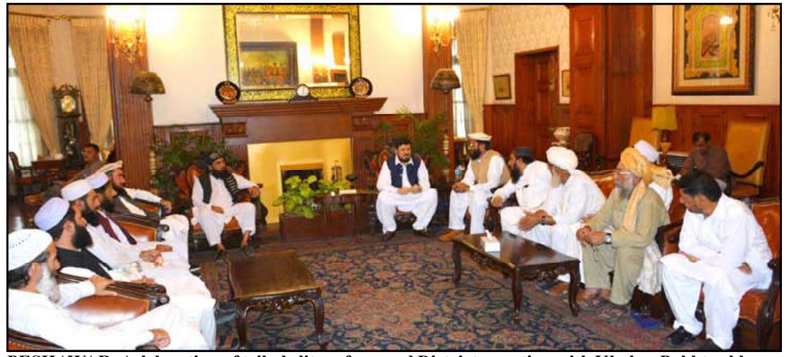
PESHAWAR: A delegation of tribal elites of merged Districts meeting with Khyber Pakhtunkhwa Governor Haji Ghulam Ali.

disclosed that 90 percent of the work had already been accomplished. Additionally, he informed that two construction companies are working tirelessly to complete the Bund Road project before 120 days. Simultaneously, numerous pending projects in Rawalpindi, including the Ring Road and safe city authority, have been initiated. These projects are slated for completion within 90 to 180 days.