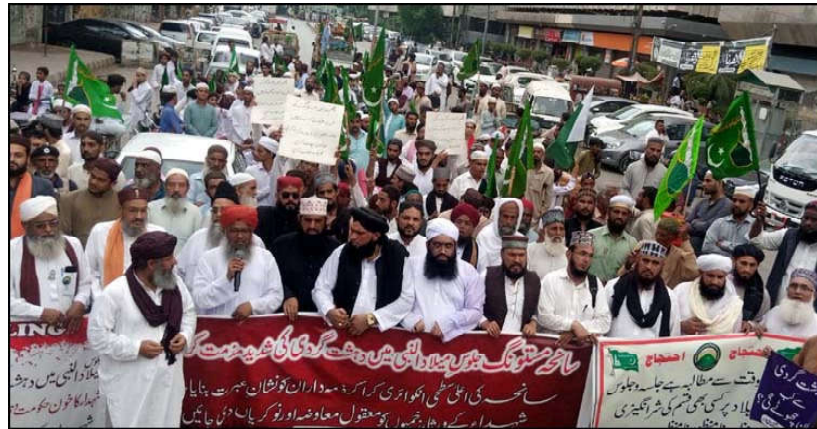
KARACHI: Members of Tehreek-e-Ahlesunnat are holding protest demonstration against Mastung tragedy, at Karachi press club.

of the nation and the scholarship aimed to support students in realizing their dreams and contributing to the strong bond between China and Pakistan. Speaking at the ceremony, the Vice Chancellor expressed his profound gratitude towards the Chinese embassy for its unwavering support of the University of Sargodha. He stated, "Education is a powerful tool for building bridges and strengthening the bonds of friendship between nations. The Chinese ambassador scholarship not only enhances educational opportunities for Pakistani students but also promotes people-to-people connections and cultural understanding between China and Pakistan."