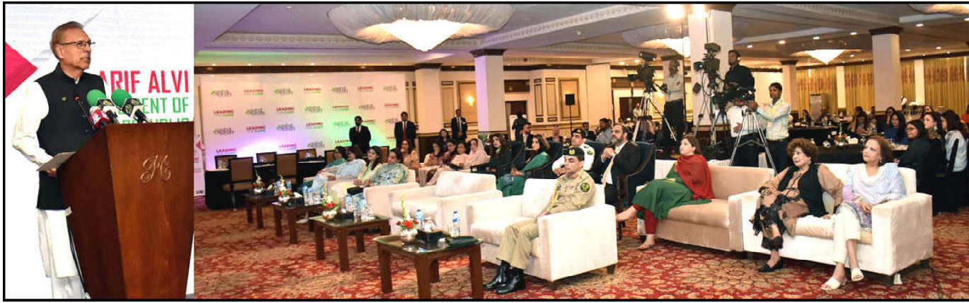
KARACHI: President Dr. Arif Alvi addressing during an event on the Spirit of Female Entrepreneurship and Medical Leadership of female doctors organized by Sehat Kahani.

Ph: 0300-3898091 Vol: 05. No. 298 Rabi-ul-Sani 15, 1445 AH Tuesday October 31, 2023 Pages 04 Price Rs. 12.00