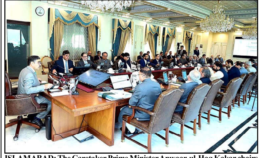
ISLAMABAD: The Caretaker Prime Minister Anwaar-ul-Haq Kakar chairs a meeting of the Caretaker Federal Cabinet.

The prime minister said that Pakistan had entertained on its soil for decades those Afghans that had been registered as refugees and compared the treatment meted out to immigrants' boats in the Mediterranean Sea.