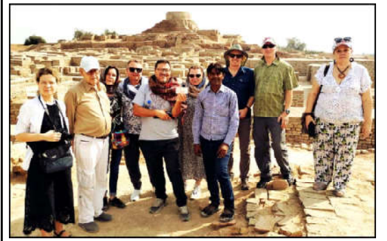
MOHENJO DARO: A tourist delegation from Russia are visiting and expressed keen interest in the historical ruins of the World Heritage Monuments of Mohenjo Daro