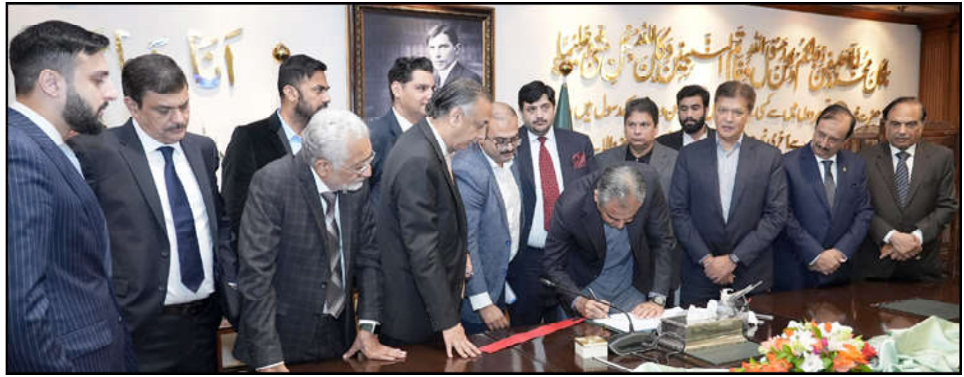
LAHORE: Chief Minister Mohsin Naqvi signing documents of provincial budget with a total outlay of Rs 2076.2 billion for another four months.

The Punjab government would provide staff to address any shortage reported by the Election Commission.