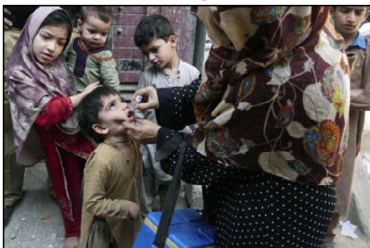
KARACHI: Health worker administers polio vaccine drops to a child during anti-polio immunization campaign, at Federal B Area in Karachi