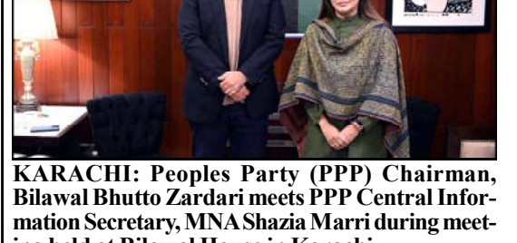
KARACHI: Peoples Party (PPP) Chairman, Bilawal Bhutto Zardari meets PPP Central Information Secretary, MNA Shazia Marri during meeting held at Bilawal House in Karachi.