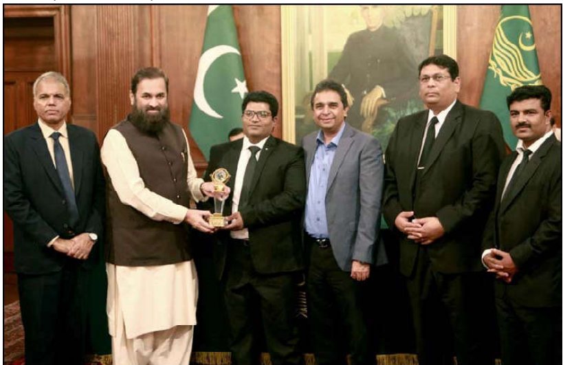
LAHORE: Punjab Governor Muhammad Baligh-ur-Rehman distributing National Christian Award amongst the participants on their best performance in various fields.

week-long ruthless genocide maneuvered and executed by the despotic ramed dogra ruler's force and gangsters besides the armed Hindu fanatics in the first and second week of November 1947. These martyrs included 2.50 Muslim inmates of Jammu city and adjoining areas who were martyred by the dogra forces and their armed gangsters 6th of November 1947 while they were moving for migrating to the adjoining Sialkot city of the newly-born separate homeland of the Muslims of the subcontinent - Pakistan.