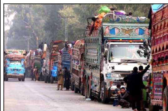
Illegal immigrants families living in Pakistan arrived outside the United Nations High Commissioner for Refugees (UNHCR) repatriation center to voluntarily return to Afghanistan following Pakistan's government decision to deport all illegally staying foreigners from the country after October 31st.