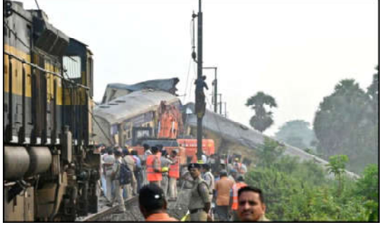
Rescue workers and police officials stand next to damaged coaches following a collision between two passenger trains in Vizianagaram district in the southern Andhra Pradesh state, India.

Advertisement Scroll to continue "We have to make sure that British systems are safe and secure from the threat of terrorism as the government always does," higher education minister Robert Halfon told Times Radio. Britain's MI5 intelligence agency currently regard the threat to the country from terrorism as substantial, meaning an attack is likely. There are two higher categories of threat level - severe, meaning an attack is highly likely, and critical, meaning an attack is highly likely in the near future.