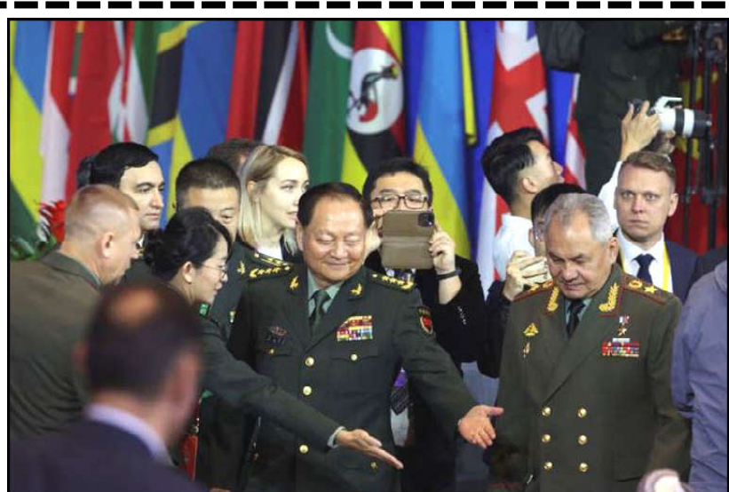
China's Central Military Commission Vice Chairman Zhang Youxia and Russian Defence Minister Sergei Shoigu arrive for the Beijing Xiangshan Forum in Beijing, China.

marriage rates because official policies make it hard for single women to have children. China's National Bureau of Statistics in January reported the first population drop in six decades and the country's population is rapidly ageing. In the last two years, authorities across China have unveiled measures to lift the country's birth rate including financial incentives and boosting childcare facilities. The state media has often linked population development to the strength and "rejuvenation" of the country.