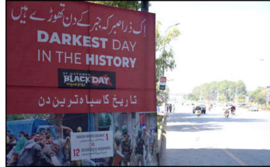
ISLAMABAD: A view of the banner at Faisal Avenue regarding the "Black Day of 27 October about the cruelty on oppressed Kashmir's of IIOJK".

LUANDA, (Angola) (APP): Chairman Senate Committee on Defence, Senator Mushahid Hussain, Leader of Pakistan Parliamentary delegation to the annual conference of the Inter Parliamentary Union (IPU) has forcefully condemned Israeli crimes against humanity against the Palestinians and accused its Western supporters of 'hypocrisy and double standards'. In his speech, Senator Mushahid Hussain made three fundamental points. First, that Palestinian resistance to illegal Israeli occupation was justified under international law and the UN Charter.