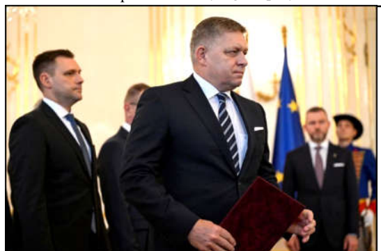
Slovakia's newly appointed Prime Minister Robert Fico attends the new cabinet's inauguration, at the Presidential Palace in Bratislava, Slovakia.

"Otherwise, further escalation of the crisis is fraught with grave and extremely dangerous and destructive consequences. And not only for the Middle East region. It could spill over far beyond the borders of the Middle East." In remarks that criticised the West, he said that certain unarmed forces were seeking to provoke further escalation and to draw as many other countries and peoples into the conflict as possible. The aim, he said, was to "launch a real wave of chaos and mutual hatred not only in the Middle East but also far beyond its borders. For this purpose, among other things, they are trying to play on the national and religious feelings of millions of people."