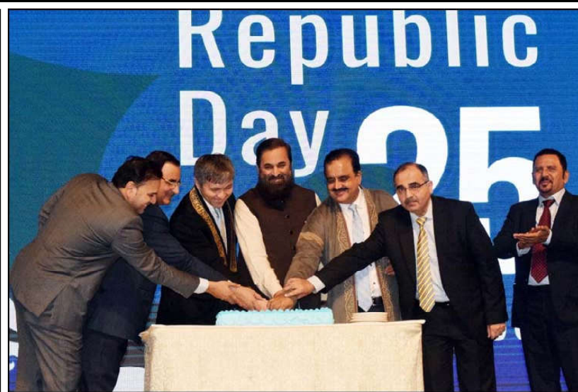
LAHORE: Governor Punjab Muhammad Balighur Rehman cutting cake during a ceremony held in connection with 31st Republic Day of Kazakhstan.

Talking to APP he informed that the authorities concerned had been directed to complete ongoing renovation and beautification work of all the parks within the shortest possible time frame. The DG said that efforts were also being made to repair faulty lights, swings and walking tracks besides improving the security of the parks.