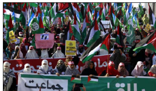
KARACHI: Activates of jamat e islami woman wing hold protest rally against Israel.

ISLAMABAD (APP): Minister for Energy Muhammad Ali on Thursday said the proposed increase in gas tariff would not affect 57 percent of consumers across the country rather it would help control and end the ever-increasing circular debt of the petroleum sector. "It will be a big achievement," the minister said in a media briefing on the gas prices' revision along with Minister for Information and Broadcasting Murtaza Solangi. The Energy Minister said the increase in gas prices had been approved by the Economic Coordination Committee (ECC) and now would be presented before the federal cabinet for the final nod. Out of around 10 million gas consumers, he said the commodity price for 5.7 million had not been increased. "After the proposed increase, there will be no surge in the circular debt of the energy sector, which currently stood at Rs2.1 trillion in the recent past." The minister said the fixed rate (line rent) for the 5.7 million gas consumers had been increased from Rs10 to Rs400, adding the new tariff would marginally affect the protected gas consumers. He was of the view that most of the people living in rural areas had no access to gas and were using Liquefied Petroleum Gas (LPG) and wood as sources of fuel.