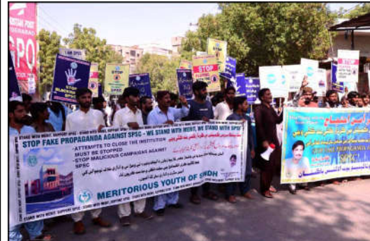
HYDERABAD: Members of United Youth Alliance are holding protest demonstration for fake propaganda against Sindh Public Service Commission (SPSC), at Hyderabad press club.