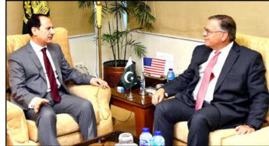
ISLAMABAD: Donald Blome, Ambassador of the United States of America to Pakistan called on Caretaker Federal Minister for National Health Services, Regulations and Coordination, Dr. Nadeem Jan.

ISLAMABAD (APP): Caretaker Prime Minister Anwaar-ul-Haq Kakar, reaffirming Pakistan's unwavering support to the oppressed Kashmiris, called for an immediate reversal of the Indian government's unilateral and illegal actions of 5th August 2019. The prime minister, in his message in connection with the 'Kashmir Black Day' being observed on Friday, also stressed that the Indian government should stop its egregious human rights violations in the Indian Illegally Occupied Jammu and Kashmir (IIOJK), and implement the relevant United Nations Security Council resolutions. "Pakistan, as always, stands shoulder-to-shoulder with its Kashmiri brethren. It will continue to extend its full moral, diplomatic and political support to their just struggle for realization of their inalienable right to self-determination," he remarked.