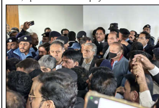
ISLAMABAD: Former Prime Minister, Nawaz Sharif arrives to appear before Islamabad High Court.