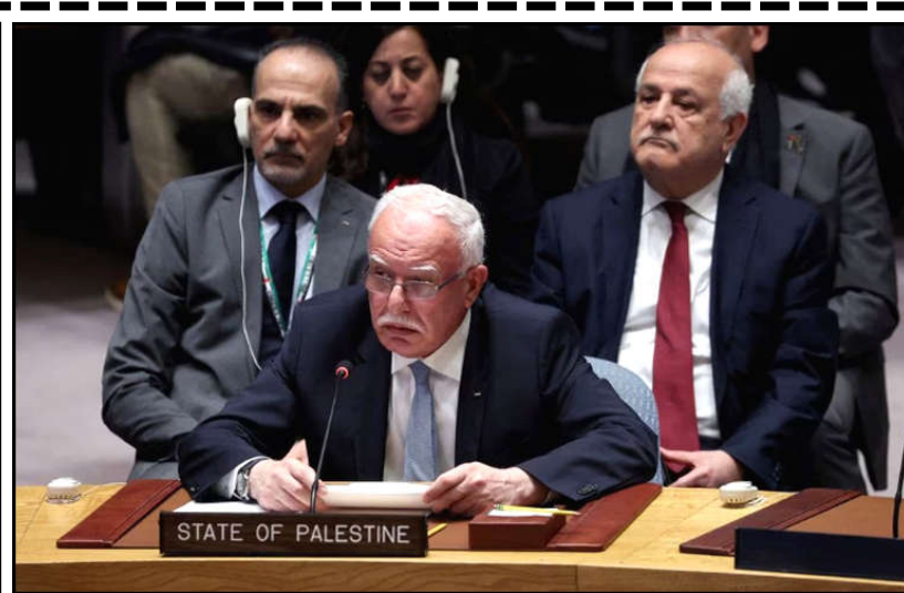
Palestinian Foreign Minister Riyad al-Maliki attends a meeting of the Security Council on the conflict between Israel and the Palestinian Islamist group Hamas at U.N. headquarters in New York, U.S.

Council can take action?" Erdogan accused the West of failing to see the violence unfolding in Gaza "because the blood being shed is Muslim blood." In his speech, Erdogan also said Turkey has so far dispatched 10 plane-loads to Egypt carrying humanitarian aid, including generators, destined for Gaza. Twenty five Turkish medical personnel have also left for Egypt, he said.