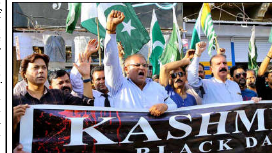
HYDERABAD: Civil society members holding the protest in a rally against Indian government during Kashmir black day outside press club.

BEIJING (APP): A leading Chinese company TGOOD and the REC Group of Pakistan signed a memorandum of understanding in Beijing aimed at promoting environmentally friendly electric vehicles (EVs) in Pakistan. Chairman of the Senate of Pakistan, Muhammad Sadiq Sanjrani, along with a Pakistani delegation, witnessed the signing ceremony. China Economic Net (CEN) reported on Thursday. Chairman Sanjrani said this collaboration has resulted in a strategic partnership aligned with the sustainable green development initiatives set forth by China during the 3rd Belt and Road Forum. The partnership covers areas such as hydrogen vehicle technology, hydrogen filling station infrastructure, EV production, battery production and recycling solutions, and EV charging infrastructure development. Transport is a major contributor to pollution in Pakistan, making a transition to alternative fuels imperative. However, Pakistan has faced a challenging dilemma, with a lack of charging stations restricting the adoption of alternative fuel vehicles, while limited investment in such infrastructure is primarily due to the scarcity of such vehicles. The joint venture with REC Group in Pakistan signifies a significant step forward. TGOOD's commitment to expanding in Pakistan.