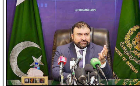
ISLAMABAD: Caretaker Federal Minister for Interior Sarfraz Ahmed Bugti addressing a Press Conference.