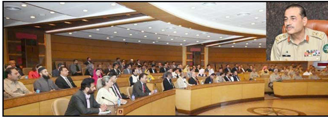
RAWALPINDI: Chief of the Army Staff General Syed Asim Munir interacting with participants of National Security Workshop-25 at General Headquarters (GHQ).