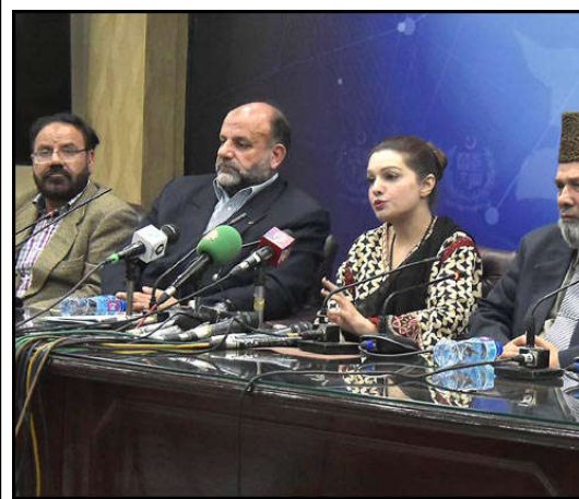
ISLAMABAD: Mushaal Hussein Mullick, SAPM on Human Rights and Women Empowerment along with APHC leaders speaks during a press conference at PID.

ISLAMABAD (APP): Addressing the meeting of SCO Council of Heads of Government (CHG) in Bishkek, the foreign minister said as the succeeding Chair of the Council, Pakistan would continue to support the existing mechanisms and welcome new initiatives. The council is the second-highest body within the SCO and focuses on issues related to economy, finance, trade and socio-economic collaboration. Jilani said SCO was the key platform for taking the vision of Eurasian connectivity to the next level. Pakistan's location at the crossroads of South Asia, Central Asia and the Middle East makes it an ideal trade conduit.