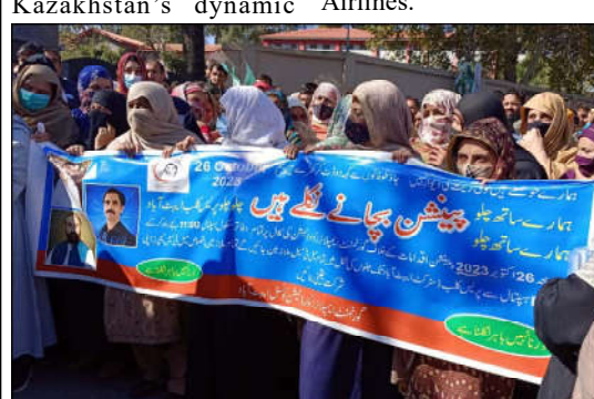
ABBOTTABAD: Members of Government Employees Coordination Council are holding protest demonstration against government policies, at Abbottabad press club.

Independent Report LAHORE: Governor Punjab Muhammad Balighur Rehman attended the 31st Republic Day of Kazakhstan function as Chief Guest at Al Hamra Hall here today. Governor Punjab extended his heartfelt felicitations to the brotherly people of the Republic of Kazakhstan on the occasion of their Republic Day. Speaking on the occasion, Punjab Governor Muhammad Balighur Rehman said that the nation of Kazakhstan is a resilient and independent nation. He referred to last year and said that the two countries celebrated the 30th anniversary of the establishment of diplomatic relations. He said that Kazakhstan's dynamic