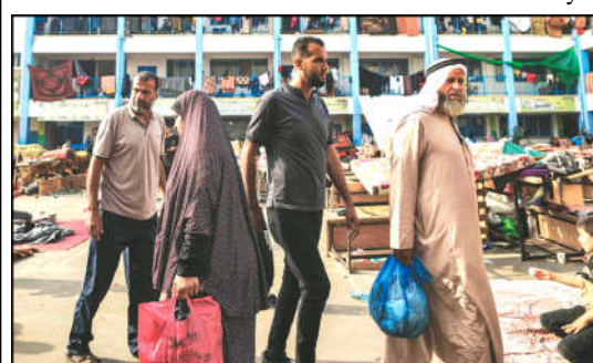
People arrive at a school in Khan Yunis that has been converted into a shelter for displaced families.

Monitoring Desk WASHINGTON: A massive manhunt was under way on Thursday for a gunman who a local official said killed at least 22 people and wounded "many" more in mass shootings in the US state of Maine, the deadliest such incident this year. Police said Robert Card — seen in surveillance footage pointing a semi-automatic weapon with an extended clip as he walked into a bowling alley in the town of Lewiston — "should be considered armed and dangerous". Card is a certified fire-