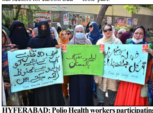
HYFERABAD: Polio Health workers participating in a polio awareness walk during world polio day

scrutiny committee today. international development sector organizations, Corsaid that the welfare work porate Sector Organizais going on by the higher tions and Business owners officers and the police department. tance and full financial sup-port is being provided to the