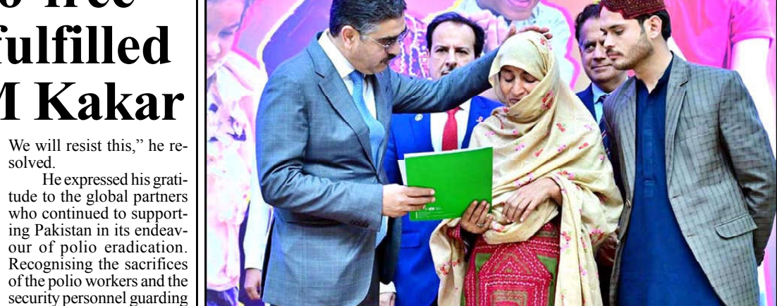
ISLAMABAD: The Caretaker Prime Minister Anwaar-ul-Haq Kakar distributes cheques among the families of martyred polio workers and polio workers who got injured in the line of duty.