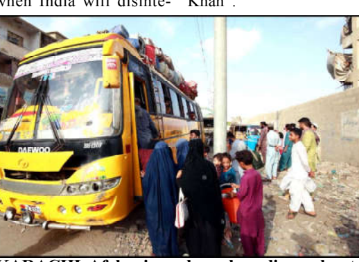
KARACHI: Afghani people are boarding on bus to depart for their homeland following Pakistan government order for all illegal migrants to leave the country, at Sohrab Goth Bus Stand in Karachi.

rule, the president said, "Our elders struggled hard to liberate the territory from the clutches of Dogra under the leadership of Ghazi Millat Sardar prove to be Gorbachev for "The day is not far Muhammad Ibrahim when India will disinte- Khan"