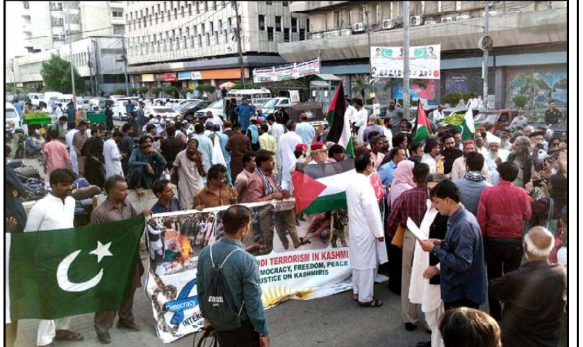
KARACHI: Members of Civil Society are holding protest demonstration against Israeli cruel and inhumane acts and express unity with the innocent people of Palestine, at Karachi press club.

ing to media men after appearing in Karachi Account ability Court Tuesday.