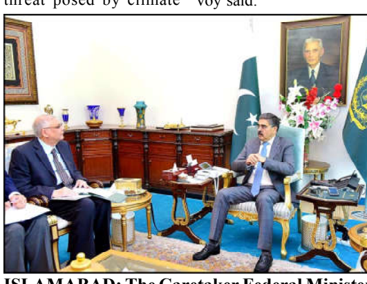
ISLAMABAD: The Caretaker Federal Minister for Planning Sami Saeed calls on the Caretaker Prime Minister Anwaar-ul-Haq Kakar.

perity. The UN has adapted its structures considerably in response to emerging challenges and threats, in particular shifting its efforts from decolonization in the early years to equitable development, through the universally accepted Sustainable Development Goals (SDGs), the Pakistani en-