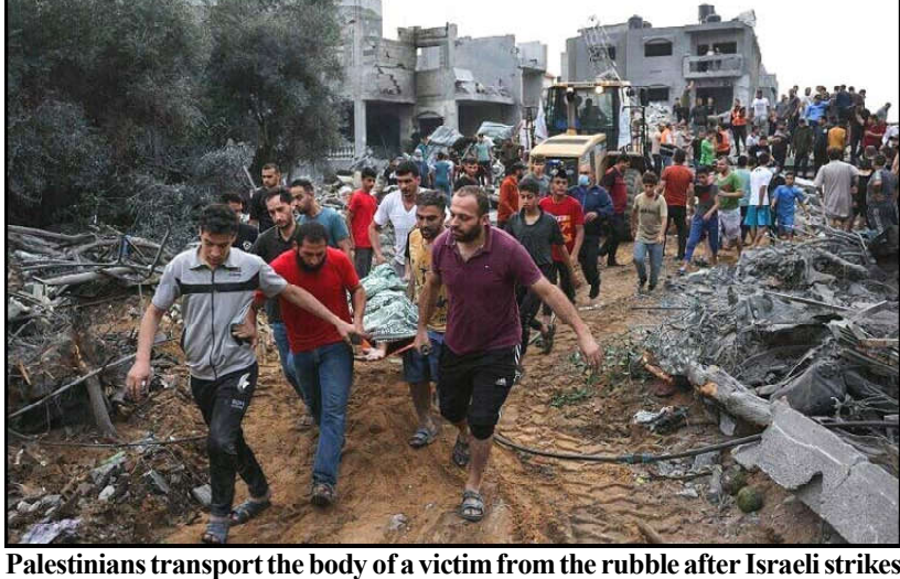
in Rafah in the southern Gaza Strip.

Israel cut the electricity supply to Gaza as part of the "total siege" it launched on October 9, se-We decided to release riously hindering communications between the Palestinian territory and the rest of the world.