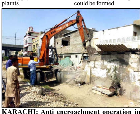
progress demolishing illegal encroachment during anti-encroachment drive to clear the land of Railways Department under the supervision Pakistan Railways, at Colony Gate in Karachi.

ing the preparation of Hyderabad's master plan all the elected representatives and the stakeholders would be taken on board to ensure that a comprehensive development plan