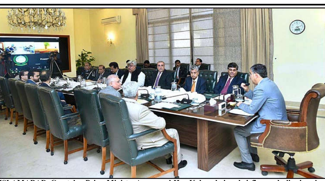
ISLAMABAD: Caretaker Prime Minister Anwaar-ul-Haq Kakar chairs a briefing on decline in prices of essential items as a result of reduction in the prices of petroleum products.

He said 18 percent reduction of wheat price and sugar by 16 percent in Balochistan