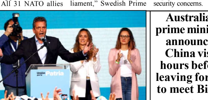
Argentina's presidential candidate Sergio Massa addresses supporters, as he reacts to the results of the presidential election, in Buenos Aires, Argentina.

Sweden and its neighbor Finland abandoned decades of military nonalignment and sought protection under NATO's security umbrella after President Vladimir Putin ordered Russian troops to invade Ukraine in February 2022. Finland ioined the military alliance in April after Turkey lifted its objections to its membership, saying Helsinki had taken steps to address Ankara's security concerns.