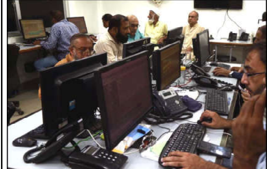
KARACHI: Brokers are busy in trading at Pakistan Stock Exchange (PSX) in Karachi.

The report highlighted that Pakistan's economic situation has started to show some early signs of improvement as the country has been able to secure a US$ billion Stand-By Arrangement (SBA) from IMF,