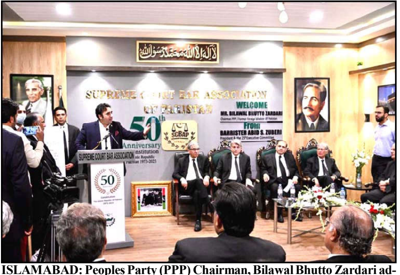
dresses during the ceremony regarding the completion of 50 years of the Constitution of Pakistan under the Supreme Court Bar Association of Paki stan held in Islamabad.

'These are the funds meant for workers but due trial units are given favour at able at any cost," the CM were 127 defaulting units that