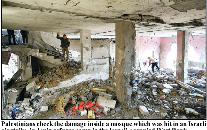
air strike, in Jenin refugee camp in the Israeli-occupied West Bank

"It's in Australia's interest to have good re-lations with China," Albanese told reporters at Australian Parliament