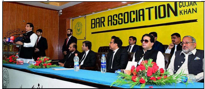
GUJAR KHAN: Speaker National Assembly Raja Pervez Ashraf addressing the Public Gathering after Inaugurating Solar Energy System at Gujar Khan Bar Association.