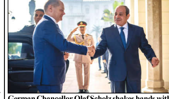
German Chancellor Olaf Scholz shakes hands with Egypt's President Abdel Fattah al-Sisi in Cairo.

far east. Earlier in the day, Lavrov lashed out at what he termed a "dangerous" US policy towards North Korea while touting the "new, strategic level" of relations between Moscow and Pyongyang. "Like our North Korean friends, we are seriously worried about the intensification of military activity of the United States, Japan and South Korea in the region and by Washington's policies," Lavrov told journalists, according to Russian news agencies. "We oppose this unconstructive and dangerous line," he said.