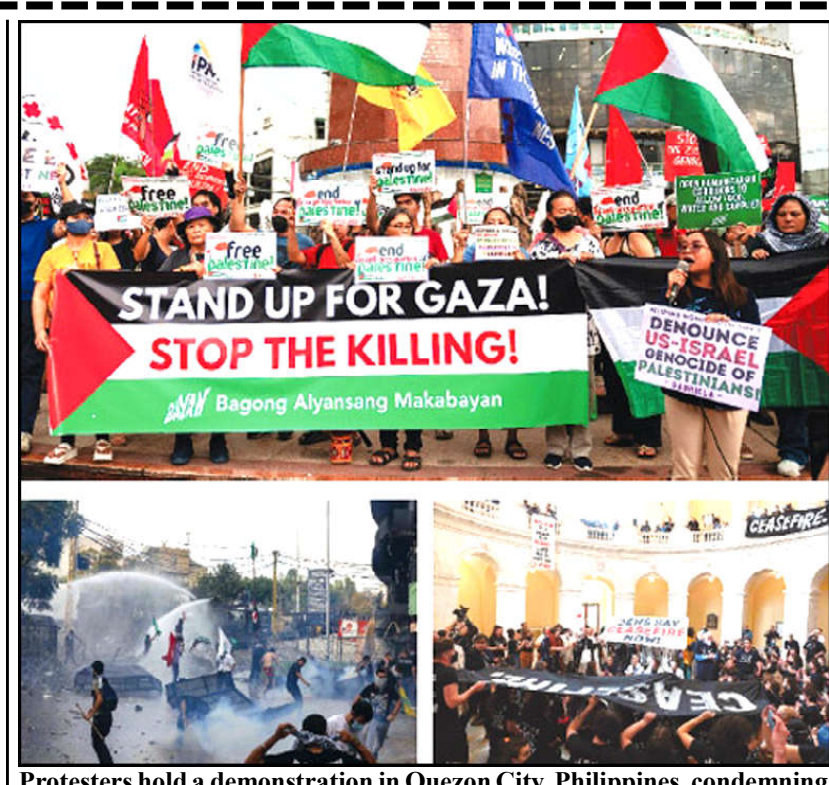
Protesters hold a demonstration in Quezon City, Philippines, condemning the blast at the Ahli Arabi hospital in Gaza; members of the US Jewish community protest in the US Capitol in Washington against Israeli attacks; and Lebanese security forces use water cannons as they clash with protesters outside the US Embassy in Awkar, east of Beirut, during a pro-Palestinian demonstration.

Monitoring Desk CAIRO: Egypt's President Abdel Fattah al-Sisi said on Wednesday that Egyptians would reject the forced displacement of millions of Palestinians into Sinai, adding that any such move would turn the peninsula into a base for attacks against Israel. The Gaza Strip is effectively under Israeli control and Palestinians could instead be moved to Israel's Negev desert "till the militants are dealt with", Sisi told a joint news conference in Cairo with German Chancellor Olaf Scholz. The border between Egypt's Sinai Peninsula and the Gaza Strip is the site of the only land crossing from the Palestinian territory that is not controlled by Israel. Israel's unprecedented bombardment and siege of Gaza has raised fears that its 2.3 million residents could be forced southwards into Sinai.