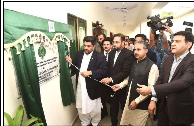
KARACHI: Governor Sindh Kamran Khan Tessori inaugurating WhatsApp application QR Code.

application which would initially address complaints against 9 government entities. He said that this QR Code would be displayed at major shopping centres, Airport, Railway Stations, main roads and other prominent places. The Governor Sindh further said that he would continue to endeavor for mitigating the sufferings of common man.