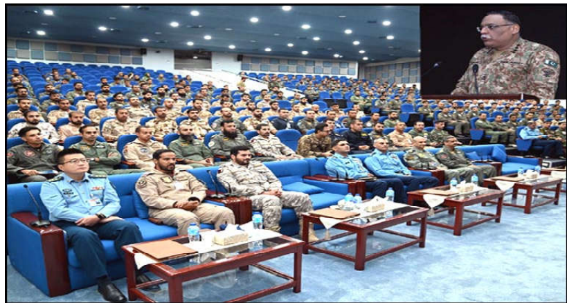
ISLAMABAD: Chairman Joint Chiefs of Staff Committee, General Sahir Shamshad Mirza addressing the participants of ongoing aerial exercise Indus Shield-2023.