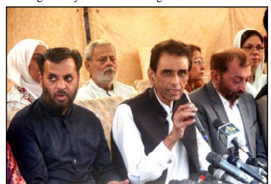
KARACHI: Convener MQM Khalid Maqbool addressing press conference along with others in Provincial Capital.