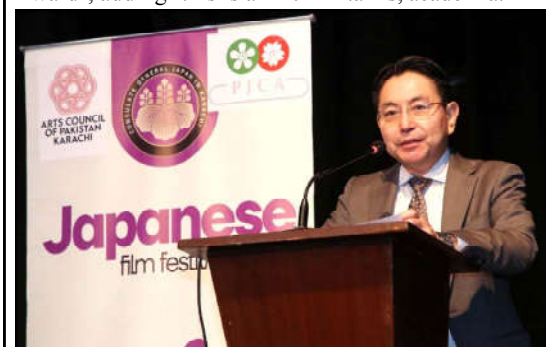
KARACHI: Consul-General of Japan in Karachi, Odagiri Toshio addresses during Japanese Film Festival, held at Art Council of Pakistan building in Karachi.

The development comes after Sindh transport department held a meeting with delegation of transport association. In the meeting, the transport department announced 10pc reduction in intercity fares. It also warned stern legal action against the offenders. It also directed the regional and district transport officials to ensure implementation of orders. The Islamabad Transport Authority (ITA), in a bid to provide relief to commuters announced a 10% reduction in transport fares, both for inter-city and intra-city routes. The decision was taken in a meeting held on the instructions of Deputy Commissioner Islamabad Irfan Nawaz Memon, following the reduction in the price of petroleum products by the government. "The reduced fares will be implemented on 23 different routes in the Islamabad district, and intra-city transport (outside Islamabad)," the statement read.