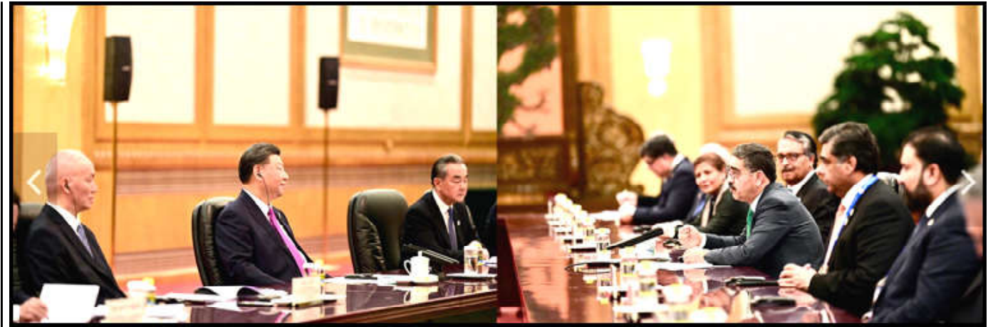
BEIJING: Caretaker Prime Minister Anwaar-ul-Haq Kakar meets Chinese President Xi Jinping in Beijing

underscored that Pakistan and China were reliable partners and steadfast friends. Reaffirming Pakistan's support to China on its core issues, the prime minister termed the bilateral relationship as a factor of peace and stability in the region. President Xi underlined that Pakistan was an iron brother, trusted friend, and partner in peace and development. He said China accorded special importance to Pakistan in its foreign policy and would continue to support Pakistan's sovereignty, territorial integrity and development.