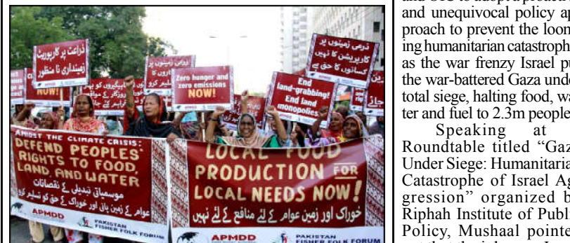
KARACHI: Members of Pakistan Fisher Folk Forum are holding protest demonstration against high handedness of influent land grabbers, held at Karachi press club.