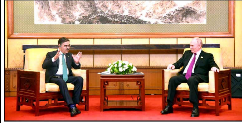
Caretaker Prime Minister Anwaar-ul-Haq Kakar meets Russian President Vladimir Putin on the sidelines of 3rd Belt and Road Forum, Beijing.

The COAS said: "The Palestinian people have unequivocal diplomatic, moral and political support of the Pakistani nation and we will continue to support the principled stance of our brethren for enduring resolution of the Palestinian issue and end to the unlawful occupation of their territories and Muslims' Sacred Places".