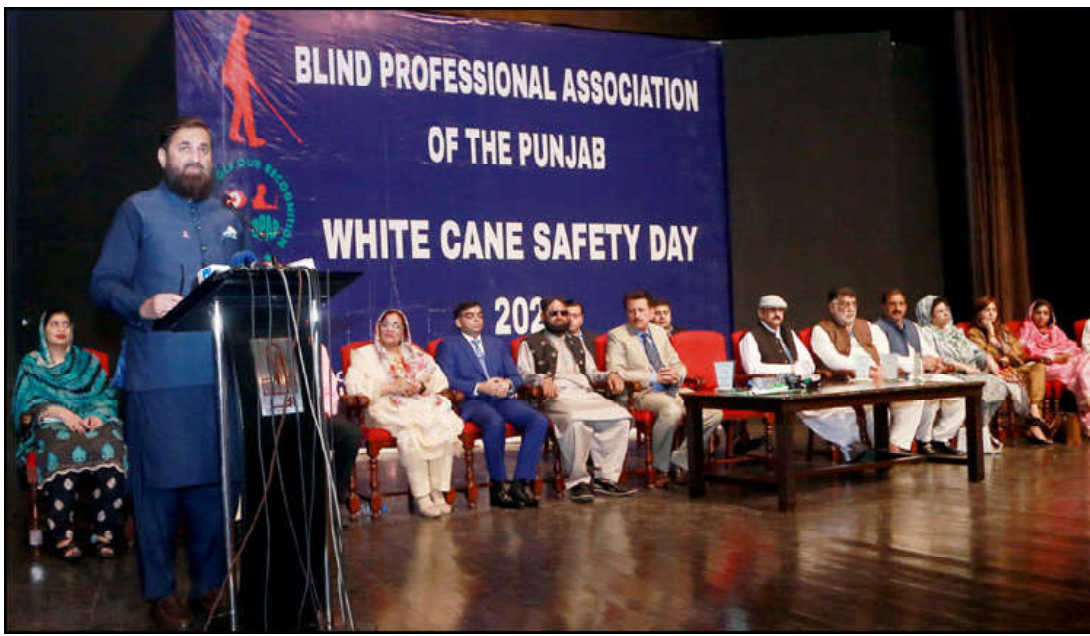
LAHORE: Governor Punjab Muhammad Balighur Rehman addressing a ceremony held in connection with International White Cane Safety Day organized by Blind Professional Association.