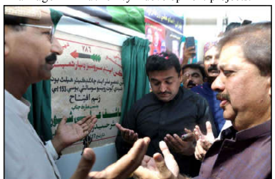
HYDERABAD: Mayor Hyderabad, Kashif Shoro along with others inaugurating the Mother and Child Hospital at Sheedi Goth located on Qasimabad in Hyderabad.

(SIDA), the minister also directed the officials to end the illegal occupation of the irrigation rest houses and to rehabilitate the same to put the building to official use. He advised the officials to prepare a strategy to remove encroachment from the banks of the canals and to overcome the obstacles and delays impeding completion of the development projects.