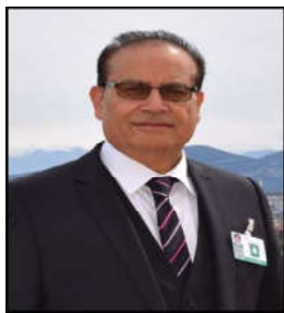
By Qamar Bashir

The only way forward is to let the people choose the leaders they think can best lead them and for non-political forces to stop interfering in this process. Finally, the ECP and the caretaker governments should take stock of their mistakes. They have constitutional duties to fulfil, which they seem to be failing in quite spectacularly.