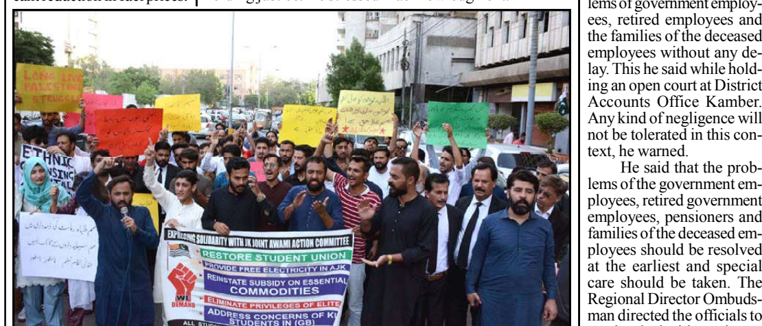
KARACHI: Members of All Students of Jammu Kashmir are holding protest demonstration for demanding to restore student union, held at Karachi press club.