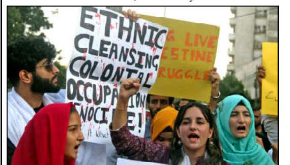
KARACHI: Members of All Students of Jammu and Kashmir (Karachi Division) in the favor of their demands outside press club in Provincial Capital.

ISLAMABAD (APP): The 7th Edition of the Future Investment Initiative (FII), themed "The New Compass," will convene an exceptional gathering of world leaders, industry titans, financiers, innovators, and policymakers in the capital city of Riyadh, Saudi Arabia, from October 24th to 26th, 2023. According to the Saudi Press Agency (SPA), the conference will address pressing global challenges in the realms of Climate, Economy, and Technology, with a focus on fostering global cooperation and harnessing technological advancements for the greater good. The world is at a crossroads, Climate change, economic instability, and technological disruption are reshaping the global landscape. In this time of upheaval, the Future Investment Initiative (FII7) arrives as a beacon of hope, convening global leaders to forge a new compass for humanity.