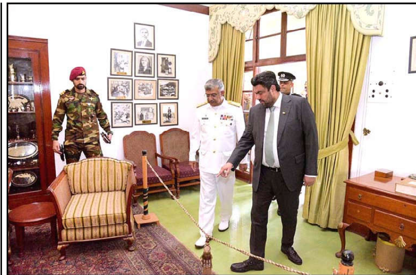
KARACHI: Governor Sindh Kamran Khan Tessori briefing the new Chief of Naval Staff Admiral Naveed Ashraf in the Governor House about historical items used by the Fathers of the Nation.