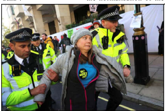
Swedish climate activist Greta Thunberg is escorted during an Oily Money Out and Fossil Free London protest in London, Britain.

Monitoring Desk DUBAI: Iran's Supreme Leader Ayatollah Ali Khamenei has described Israel's assault on Gaza as a genocide of Palestinians and said it must stop immediately, state TV reported on Tuesday. A senior commander of Iran's Revolutionary Guards (IRGC) also warned of further action by Tehran-backed militant groups against Israel if it did not cease its attacks. Israel has bombed the Palestinian territory of Gaza with air strikes since Hamas fighters burst into Israel from the enclave on Oct. 7 and killed 1,300 people, most of them civilians. It has vowed to annihilate the Tehran-backed Hamas, which rules Gaza. But the Israeli retaliatory strikes have killed more than 2,800 Palestinians, a quarter of them children, and driven around half of the 2.3 million Gazans from their homes. Israel has also imposed a total blockade on the enclave, preventing food, fuel and medical supplies from getting in. "No one can confront Muslims and the resistance forces if the Zionist regime's (Israel) crimes against Palestinians continue. The bombardment of Gaza must stop immediately," Khamenei told a group of students in Tehran. "The world is witnessing the Zionist regime's genocide of Palestinians in Gaza," he said to chants of "Death to Israel".