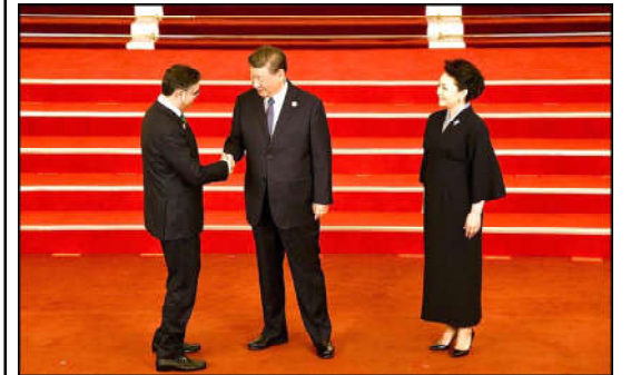
BEIJING: Chinese President Xi Jinping and First Lady, Madame Peng Liyuan welcomed Caretaker Prime Minister Anwaar-ul-Haq Kakar upon his arrival at Great Hall of the People to attend the banquet hosted by President Xi Jinping in honor of the leaders of the countries participating in the 3rd Belt and Road Forum.

They also discussed the prospects of enhancing Eurasian connectivity and Pakistan's pivotal role in regional integration through rail, road and energy corridors.