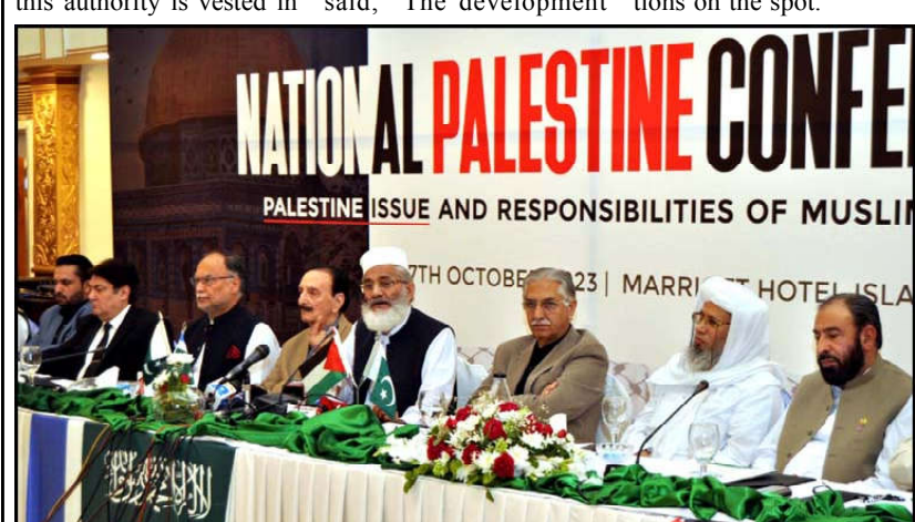
ISLAMABAD: Jamaat-e-Islami (JI) Chief, Siraj-ul-Haq addresses during the National Palestine Conference held in Islamabad.

works of the city are our first priority and we consider it our duty to carry out the development works equally in the city." He said that the construction work of Johar underpass should be completed as soon as possible so that it provides convenience to the people of the area. He said that mega projects are being started in the city and construction work is being accelerated. The Mayor Karachi inspected the ongoing construction work of the underpass and issued instructions on the spot.