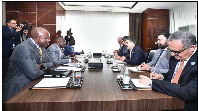
BEIJING: Caretaker Prime Minister Anwaar-ul-Haq Kakar meets President of Kenya Dr. William Ruto on the sidelines of 3rd Belt and Road Forum.

HYDERABAD (APP): Health experts and doctors have underscored the critical importance of public awareness and early diagnosis in the prevention and management of breast cancer among female individuals. They emphasized this while addressing the breast cancer awareness seminar organized by the Institute of Gender Studies (IGS), University of Sindh Jamshoro on Tuesday. The experts said that October was recognized worldwide, including Pakistan, as breast cancer awareness month and revealed that the country diagnosed approximately 90,000 cases of breast cancer in women annually, primarily attributed to a lack of awareness and limited access to diagnostic facilities. They urged the citizens especially women to actively disseminate breast cancer awareness as early detection can save numerous lives. They also emphasized that while Pakistan witnesses around 90,000 new breast cancer cases annually, the disease has a survival rate of over 98 percent when diagnosed in the early stages making late di-