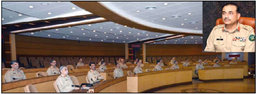
RAWALPINDI: Chief of Army Staff (COAS), General Syed Asim Munir presides over the 260th Corps Commanders Conference held at General Headquarters in Rawalpindi.

He said that full preparation should be made and full coordination and consultation with the concerned department should be ensured. All the details should be prepared in advance and the arguments should be prepared after examining the case from every aspect, he added.