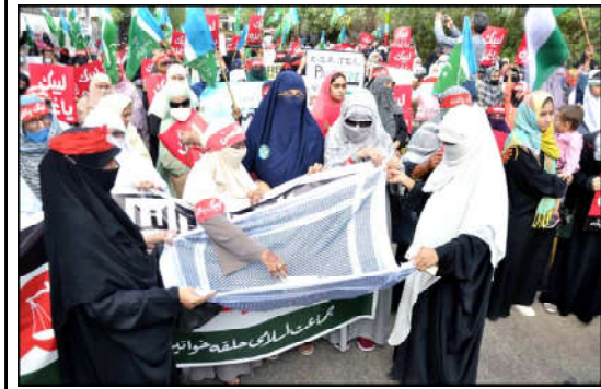
HYDERABAD: Members and supporters of Jamate-Islami (JI Women Wing) are holding protest demonstration against Israeli cruel and inhuman acts and express unity with the innocent people of Palestine, held at Hyderabad press club.

"Dr. Shamshad Akhtar expressed the commitment of the Government of Pakistan to addressing climate-related financing challenges &