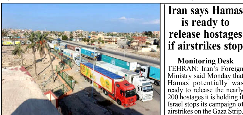
A view of trucks carrying humanitarian aid for Palestinians, as they wait for the re-opening of the Rafah border crossing to enter Gaza, amid the ongoing conflict between Israel and the Palestinian Islamist group Hamas, in the city of Al-Arish, Sinai peninsula, Egypt.