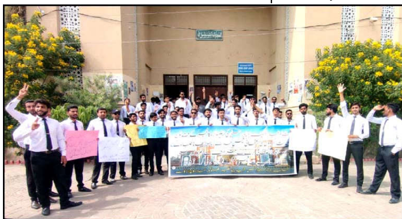
LARKANA: Students of Government Shaheed Benazir Bhutto Law College are holding protest demonstration against the examination fee being increased by administration of Shah Abdul Latif University Khairpur held at Jinnah Bagh in Larkana.