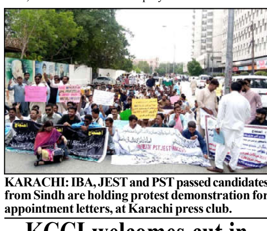
KARACHI: IBA, JEST and PST passed candidates from Sindh are holding protest demonstration for appointment letters, at Karachi press club.

Karachi Metropolitan Corporation, District Municipalities and other institutions were working together to provide quality facilities to the citizens, he said.