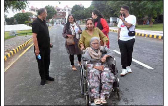
LAHORE: Sikh Yatrees are being welcomed on their arrival at JCP Wagah Border.