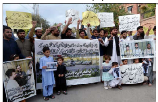
PESHAWAR: Members of Car Showrooms Association Ring Road are holding protest demonstration against high handedness of influential police officials, held at Peshawar press club.

He also pointed out that Pakistan's strength lies in its youthful population, with 65% of its people under the age of 30.