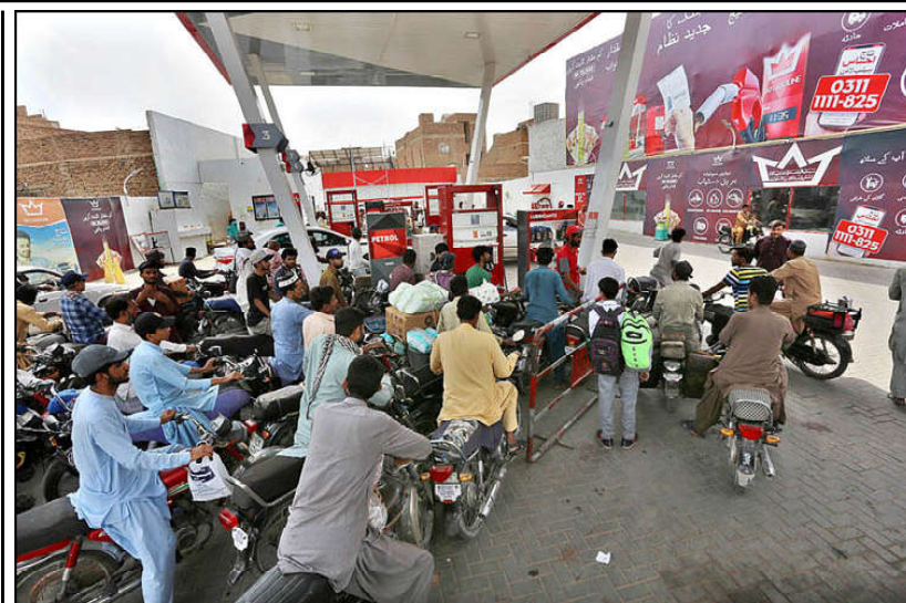
HYDERABAD: A large number of motorcyclists at petrol pump after the government reduce the petrol prices.

They attributed the positive indicators to the government's zero-tolerance policy against the illicit trade and smuggling of essential commodities and the dollar mafia. These measures led to the strengthening of the local currency against the