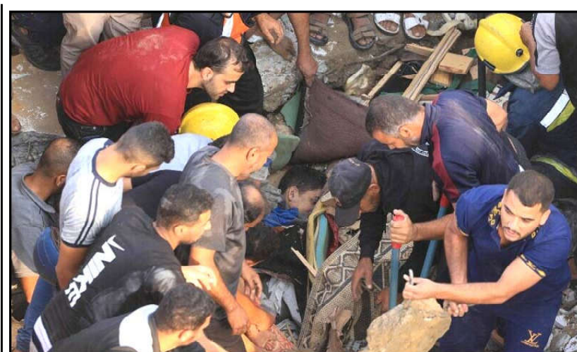
Palestinians recover a body from under the rubble of a building destroyed in an Israeli airstrike in Khan Yunis in the southern of Gaza Strip.