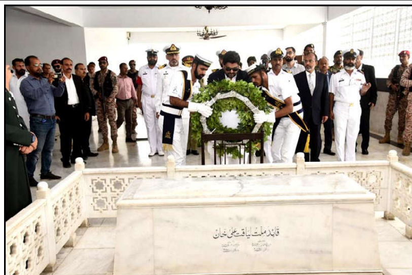
KARACHI: Governor Sindh Kamran Khan Tessori laying floral wreath at grave of Shaheed-e-Millat Khan Liaquat Ali Khan on his 72nd death anniversary.

He said the caretaker dispensation in collaboration with the provincial governments and district administration was striving to ensure that transport fares were reduced after a cut in petroleum products prices. The minister said it was the commitment of the caretaker government to leave the country in a better state than it was handed over.