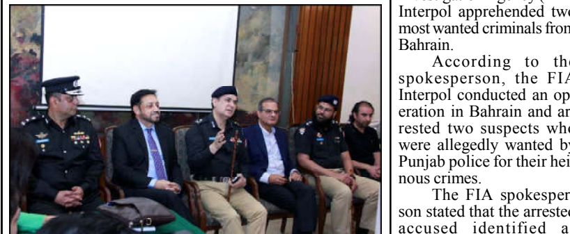
KARACHI: Inspector General Police (IGP) Sindh, Riffat Mukhtar along with others addresses during the Safety and Security Workshop for Journalists Covering the Elections organized by PPI Training Centre, held at local hotel in Karachi.

The leaders will discuss all facets of bilateral relations, with particular focus on strengthening trade and economic cooperation between the two countries. They will exchange views on major regional and global developments. The Prime Minister will also meet with other leaders of countries participating in the BRF.