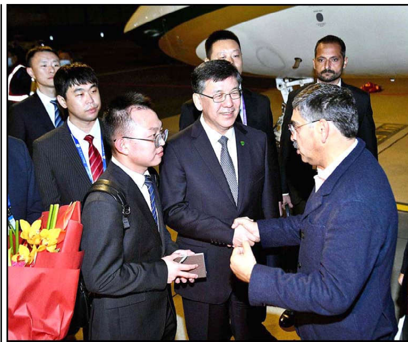
BEIJING: Mr. Wang Zhigang, Minister of Science & Technology of China receiving Caretaker Prime Minister Anwaar-ul-Haq Kakar upon his arrival.