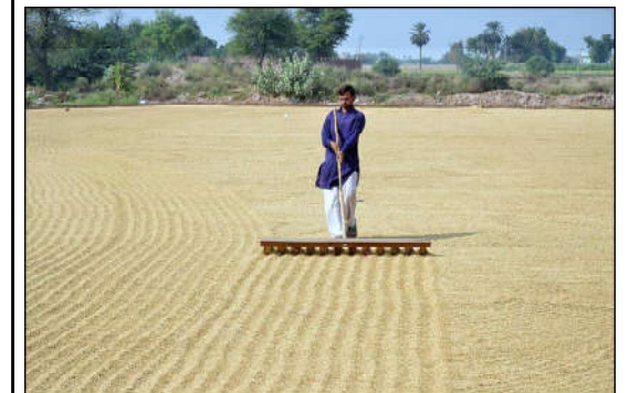
MULTAN: A labourer busy in spreading rice for drying purpose in the field.