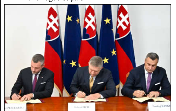
Hlas-Social Democracy party chairman Peter Pellegrini, Smer-Social Democracy party chairman Robert Fico and Slovak National Party chairman Andrej Danko sign a coalition agreement to form a new government in Bratislava, Slovakia.

Monitoring Desk ARRAS: French President Emmanuel Macron held a special security meeting on Monday amid heightened alert against feared terror threats, as a high school where a teacher was fatally stabbed in an attack last week has been evacuated over a bomb threat. Several hundreds of students and teachers went back into the high school in the northern town of Arras after what appeared to be a false alert. All French schools held a moment of silence on Monday afternoon in homage to the teacher who was killed in Friday's attack by a former student suspected of Islamic radicalization. The homage also paid tribute to another teacher, Samuel Paty, killed exactly three years ago near his Paris area school. He was beheaded by a radicalized Chechen later killed by police. Macron cut short travel plans abroad to hold a security meeting at midday with the prime minister and other key government members as well as top military and counterterrorism officials. He initially planned to attend a summit on the Western Balkans in Tirana, Albania. Speaking at the end of the meeting, Interior Minister Gerald Darmanin said that 102 people have been arrested in relation with antisemitic acts.