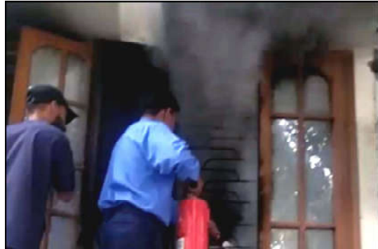
KARACHI: View of site after fire eruption in Jinnah Hospital Administration Block due to unknown reasons after a fire broken out incident as the fire brigade officials are busy in extinguishing fire, in Karachi.

The investigation officer told the court that the case has been filed in prosecutor general office. The challan will be presented in the court after its scrutiny. Time be given. The court while directing investigation officer for submitting challan of the case summoned him on next hearing.