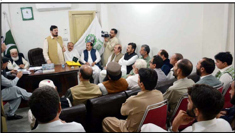
SWAT: Governor Khyber Pakhtoonkhwa Haji Ghulam Ali addressing office bearers of Chamber of Commerce & Industry and trader community during his visit of Swat.