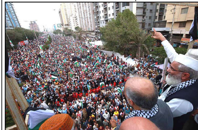
KARACHI: Ameer Jamaat-e-Islami Siraj ul Haq addresses "Al Aqsa Palestine March" organized by JI at Shahrah-e-Faisal.

rael at a massive level; even water, electricity, food supply and medicine have been cut off," the president said in a statement issued by the President House. He said Israel had crossed all limits by killing children, women and innocent people. He regretted that the international community had failed to prevent Israel from the genocide of the Palestinian people. "Pakistan supports the establishment of an independent state for the Palestinian people that is the only solution to bring lasting peace and stability in the region," the president added.