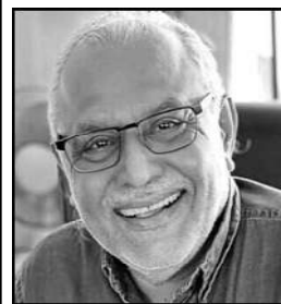
By Abbas Nasir

Since 2008, UN figures show that some 250 Israelis and over 5,500 Palestinians have been killed in the Gaza Strip, which equals a ratio of one Israeli to 22 Palestinians killed during the occupation. (It is safe to assume that most of the deaths occurred during military operations.)