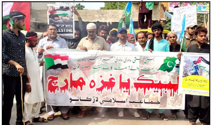
LARKANA: Activists of Jamaat-e-Islami (JI) are holding protest demonstration against Israeli cruel and inhumane acts and express unity with the innocent people of Palestine, at Jinnah Bagh in Larkana.

GENEVA (INP): United Nations High Commissioner for Refugees (UNHCR) has said on Sunday that Pakistan has been hosting Afghan refugees for the last over 40 years without receiving any funds in return. On the other hand, the European Union Agency of Asylum and the International Federation of Journalists (IFJ) have termed the presence of millions of illegal immigrants on Pakistani soil a threat to the country. The report says that 1.7 million Afghans are living in the country illegally without any proof and registration. The decision was taken in view of their participation in incidents of violence of May 9 as well as involvement in incidents of terrorism.