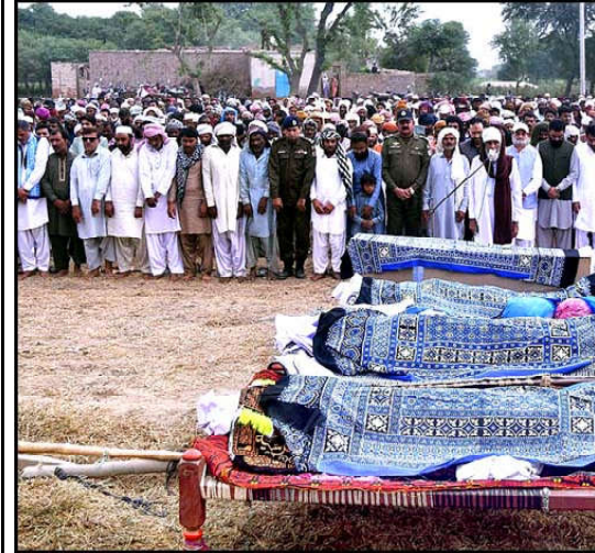
MULTAN: A large number of people are attending the funeral prayer of laborers at Shujaabad who killed in firing incident in Turbat.

suppress their righteous demand of right to self-determination. He said several youth have been killed and thousands arrested during this year but the world community has become a mute spectator. He urged the United Nations to play a role in settling the Kashmir dispute in accordance with the UN resolutions and aspirations of the Kashmiri people. The spokesman expressed concern over the silence adopted by the international community on the ongoing worst Indian state terrorism and gross human rights violations in occupied Jammu and Kashmir.