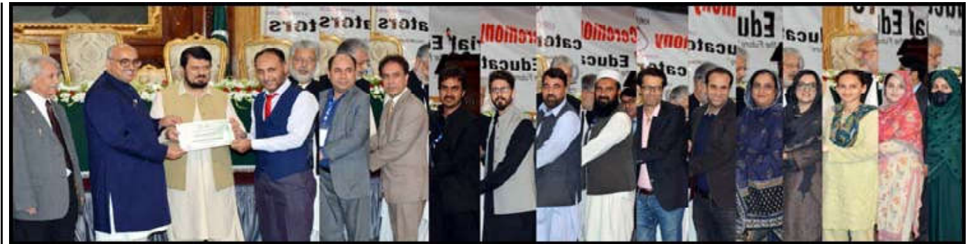
PESHAWAR: Governor Khyber Pakhtoonkhwa Haji Ghulam Ali distributing appreciation certificates among participants of a ceremony organized by All Private Sector Universities Pakistan (ASUP) at Governor House.

the Italian cooperation for imparting training to police liaison officers" he said. He maintained that a proactive role by the Trade Commission was significant for enhancing trade along with providing ease in acquiring work visas. "We are launching a one-window operation for the promotion of investment in Punjab," he said, adding that Italian investors should visit Punjab and the government would provide them all possible facilitation.