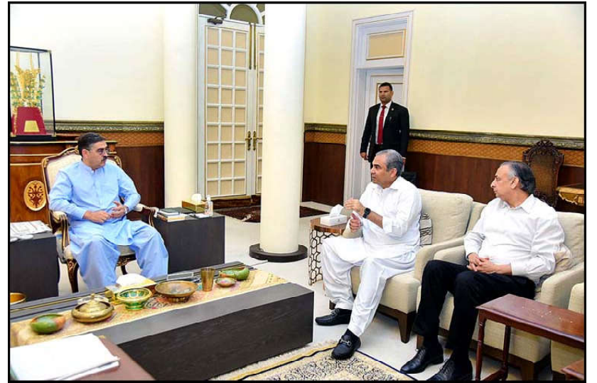
ISLAMABAD: The Caretaker Chief Minister of the Punjab Mohsin Naqvi calls on the Caretaker Prime Minister Anwaar-ul-Haq Kakar.

were in touch with the international community and the Muslim countries, but unfortunately, there was a complete siege of Gaza. He said this aspect would be highlighted during the upcoming OIC executive committee meeting in which they would consider the coordinated response of the OIC member countries as to how to bring an end to the violence perpetrated by Israel and how to provide immediate humanitarian assistance to Palestinians.