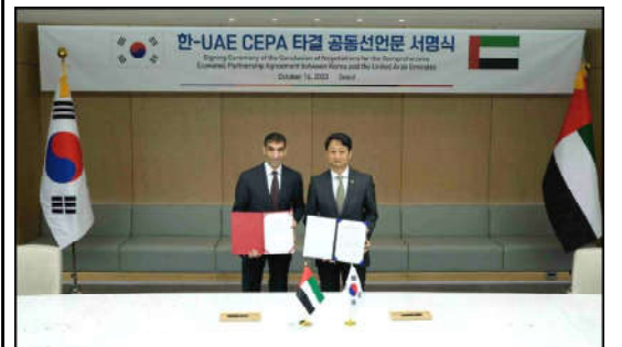
United Arab Emirates' Minister of Foreign Trade Thani Al Zeyoudi and South Korea's Trade Minister Dukgeun Ahn meet in Seoul, South Korea.