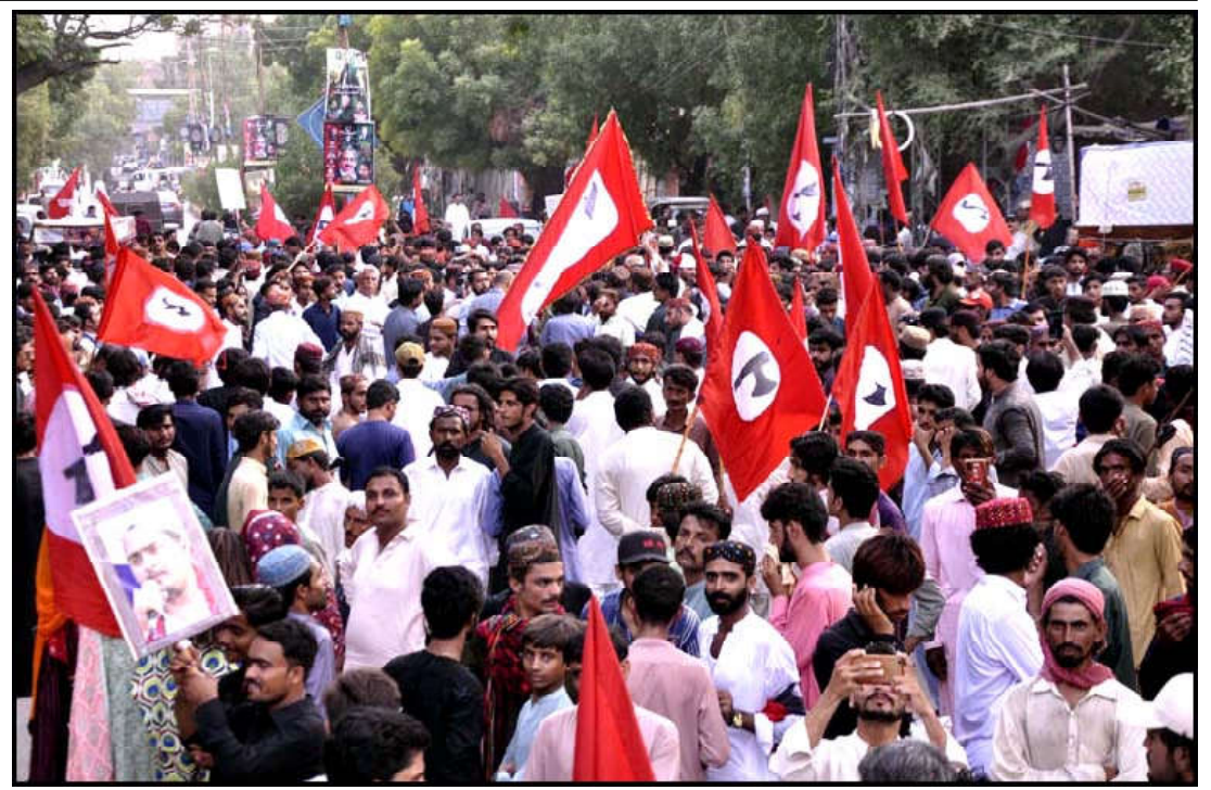
HYDERABAD: Activists of Jeay Sindh Quami Mahaz (JSQM) are holding protest rally against Afghan refugees, in Hyderabad.

vide CPEC in partnership with Pakistan, adding "We are ready to work with our Pakistani colleagues from all walks of life to further promote the projects in the next ten years of CPEC." "What was agreed between President Xi Jinping and the Pakistani leaders for a high-quality sustainable and enhanced cooperation and support in the fields of security and development, we can implement with mutual consensus", he said. The ambassador was of the view that Pakistan and China could jointly make the CPEC, a corridor of love and peace.