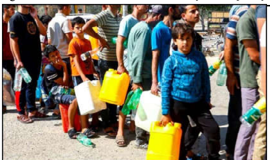
Palestinians queue as they wait to fill cans with fuel, amid shortages of fuel, as the Israeli-Palestinian conflict continues, at a petrol station in Khan Younis in the southern Gaza Strip.