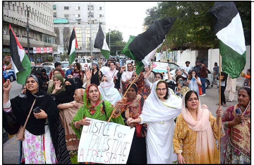
KARACHI: Activists of civil society organize a protest demonstration to show solidarity with the people of Palestine, call for an immediate ceasefire at Karachi Press Club.