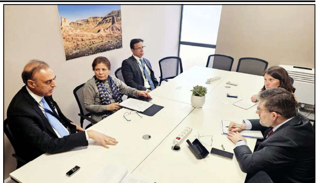
Marrakech: Federal Minister for Finance, Revenue, and Economic Affairs, Dr. Shamshad Akhtar held a meeting with a high-level delegation of Moody's, the global financial services company, during her visit to Morocco for the annual meeting of WB/IMF. During the meeting, Dr. Shamshad Akhtar reiterated the government's commitment to transparency in order to foster investor confidence and maintaining a positive credit rating of Pakistan in the global financial markets.