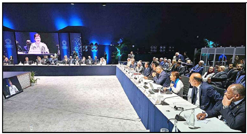
MARRAKECH: Dr. Shamshad Akhtar, Caretaker Federal Minister for Finance, Revenue, and Economic Affairs, participated in a high-profile meeting of Finance Ministers with the Managing Director of the International Monetary Fund (IMF) in Marrakesh.

massive reduction in the prices of petroleum products, the rates of kerosene oil will drop to Rs214.85 per litre. The interim government, led by Prime Minister Anwar-ul-Haq Kakar, is charging zero general sales tax (GST) on all petroleum products while the rate of petroleum levy (PL) on petrol is Rs60 per litre. In order to generate additional revenue to achieve the tax collection target for this fiscal year, the authorities, however, increased the levy on diesel by Rs5 to Rs55 per litre.