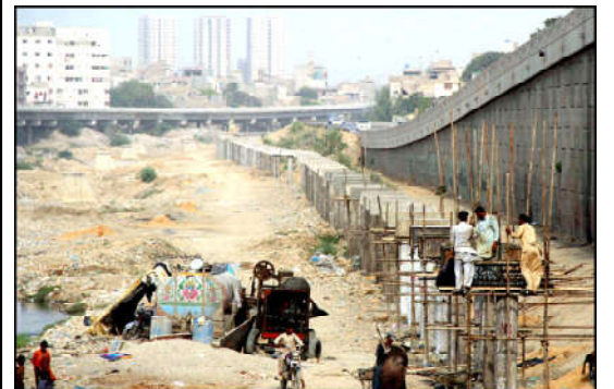
KARACHI: Labourers are busy in construction work of Teen Hatti bridge in Provincial Capital.

mation, and its implementation, paralleling these phases to Allama Iqbal's poetry and the interpretation of Quranic verses. He noted that the Holy Quran holds the solution to all of humanity's issues. The minister also pointed out that Muslims should not only be social workers but also leaders. He highlighted the significance of a united Islamic community and noted that Muslims constitute 25 per cent of humanity, making their global impact undeniable. He said, "If we follow the right path, problems like Gaza, Burma, Kashmir would not arise." He urged scholars and leaders to guide the nation and instill hope rather than despair, emphasizing that "despair is a trait of Satan."