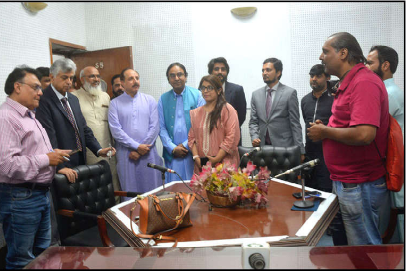
LAHORE: Caretaker Federal Minister for Information and Broadcasting, Murtaza Solangi visit Radio Pakistan.