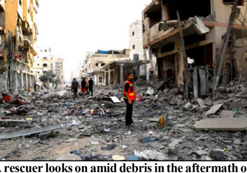
Israeli strikes, in Gaza City.

'And most importantly, the civilian casualties will be absolutely unacceptable. Now the main thing is to stop the bloodshed," he said.