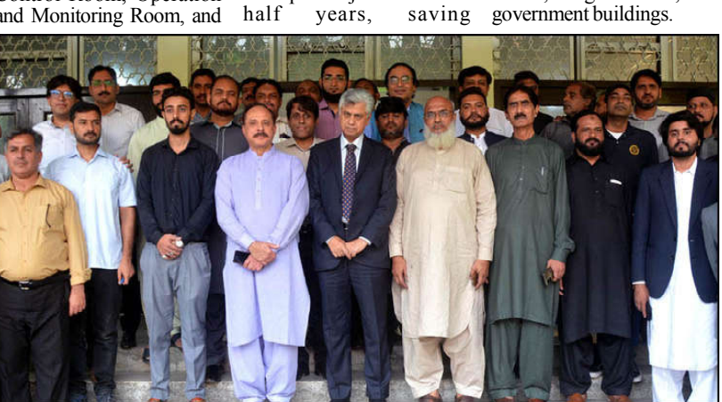
LAHORE: Agroup photo of Caretaker Federal Minister for Information and Broadcasting Murtaza Solangi with Radio Pakistan Staff.

As part of the Nankana Sahib Safe City project, a total of 30 kilometers of optical fiber has been laid throughout the city. This project has been seamlessly integrated with the Lahore Safe City network. Notably, cameras have beer strategically installed to enhance security at Sikh places of worship, Ashura routes, religious sites, and government buildings.