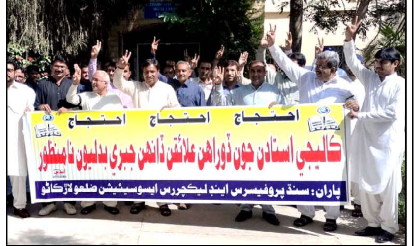
LARKANA: Members of Sindh Professors and Lectures Association are holding protest demonstration against the forcibly transferred of teachers, at Jinnah Bagh in Larkana.

According to the CCTV footage of the incident, which showed that two unknown suspects dressed in Shalwar Kameez on a twowheeler 70cc motorcycle passing through the street, the person sitting behind the rider was wearing a helmet.