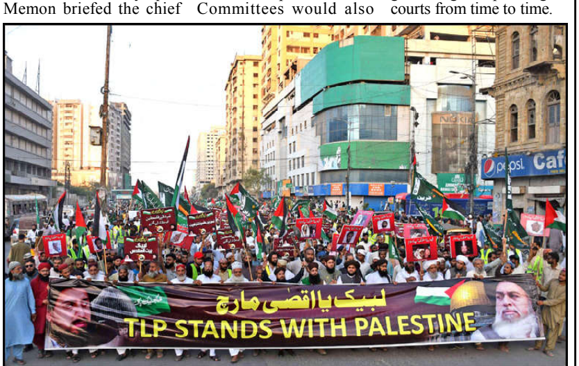
KARACHI: Supporters of Tehreek-e-Labbaik Pakistan are shouting slogans during protest rally to show solidarity with the Oppressed Muslims of the Philistine, in City.

Maryam Nawaz held a meeting with the members of the union council of NA-134. On this occasion, matters in line with the preparations for welcoming Nawaz Sharif to the country were reviewed.