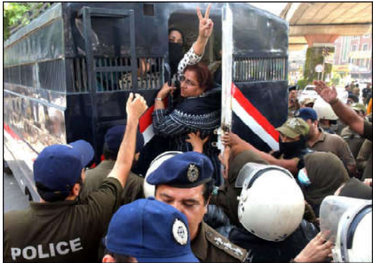
LAHORE: Police officials restore baton charge and arrest protesters during protest demonstration of Punjab Teachers Union against the ongoing privatization of government schools, amendments to pension regulations and the issue of leave encashment, outside Civil Secretariat in Lahore.

said and maintained that the government was bound to give two uniforms to the policemen every year. From now on, every jawan and senior police officer would be given two uniforms besides the provision of additional funds, he said. Punjab Highway Patrol police had been given the responsibility of checking the axle load. If the police performed this responsibility in a befitting manner, it would take a lead to Punjab police and traffic police, he remarked.