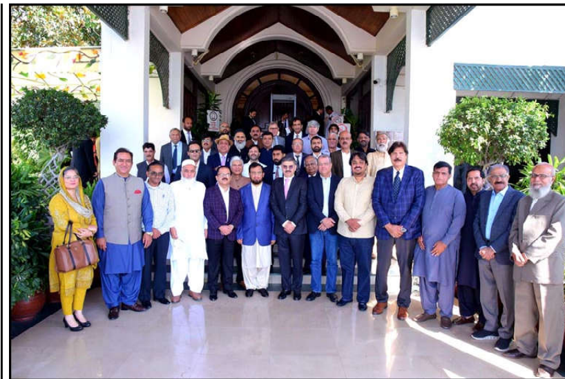
ISLAMABAD: Caretaker Prime Minister Anwaar-ul-Haq Kakar in a group photo with CPNE delegation.

dren were currently out of school. He said to accommodate all the children at once, the government would need 55,000 more schools that would be unaffordable for it. Comparing the regional statistics, the president highlighted that in India, Bangladesh and Sri Lanka, around 98% of the children were enrolled in schools. He feared that this huge number of out of school children could become burden for the country in future. He said the Brick and Mortar structure could be followed to educate maximum number of children. He said the mosques could be utilized for providing education besides use of latest technology to educate the children while sitting at home. President Alvi asked the universities to start 2-year associate degree