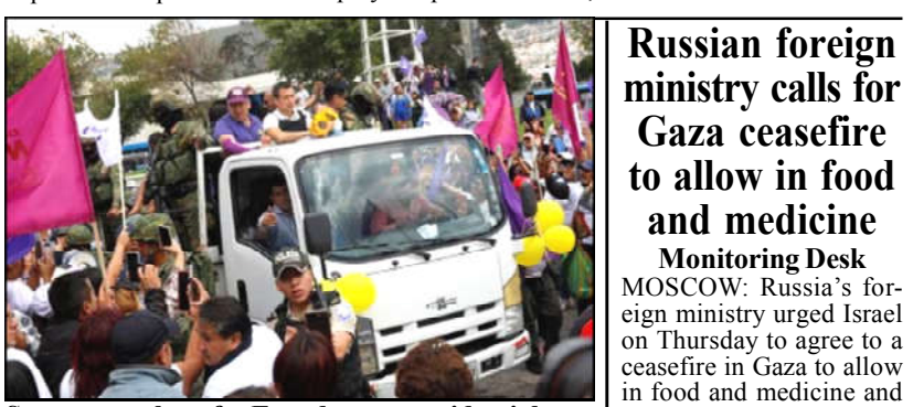
Supporters cheer for Ecuadorean presidential candidate Daniel Noboa during his closing campaign, in Quito, Ecuador.

Monitoring Desk BISHKEK: Kyrgyz-zstan's parliament on Wednesday ratified an agreement for a common air defence system with Russia, a day before a planned visit by Russian President Vladimir Putin to the Central Asian country. The agreement provides that a land plot of 12 acres at the Kant Russian military base in Kyrgyzstan will be used for the joint programme. "Lawmakers examined and adopted the bill on the ratification of the agreement between the Kyrgyz Re-public and the Russian Federation for the creation of a Joint Regional Air Defence System," the Kyrgyz parliament said. Putin had been scheduled to travel to Kant, but the Kyrgyz presidency said on Wednesday the visit had been cancelled, without providing more details. The Russian leader is still due to speak with his Kyrgyz counterpart Sadyr Japarov on Thursday, and attend a summit gathering leaders of post-Soviet countries the following day.