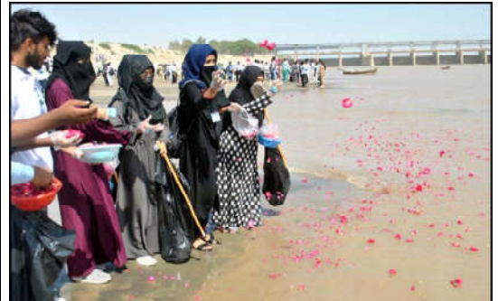
HYDERABAD: Participants are showering rose petals in Indus River on the eve of World Food Day organized by Food and Agriculture Organization of the United Nations held in Hyderabad.