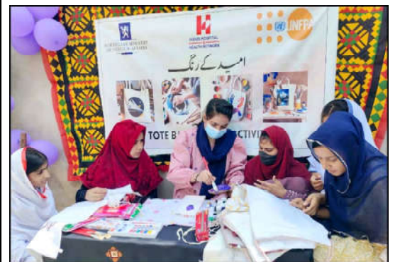
LARKANA: Girls students are participating in the paintings competition during the ceremony in connection of the International Day of the Girl Child organized by Indus Hospital, Health Network and UNFPA, held in Larkana.