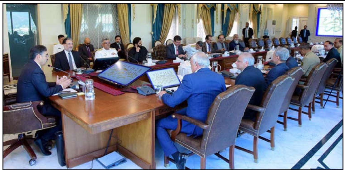
Caretaker Prime Minister Anwaar-ul-Haq Kakar chairs a meeting of the policy board on development of shipbuilding in Pakistan, in Islamabad.

During a visit to the Directorate of Poultry Research Institute Rawalpindi, the Minister informed that Pakistan ranks 11 th among all countries in terms of poultry industry.