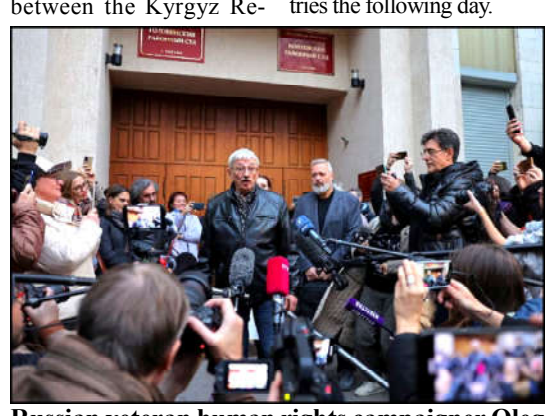
Russian veteran human rights campaigner Oleg Orlov talks to the media after a court hearing in which he was found guilty of discrediting Russia's armed forces, in Moscow, Russia.