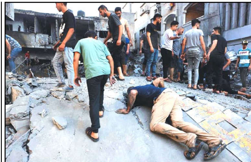
GAZA CITY: Palestinians look for survivors under the rubble of a building following an Israeli air strike as bombing of the besieged enclave continued for the fifth consecutive day.