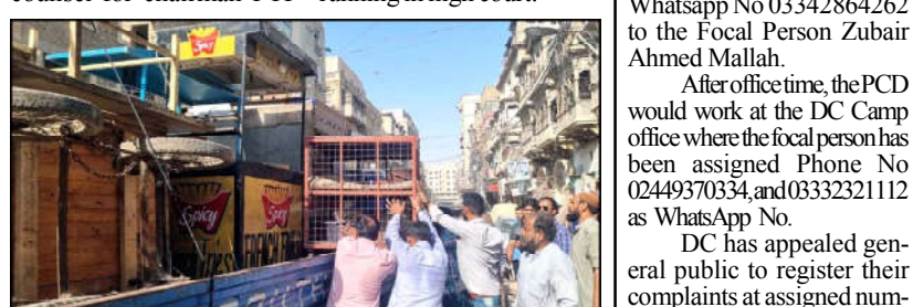
KARACHI: Anti encroachment operation in progress removed illegal encroachment during anti encroachment drive under the supervision of District Municipal Corporation (DMC South), located on Arambagh Furniture Market at Pakistan Chowk in Karachi.

ISLAMABAD (Online): Islamabad High Court (IHC) has clubbed the petitions seeking stopping trial of cipher case against Imran Khan and dismissal of case against him. Chairman PTI petition against the trial court decision regarding his indictment and his plea for stopping of his trial in cipher case came up for hearing in single bench of IHC led by Chief Justice (CJ) IHC Aamir Farooq Thursday. Sardar Latif Khosa counsel for chairman PTI appeared in the court, The CJ IHC remarked he will issue the order to club these petitions with the petitions seeking orders for dismissal of case. Latif Khosa said the petition relates to stoppage of trial of cipher case in the court and against the decision of indictment. The matter is running in high court and the decision is reserved. Lahore High Court (LHC) too has issued stay order in one case of FIA. We have repeatedly said no haste be shown and the matter is running in high court.