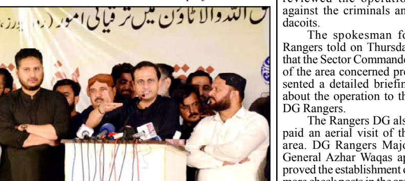
KARACHI: Mayor Karachi, Barrister Murtaza Wahab addresses to media persons during press conference after inaugurated new development projects, held at Korangi Allahwala Town area in Karachi.