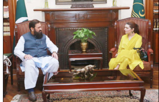
LAHORE: Special Assistant to Prime Minister for Human Rights Mushaal Hussein Malik meeting with Governor Punjab Muhammad Balighur Rehman.

LAHORE (APP): Special Assistant to the Prime Minister (SAPM) on Human Rights and Women Empowerment, Mushaal Hussein Mullick has said that the provision of best facilities to inmates is the top priority of the government as they have equal rights like other citizens of the country. Talking to media prior to visiting the Kot Kahpat Jail here on Tuesday, she said that jail and prisoners were near to her heart as her husband, Yasin Malik, is also in the death cell of the notorious Tihar jail in false, fabricated and politically motivated cases. Mullick said that maximum facilities would be provided to prisoners through her mandate of human rights and women empowerment, adding that prisoners' rights according to the Geneva Convention should be protected. She said that a 100-day plan would be launched next week with special focus on protection of prisoners' rights and for their rehabilitation. She said that a rehabilitation proposal is being prepared with the coordination of Legal Aid and Justice Authority (LAJA) for juveniles and women in jails. Under the proposal legal aid would be provided to prisoners while their facilities and rights would be monitored, she informed.