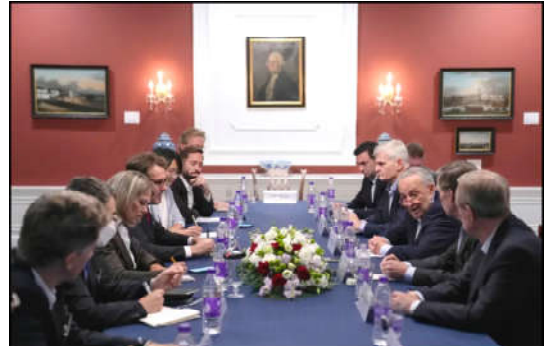
U.S. Senate Majority Leader Chuck Schumer, D-N.Y., speaks during a press roundtable with Schumer and his delegation at the residence of U.S. Ambassador to China, in Beijing.