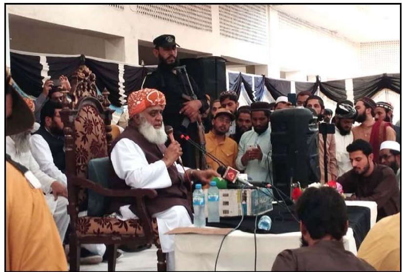
MULTAN: Jamiat Ulema-e-Islam (JUI-F) Chief, Maulana Fazal-ur-Rehman addresses to his party workers in Multan.