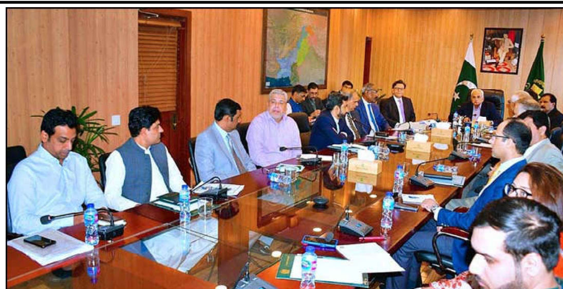
ISLAMABAD: Caretaker Federal Minister for Railways, Communications & Maritime Affairs, Shahid Ashraf Tarar chairing a meeting at Ministry of Railways.

He said Pakistan's coal reserves worth $6.3 billion could be utilized but it would incur environmental impacts, whereas the country should create its strategic position like the Middle East managing.