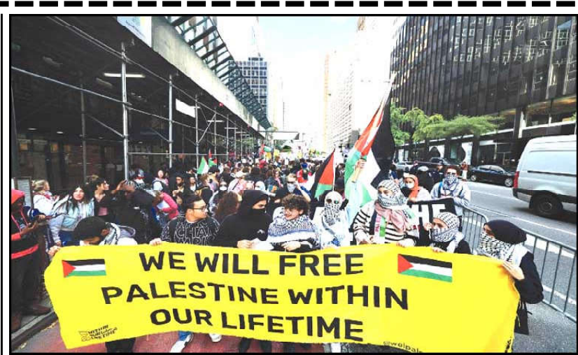
NEW YORK: Demonstrators gather in support of the Palestinian people during a rally for Gaza outside the Consulate of Israel.