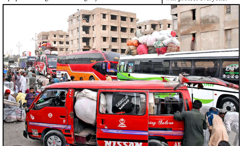
KARACHI: Afghan refugees wait to board into a bus to depart for their homeland, Pakistan's government announced a major crackdown migrants in the country illegally, saying it would expel them starting next month and raising alarm among foreigners without documentation who include an estimated 1.7 million Afghans.

ISLAMABAD (APP): Caretaker Federal Minister for Health Dr. Nadeem Jan on Tuesday said that the government of Pakistan is successfully implementing its reform agenda to strengthen the health system of the country. He was addressing the 70th WHO Regional Committee meeting in Cairo- a 22-nation highest regional forum on health. Dr. Nadeem Jan said that 'Health for All by All' is everyone's business as this includes governments, civil society, development partners, private sector, academia, local communities and health practitioners. "We must all work hand-in-hand with a belief that strong health systems will protect everyone."