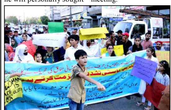
KARACHI: Members of United Jammu Kashmir Action Committee are holding protest demonstration for acceptance of their demands, held at Karachi press club.