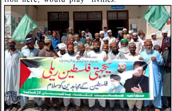
LARKANA: Activists of Jamiat Ulema-e-Pakistan (JUP) are holding protest demonstration against Israel and expressing their solidarity with people of Palestine, at Jinnah Bagh in Larkana.