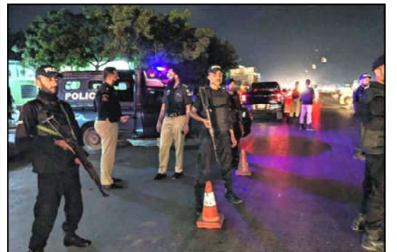
KARACHI: Police official stands alert to avoid untoward incident as security has been tightened in city due to security reasons against street criminals, at Keamari area in Karachi.

ISLAMABAD (INP): Pakistan Muslim League-N (PML-N) leader Shahid Khaqan Abbasi said that the party is misleading Nawaz Sharif and that a convicted absconder cannot get bail. He also said that he is not convinced of the convoy of buses to welcome Sharif. Abbasi made these remarks in an interview with a private TV channel. He said that he has spoken to some legal experts who say that if a person is declared a fugitive by the High Court, he cannot get bail and will have to surrender in front of it. The only legal way, he said, is for Sharif to return to Pakistan and leave himself at the mercy of the court. If he does not get relief from the court, he can file an appeal in the Supreme Court. The former prime minister said that if Nawaz Sharif does not follow the law, then who will follow the law in the country? He further said that all the country's political parties have seen power and that they should not have formed the government after the lack of confidence. He said that he could not join the PML-N and participate in the election under these conditions. Abbasi also said that his leader is Nawaz Sharif, not Shehbaz Sharif and Maryam Nawaz. He said there is a place for a political party, but that is a later matter.