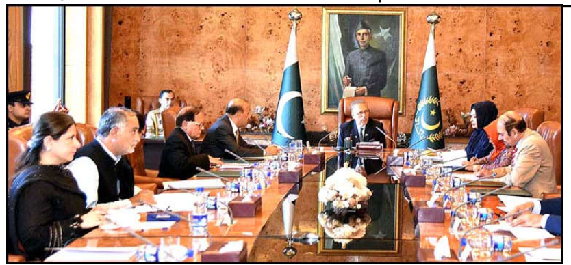
ISLAMABAD: President Dr. Arif Alvi chairing a meeting regarding the implementation of Zainab Alert Response & Recovery Act (ZARRA)2020, at Aiwan-e-Sadr.

They underscored the essential role of ongoing dialogue in fostering a mutually beneficial relationship.