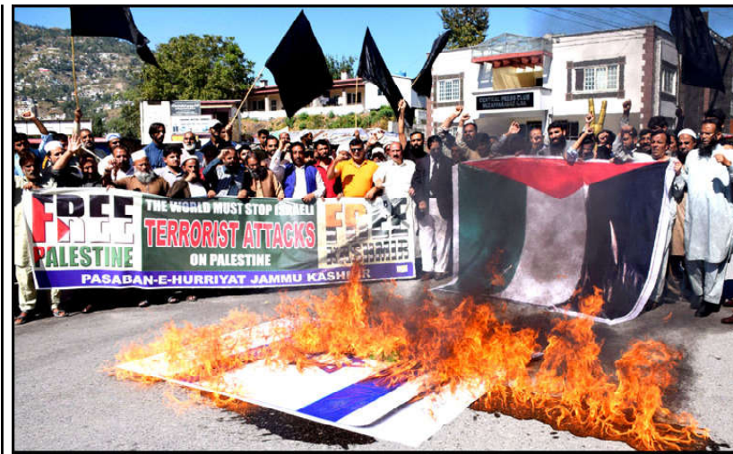
MUZZAFERABAD: Activists of Pasban-e-Hurriyat holds protest and burns Israeli flag at Azadi Chowk to show solidarity with Palestinian People.