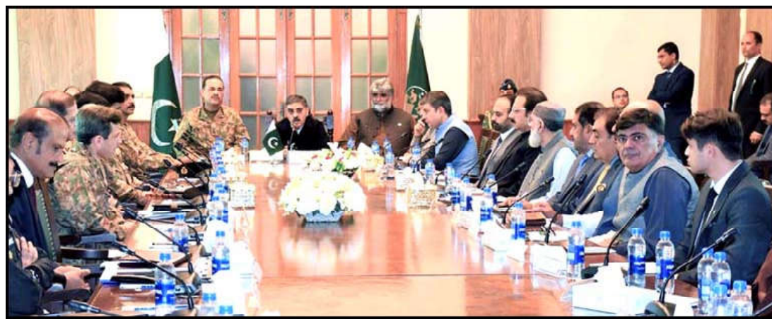
QUETTA: The Caretaker Prime Minister Anwaar-ul-Haq Kakar chairs a meeting of the Provincial Apex Committee.

Bilawal said that Shaheed Mohtarma Benazir Bhutto, despite her two shortest tenures in government, took revolutionary steps for the progress and empowerment of Pakistani women and girls, including legislation to protect women's rights. Be it the former federal government under the leadership of President Asif Ali Zardari or the provincial government in Sindh, the PPP governments have always prioritized the progress and empowerment of women of all ages, including young girls. Initiatives such as Wasela-e-Taleem Program under the umbrella of Benazir Income Support Program (BISP) and scholarships for poor female students in Sindh.