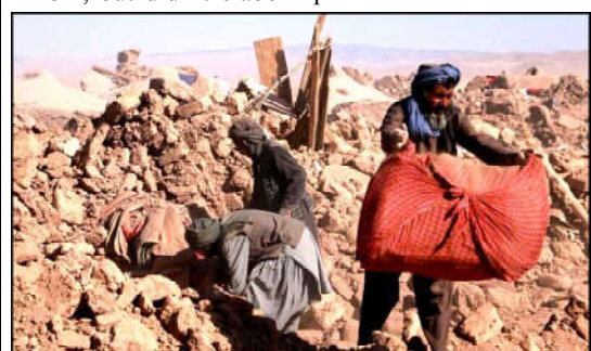
Afghan residents clear debris of damaged houses after earthquake in Nayeb Rafi village, Zendej Han district of Herat province.

Monitoring Desk PRISTINA: A NATO top commander said Tuesday the alliance equipped its peacekeeping force in Kosovo with weapons of "combat power" following a recent shootout between masked Serb gunmen and Kosovo police that left four people dead and sent tensions soaring in the region. Adm. Stuart B. Munsch of the Allied Joint Force Command Naples, Italy said that a battalion of some 200 troops from the United Kingdom and 100 others from Romania "is bringing heavier armament in order to have combat power to" the NATO-led Kosovo Force, or KFOR, but didn't elaborate further. The KFOR peacekeepers — made up of around 4,500 troops from 27 nations — have been in Kosovo since June 1999, basically with light armament and vehicles. The 1998-1999 war between Serbia and Kosovo ended after a 78-day NATO bombing campaign forced Serbian forces to withdraw from Kosovo. More than 10,000 people died, mostly Kosovo Albanians. On Sept. 24, around 30 Serb gunmen killed a Kosovar police officer and then set up barricades in northern Kosovo before launching an hours-long gun battle with Kosovo police.