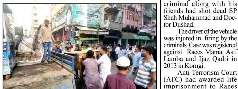
KARACHI: Anti encroachment operation in progress removed illegal encroachment during anti encroachment drive under the supervision of District Municipal Corporation (DMC South), located on Cycle Market Light House in Karachi.