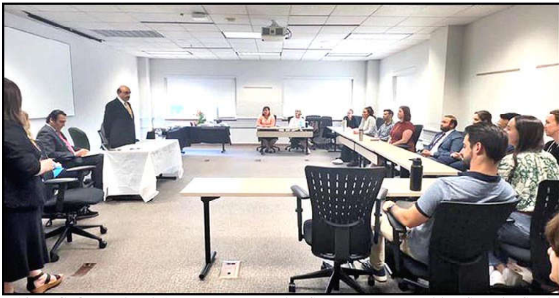
WASHINGTON: Pakistan's Ambassador to the United States Masood Khan visits US Foreign Service Institute, interacts with designated US diplomats for Pakistan. Underscores the need for promoting diplomats' exchanges, fostering strong economic partnership.