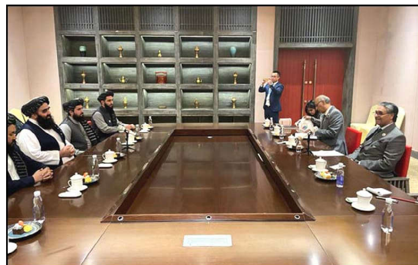
Caretaker Foreign Minister Jilani meets Afghan Acting FM Amir Khan Muttaqi in Tibet, China.

The court adjourned the hearing of the case for two weeks.