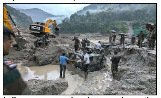
Indian army personnel conduct a search operation for the missing soldiers in north Sikkim.

chant, "Build That Wall." One of Biden's first actions after taking office in January 2021 was to issue a proclamation pledging "no more American taxpayer dollars be diverted to construct a border wall" as well as a review of all resources that had already been committed. Trump was quick to claim victory and demand an apology. "As I have stated often, over thousands of years, there are only two things that have consistently worked, wheels, and walls!" Trump wrote on social media.