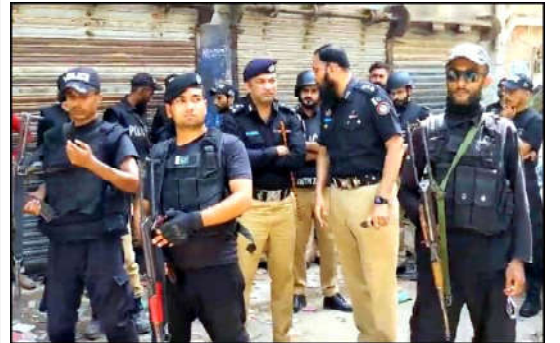
KARACHI: Police officials carry out the grand combing search operation against criminals as security has been tightened in city due to security reasons at different areas of Old Golimar area in Karachi.

the Punjab government is doing an appreciable work in order to safeguard and protect the religious and cultural heritage. CM Mohsin Naqvi while talking with the American Consul General underscored that all citizens including the minorities enjoy equal rights in Pakistan according to the constitution. "We have chalked out a comprehensive plan for the restoration of religious and historical buildings." CM Mohsin Naqvi outlined that the Punjab government is vigorously pursuing its uniform agenda of progress by making the welfare and prosperity of the people as its focal point.