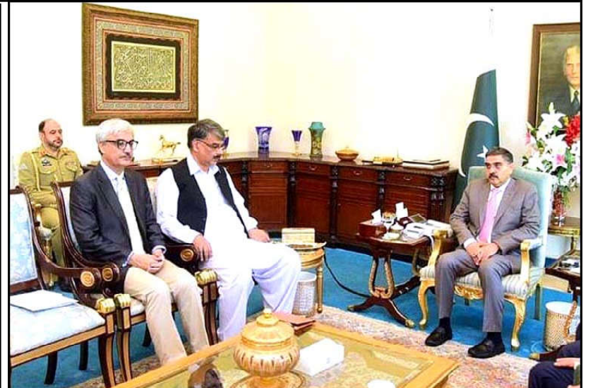
ISLAMABAD: Prime Minister AJK Chauhdary Awar ul Haq calls on Caretaker Prime Minister Anwaar-ul-Haq Kakar.

"We are a strong country and incidents of terrorism cannot weaken us as a nation," reiterated Murtaza Solangi. In the meeting, the need to expand cooperation in the fields of media, drama and films was also emphasized. "Film and drama can play a key role in improving the global image of any country," Murtaza Solangi said adding Turkish plays were very popular in Pakistan. Expressing the desire to co-produce movies with Turkiye, Murtaza Solangi said that Turkish filmmakers could benefit from tax amnesty given the film industry in Pakistan. "Northern parts of Pakistan are rich in natural beauty and Turkish filmmakers can utilize these beautiful tourist areas," Murtaza Solangi remarked.