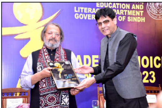
KARACHI: Caretaker Federal Minister Education Madad Ali Sindhji is being presented with memento during the "Academia Choice Award 2023" organized by all Sindh private School & College Association.

ISLAMABAD (APP): Minister for Religious Affairs and Interfaith Harmony, Aneeq Ahmed on Thursday the era of Prophethood had concluded, yet the everlasting legacy of the Prophet Muhammad Peace Be Upon Him persevered. Addressing the third annual 'Seerat-un-Nabi Conference' organized under Auqaf Islamabad here at Faisal Mosque as special guest, he opined that a single life was not enough to gain a profound comprehension of the Prophet (Peace Be Upon Him)'s exalted and virtuous character. Minister Aneeq further emphasized that the Holy Quran instructed us to follow the path shown by the Prophet Muhammad (Peace Be Upon Him) raising question whether we had learned from his life and incorporated it into our own lives. He highlighted the success in following the Prophet (Peace Be Upon Him)'s teachings, stating, "True believers are those whose character and conduct reflect the qualities of Prophet Muhammad (Peace Be Upon Him)." He said, "If our way does not align with the noble path of the Prophet Muhammad (Peace Be Upon Him), it is a complete failure." Speaking about the value of knowledge, Minister Aneeq said, "Knowledge is the essence of fear of God, and those with knowledge hold a profound reverence for Allah," adding that a true believer was one whose ethics and actions reminded others of Prophet Muhammad Peace Be Upon Him.