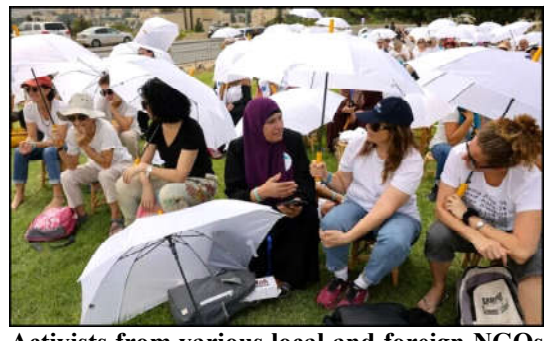
Activists from various local and foreign NGOs gathered around the Tolerance Monument in a park in Jerusalem.