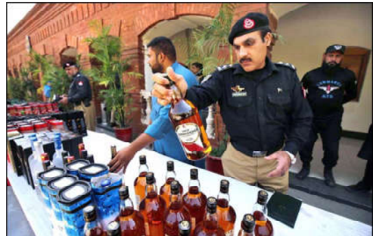
PESHAWAR: Police display a huge quantity of smuggled liquor, recovered during an operation.