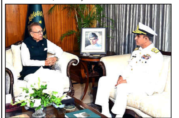
ISLAMABAD: Chief of Naval Staff, Admiral Muhammad Amjad Khan Niazi paid a farewell call on President Dr. Arif Alvi at Aiwan-e-Sadr.

Teachers' Day is celebrated all over the world on October 5, the CM said and added that on this occasion, the teachers were awarded the Academia Choice Award.