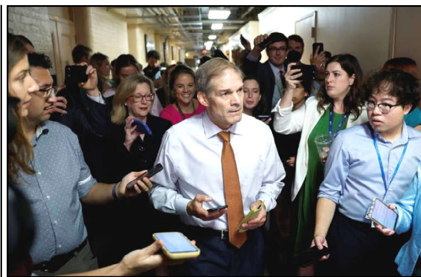
House Judiciary Committee Chairman Rep. Jim Jordan (R-OH), a prime contender in the race to be the next Speaker of the U.S. House of Representatives, arrives for a meeting with the Texas Republican House delegation, at the U.S. Capitol in Washington, D.C.

for six decades. The West casts the war as Moscow's biggest strategic blunder since the 1979 Soviet invasion of Afghanistan and Western leaders say they want to defeat Russia on the battlefields of Ukraine. A Ukrainian counteroffensive has so far failed to yield major territorial success. Putin, though, presents the war as part of a much bigger struggle with the United States which the Kremlin elite says aims to cleave Russia apart, grab its vast natural resources and then turn to settling scores with China.