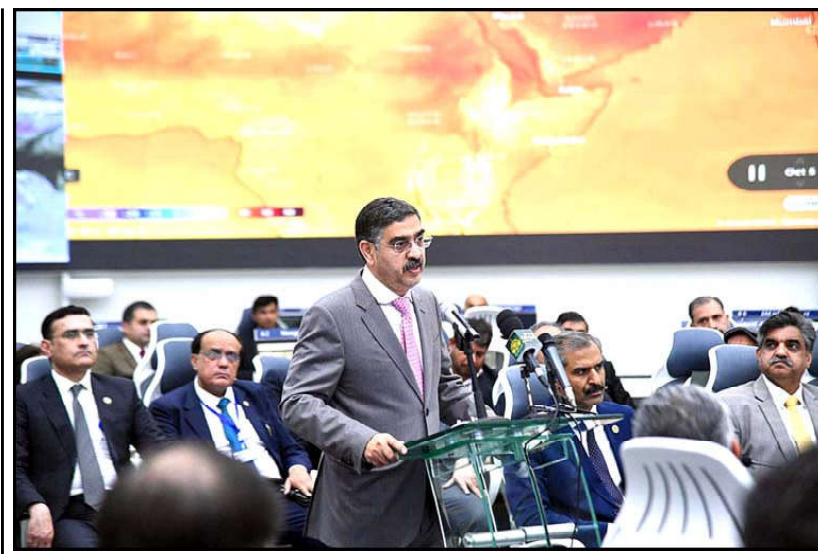
ISLAMABAD: Caretaker Prime Minister Anwaar-ul-Haq Kakar addressing at the inaugural ceremony of National Emergencies operation Center established by NDMA.

APP adds: Pakistan on Thursday said its recent decision to deport illegal residents was not targeted at Afghan refugees but was against all foreigners without having valid visa documents. Foreign Office spokesperson Mumtaz Zahra Baloch at a weekly press briefing said the national policy towards the Afghan refugees in the country "remained unchanged" and their safe repatriation was a separate issue.