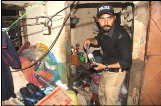
KARACHI: Police raid on gutka factory at Golimar locality and seal the local factory.

ISLAMABAD (Online): Economic team of ministry of finance will reach Morocco on Sunday to attend annual meetings of World Bank (WB) and IMF. According to ministry sources the economic team will be led by caretaker finance minister. Finance secretary and governor state bank will accompany caretaker finance minister. Meetings of economic team are scheduled with MDI IMF, President World Bank and Asian Development Bank authorities. The caretaker finance minister along with economic team will hold talks for sale of bonds in international market. The schedule for meetings with Chinese finance minister, Saudi finance minister and Modis official. According to sources loan program will be discussed with MDI IMF in the sidelines meetings. The annual meetings of world bank and IMF are going to commence from October 9 as per schedule.