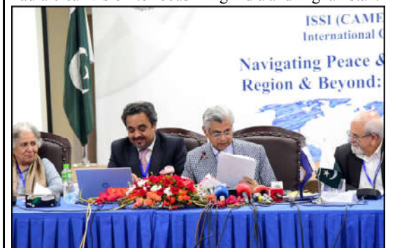
Mr. Murtaza Solangi, Caretaker Federal Minister for Information and Broadcasting addressing on international conference titled "Navigating Peace & Security in the Region and Beyond: Pakistan's Role," in Islamabad.

Solangi said now Pakistan was desirous of establishing good relations with its neighbours including India and Afghanistan.