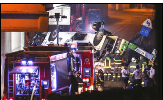
Firefighters and rescue personnel work near a coach after it crashed off an overpass near Venice, in Mestres, Italy.

ments suggest that Turkiye could expand its air strikes to include war-torn Syria. Syria's Kurds have carved out a semi-autonomous area in the country's north and east. US-supported Syrian Democratic Forces (SDF) — the Kurds' de facto army in the area — led the battle that dislodged Islamic State group fighters from the last scraps of their Syrian territory in 2019. But Turkiye views the Kurdish People's Protection Units (YPG) that dominate the SDF as an offshoot of the PKK. Turkish President Recep Tayyip Erdogan has repeatedly threatened to expand attacks against the YPG.