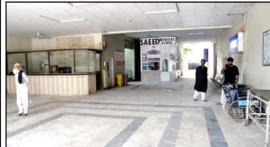
HYDERABAD: A view of closed Rajputana Hospital by administration.