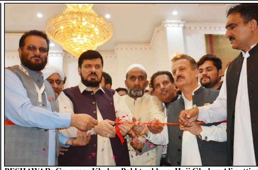
PESHAWAR: Governor Khyber Pakhtunkhwa, Haji Ghulam Ali cutting ribbon to inaugurate Mega International Livestock & Fisheries Expo organized by the provincial livestock department.

He outlined three key priorities for the energy sector.