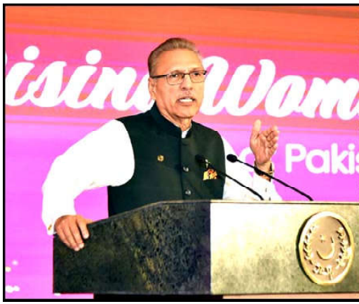
President Dr Arif Alvi addressing an event themed 'Rising Women 2023', organized by Women's Business Network (WBN), at Aiwan-e-Sadr, Islamabad.