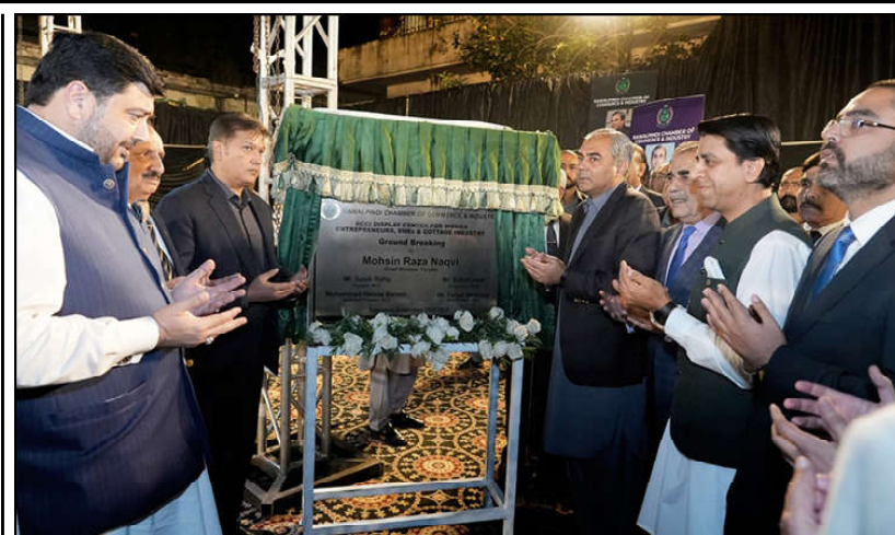
LAHORE: Caretaker Chief Minister Punjab Mohsin Naqvi and others offering Dua after laying foundation stone of the business women, small and medium enterprises and cottage industries display centre.

minister mentioned the transformation of the Urology Hospital into a PKLI, significantly enhancing its standards. He commended the Provincial Minister for Industries SM Tanveer and the Chief Secretary Punjab for their dedicated work on the one-window operation. Highlighting the study of the one-window operation model in China, the CM announced its implementation by establishing a one-window operation facility in alignment with the recommendations of the six major chambers of commerce and industries in Punjab. "The finalization of this operation is expected in the coming days, facilitating seamless interaction between the business community and 36 departments."