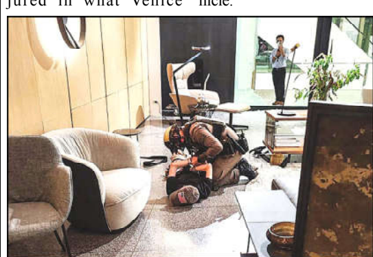
BANGKOK: This handout photo from the Royal Thai Police shows the arrest of a 14-year-old shooting suspect at the Siam Paragon shopping centre.