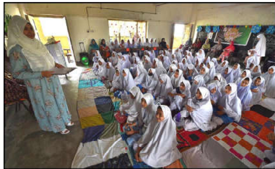
KARACHI: Teacher busy in work in class room as world celebrates International Teachers' Day on 5 Oct 2023. World Teacher Day is an annual event that pays tribute to the educators who play a pivotal role in shaping our future.

Besides this, she said, we had initiated the lady health worker program to upgrade the lifestyle of poor women.