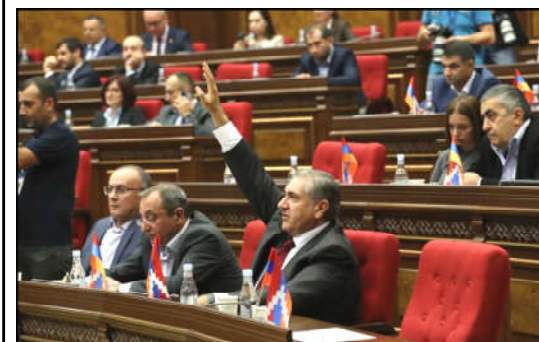
Armenian lawmakers attend the session of the National Assembly of the Republic of Armenia in Yerevan.

"At present, we have not left the regime of abandoning nuclear tests," Kremlin spokesman Dmitry Peskov told reporters. "I don't think such discussions are possible now from an official point of view," Peskov said, adding that Simonyan's words did not "always" reflect Moscow's official position.