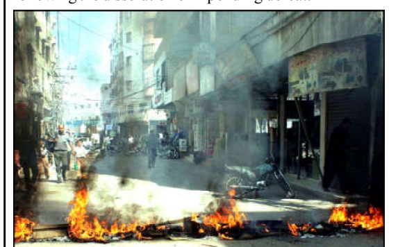
HYDERABAD: Residents of Saddar are blocked road and burn tires as they are holding protest demonstration against prolong electricity load shedding, in Hyderabad.

assemblies. Sirajul Haq stressed that stability was contingent upon upholding the constitution and conducting transparent elections. He criticized those who advocate for prioritizing economic reforms before elections, asserting that such calls merely echo past slogans, specifically the rhetoric of "accountability before elections." He noted that proponents of these ideas were acutely aware of their dwindling popularity among the masses and were anticipating an impending defeat.