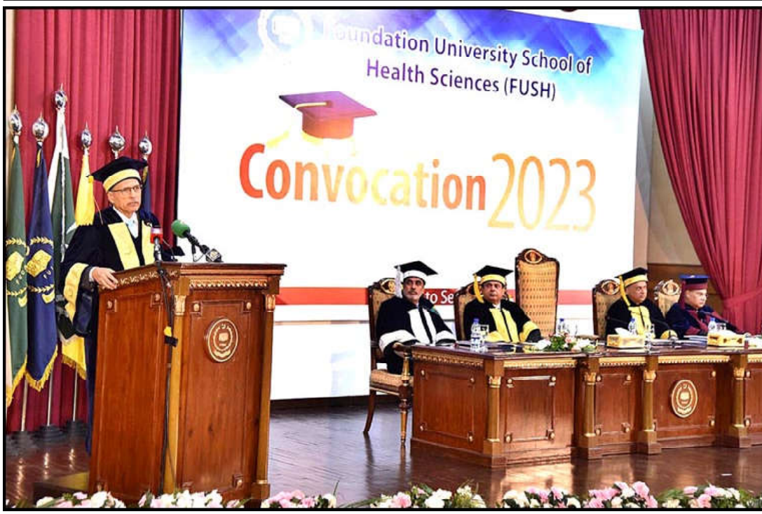
ISLAMABAD: President Dr. Arif Alvi addressing the convocation ceremony of the dentistry and nursing departments of the Foundation University School of Health Science (FUSH).