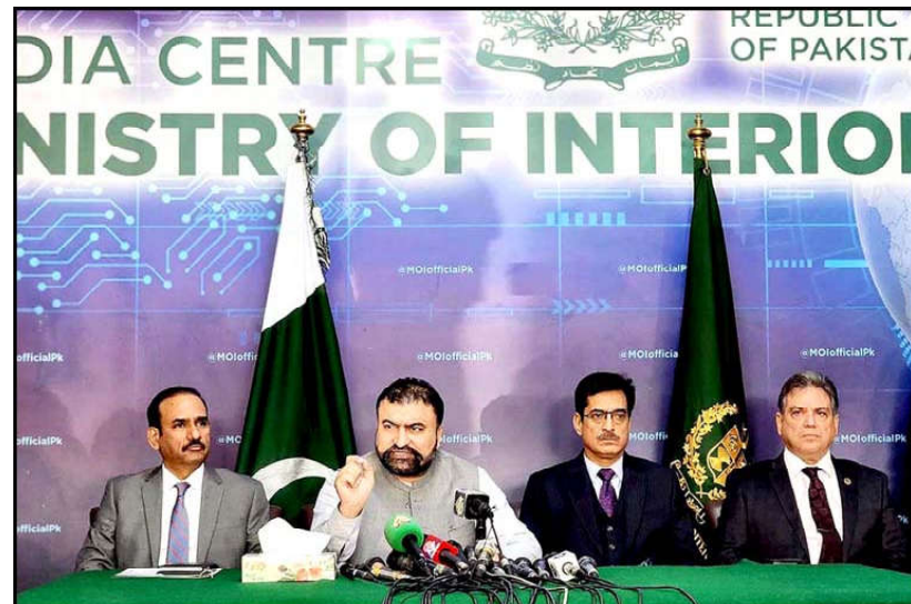
ISLAMABAD: Caretaker Federal Minister for Interior, Sarfraz Ahmed Bugti addressing a Press Conference.

The highly anticipated case is being broadcast live on state television, as cameras from PTV have been installed inside Courtroom No.1. The hearing commenced at 9:30am today. The full court bench, led by CJP Isa, included Justice Ijazul Ahsan, Justice Syed Mansoor Ali Shah, Justice Munib Akhtar, Justice Yahya Afridi, Justice Aminuddin Khan, Justice Sayeed Mazhar Ali Akbar Naqvi, Justice Jamal Khan Mandokhel.