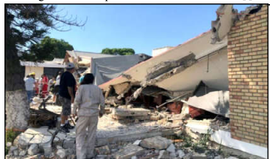
Members of a rescue team and people work at a site where a church roof collapsed during Sunday mass in Ciudad Madero, in Tamaulipas state, Mexico in this handout picture distributed.

The Mexican Council of Bishops issued a statement saying that "we join in prayer at the tragic loss of life and those injured."