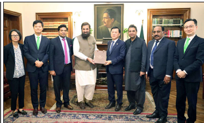
LAHORE: A delegation of an International Peace Organization, Heavenly Culture World Peace Restoration Light (HWPL) working for global peace, led by Senator Kamran Michael in a group photo with Punjab Governor, Muhammad Balighur Rehman at Governor House Lahore.

Governor Punjab said international peace organizations need to be more active and play an effective role in resolving Palestine and Kashmir issues for durable peace in the world.