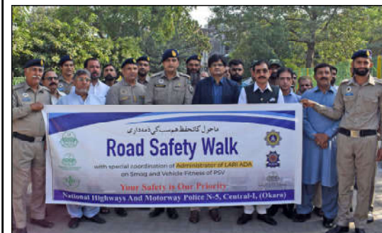
LAHORE: Representative of Motorway Police and Administrators of Bus transportation Company participate in the awareness rally about smog and fog, at General Bus stand in Provincial Capital.

"As a resident of Peshawar, it is my responsibility to work for improvement of the institutions that was one for its reputation and standard of education", he said.