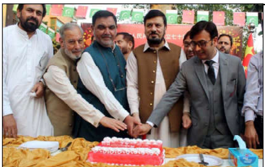
PESHAWAR: Governor Khyber Pakhtunkhwa, Ghulam Ali along with others cutting cake during a ceremony on the eve of National Day of China, at China Window in Peshawar.

The details further reveal that 1388 victims were affected by road traffic crashes including 1130 males & 263 females, while the age group of the victims shows that 191 were under 18 years of age, 770 were between 18 and 40 years and rest of the 432 victims were reported above 40 years of age.