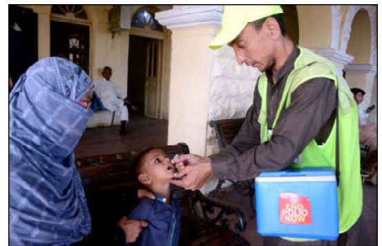
KARACHI: Health worker administering polio drops to a child at Cantt Station.