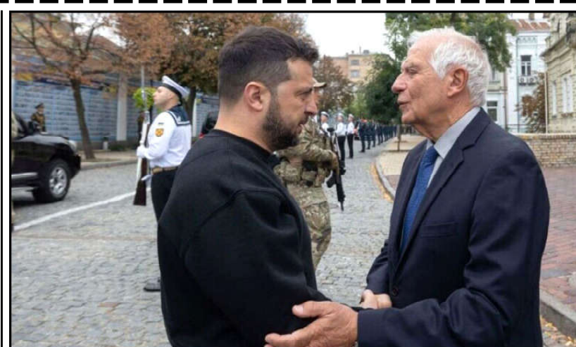
Ukraine's President Volodymyr Zelenskyy speaks with European Union Foreign Policy Chief Josep Borrell as they visit the Memory Wall of Fallen Defenders of Ukraine, amid Russia's attack on Ukraine, during the marking of Defenders of Ukraine Day in Kyiv.

France's top diplomat Catherine Colonna appeared to address the concerns, saying the meeting was a signal to Moscow of the bloc's determination to support Ukraine over the long term.