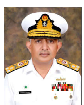
Vice Admiral Naveed Ashraf has been appointed as the new Naval Chief.

According to the spokesperson of Pakistan Navy, change of command ceremony will be held on Saturday in Islamabad.