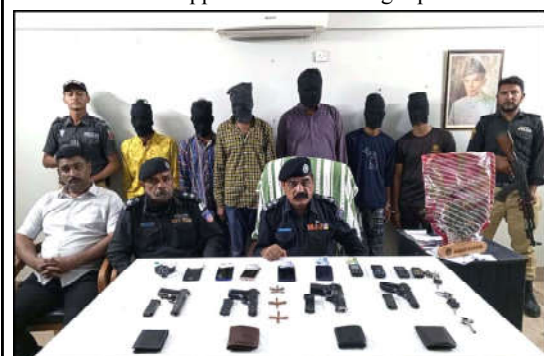
KARACHI: Police officials show arrested street criminals, robbers and recovered seized weapons and currency to media persons during press conference held at Surjani Town Police Station in Karachi.

The meeting discussed and reviewed the performance and trends of key economic indicators including CPI of various essential items presented by Ministry of Planning, Development, and Special Initiatives. The meeting decided to constitute a Core group comprising Secretary Planning, Commerce, Food Security and Industry with the mandate to present concrete proposals for monitoring and advising the ECC on prices of the essential commodities as well as maintaining the stocks of the strategic products.