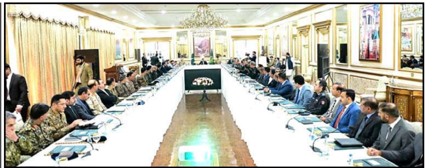
ISLAMABAD: Caretaker Prime Minister Anwaar-ul-Haq Kakar chairs a meeting of the Apex Committee on National Action Plan.

The Forum reiterated the need to further enhance and strengthen ongoing operations against growing illegal activities including drug trafficking, hoarding, food and currency smuggling, illegal remittances and power theft.