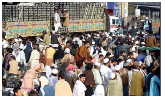
PESHAWAR: A view of rush on fruit mandi.

This agreement covers commerce and transit of commodities by road and rail as well as customs processes and will shift Uzbekistan's entire trade from Iran's Port Bandar Abbas to Pakistani seaports. It will also connect Pakistan seaports to the CARs.