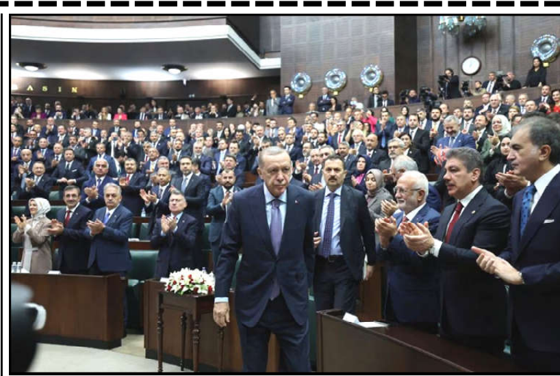
Turkish President Tayyip Erdogan attends a meeting with members of parliament from his ruling AK Party (AKP) at the Turkish parliament in Ankara, Turkey.

a terrorist organisation and hosts members of the group on its territory. Ankara backs a two-state solution to the decades-old Israel-Palestinian conflict. Advertisement Scroll to continue Erdogan also slammed Western powers for supporting Israel's bombing of Gaza and called for an immediate ceasefire, the unhindered entry of humanitarian aid into Gaza and for Muslim countries to work together to stop the violence.