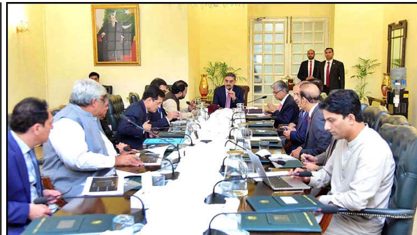
ISLAMABAD: Caretaker Prime Minister Anwaar-ul-Haq Kakar chairs a review meeting regarding the Anti-Power Theft Campaign 2023.

The president reiterated that two-state was the only solution to Palestine issue.