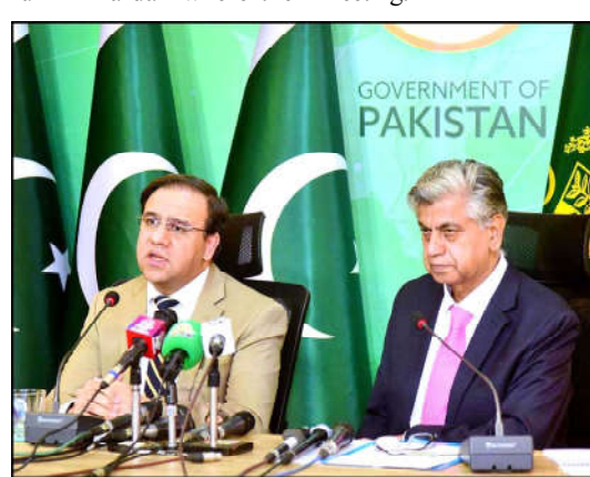
ISLAMABAD: Caretaker Federal Minister for IT and Telecommunication, Dr. Umar Saif, and Caretaker Federal Minister for Information & Broadcasting, Murtaza Solangi addressing Press Conference.

The PTI chief, in his petition, stated that his indictment was made in a haste by the trial court and it was a violation of Criminal Procedure 1898, and articles 4 and 10A of the Constitution. He said that the charges could be framed after seven days of providing the copy of the challan to the defence, and prayed the court to set aside the indictment as it would be violation of fundamental rights if the trial is concluded in haste.