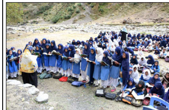
MUZAFFERABAD: Students are attending the classes at open air schools in the different areas of the Azad Kashmir, as after millions rupees of education fund, students are studying with building.

Lahore Safe City Project will be made functional at the earliest. CM presided over an important meeting at the Punjab Safe City Authority Office in which progress was reviewed on the Safe City projects of Rawalpindi, Faisalabad and Gujranwala. The proposals to bring improvements in the Emergency Services 15 and making paperless working of the Punjab Safe City Authority were reviewed during the meeting. CM was informed during the briefing that 2000 cameras will be made functional by the first week of November in Lahore. IG Police gave a briefing with regard to progress being made in the Safe City.