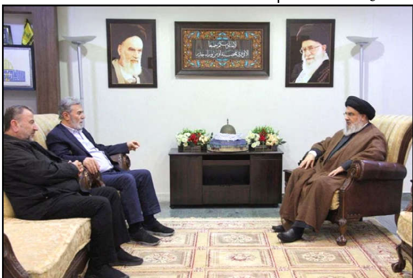
Lebanon's Hezbollah leader Sayyed Hassan Nasrallah meets Jihad Secretary General Ziyad al-Nakhlah and deputy leader of Hamas, Sheikh Saleh al-Arouri at an unidentified location in this handout image released.

Monitoring Desk BEIJING: China's defence ministry on Wednesday denounced the U.S. Defense Department's annual report on China, saying it distorts the country's security policy and military strategy. Over the next decade, the People's Republic of China will rapidly modernise, diversify, and expand its nuclear forces, the Pentagon said in its report to U.S. Congress.