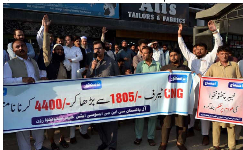
PESHAWAR: Members of All Pakistan CNG Association are holding protest demonstration against CNG Tariff hike, at University road in Peshawar

ISLAMABAD (APP): The 100-index of Pakistan Stock Exchange (PSX) on Wednesday witnessed bullish trend, gaining 149.19 points, a positive change of 0.29 percent, closing at 51,177.13 points against 51,027.94 points the previous day. A total of 427,393,948 shares valuing Rs.15,509 billion were traded during the day as compared to 321,403,857 shares valuing Rs.11,091 billion the previous day. As many as 351 companies transacted their shares in the stock market; 175 of them recorded gains and 160 sustained losses.