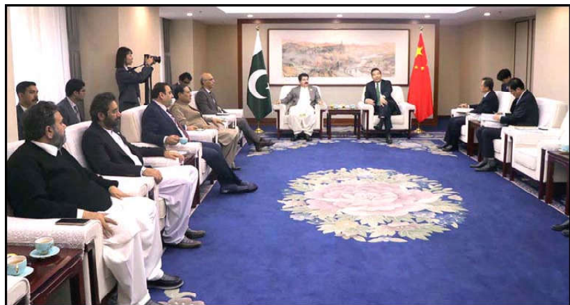
BEIJING: Chairman Senate, Muhammad Sadiq Sanjrani and his delegation in a meeting with Mr. Luo Zhaohui, Chairman China International Development Cooperation Agency (CIDCA).

Caretaker federal ministers for interior, energy and information & broadcasting, provincial chief secretaries and relevant federal secretaries attended the meeting.