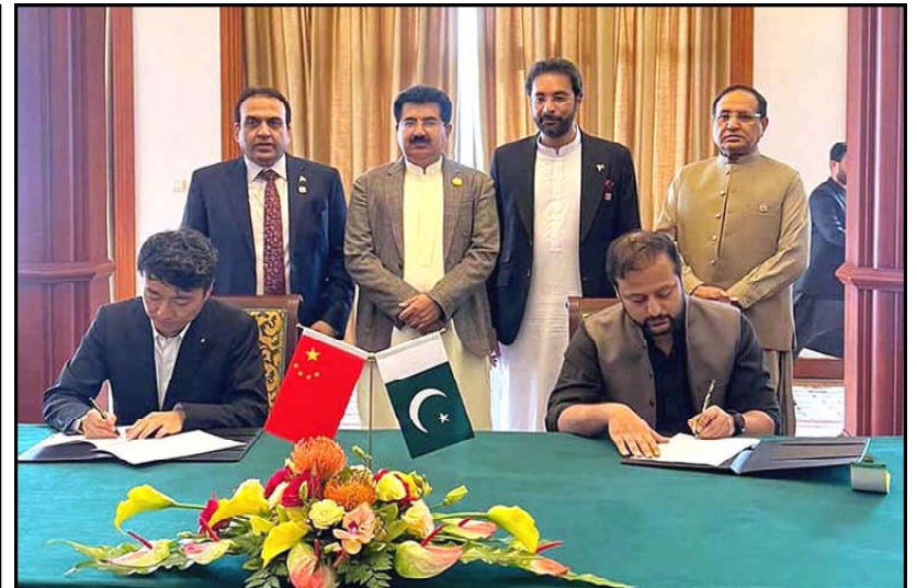
BEIJING: Chairman Senate of Pakistan, Muhammad Sadiq Sanjrani, along with the Pakistani Delegation, witnessed a memorandum of understanding (MOU) signing ceremony between TGood, a leading Chinese Company, and the REC group of Pakistan.

tions concerning the Israeli Foreign Minister's tweet, UN Spokesperson Stephane Dujarric said that the Secretary-General would be meeting family representatives of hostages being held by Hamas in Gaza, adding they would be accompanied by a representative of the Israel's Permanent Mission to the UN. In his speech to the Security Council, Ambassador Akram conveyed Pakistan's full support and solidarity with Palestinian brothers and sisters in these tragic and challenging times. Israel's relentless and indiscriminate bombardment of Gaza over the last 17 days has killed more than 5,000 people and injured another 15,000, the Pakistani envoy said, "strongly and unequivocally" condemning Israel's airstrikes and military actions in Gaza, particularly attacks on schools, residential buildings and hospitals on civilians, civilian objects and infrastructure, blockade of water, food and fuel as well as the forced transfer of people from the occupied territory, are flagrant violations of international humanitarian law and amount to war crimes," he said, adding, "Those responsible for these atrocious crimes must be held accountable." Ambassador Akram regretted the Security Council has been unable to issue a call for a ceasefire. In this regard, a heavy responsibility rests on those who contribute to the prolongation of this conflict, he said.