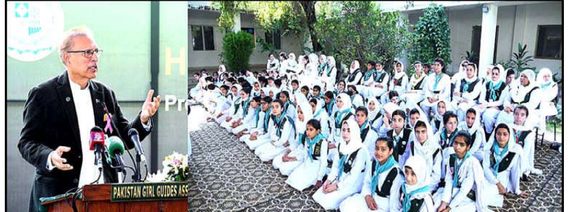
ISLAMABAD: President Dr Arif Alvi addressing the 12th All Pakistan Camp of Pakistan Girl Guides Association (PGGA).