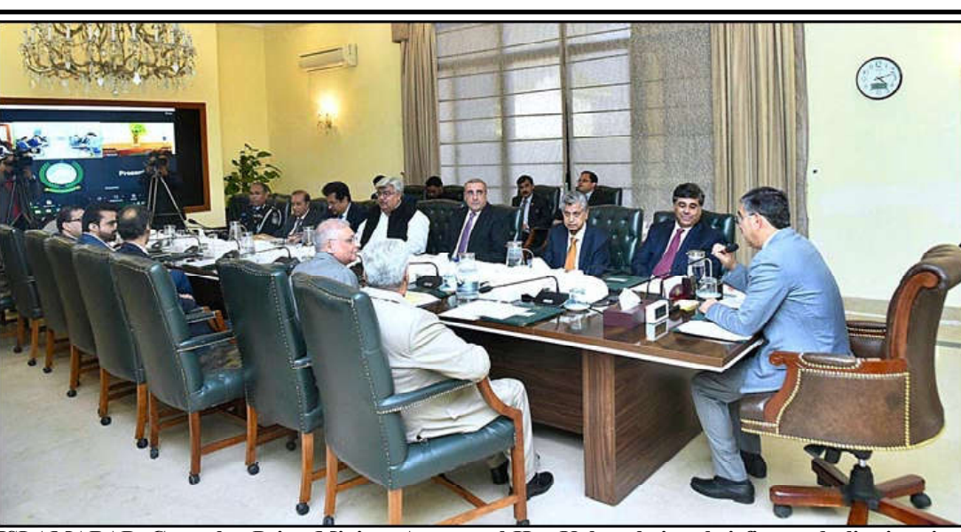
ISLAMABAD: Caretaker Prime Minister Anwaar-ul-Haq Kakar chairs a briefing on decline in prices of essential items as a result of reduction in the prices of petroleum products.

He said 18 percent reduction of wheat price and sugar by 16 percent in Balochistan