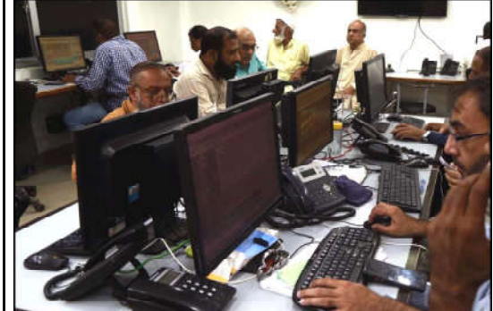
KARACHI: Brokers are busy in trading at Pakistan Stock Exchange (PSX) in Karachi.

The report highlighted that Pakistan's economic situation has started to show some early signs of improvement as the country has been able to secure a US$ billion Stand-By Arrangement (SBA) from IMF,