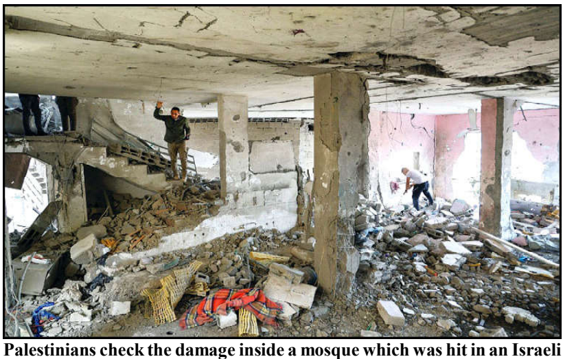
air strike, in Jenin refugee camp in the Israeli-occupied West Bank

"It's in Australia's interest to have good re-lations with China," Albanese told reporters at Australian Parliament