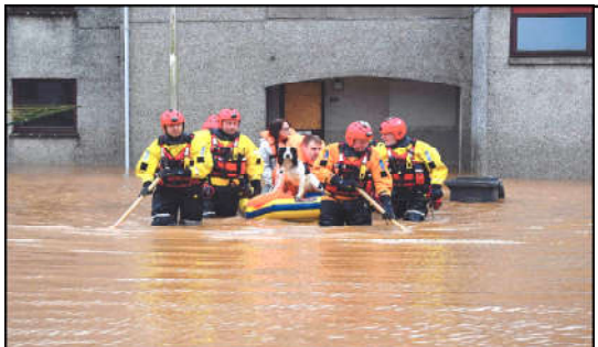
A couple and their dog are rescued by a coastguard team from a flooded street in Brechin, Scotland.