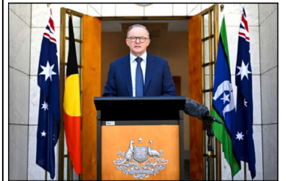
Australian Prime Minister Anthony Albanese speaks to the media during a press conference at Parliament House in Canberra.

Monitoring Desk MOSCOW: Russian Foreign Minister Sergei Lavrov will visit Iran's capital Tehran on Monday, state-run RIA news agency reported, citing ministry spokeswoman Maria Zakharova. Lavrov said on Thursday there was serious risk that the Gaza conflict will become regional, and Russia is in contact with Turkey over the matter, the Interfax news agency reported.