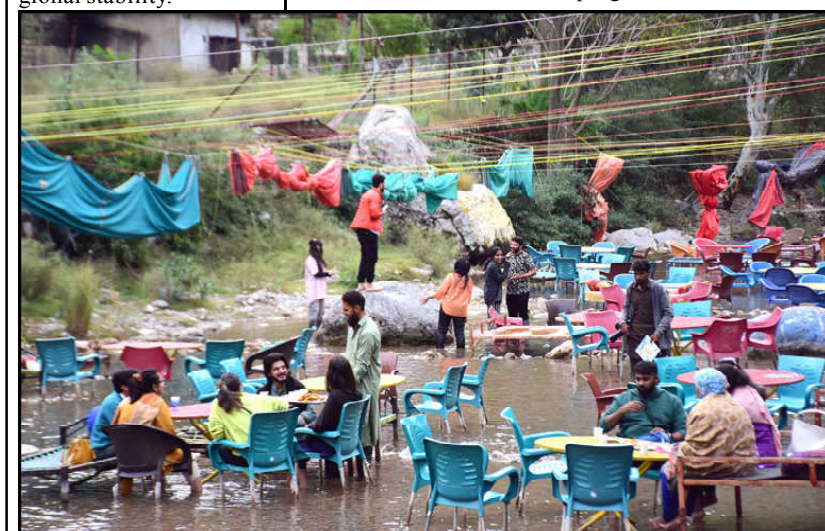
ISLAMABAD: Picnickers are enjoying Sunday holiday at Shahdara picnic point during pleasant weather in Federal Capital.