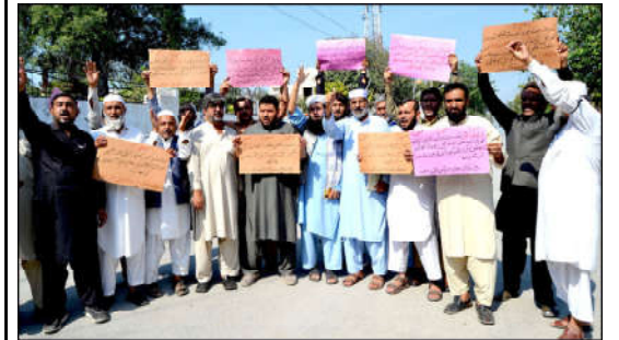
PESHAWAR: Employees of reading Hospital are demonstrating outside the press in support of their demands.