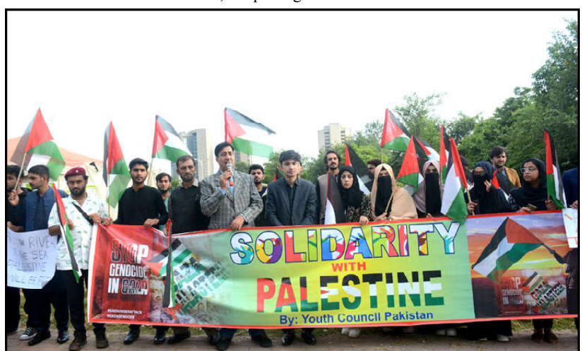
ISLAMABAD: Activists of Youth Council Pakistan hold a peaceful protest to show Solidarity with Palestinian people in front of NPC.

The petition further states that those who are found guilty after a trial in military courts will receive minor punishments, those involved in the incidents of May 9 and 10 who have been imprisoned according to the crime will be released, while those who have been sentenced to prison after a military trial will be released according to law.