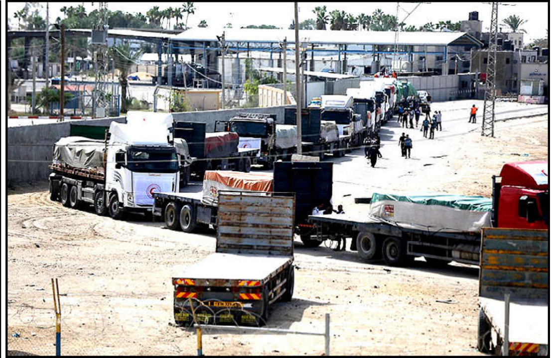
Trucks carrying humanitarian aid entering Gaza at Rafah crossing

They said this renewed spirit of commitment and solidarity was reminiscent of the Prophetic era and served as a beacon of hope for justice and peace in the region.