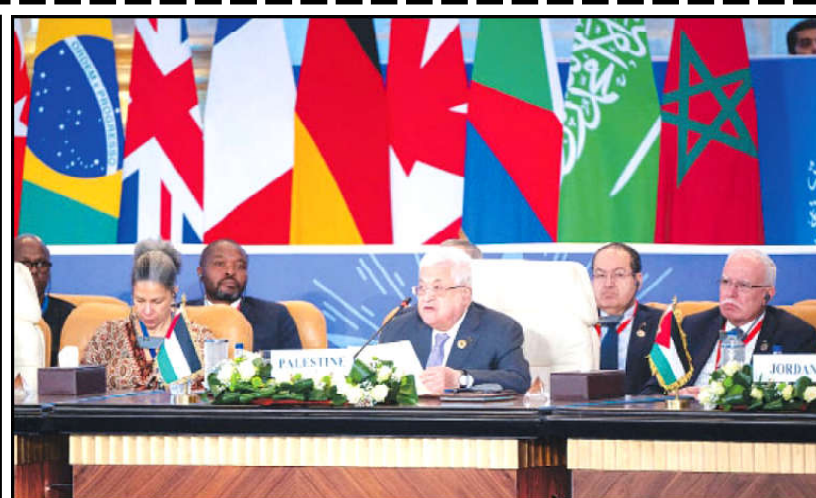
Palestinian President Mahmoud Abbas delivers a speech during the summit in Cairo.

non-U.S. Secretary of State Antony Blinken cautioned Lebanon's caretaker prime minister that the Lebanese population would be affected if his country were drawn into the Israel-Hamas war, the State Department said. With violence around its heavily guarded borders increasing, Israel on Sunday added 14 communities close to Lebanon and Syria to its evacuation plan in the north of the country. Israel began unrelenting air strikes on Gaza to its southwest after Hamas militants breached the border and carried out a shock rampage through nearby communities, killing 1,400 people, mainly civilians, and taking 212 hostages back to Gaza.