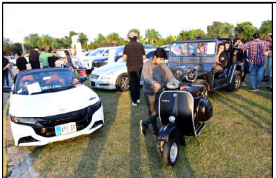
ISLAMABAD: Visitors look at cars and scooters during cars and bikes show at lake view Park in Federal Capital.