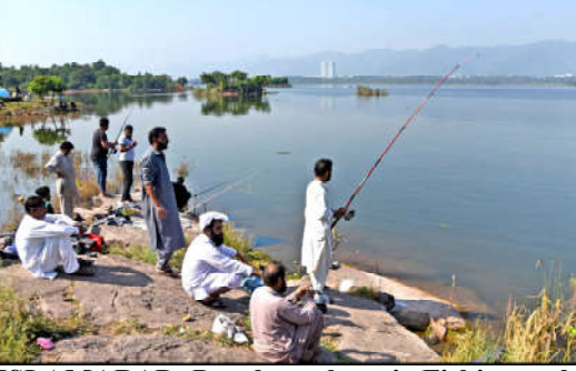
ISLAMABAD: People are busy in Fishing at the bank of the Rawal Lake during pleasant weather in Federal Capital.

The Secretary wide drive against Power Division further mentioned that Mardan In an exclusive talk city had earned the stawith PTV news channel, tus of a load-sheddinghe hailed the citizen of free city, adding, he Mardan city which was praised the efforts of the police and PESCO offirecently declared as a load shedding free city with the cials in the campaign huge cooperation of citi- against electricity theft.