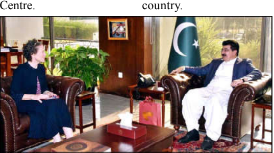
ISLAMABAD: High Commissioner of Canada, Ms. Leslie Scanlon calling on Chairman Senate, Muhammad Sadiq Sanjrani at Parliament House.

The minister said efforts were being made to ensure the availability of the best medical facilities in the country