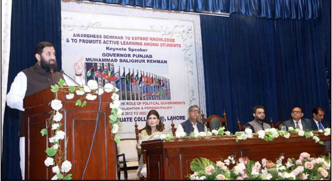
LAHORE: Governor Punjab Muhammad Balighur Rehman addressing a seminar at Government Graduate APWA College for Women.