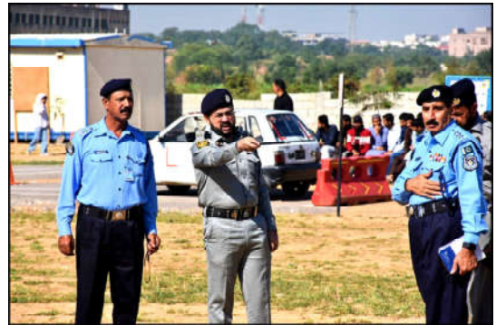
been commenced in the Driving School and Test Centre for women. Under the guidelines of Interior Minister Sarfraz: Bugti the first women's driving school and test centre was oriented. Chief Traffic Officer Islamabad visited the driving and test center and directed officials to provide all possible facilities to women.