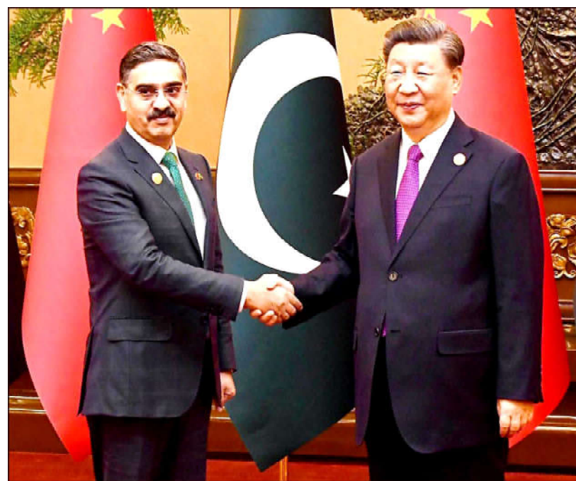
BEIJING: Caretaker Prime Minister Anwaar-ul-Haq Kakar meets Chinese President Xi Jinping in Beijing.