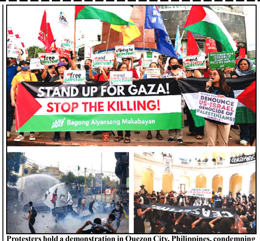
Protesters hold a demonstration in Quezon City, Philippines, condemning the blast at the Ahli Arabi hospital in Gaza; members of the US Jewish community protest in the US Capitol in Washington against Israeli attacks; and Lebanese security forces use water cannons as they clash with protesters outside the US Embassy in Awkar, east of Beirut, during a pro-Palestinian demonstration.

Monitoring Desk CAIRO: Egypt's President Abdel Fattah al-Sisi said on Wednesday that Egyptians would reject the forced displacement of millions of Palestinians into Sinai, adding that any such move would turn the peninsula into a base for attacks against Israel. The Gaza Strip is effectively under Israeli control and Palestinians could instead be moved to Israel's Negev desert "till the militants are dealt with", Sisi told a joint news conference in Cairo with German Chancellor Olaf Scholz. The border between Egypt's Sinai Peninsula and the Gaza Strip is the site of the only land crossing from the Palestinian territory that is not controlled by Israel. Israel's unprecedented bombardment and siege of Gaza has raised fears that its 2.3 million residents could be forced southwards into Sinai.