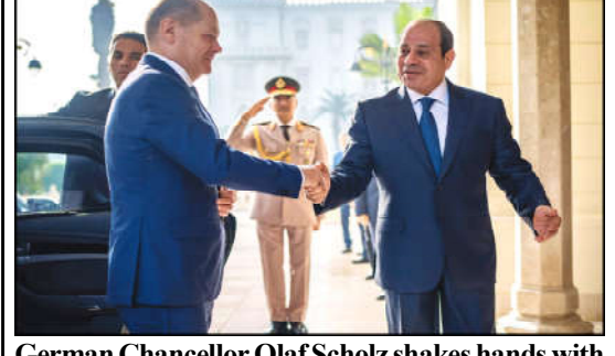
German Chancellor Olaf Scholz shakes hands with Egypt's President Abdel Fattah al-Sisi in Cairo.

far east. Earlier in the day, Lavrov lashed out at what he termed a "dangerous" US policy towards North Korea while touting the "new, strategic level" of relations between Moscow and Pyongyang. "Like our North Korean friends, we are seriously worried about the intensification of military activity of the United States, Japan and South Korea in the region and by Washington's policies," Lavrov told journalists, according to Russian news agencies. "We oppose this unconstructive and dangerous line," he said.