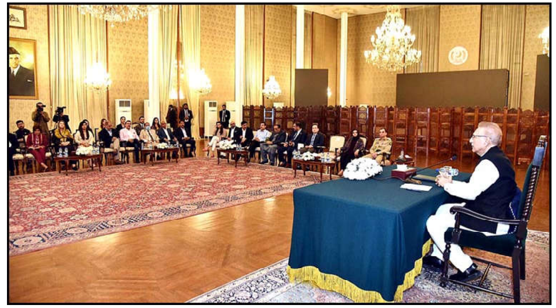
ISLAMABAD: President Dr Arif Alvi speaking to journalists during an interactive session on Breast Cancer, at Aiwan-e-Sadr.

duct monthly self-examinations to locate an abnormal nodule and not to hesitate to seek urgent medical help. President Alvi recalled that last year, the Pakistan Telecommunication Authority on his suggestion relayed 120 million call-waiting messages about breast cancer. He urged the journalists to join the cause of fighting breast cancer by highlighting the topic in their write-ups and television programmes. The president men-