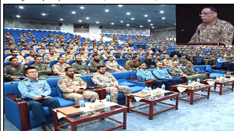
ISLAMABAD : Chairman Joint Chiefs of Staff Committee, General Sahir Shamshad Mirza addressing the participants of ongoing aerial exercise Indus Shield-2023

was referring to the use of veto power by the United States at the UN Security Council to block a resolution calling for Israel to allow humanitarian corridors into the Gaza Strip, a pause in the fighting and the lifting of an order for civilians to leave the north of the besieged territory.