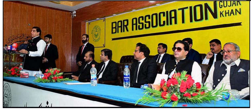
GUJJAR KHAN: Speaker National Assembly Raja Pervez Ashraf addressing the Public Gathering after Inaugurating Solar Energy System at Gujjar Khan Bar Association.