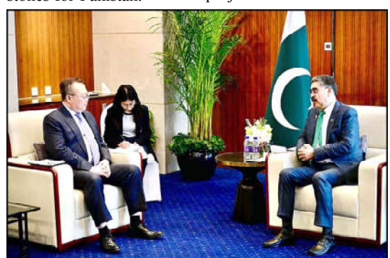
BEIJING: Liu Jianchao, Minister of the International Department of the Communist Party of China (IDCPC) called on Caretaker Prime Minister Anwaar-ul-Haq Kakar.

ISLAMABAD (Online): An important progress has been made in the purchase of cheap oil from Russia; between Pakistan and Russia for the long-term purchase of oil.