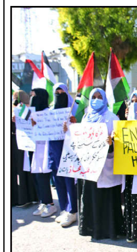
ISLAMABAD: Girls Activists of Muslim Tulba Mahaz holds placards and Palestinian Flags during protest rally from Aabpara Chowk to United Nations Office for showing solidarity with the oppressed Muslims of the Philistine and to shake the dead consciousness of Muslims Ummah.

The court subsequently granted protective bail to the former prime minister stating that NAB had not raised any objection on it. It also stopped the Bureau from arresting Nawaz Sharif on his arrival in Pakistan till October 24, so that he could surrender before the court.