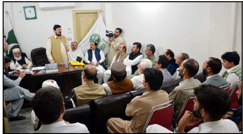
SWAT: Governor Khyber Pakhtoonkhwa Haji Ghulam Ali addressing office bearers of Chamber of Commerce & Industry and trader community during his visit of Swat.