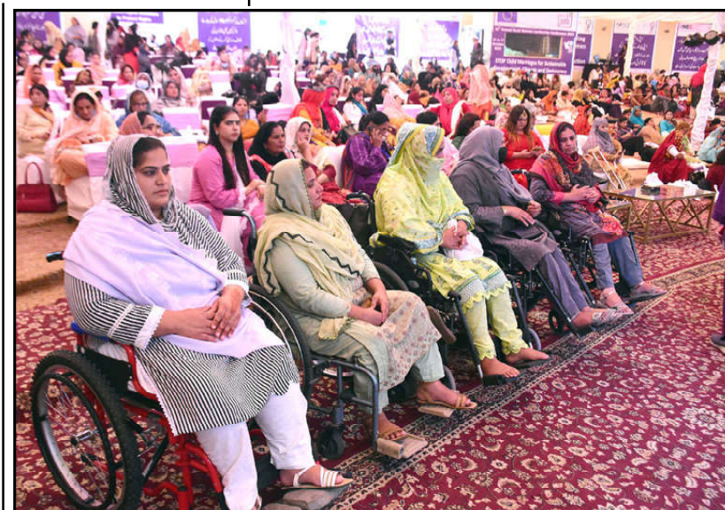
ISLAMABAD: Women participants enjoying during 16th annual Rural Women Leadership Conference, in connection with International Day of Rural Women, at Lok Virsa in Federal Capital.

Law enforcement authorities swiftly responded to the scene, coordinating the rapid transfer of all four injured individuals to the nearest hospital for urgent medical attention. Despite the concerted efforts of medical staff, the two women, critically wounded in the blast, tragically succumbed to their injuries.