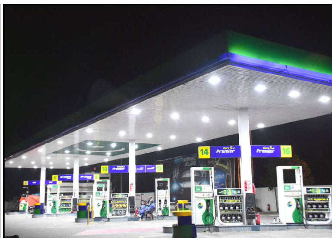
ISLAMABAD: A view of deserted petrol pump at Melody in Federal Capital, As Petrol prices drop below Rs290 per litre, in Pakistan, an anticipated move in response to global oil price fluctuations.

The higher volume of trade and businesses would result into integrated development which would eventually promote, harmony and sustainable development, he added. "CPEC is the journey towards economic growth in the globalized world", he maintained. Chinese ambassador to Pakistan Jiang Zaidong expressed his country's readiness to further promote CPEC in partnership with Pakistan, adding "We are ready to work with our Pakistani colleagues from all walks of life to further promote the projects in the next ten years of CPEC." "What was agreed between President Xi Jinping and the Pakistani leaders for a high-quality sustainable and enhanced cooperation and support in the fields of security and development, we can implement with mutual consensus", he said. The ambassador was of the view that Pakistan and China could jointly make the CPEC, a corridor of love and peace. He said that mutual cooperation in new fields such as industry, agriculture, mining, science and technology and IT sectors could be increased. "Thus a new chapter can be added in the CPEC which will bring the people of China and Pakistan closer to each other in the common future", Jiang Zaidong maintained.