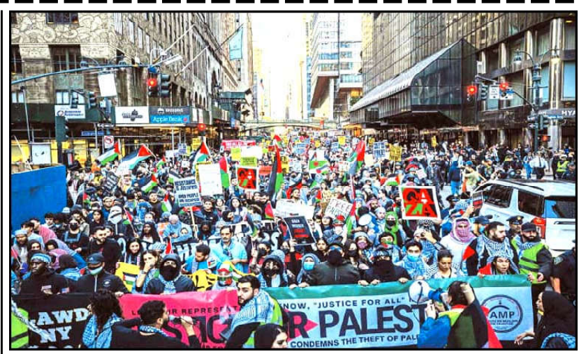
People hold a demonstration in support of Palestinians in New York City.