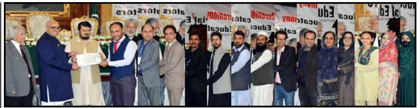
PESHAWAR: Governor Khyber Pakhtoonkhwa Haji Ghulam Ali distributing appreciation certificates among participants of a ceremony organized by All Private Sector Universities Pakistan (ASUP) at Governor House.