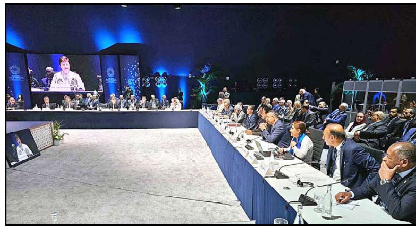
MARRAKECH: Dr. Shamshad Akhtar, Caretaker Federal Minister for Finance, Revenue, and Economic Affairs, participated in a high-profile meeting of Finance Ministers with the Managing Director of the International Monetary Fund (IMF) in Marrakech.

The foreign minister, to a query, advised not to heed to propaganda about the CPEC, adding the railways project was the part of ongoing negotiation between the two sides and had been in the advanced stage and expressed the hope that an agreement in this regard would be concluded soon.