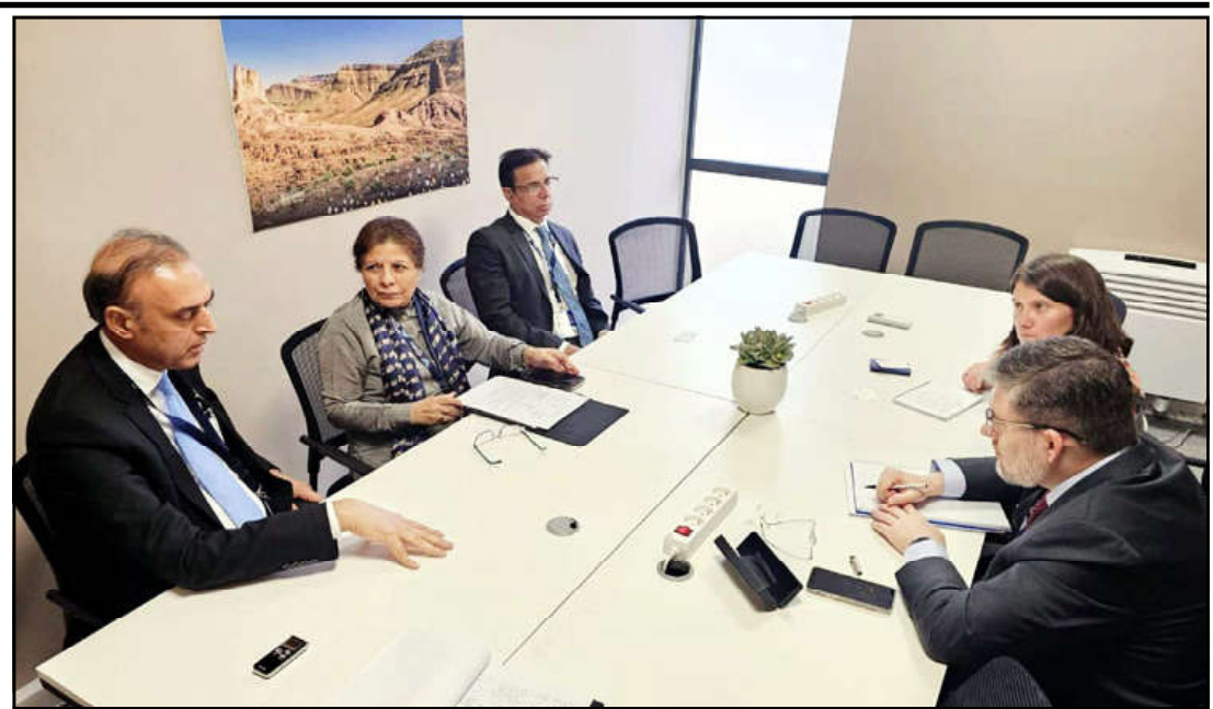
Marrakech: Federal Minister for Finance, Revenue, and Economic Affairs, Dr. Shamshad Akhtar held a meeting with a high-level delegation of Moody's, the global financial services company, during her visit to Morocco for the annual meeting of WB/IMF. During the meeting, Dr. Shamshad Akhtar reiterated the government's commitment to transparency in order to foster investor confidence and maintaining a positive credit rating of Pakistan in the global financial markets.