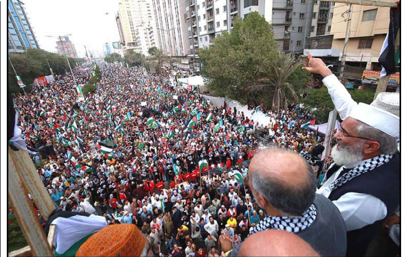
KARACHI: Ameer Jamaat-i-Islami Siraj ul Haq addresses "Al Aqsa Palestine March" organized by JI at Shahrah-e-Faisal.

The decision was taken in view of their participation in incidents of violence of May 9 as well as involvement in incidents of terrorism.