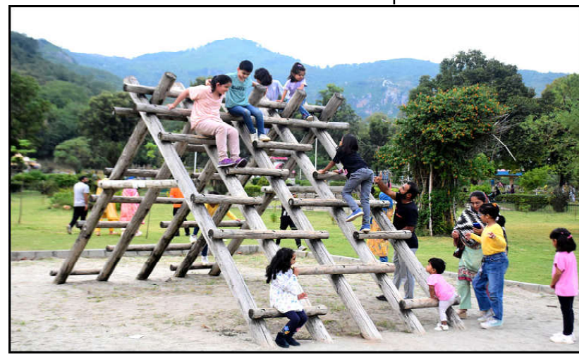
ISLAMABAD: Children are enjoying Sunday Holiday at Japanese Children Park in Federal capital.

the problems faced by the citizens. In this regard, the Counter Terrorism Department (CTD) Islamabad has registered a data of 167 house servants and tenants of 459 houses from Bhara Kahu Police Station jurisdiction. The purpose of this campaign is to avoid any untoward incident by maintaining law and order in the federal capital adding that the registration of tenants and domestic workers could not only keep a close watch on miscreants but also prevent the elements involved in any kind of suspicious activity.