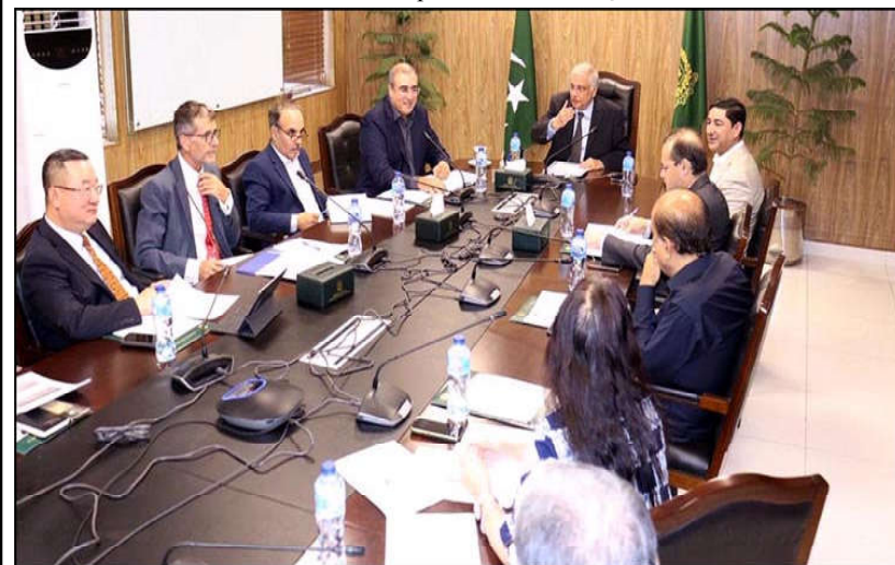
ISLAMABAD: The 2nd meeting of Policy & Strategy Committee/Oversight Board on post flood Resilient, Recovery, Rehabilitation and Reconstruction Framework (4RF) activities held under the chairmanship of the caretaker Federal Minister for P&D and Special Initiatives Muhammad Sami Saeed.

"Despite our financial constraints, we are extending financial support to the people with compassion and love in a country where tax to GDP ratio is only 8 to 9 percent", he said.