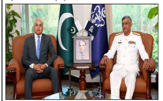
ISLAMABAD: Chief of the Naval Staff, Admiral Naveed Ashraf exchanging views with Shahid Ashraf Tarar, Caretaker Minister for Maritime Affairs during meeting held at Naval Headquarters.

Furthermore, they expressed their commitment to continue providing support for these projects in the future.