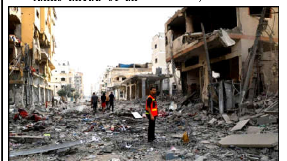
A rescuer looks on amid debris in the aftermath of Israeli strikes, in Gaza City.

expected ground invasion in response to a devastating weekend attack by the militant group Hamas. Putin said that using heavy weaponry in residential areas was "fraught with serious consequences for all sides." "And most importantly, the civilian casualties will be absolutely unacceptable. Now the main thing is to stop the bloodshed," he said.