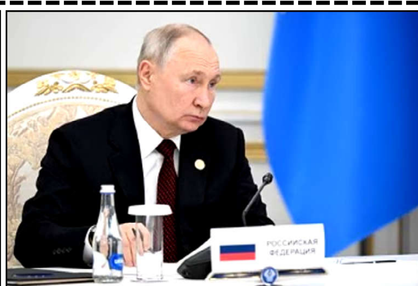
Russian President Vladimir Putin attends the Commonwealth of Independent States (CIS) leaders' summit in Bishkek, Kyrgyzstan.

Monitoring Desk WASHINGTON: The United States and Qatari officials have agreed to prevent Iran from using a $6 billion humanitarian assistance fund, according to the Washington Post. The money had been transferred to Iranian accounts in Qatar, in a US-Iran prisoner swap deal announced in recent weeks where five US detainees were released by Iran. But Washington Post reported on Thursday that a decision was made to halt access to the funds, while President Joe Biden faces rising pressure on the matter given Iran's declared support to Hamas. "We have strict oversight of the funds and we retain the right to freeze them," US Secretary of State Antony Blinken told a press conference in Tel Aviv on Thursday. The White House added in a separate briefing that "every single dime of that money is still sitting in a Qatari bank." "Not one dime of it has been spent," according to National Security Council spokesman John Kirby.