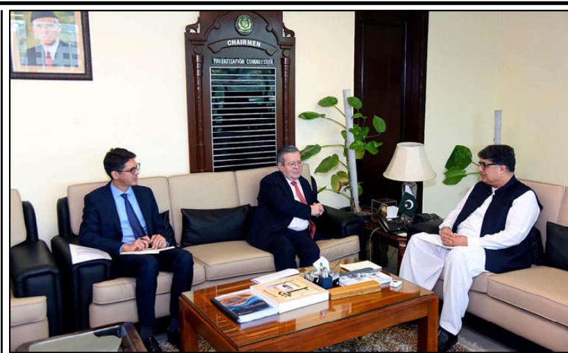
ISLAMABAD: The Ambassador of France HE Nicolas Galey called on Federal Minister for Privatization Fawad Hasan Fawad.

proposed that a separate connectivity on motorway may be constructed for KP people to enable them direct access to Islamabad airport, the Federal Minister assured that this proposal is under consideration of his ministry.