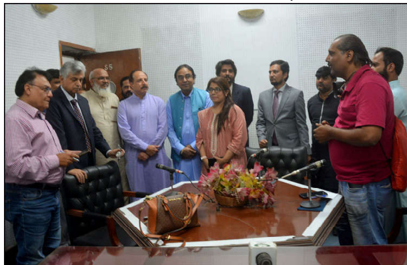
LAHORE: Caretaker Federal Minister for Information and Broadcasting, Murtaza Solangi visit Radio Pakistan.

The minister invited his Iranian counterpart to attend Global Health Security Summit at Islamabad this December.