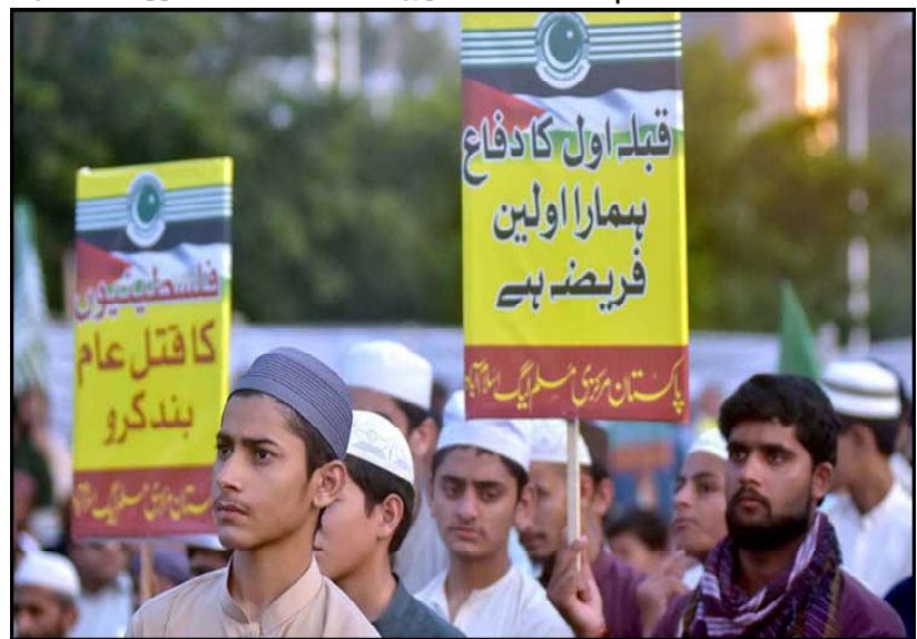
ISLAMABAD: Youngsters participating in a rally while thousands of people protested across the country after Friday prayers against Israel's siege and fierce bombing on the Gaza Strip in retaliation to Hamas attacks.