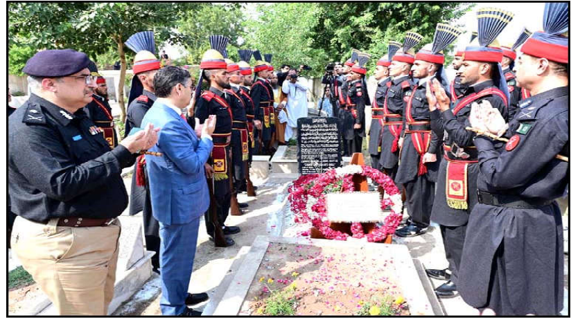
PESHAWAR: Caretaker Prime Minister, Anwaar-ul-Haq Kakar offers Feteiha and lays floral wreath at the grave of Shaheed Sifwat Ghayur, Former Commandant of FC during his visit, in Peshawar.

Furthermore, the delegation was also briefed that Safe City Islamabad is playing a significant role in various sectors through modern techniques, including the Police Operations Center, Emergency Control Center, Data Hub, Dispatch Control Center, E-Challan System, and the "Pukar-15" helpline. Face recognition cameras have been installed at the entry and exit points of the city which are playing an important role in identifying suspicious elements. The delegation was also apprised of the functionality and benefits of the Safe City cameras.