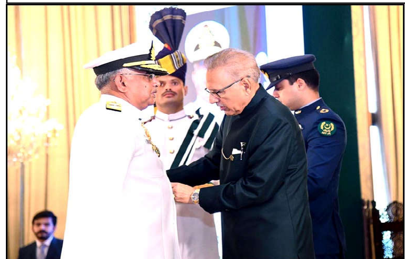
ISLAMABAD (Online): President Dr. Arif Alvi conferred Nishan-e-Imtiaz (Military) on newly appointed Chief of Naval Staff Admiral Naveed Ashraf on Friday.

The investiture ceremony was held at Awwan-e-Sadar in Islamabad. Caretaker Prime Minister (PM) Anwar ul Haq Kakar also participated in the ceremony.