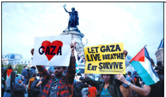
Protesters hold Palestinian flags during a demonstration in Paris.

White House national security spokesman John Kirby said such a huge evacuation was a "tall order," but that Washington would not second-guess its ally's decision to tell civilians to get out of the way. "We understand what they're trying to do and why they're trying to do this—to try to isolate the civilian population from Hamas, which is their real target," he said on MSNBC. The northern half of the Gaza Strip includes the enclave's biggest settlement Gaza City. The U.N. said it had been told that Israel wanted the entire population to move across the wetlands that bisect the enclave.