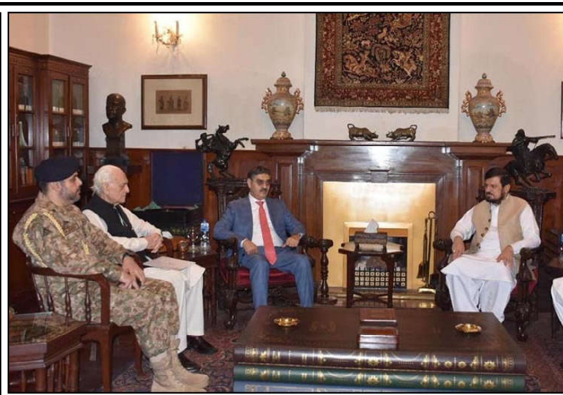
PESHAWAR: Governor Khyber Pakhtunkhwa Haji Ghulam Ali and the Caretaker Chief Minister Khyber Pakhtunkhwa Azam Khan call on the Caretaker Prime Minister Anwaar-ul-Haq Kakar.

PESHAWAR (APP): The officials of Pakistan Telecommunication Authority (PTA) and Federal Investigation Agency (FIA) have arrested five accused for issuing illegal phone SIMs on Afghan passports. FIR spokesman told media on Friday that action was taken at Kohat Road, Peshawar from where five accused were arrested from a franchise of a mobile phone company.