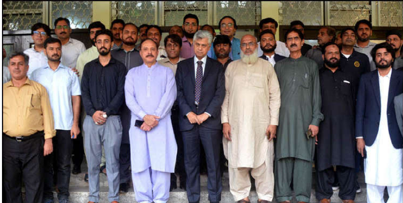
LAHORE: A group photo of Caretaker Federal Minister for Information and Broadcasting Murtaza Solangi with Radio Pakistan Staff.

approximately Rs 50 million in costs. The Nankana Sahib Safe City Project was a joint endeavor involving local and international companies, which will also take on the responsibility of operation and maintenance for the next three years. As part of the Nankana Sahib Safe City project, a total of 30 kilometers of optical fiber has been laid throughout the city. This project has been seamlessly integrated with the Lahore Safe City network. Notably, cameras have been strategically installed to enhance security at Sikh places of worship, Ashura routes, religious sites, and government buildings.