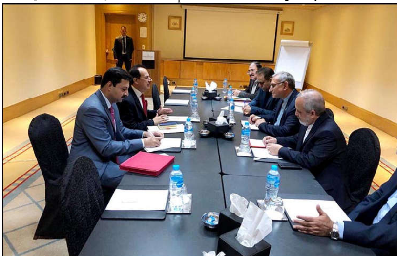
CAIRO: Federal Minister for National Health Services, Regulations and Coordination Dr. Nadeem Jan met Minister of Health Iran Dr. Bahram Eynollahi on the sidelines of 70th Session of the WHO's Regional Committee for Eastern Mediterranean.

The decision to ask illegal immigrants to leave is closely tied to the escalating violence in the country, particularly in Khyber Pakhtunkhwa and Balochistan provinces, and the growing tension between the Pakistani government and the Taliban administration in Kabul, according to experts and officials.