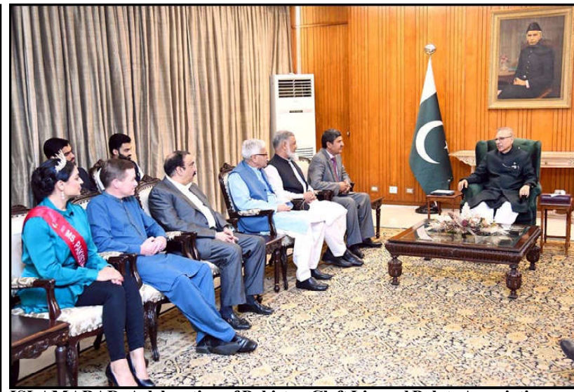
ISLAMABAD: A delegation of Pakistan Cleft Lip and Palate Association and British Plastic Surgery Team, called on President Dr. Arif Alvi, at Aiwan-e-Sadr.