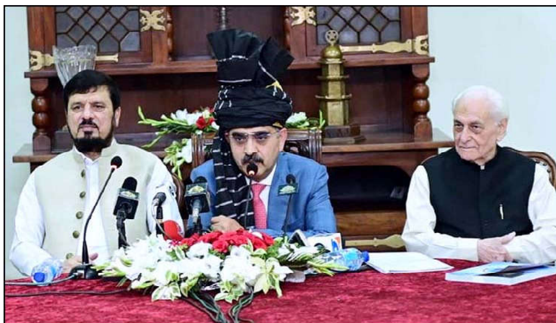
PESHAWAR: Caretaker Prime Minister Anwaar-ul-Haq Kakar talking with mediemen and delegation of Sarhad Chamber of Commerce and Industry.

He said as the illegal residents had no registration in Pakistan's database, the state was unable to distinguish between those playing a productive role in the society and the criminals.