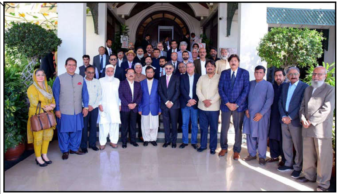
ISLAMABAD: Caretaker Prime Minister Anwaar-ul-Haq Kakar in a group photo with CPNE delegation.

Asian states, adding "I am trying my best to take such measures during the short period by which we can use out trade's capacity." Speaking about his upcoming visit to China, PM Kakar informed that Pakistan-China strategic relations, bilateral trade, China Pakistan Economic Corridor (CPEC) and tourism promotion would be discussed during the visit. Similarly, he said plans to take full advantage of the potential of tourism in Gilgit-Baltistan would also be part of the discussions.