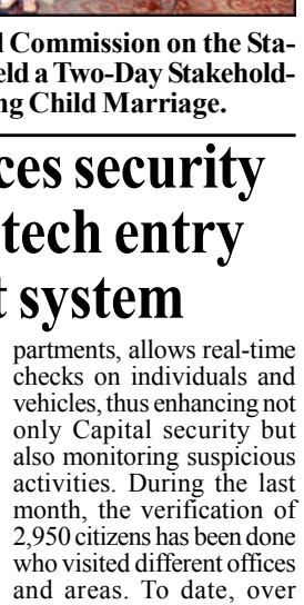
ISLAMABAD: National Commission on the Status of Women (NCSW) held a Two-Day Stakeholders' Conference on Ending Child Marriage.

partments, allows real-time checks on individuals and vehicles, thus enhancing not only Capital security but also monitoring suspicious activities. During the last month, the verification of 2,950 citizens has been done who visited different offices and areas. To date, over 85,861 individuals have been verified through this system. Additionally, this modern system identified 147 suspicious individuals, who were shifted to relevant police stations for legal action. ICCPO Dr. Akbar Nasir Khan emphasized that ensuring security for all governmental institutions, diplomatic missions, offices, and residential areas within the High-Security Zone and city remains a top priority.