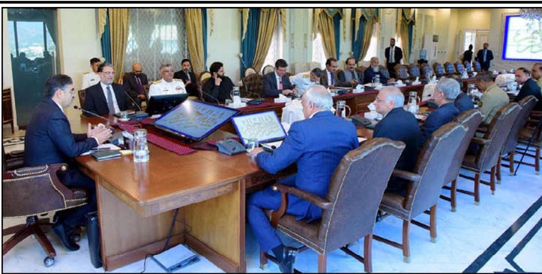
Caretaker Prime Minister Anwaar-ul-Haq Kakar chairs a meeting of the policy board on development of shipbuilding in Pakistan, in Islamabad.