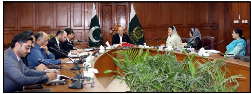
Hon'ble Mr. Justice Syed Mansoor Ali Shah, Judge Supreme Court of Pakistan, Chairman of the Arbitration Law Review Committee convening the third meeting of the Committee today at the Supreme Court of Pakistan, Islamabad.