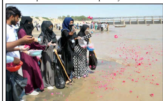
HYDERABAD: Participants are showering rose petals in Indus River on the eve of World Food Day organized by Food and Agriculture Organization of the United Nations held in Hyderabad.