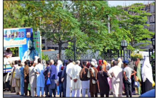
ISLAMABAD: Deserving people stand in long queue to take free food from van during launch time outside Pakistan Institute of Medical Science in Federal Capital.