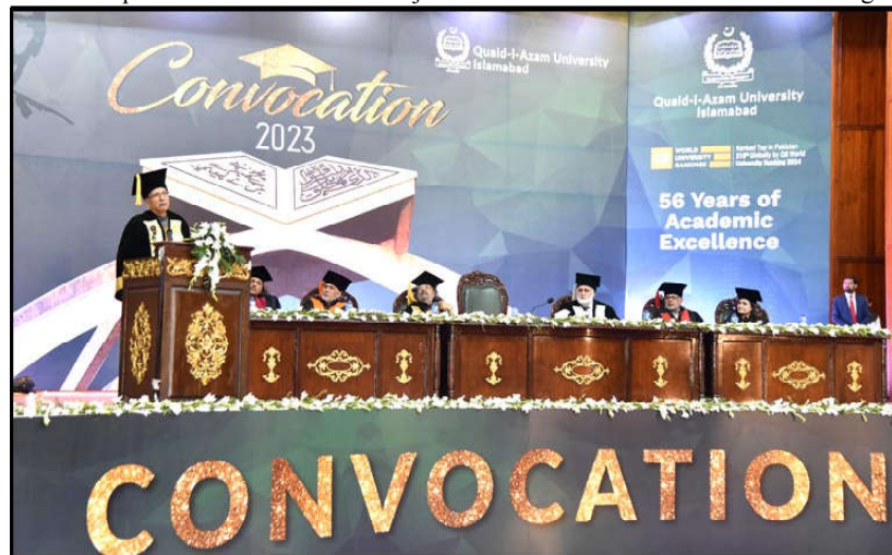
ISLAMABAD: President Dr. Arif Alvi addressing convocation ceremony of Quaid-e-Azam University