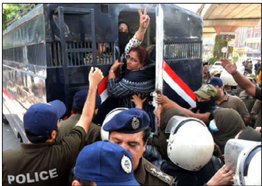
LAHORE: Police officials restore baton charge and arrest protesters during protest demonstration of Punjab Teachers Union against the ongoing privatization of government schools, amendments to pension regulations and the issue of leave encashment, outside Civil Secretariat in Lahore.

said and maintained that the government was bound to give two uniforms to the policemen every year. From now on, every jawan and senior police officer would be given two uniforms besides the provision of additional funds, he said. Punjab Highway Patrol police had been given the responsibility of checking the axle load. If the police performed this responsibility in a befitting manner, it would take a lead to Punjab police and traffic police, he remarked.