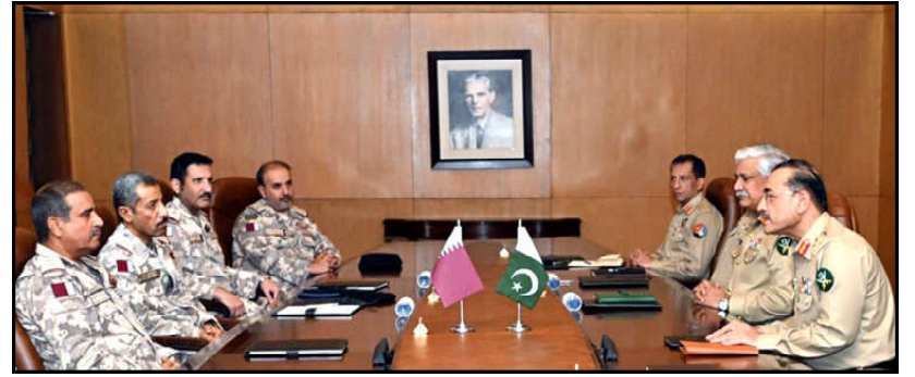
Chief of Qatar Armed Forces Lieutenant General Salem Hamad Eqail Al-Nabet meeting with Army Chief General Syed Asim Munir in Rawalpindi.