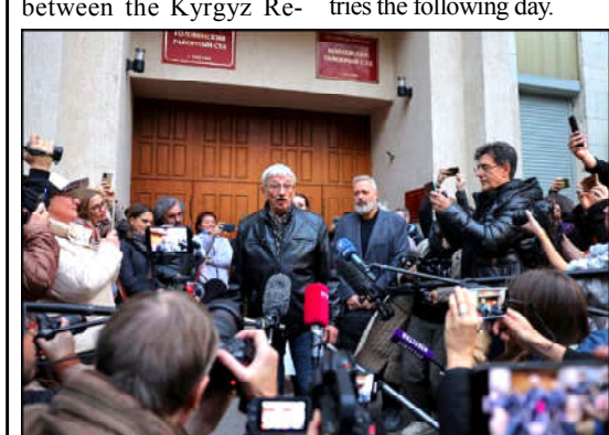
Russian veteran human rights campaigner Oleg Orlov talks to the media after a court hearing in which he was found guilty of discrediting Russia's armed forces, in Moscow, Russia.

Monitoring Desk BISHKEK: Kyrgyz-zstan's parliament on Wednesday ratified an agreement for a common air defence system with Russia, a day before a planned visit by Russian President Vladimir Putin to the Central Asian country. The agreement provides that a land plot of 12 acres at the Kant Russian military base in Kyrgyzstan will be used for the joint programme. "Lawmakers examined and adopted the bill on the ratification of the agreement between the Kyrgyz Re-