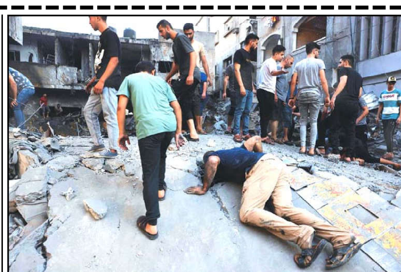
GAZA CITY: Palestinians look for survivors under the rubble of a building following an Israeli air strike as bombing of the besieged enclave continued for the fifth consecutive day.

Monitoring Desk WASHINGTON: US President Joe Biden on Wednesday issued a stark warning to Iran to "be careful" around its actions in the region following Hamas' attack on Israel. During a roundtable with Jewish community leaders on the administration's efforts to provide support for Israel, Biden stressed the assistance that the US is providing, adding that he's been frequently speaking to Israeli Prime Minister Benjamin Netanyahu. The US is "surging additional military assistance to the Israeli Defense Force including ammunition, interceptors to replenish the Iron Dome, we moved the US carrier fleet to the eastern Mediterranean and are sending more fighter jets there, to that region, and made it clear, made it clear to the Iranians - be careful," Biden said. Meanwhile, Iran's President Ebrahim Raisi and Saudi Arabia's Crown Prince Mohammed Bin Salman held their first phone call since both countries renewed diplomatic ties, an Iranian presidential aide said Wednesday. During the call, both leaders discussed the Israeli-Palestinian conflict, "the need to end war crimes," as well as Islamic unity, Raisi's deputy for political affairs,